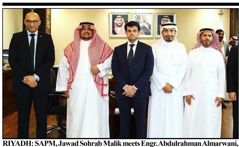
Deputy Governor, Technical and Vocational Training Corporation (TVTC) in Ŝaudi Arabia.