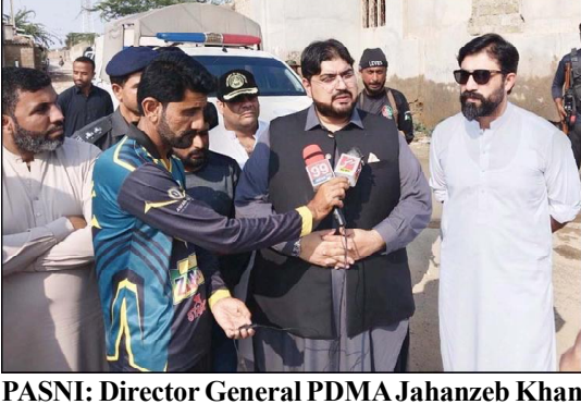
talking with mediamen.

The former allies, PPP and PML-N, have also been intensifying their verbal showdown.