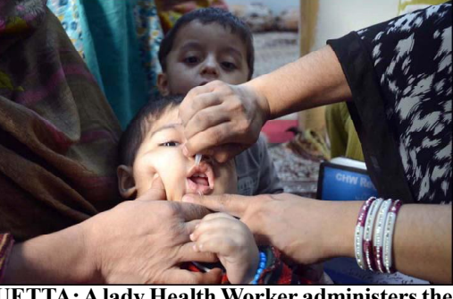
QUETTA: A lady Health Worker administers the polio vaccine to a child the campaign launched in Ouetta, Balochistan.

Despite its minimal contribution to global emissions, Pakistan stands at the forefront of experiencing the harsh realities of a warming planet. At the heart of Pakistan's response is the National Adaptation Plan (NAP) 2023, a comprehensive framework aimed at fostering resilience and sustainability