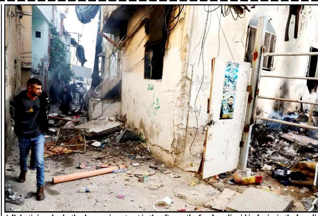
A Palestinian checks the damage in a street in the aftermath of an Israeli raid in Jenin, in the Israelioccupied West Bank,

The rally followed an online petition presented to lawmakers on Friday with 286,719 signatures—said to be the most of any parliamentary e-petition—urging Prime Minister Justin Trudeau to press for a permanent ceasefire