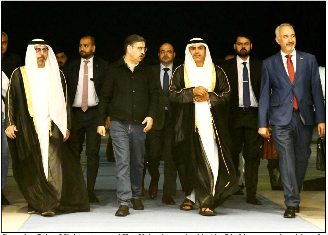
Caretaker Prime Minister Anwar ul Haq Kakar has arrived in Abu Dhabi on a two-day visit to the United Arab Emirates.

Ph: 2841470/2841473 Vol: XVI No. 178, Jamadi-ul-Awwal 12,1445 AH Monday November 27, 2023, Pages 08, Price Rs.15