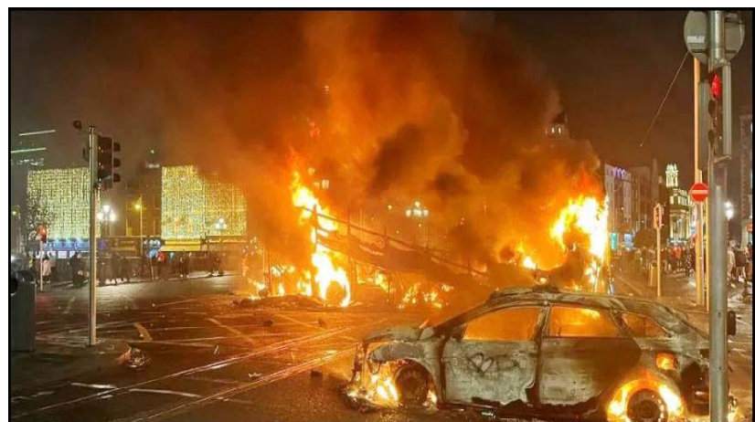
Flames rise from the car and a bus, set alight at the junction of Bachelors Walk and the O'Connell Bridge, in Dublin