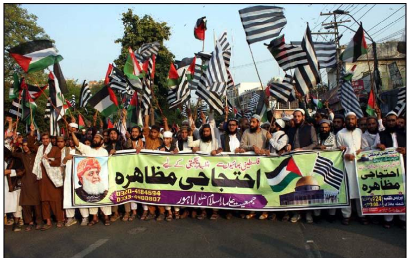
LAHORE: Activists of Jamiat Ulema-e-Islam (JUI-F) are holding protest demonstration against Israeli cruel and inhumane acts and express unity with the innocent people of Palestine, at Lahore press club

He termed Imam Kaaba's visit to Pakistan as a blessing and thanked him for his arrival and requested him to offer a special prayer for the unity of Muslim Ummah and the removal of divisions among them. On this occasion, Imam-e-Kaaba expressed that the main cause of problems and difficulties being faced by the Muslim Ummah.