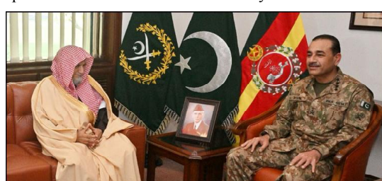
RAWALPINDI: His Excellency Sheikh Saleh bin Abdullah bin Muhammad Humaid, Imam-e-Kaaba called on General Syed Asim Munir, Chief of Army Staff (COAS) at General Headquarters, in City.