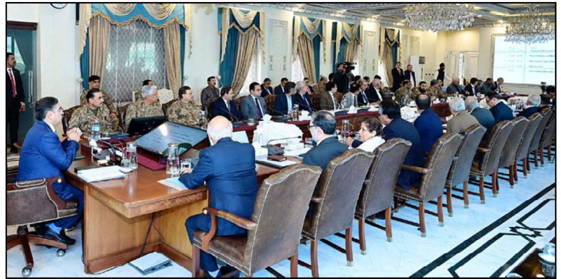
ISLAMABAD: Caretaker Prime Minister Anwaar-ul-Haq Kakar chairing a special session of the Apex Committee of SIFC held to foster strategic partnerships with friendly countries.

ment of Pakistan. Meanwhile Pakistan and Kuwait will sign seven Memorandums of Understanding (MoUs) for investment worth $10 billion in Pakistan through seven projects in multiple fields including environment, mining and food security. In this regard, the federal cabinet, in its meeting held on Friday approved seven MoUs to be signed during the upcoming visit of Caretaker Prime Minister Anwaar-ul-Haq Kakar to Kuwait. Consequent to the efforts by the Special Investment Facilitation Council