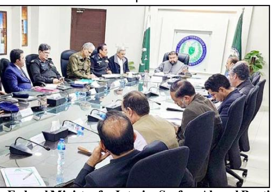
ISLAMABAD: Caretaker Federal Minister for Interior Sarfraz Ahmed Bugti chairing National Action Plan Coordination Committee Meeting.

ISLAMABAD (APP): Caretaker Foreign Minister Jilil Abbas Jilani informed the Senate on Friday that Pakistan had actively engaged in ending the Gaza crisis and resolution of the Palestine issue. Responding to a notice raised by Senator Mushtaq Ahmed the siege of land, sea, and air routes of Gaza by the Israeli occupying forces and the killing of innocent Palestinians by dropping phosphorus bombs on residential units, hospitals, schools, refugee camps, and mosques which is worst form of terrorism and violation of International Law and Human Rights, the minister said, "Pakistan has been actively involved in the resolution of Palestine issue for several years, particularly in the last month and a half." Highlighting Pakistan's contributions, he said, "Pakistan, along with Saudi Arabia, co-sponsored the OIC extraordinary session of foreign ministers held last month in Jeddah, and the extraordinary session of OIC was also held in Jeddah due to efforts of Pakistan." Condemning Israel for war crimes in Gaza, he urged, "Israel must be held responsible for these actions, and we call upon the international community to focus on the Palestine issue and play a decisive role in ending the crisis."