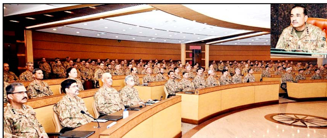
RAWALPINDI: Chief of Army Staff General Syed Asim Munir addressing 82nd Formation Commanders Conference

However, polio virus has been found in the environmental samples, sewerage water in five districts of the province including Pishin, Quetta, Hub, Chaman and Dera Bugti.