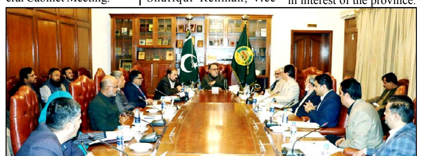
QUETTA: Governor Balochistan Malik Abdul Wali Khan Kakar presiding over a review meeting regarding IT Initiative Digital Balochistan

Country's economic and peace and order situation will be reviewed in Federal Cabinet Meeting.