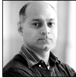
By Khurram Husain

The state, the economy and the people pull the resource envelope of the country in different directions. This is especially the case when periods of macroeconomic adjustments get going, meaning when an IMF programme is being implemented.