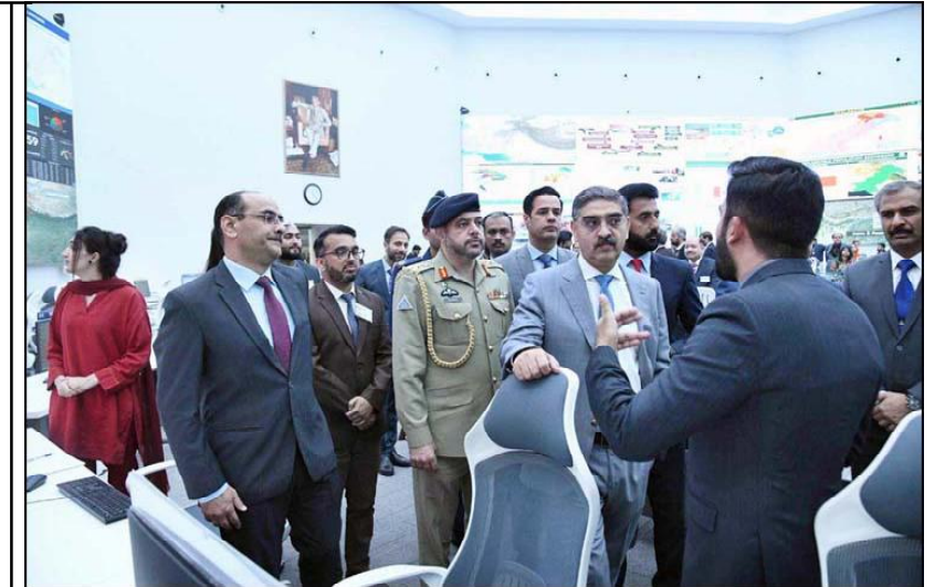
ISLAMABAD: Caretaker Prime Minister Anwaar-ul-Haq Kakar interacting with team members and officers during his visit to National Emergency Operation Centre.

Turkish Ambassador discussed the matters of mutual interests besides the brotherly relations between the two countries and political changes taking place in the region. The Governor appreciated the Turkish cooperation in the difficult time of floods and earthquakes in Pakistan saying that it (Turkish) has always helped the Pakistani people every time. He particularly thanked the Turkish president and Ambassador to Pakistan for relief and rehabilitation activities during disasters in Balochistan.