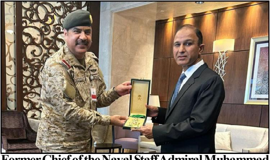
Former Chief of the Naval Staff Admiral Muhammad Amjad Khan Niazi receiving King Abdul Aziz Medal from Commander Western Region of Saudi Armed Forces in Makkah, Saudi Arabia