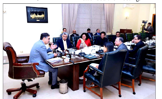
ISLAMABAD: A delegation of All Pakistan Newspapers Society calls on the Caretaker Prime Minister Anwaar-ul-Haq Kakar

Caretaker Information and Broadcasting Minister Murtaza Solangi, Federal Information Secretary and relevant senior officers also attended the meeting.