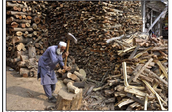
ISLAMABAD: Old man cutting wood into pieces for selling purpose at his workplace.

Therefore, to help grow the country's economy, "we must incentivise broadband fiber connectivity in the country."