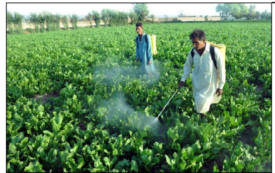
HYDERABAD: Farmers are spraying pesticides over crop at an agricultural field in Hyderabad.