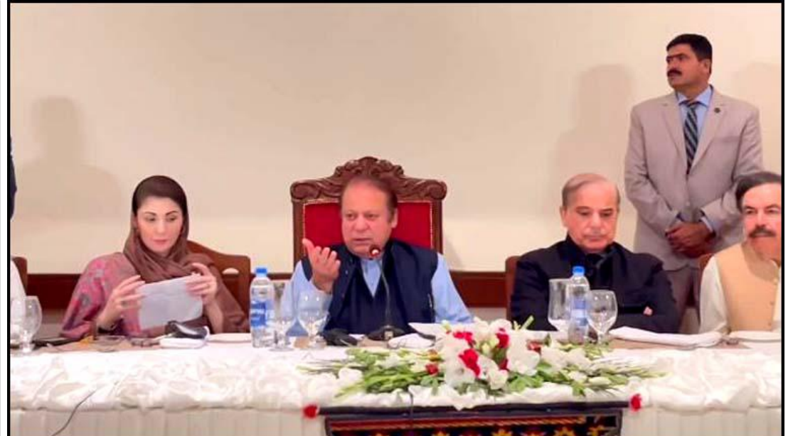
PML-N supremo Nawaz Sharif addressing party workers in Quetta. Former PM Shehbaz Sharif and Maryam Nawaz are also present on the occasion.