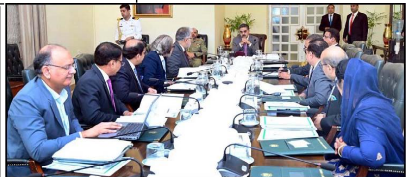
ISLAMABAD: Caretaker Prime Minister Anwaar-ul-Haq Kakar chairing a meeting regarding the Higher Education Commission of Pakistan.

including the Prime Minister, had been duly submitted to the commission by Section 230(3) of the Election Act 2017. According to regulations, once the Commission green lights the publication of statements under Section 230(3) and Election Rules 170(3) in the Official Gazette.