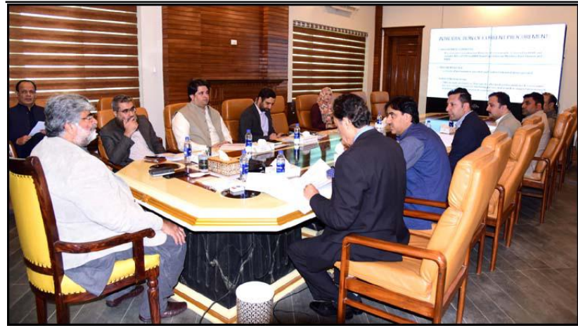
QUETTA: Balochistan Caretaker Chief Minister Mir Ali Mardan Khan Domki presiding over a high level meeting of Health Department