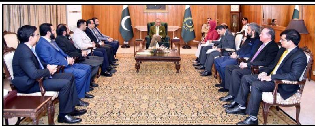
ISLAMABAD: A delegation of honorary consuls of different friendly countries based in Peshawar call on President Dr Arif Alvi, at Aiwan-e-Sadr.

The QESCO's campaign would remain continued without any interruption in future too, the spokesman vowed.