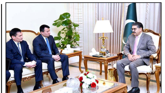
ISLAMABAD: Deputy Prime Minister of Uzbekistan, H.E. Dr. Jamshid Khodjaev Abdulkhakomovich calls on the Caretaker Prime Minister Anwaar-ul-Haq Kakar.

ISLAMABAD (Online): Islamabad High Court (IHC) has stayed the hearing of Cipher case against PTI chairman in jail. Justice Miangul Hassan Aurangzeb while giving remarks on intra court appeal of Imran Khan against jail trial in cipher case said the way indictment was framed in cipher case it cannot be described as open court proceedings. In Indra Gandhi case trial was conducted in Tihar jail when decision was challenged on this basis then court was told media was also allowed to go therein. There was too a case of former Prime Minister (PM) and here too is case of former PM. He gave these remarks while presiding over a two members bench of IHC during the hearing of intra court appeal by chairman PTI against jail trial in cipher case. The court remarked allowing some members of family to go to court in connection with hearing does not mean open court.