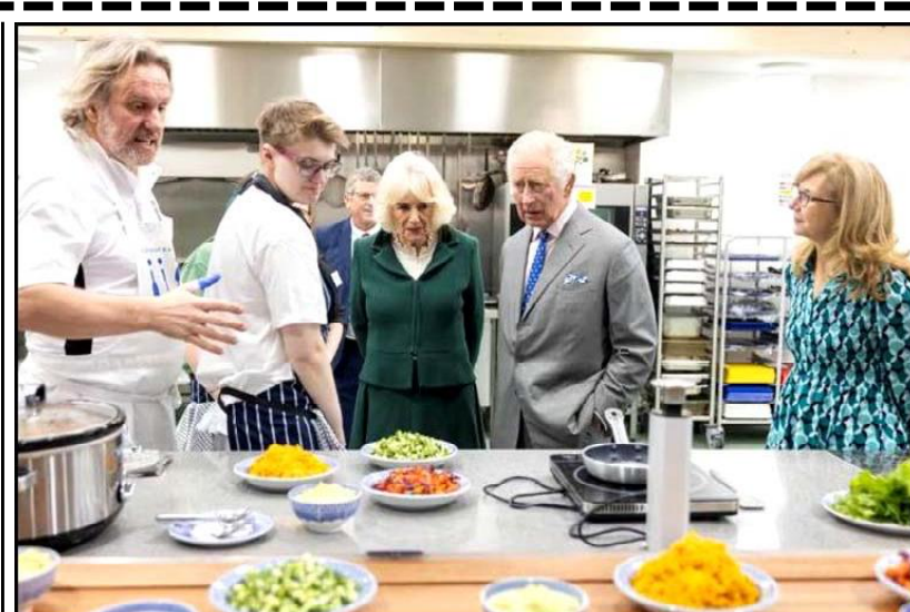
Britain's King Charles and Queen Camilla visit FareShare Didcot to launch the Coronation Food Project on his birthday, in Didcot, Britain.

Jokowi pressed Biden on steps to end Israel's war with Hamas. "Indonesia appeals to the U.S. to do more to stop the atrocities in Gaza. Ceasefire is a must for the sake of humanity," Widodo said in the Oval Office at the start of talks with the U.S. president.