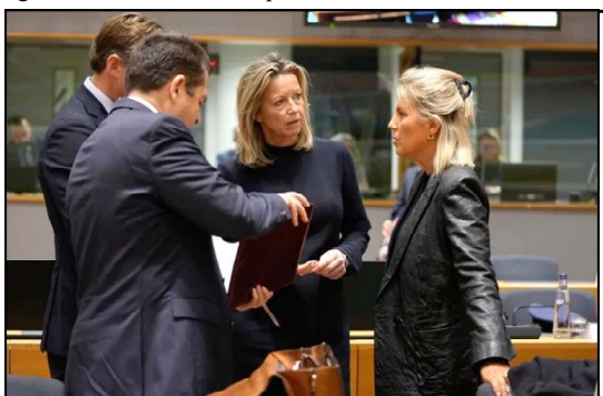
Belgium's Defense Minister Ludivine Dedonder, right, speaks with Netherlands' Defense Minister Kaja Ollongren, second right, during a meeting of EU foreign and defense ministers at the European Council building in Brussels.

The port city of Mombasa and the north-eastern counties of Mandera and Wajir are the worst affected.