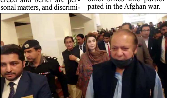
QUETTA: Muslim League (PML-N) Chief, Nawaz Sharif reached Quetta on 2-day visit as part of his party policy to form strategic alliances in all provinces ahead of the Feb 8 general elections. PML-N Chief Organizer, Maryam Nawaz is also present.