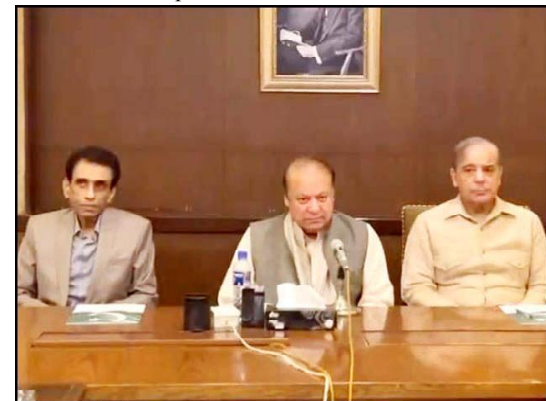
Pakistan Muslim League-Nawaz (PML-N) supreme Nawaz Sharif, party president Shehbaz Sharif and Muttahida Qaumi Movement-Pakistan (MQM-P) convener Khalid Maqbool Siddiqui during a meeting.

After receiving the information about the incident, a heavy contingent of police rushed to the site and started a search operation in the area.