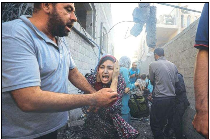
A girl covers her ears during Israeli air strikes on the al-Maghazi refugee camp, Gaza Strip.

Monitoring Desk UNITED NATIONS: The "unprecedented" conflict between Sudan's army and rival paramilitary force now in its seventh month is getting closer to South Sudan and the disputed Abyei region, the UN special envoy for the Horn of Africa warned Monday. Hanna Serwaa Tetteh pointed to the paramilitary Rapid Support Force's recent seizures of the airport and oil field in Belia, about 55 kilometers (34 miles) southwest of the capital of Sudan's West Kordofan State. She told the UN Security Council that the conflict "is profoundly affecting bilateral relations between Sudan and South Sudan, with significant humanitarian, security, economic and political consequences that are a matter of deep concern among the South Sudanese political leadership." Sudan was plunged into chaos in mid-April when simmering tensions between the military and the RSF exploded into open warfare in the capital, Khartoum, and other areas across the East African nation. More than 9,000 people have been killed, according to the Armed Conflict Location & Event Data project, which tracks Sudan's war. And the fighting has driven over 4.5 million people to flee their homes to other places inside Sudan and more than 1.2 million to seek refuge in neighboring countries, the UN says.