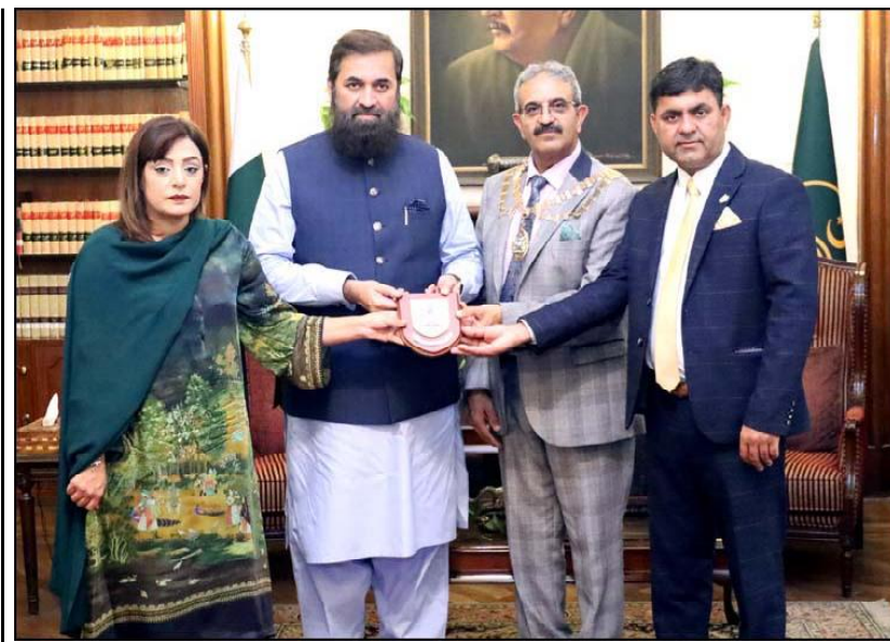
LAHORE: A delegation of overseas Pakistanis from Britain under the leadership of London Borough of Hounslow Mayor Afzal Kayani meeting with Governor Punjab Muhammad Balighur Rehman at Governor's House.

shut factories. He maintained that Lahore badly needs environmental rest, prevention from smog is imperative as it is not a good phenomenon. The children and elderly people are facing asthma and eye diseases, he noted and added that decisions have been taken in the light of experts' recommendations during a meeting of the cabinet committee for environment/smog. The smog-related meeting has decided a public holiday on November 10.