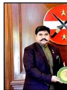
Lieutenant General Asif Ghafoor lauded the Red Crescent's unwavering dedication and support in the affected regions.

QUETTA: Chairman Pakistan Red Crescent Society, Sardar Shahid Ahmed Laghari, held a significant meeting with Corps Commander Quetta Lieutenant General Asif Ghafoor. The discussions centered around acknowledging the commendable services of the Red Crescent during the recent floods in Balochistan.