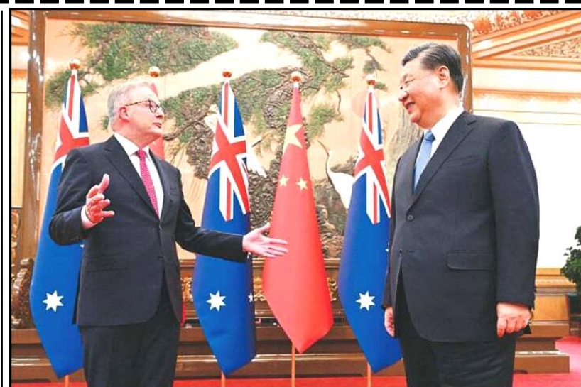
Australian Prime Minister Anthony Albanese meets Chinese President Xi Jinping at the Great Hall of the People, in Beijing.