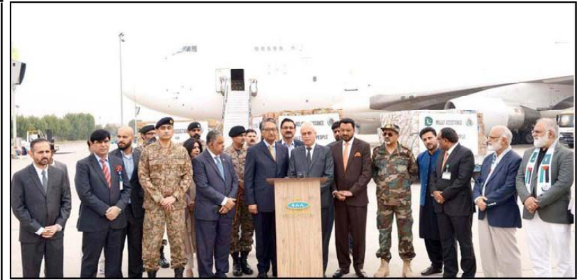
ISLAMABAD: NDMA dispatches humanitarian relief assistance to war ravaged Gaza, Palestine. Caretaker Federal Minister for Foreign Affairs, Jalil Abbas Jilani and Caretaker Federal Minister for Human Rights, Khalil George sent off second tranche to Gaza via Egypt from Islamabad International Airport.

said that the committee has been formed as per section 17 (2) of the Rules of Business 1973. According to this sub-section, Committees of the Cabinet may be constituted, and their terms of reference and membership laid down by the Cabinet or the Prime Minister. Such Committees may be standing or special committees; accordingly, as they are appointed to deal with a class of cases or a specific case. He said that the CCLC's purpose did not involve making the bills or primary legislation. Instead, it was established for subsidiary rule-making and the facilitation of extreme and emergency.