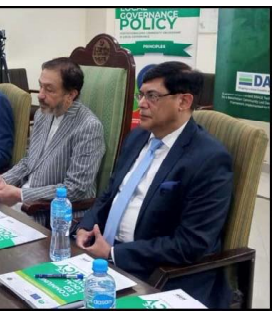
and Education Department participated in the training workshop. Expressing his views from the workshop, the caretaker provincial