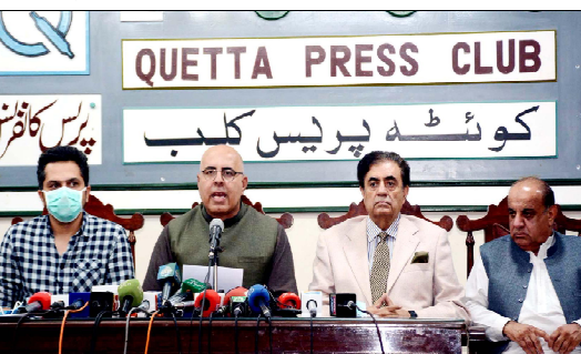
QUETTA: Caretaker Information Minister Jan Achakzai and Health Minister Ameer Muhammad Jomezai addressing a press conference