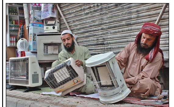
QUETTA: Man repairs gas heater at main Quetta bazaar.

He said that the law has been introduced in Punjab under which 150 mediation centers have been established while 12,000 advocates have been nominated as mediators.