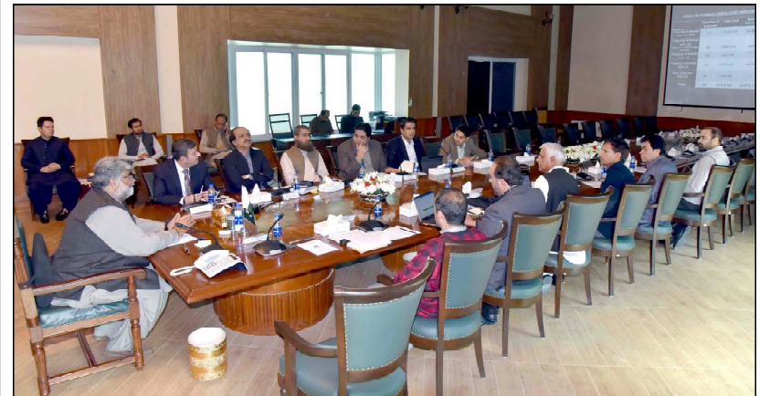
QUETTA: Caretaker Chief Minister Balochistan Mir Ali Mardan Khan Domki being briefed about progress on Quetta Development Package

He informed that the pace of work has been expedited on the Quetta Package on special directives of the caretaker Chief Minister, Mir Ali Mardan Domki.