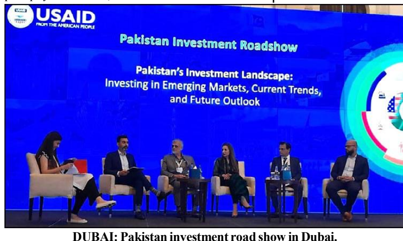
DUBAI: Pakistan investment road show in Dubai.

However, according to the Forex Association of Pakistan (FAP), the buying and selling rates of the Dollar in the open market stood at Rs 286 and Rs 288.5 respectively.