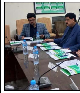
of Local Government.

The implementation of this policy will bring a new era of development in the province. He expressed