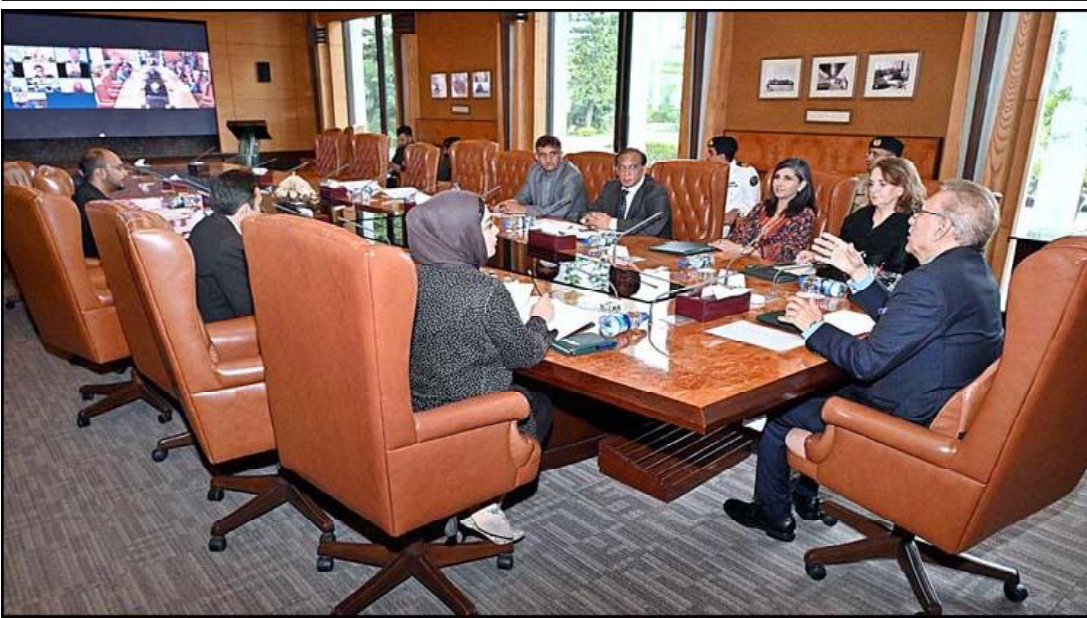
ISLAMABAD: President Dr. Arif Alvi chairing a follow-up meeting on mental health issues in Pakistan, at Aiwan-e-Sadr.