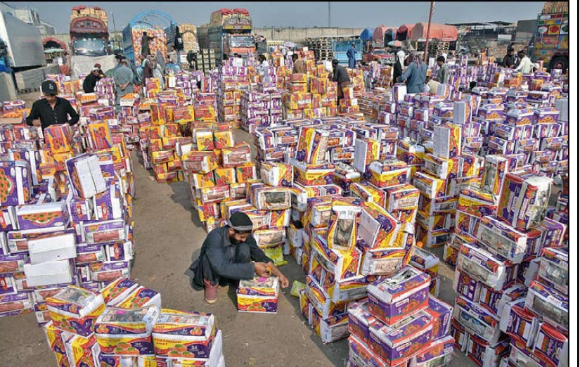
ISLAMABAD: Vendors displaying fruits to attract the customers at Fruit and Vegetable Market in Federal Capital.

The Japanese Yen lost 02 paisa to close at Rs 1.91; whereas a decrease of