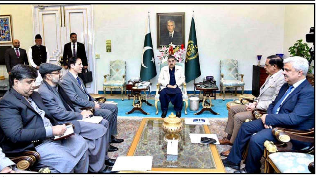
ISLAMABAD: Caretaker Prime Minister Anwaar-ul-Haq Kakar chairs a meeting on power sector reforms in KP and welfare of families of martyrs of war on terror.