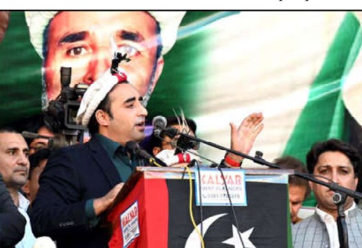
CHITRAL: Peoples Party (PPP) Chairman, Bilawal Bhutto Zardari addresses to his workers during Workers Convention held in Chitral.

knew about a Punjab based political party that plunged the country into a price hike affecting the lives of the common man.