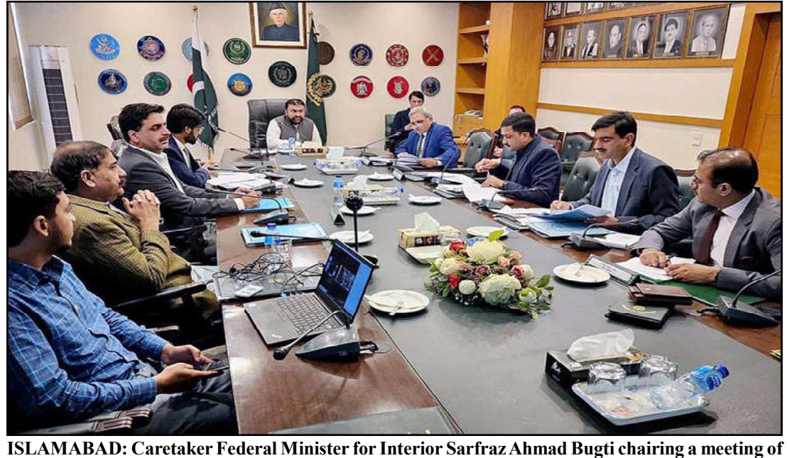
the Cabinet Sub-Committee on ECL.