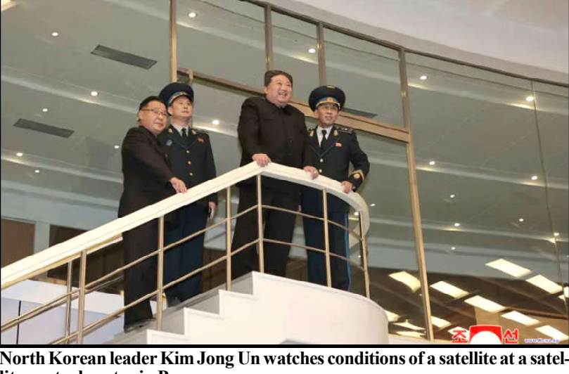
lite control center in Pyongyang.

dents to leave. "Egypt has clearly declared its utter rejection