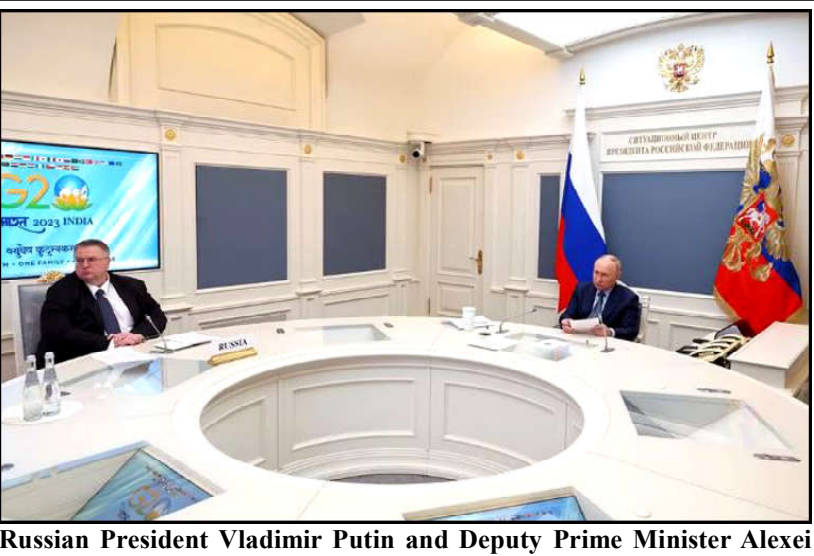
Overchuk attend the G20 virtual summit via a video link in Moscow, Russia.