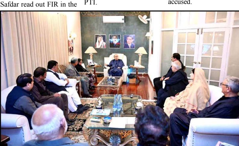
ISLAMABAD: Peoples Party (PPP) President, Asif Ali Zardari exchanging views with a PPP delegation from Punjab during meeting held in Islamabad.