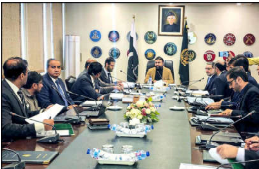
ISLAMABAD: Caretaker Federal Minister for Interior Sarfraz Ahmed Bugti chairing a meeting of ministerial committee on enforced disappearances.

Earlier, senators had drawn attention to the sit-in issue at Chaman by local residents and businessmen, expressing concerns about its potential adverse impact on the livelihoods of nearly 40,000 people who rely on daily border crossings.