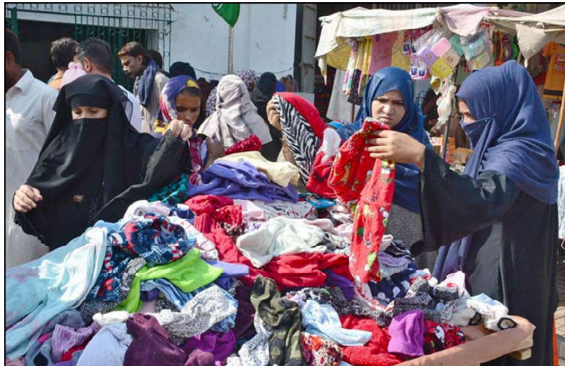
HYDERABAD: Women busy in selecting and purchasing old warm clothes from vendor at Cloth Market.

However, the price of gold in the international market decreased by $2 to $1,999 from $2,001, the Association reported.