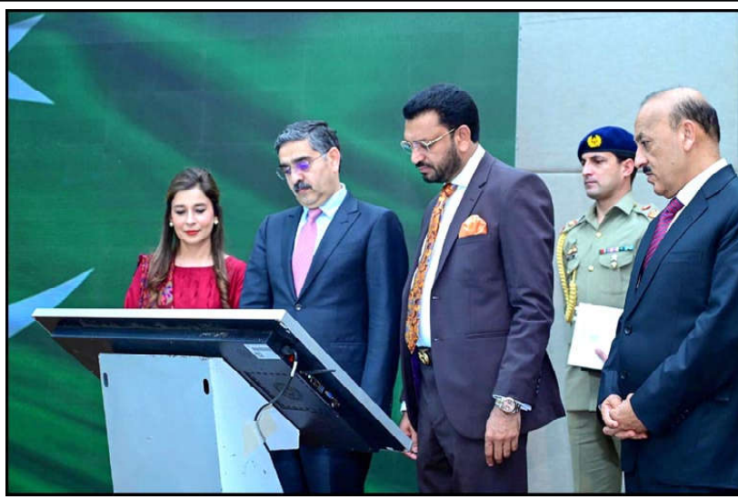
ISLAMABAD: The Caretaker Prime Minister Anwaar-ul-Haq Kakar launches ZARRA mobile app on the eve of Universal Children's Day

He said SJC sent notice of further proceedings without fixing the objections and SJC's October 27 press release is a violation of fundamental rights.