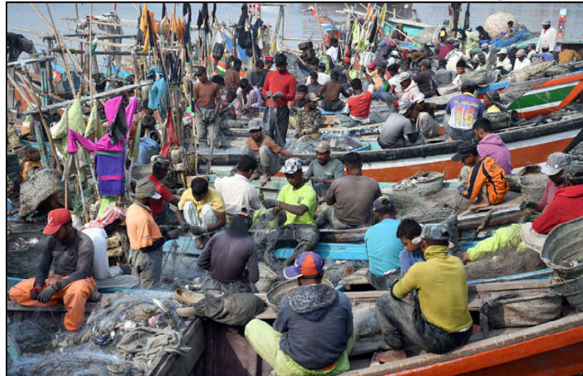
KARACHI: Pakistan fishermen unload their catch, along the bank of sea to supply across the country as to acknowledge the efforts of fishermen, there is day "World Fisheries Day", which commemorate annually on 21 November.

Meanwhile two more ships, MSC Rida and Al-Dayyen carrying Containers and LNG also arrived at outer anchorage of the port on Monday morning. A total of seven ships were engaged at PQA berths during the last 24 hours, out of them, three ships, MSC Jemima, Mineral Olympia and Sea Bulk left the port.