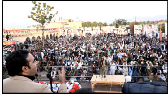
NAUSHERA: Chairman Pakistan People's Party Bilawal Bhutto Zardari addressing to workers convention in City.

He also said that during the tenure of the Pakistan Tehreek-e-Insaf government, the SBP had been granted more autonomy.