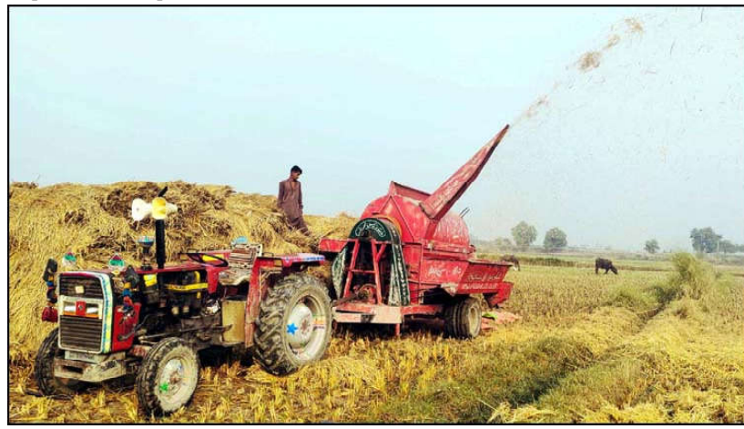
LARKANA: Peasants use thrasher to get paddy grains with help of heavy machinery to earn their livelihood to support their families, at an agricultural field located on Shahmir Khan Dahani village in Larkana.

"We are fully committed to working with the Pakistani side, and our joint efforts aim to accelerate the realization of the ML-I project," he added. The meeting concluded with both parties reaffirming their dedication to the successful implementation of the ML-I project, a symbol of the enduring friendship and strategic partnership between Pakistan and China.