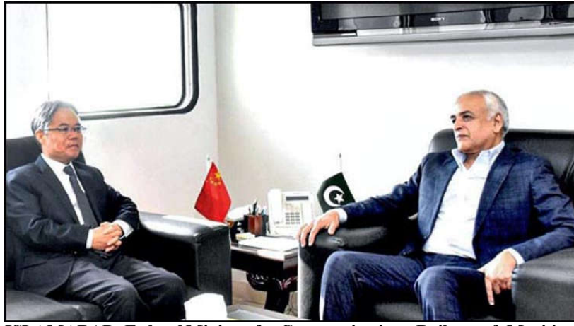
ISLAMABAD: Federal Minister for Communications, Railways & Maritime Affairs Mr. Shahid Ashraf Tarar hosting a meeting with Chinese Ambassador Mr. Jiang Zaidong at the Ministry.