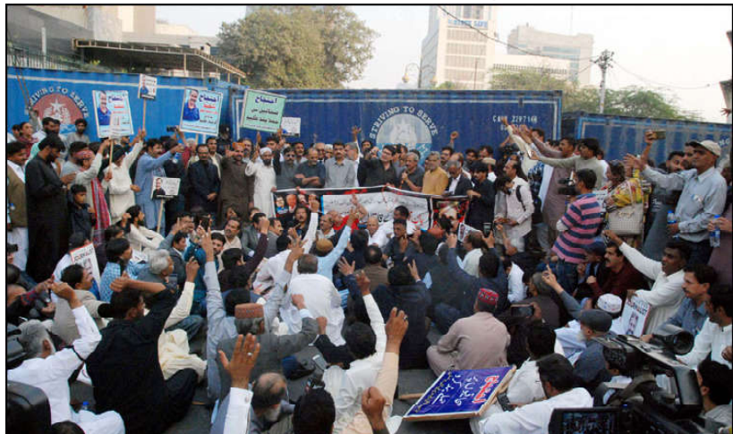
KARACHI: Activists of Pakistan Federal Union of Journalists holds protest rally in the favor of their demands from Governor House to CM House, in Provincial Capital.

serving as a pilot project. Plans are underway to set up telemedicine desks at various hospitals, including NICVD and SIUT. The recommendations of the SPPB will be forwarded to the government for final approval and execution. The minister underscored the importance of establishing District Oversight Committees and Welfare Committees to address several critical aspects, such as improving the lives of vulnerable prisoners, enhancing health and hygiene conditions, establishing dedicated spaces like Sweet Homes for children residing with their mothers in jails, setting up well-equipped libraries, and initiating vocational training programs.