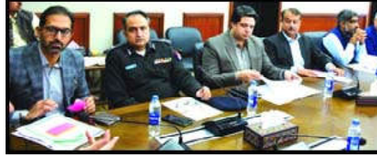
QUETTA: Balochistan Chief Secretary Shakeel Qadir Khan presiding over a meeting regarding implementation on decisions taken in Apex Committee presided by Prime Minister

"The international organizations have assured their all-out support to repair the damaged schools," he added.