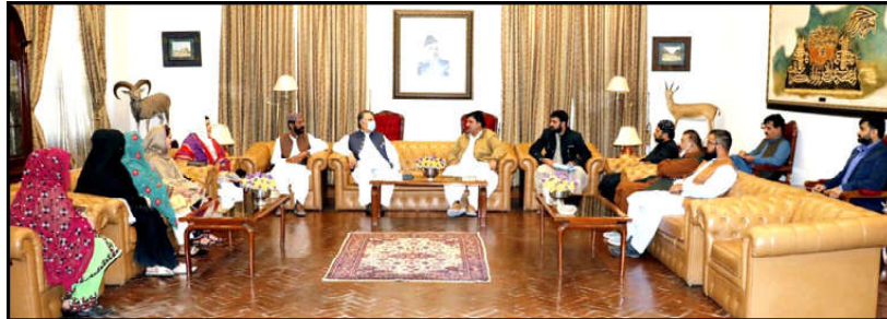
QUETTA: A delegation led by chief of Balochistan Youth Alliance Bahadur Khan Lango meeting with Governor Balochistan Malik Abdul Wali Khan Kakar