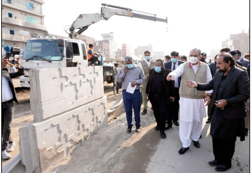
LAHORE: Chief Minister Punjab Mohsin Naqvi inspecting progress of "Band Road Controlled Access Corridor" Projects

projects and ideas, adding that this platform will foster new opportunities for them. He said that the young population is the demographic dividend of the country, and we should capitalise on it. He further said that Pakistani youth are very talented. Governor Punjab said that in 2013-18, the funding of research grants of universities was increased. The laptop scheme yielded good results. This reduced the digital divide and created E-employment opportunities for the youth. He said that Pakistani youth have made a name for themselves in gaming apps in the world.