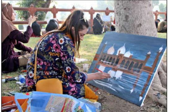
LAHORE: Artist giving final touches to the painting in Deewane Aam Painting Competition at Shahi Fort.