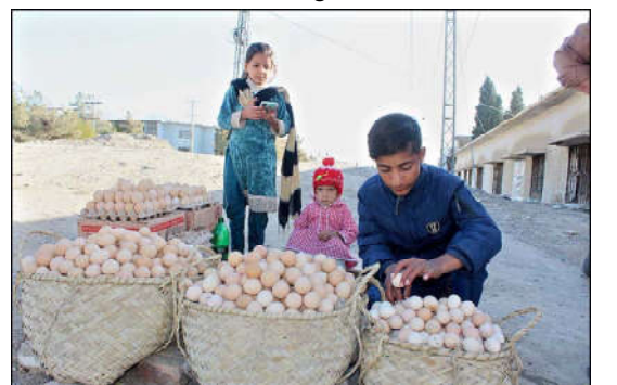
QUETTA: A school-going age boy selling eggs to support his family at a roadside near Koyla Patkha.

The scope and potential for using the latest technologies to facilitate cross-border trade is far greater than the costs; and, have been explored by international organizations, governments.