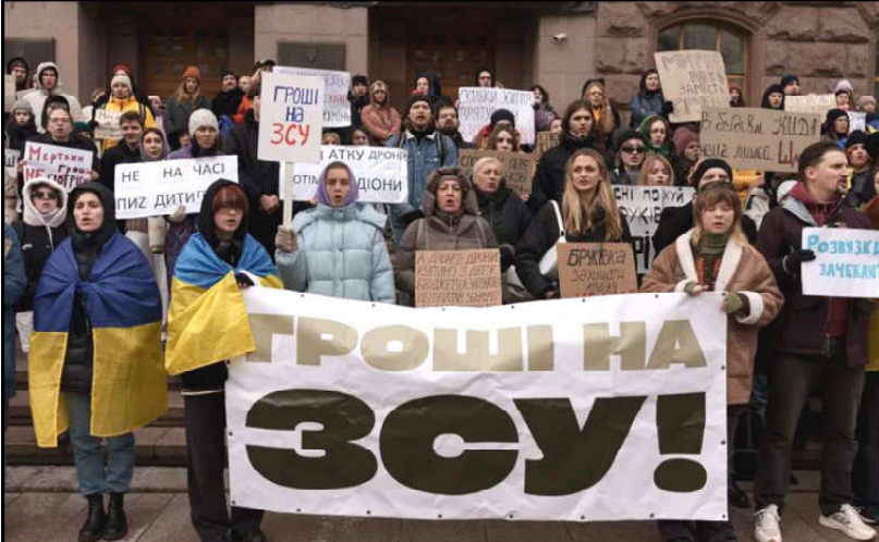
Ukrainians hold banners that read 'Money to the AFU', or Armed Forces of Ukraine, while attending a demonstration in central Kyiv, Ukraine.

Monitoring Desk SAN FRANCISCO: Elon Musk, the billionaire owner of Tesla, SpaceX and social platform X, came under fire from all sides this week after endorsing an anti-Semitic conspiracy theory and then — in an ostensible attempt at damage control —