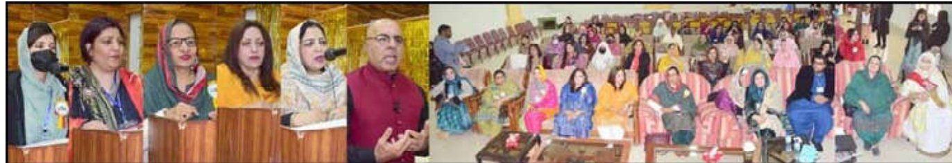
QUETTA: Caretaker Provincial Minister for Information Jan Achakzai and others addressing the ceremony of Emerging Women Award.

Meanwhile, as per the initial reports, the deceased were carrying the explosive material themselves when it went off. However, further investigations were in progress till ours going to the press.