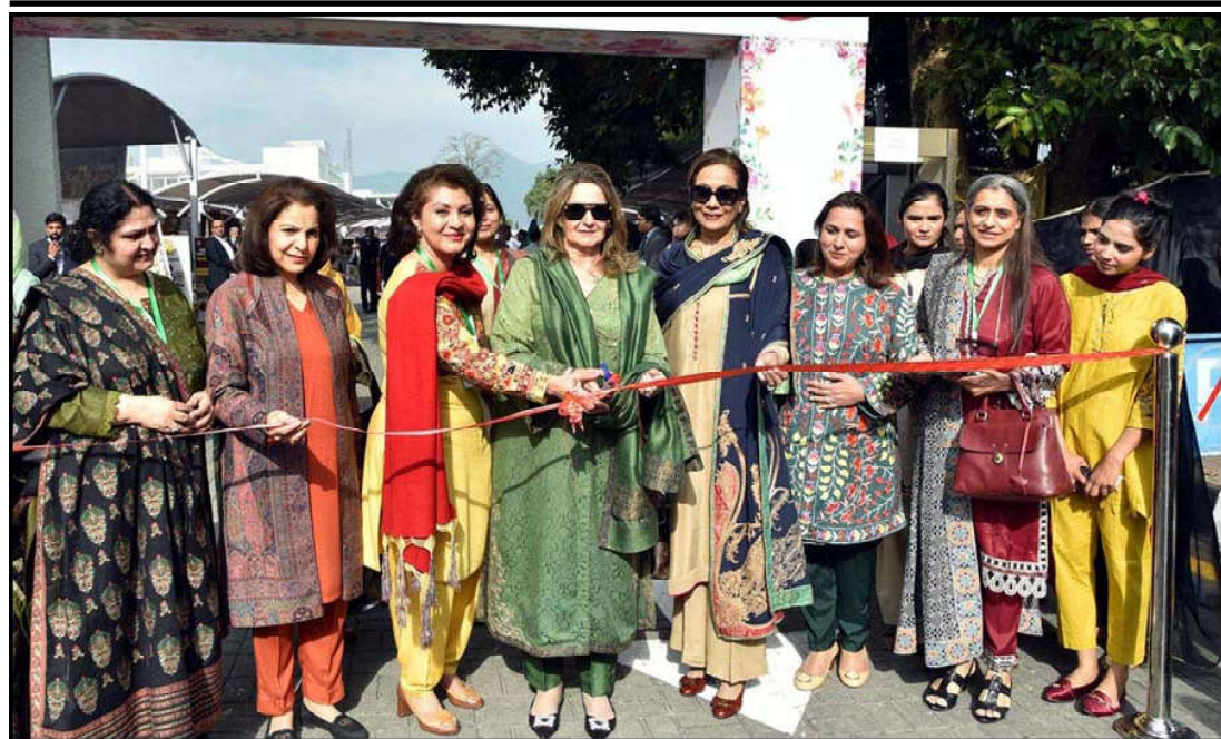
ISLAMABAD: First Lady Begum Samina Alvi inaugurating Pakistan Foreign Office Women's Association's Annual Charity Bazar, at the Ministry of Foreign Affairs.