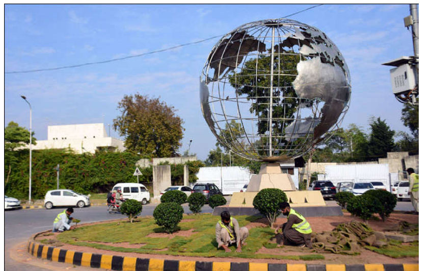
ISLAMABAD: Workers of Capital development Authority (CDA) is installing artificial green grass alongside Constitution Avenue in Federal Capital.

ISLAMABAD (APP): The two benches assigned by the Election Commission of Pakistan (ECP) are set to address representation filed in connection with delimitation of constituencies in thirteen districts on Monday and Tuesday. According to the timetable provided by the ECP spokesperson on Sunday, Bench No. 1 will handle objections pertaining to Mandi Bahauddin and Khanewal districts, while Bench No. 2 is designated for objections related to Kech and Gujrat districts. The proceedings of the ECP (Election Commission of Pakistan) Bench will commence with Bench No. 1 focusing on addressing objections pertaining to districts DG Khan and Sahiwal on Tuesday. Concurrently, Bench No. II will be dedicated to hearing representations concerning the delimitation of constituencies in districts Jhal Magsi, Jaffarabad, Nasirabad, Kachi, Sohbatpur, Usta Mohammad and Harnai on the same day.