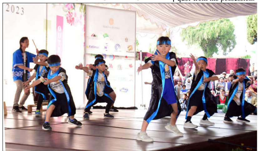
ISLAMABAD: Japanese children performing traditional dance during Pakistan foreign office Women's Association (PFOWA) annual Charity Bazaar 2023 at a local hotel in Federal Capital.