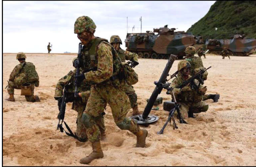
Japanese Ground Self-Defense Force's Amphibious Rapid Deployment Brigade (ARDB) soldiers take part in a marine landing drill as part of the country's nationwide 05JX military exercises at Tokunoshima island, Kagoshima prefecture, southwestern Japan

Monitoring Desk MANAMA: US President Joe Biden's main adviser on the Middle East said on Saturday there would be a "significant pause" in fighting if Hamas agrees to release prisoners.