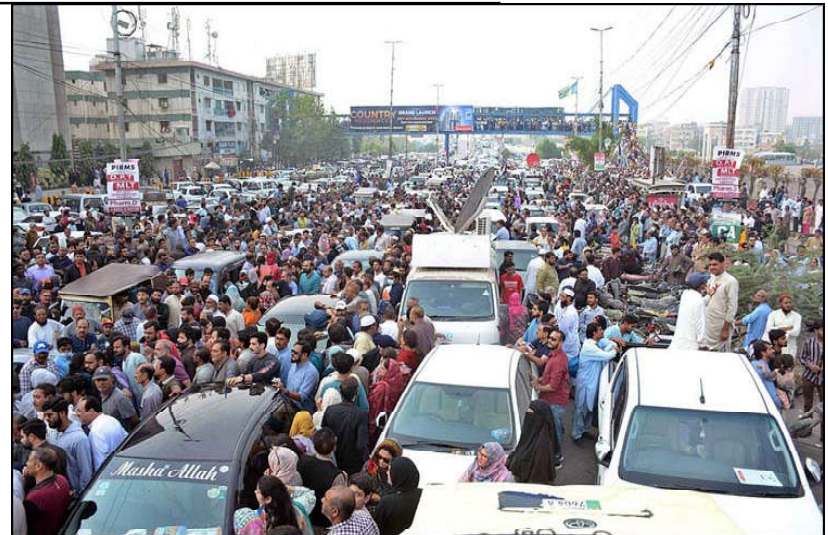
KARACHI: Parents of students waiting outside Expo Centre as the Medical and Dental College Admission Test (MDCAT) 2023-24 is being held.

RAWALPINDI (APP): The Dadocha Dam would help overcome water shortage in Rawalpindi as after construction of the dam, it would supply 35 million gallons of water per day to Rawalpindi city, said Commissioner Rawalpindi Division, Liaquat Ali Chhatta. He said that water scarcity has become a global problem and different countries are considering different ways to meet the shortage. Pakistan is also one of the countries suffering from a water crisis, the Commissioner said. Due to the non-construction of dams, per capita availability of water here has decreased four times during the last 50 years, Liaquat Ali Chhatta said. Due to the shortage of dams, millions of cusecs rainwater is wasted every year or causing floods, he added. The government of Punjab is giving priority to the problem of water scarcity and is paying special attention to the construction of small dams, he said and informed that the approved cost of the dam being built in Dadocha village near Rawat Industrial Estate was Rs 6492 million, which would now be estimated again. The Commissioner Rawalpindi Division Liaquat Ali Chhatta has said that construction work of Dadocha Dam would be resumed soon.