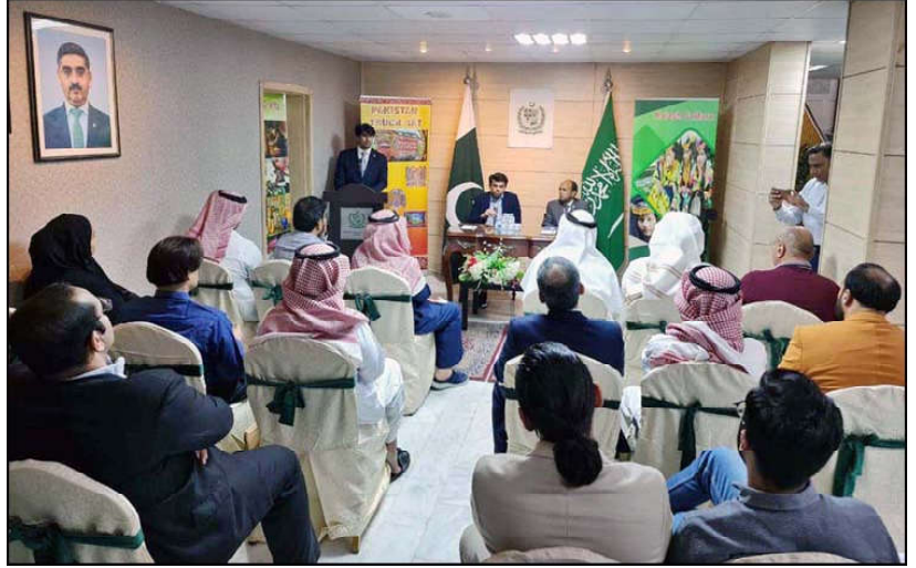
JEDDAH: Minister Overseas Pakistanis, Jawad Sohrab Malik meets with Pakistani Community, Saudi Employers and HRM Exec.