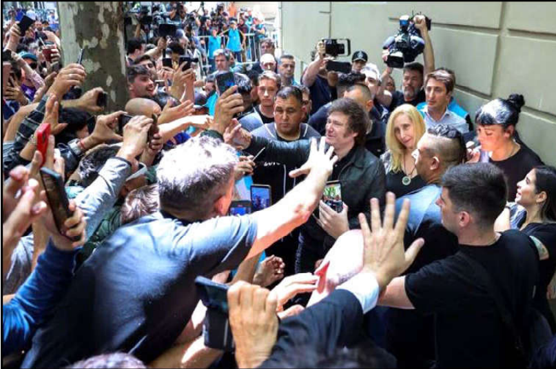
Argentine presidential candidate Javier Milei greets people on the day of the second round of Argentine presidential election, in Buenos Aires, Argentina.

The pause is also intended to allow a significant amount of humanitarian aid in, the newspaper reported, adding that the outline of the deal was put together during weeks of talks in Qatar. But both Israel's prime minister and US officials said no agreement had been hammered out yet, with a White House spokesman saying efforts were continuing to clinch a deal. The Post's report came as Israel appeared to be preparing to expand its offensive against Hamas militants to densely populated Gaza's southern half after air strikes killed dozens of Palestinians, including civilians reportedly sheltering at two schools.