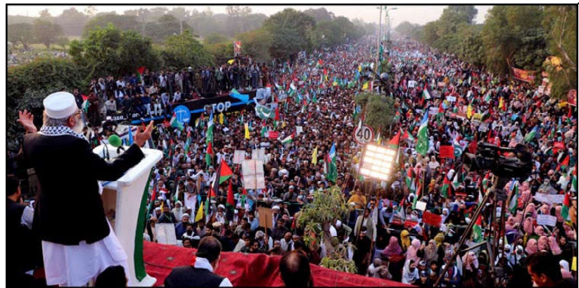
LAHORE: Ameer Jamaat-e-Islami Siraj-ul-Haq addressing the Gaza March in front of Punjab University.