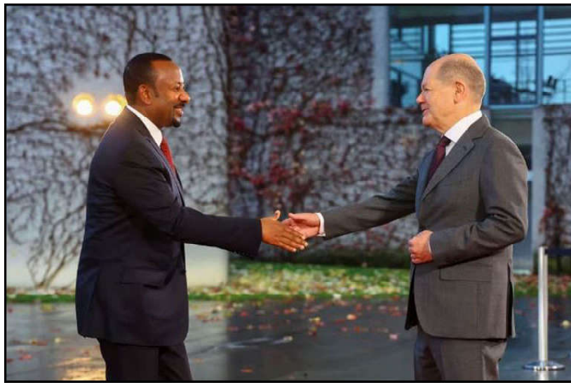
Ethiopia's Prime Minister Abiy Ahmed Ali is welcomed by German Chancellor Olaf Scholz before the "Compact with Africa" summit in Berlin, Germany.