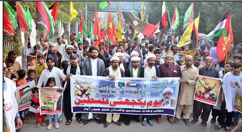
HYDERABAD: Workers of Majlis Wehdat-e-Muslimeen participating in a solidarity rally in support of Palestinians at SSP Office Road.