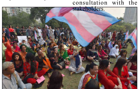
KARACHI: Member of the Trans community take part in Sindh Moorat March.

Independent Report PESHAWAR: A high level meeting chaired by Caretaker Chief Minister Khyber Pakhtunkhwa Syed Arshad Hussain Shah on Sunday decided to develop financial plans to make all public sector universities financially self-dependent. The meeting also decided to activate search committee for appointment of Vice Chancellors. The committee would submit its report within a week to the provincial minister. The CM emphasized to improve the administrative affairs and governance of the universities to solve the problems being faced by the universities. The chief minister asked to promote high standard of higher education based on the demand of market adding that priorities should also be given to quality of research work. He said the secondary and higher secondary education system should be aligned with the priorities of higher education institutions. For this purpose, the CM asked to hold consultation with the stakeholders.