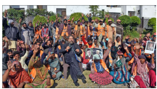
ISLAMABAD: Sanitary Workers are shouting slogans during protest outside Aabpara Police Station, for demanding their three months salary, in Federal Capital.