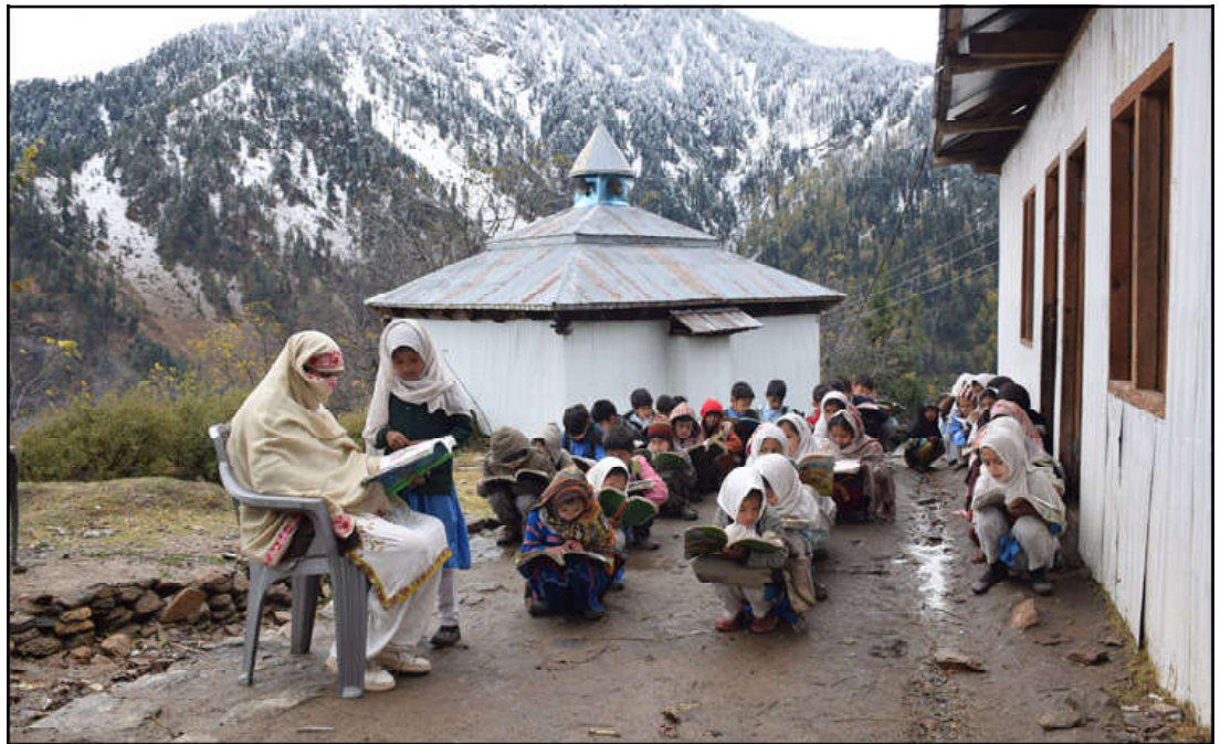
LEEPA VALLEY: Younger girls students are attending class at open air school during the extreme cold weather due to unavailability of school building of Government Girls Primary School Moji Chityra area of the Kashmir.