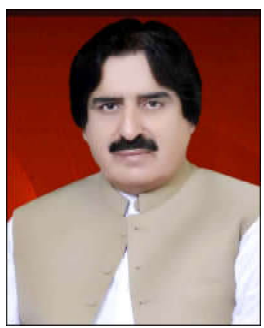
Board-I and with approval of the Chief Minister Balochistan with effect from March 27, 2023.