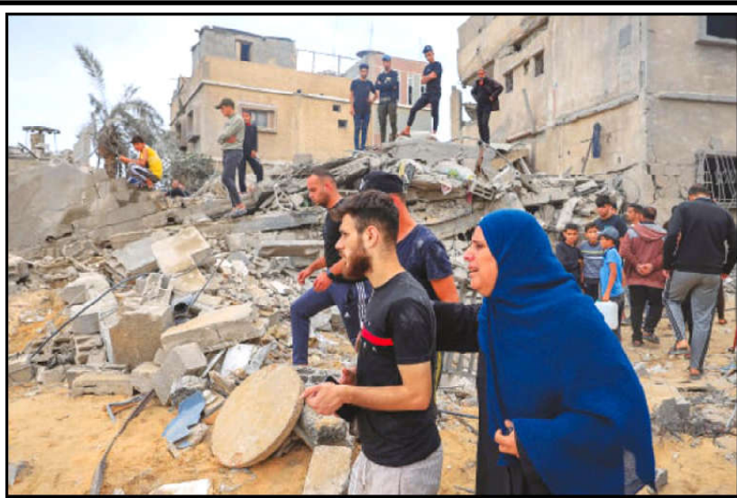
A woman cries as she stands by the rubble of a destroyed building following Israeli bombardment in Khan Yunis in southern Gaza Strip.

Monitoring Desk WASHINGTON: US National Security Advisor Jake Sullivan affirmed on Sunday that the United States will not accept the Israeli reoccupation of Gaza and will continue opposing the forcible displacement of Palestinians from the territory.