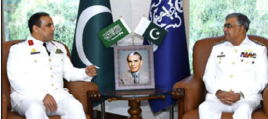
Chief of the Naval Staff Admiral Naveed Ashraf exchanging views with Rear Admiral Sajer Bin Rafeed Al-Enazi Eastern Fleet Commander Royal Saudi Naval Forces at Naval Headquarters Islamabad.