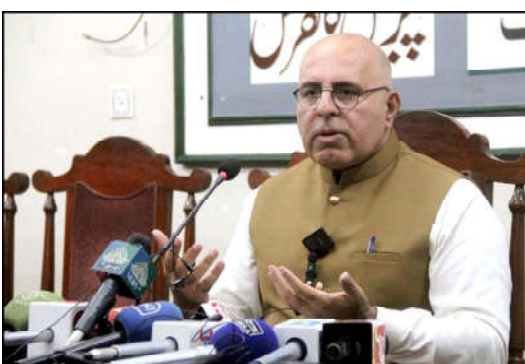
The Minister Information asserted that terrorism is being done from across border, and said that the befitting response would be given to those keeping an evil eye on the country.