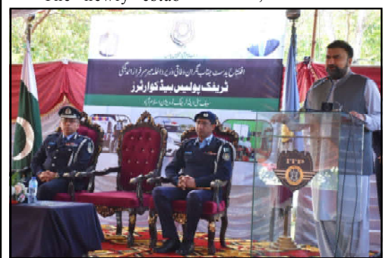
ISLAMABAD: Caretaker Interior Minister Sarfraz Bugti addressing the inauguration ceremony of the new building at the traffic police headquarters.

lished Traffic Police Office aims to streamline traffic-related affairs and facilitate the citizens of the federal capital. The minister emphasized the importance of upholding the law without any political interference, urging the officers to prioritize public service. He commended the dedication of the ITP officials for maintaining smooth flow of traffic in the capital during challenging weather conditions and public events. The minister stated, "Law is equal for everyone; ensure its enforcement without any bias. Let your commitment to public service be your motto. You have been chosen by Allah for this service; take pride in your responsibilities." ICCP Dr. Akbar Nasir Khan highlighted the achievements of the ITP for managing traffic efficiently during adverse weather conditions and construction activities. He praised the use of modern technology, including citywide surveillance cameras, to enforce traffic