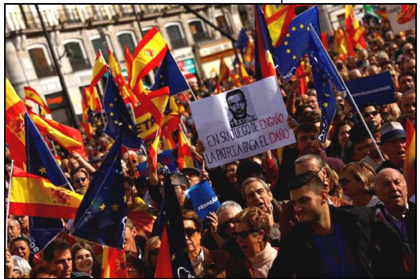
People hold flags as they take part in a protest called for by the Popular Party against a deal reached by Spain's socialists with the Catalan separatist Junts party for government support, which involves amnesties for people involved with Catalonia's failed 2017 independence bid, in Madrid, Spain.

Monitoring Desk WASHINGTON: The U.S. military conducted airstrikes on two locations in eastern Syria involving Iranian-backed groups, hitting a training location and a weapons facility, according to the Pentagon and U.S. officials.