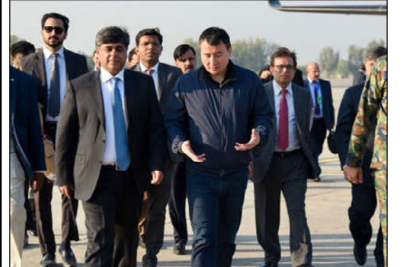
ISLAMABAD: Federal Minister for Commerce & Industries, Dr. Gohar Ejaz receiving Deputy Prime Minister of Uzbekistan for Trade and Investment Dr. Jamshed Khodjaev at Nur Khan airbase.