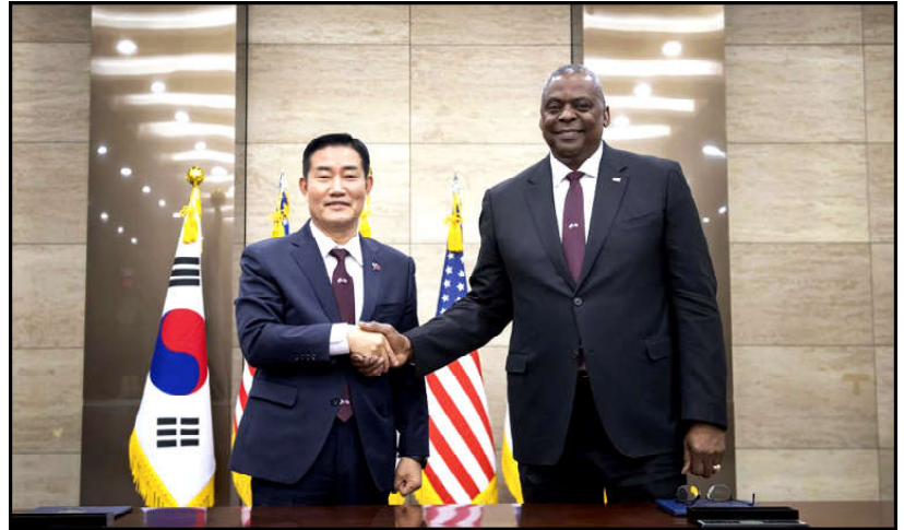
U.S. Secretary of Defense Lloyd Austin, right, and his South Korean counterpart Shin Won-sik shake hands for a photo during a signing ceremony of the 55th Security Consultative Meeting (SCM) at the defense ministry, in Seoul, South Korea.

Hamas fighters surged across the border from Gaza into Israel on Oct. 7, killing about 1,200 people and taking more than 200 hostages, according to Israeli officials. Only four hostages have been released to date. The Israeli bombardment of Gaza has since killed more than 11,000 Palestinians, around 40% of them children, according to counts by health officials in the Hamas-ruled territory.