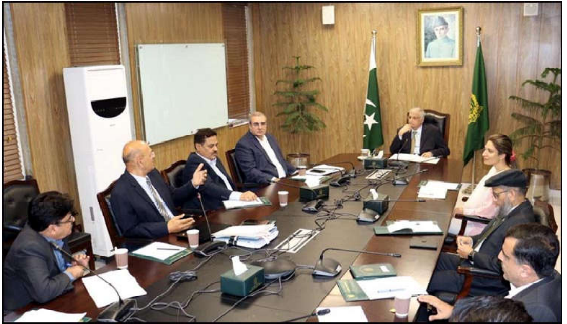
ISLAMABAD: The Caretaker Minister for Planning Development & Special Initiatives, Muhammad Sami Saeed chaired a meeting on Public Investment Management Assessment (PIMA) and Climate-PIMA.

This approach aligns with the National Adaptation Plan (NAP) and Nationally Determined Contributions (NDCs), signifying Pakistan's dedication to climate-smart policies and practices.