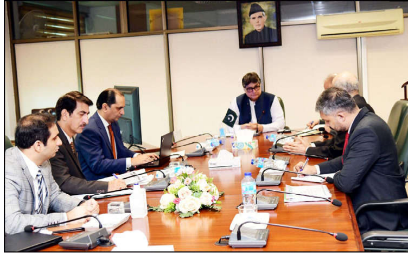
Caretaker Federal Minister for Privatisation Fawad Hassan Fawad chairs a meeting with management of HBFC.