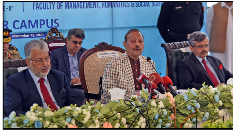
ISLAMABAD: President of Azad Jammu and Kashmir Barrister Sultan Mahmood addressing during the "Foundation Stone Laying and inauguration of the University of Poonch Rawalakot" at Kashmir House.

Chairman Senate, Sadiq Sanjrani referred the motion to the committee. He instructed the Senate Secretary to send the motion to the Principal Secretary of the Prime Minister and the Ministry of Finance for action against the official. Another privilege motion against Direction General Civil Aviation Authority regarding his misconduct with Senators Saleem Mandviwala and Faisal Saleem Rehman and Syed Muhammad Sabir Shah was also referred to the committee. A privilege motion of PPP Senator Taj Haider against misconduct of police official with him was also referred to the committee.