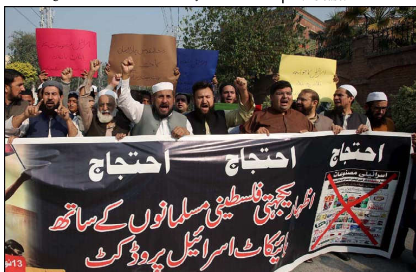
PESHAWAR: Members of Jamiat Business Forum are holding protest demonstration against Israeli cruel and inhumane acts and express unity with the innocent people of Palestine, held at Peshawar press club.

residing illegally in 32 districts of the province including 17832 in Peshawar, 1523 in Khyber, 1228 in Kohat, 607 in Lower Waziristan and others in Batagram, Tank, Torghar, Kohistan Swabi and Mansehra. The Home Department said that so far 206,018 people of 16,530 Afghan families have voluntarily.