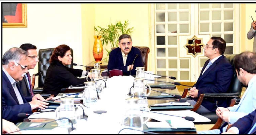
ISLAMABAD: The Caretaker Prime Minister Anwaar-ul-Haq Kakar chairs a meeting on the matters related to the Federal Board of Revenue.