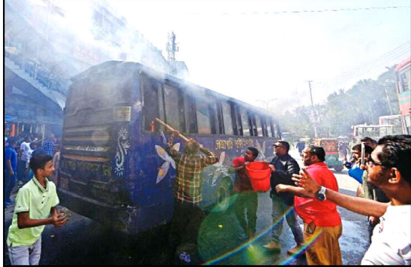
People try to douse a fire inside a bus allegedly torched by protesters during a nationwide transport blockade called by an opposition party, in Dhaka.