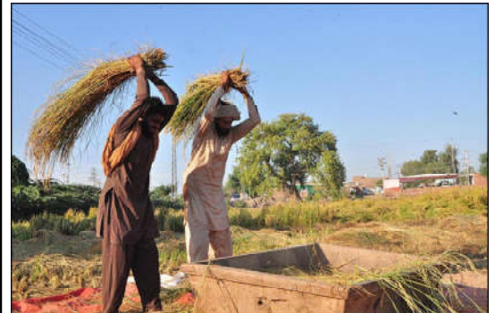
SARGODHA: A farmer busy threshing rice crops in their field at Jhang Moor.

It was decided that immediate steps, that can help the government to realise a fair asset value at the privatisation, need to be completed at the earliest including, but not limited to, repurposing its real estate assets from residential to commercial wherever applicable and HR reform with particular emphasis on clearing up of the pension.