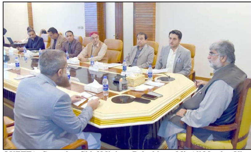
QUETTA: Caretaker Chief Minister Balochistan Mir Ali Mardan Khan Domki presiding over a high level meeting regarding environmental change and protection of forests and wildlife.

MoUs with them in this regard. In addition to this, the Chief Minister also directed to start planning for launching the Ph.D and M.Phil programmes on the protection of forests, wildlife and environment in the universities. The Chief Minister also called for protection of the migratory birds who migrate from Siberia due to the harsh weather conditions there. Earlier, it was informed that the bid of trophy hunting for Markhor was done at Rs. 2 crore 45 lakh in the province. It was also informed that the hunting license fees for 10 days is Rs. 10 million in the province.