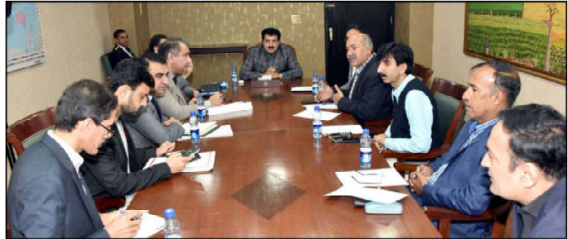
ISLAMABAD: Chairman Senate, Muhammad Sadiq Sanjrani in a meeting with the delegation of Parliamentary Reporters Association (PRA) at Parliament House.