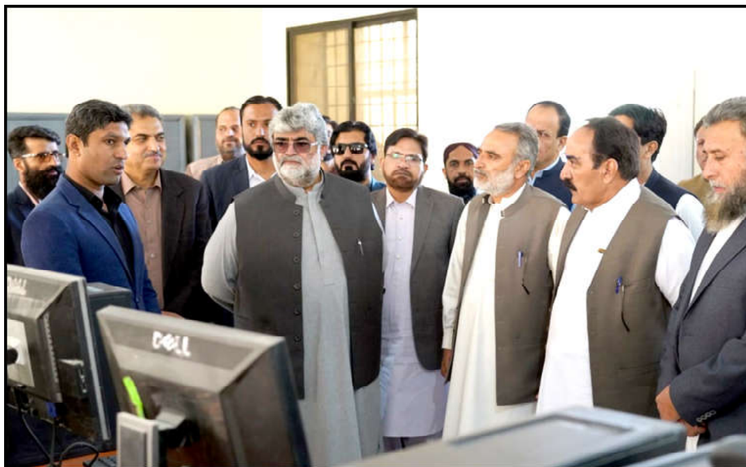
QUETTA: Caretaker Chief Minister Balochistan Mir Ali Mardan Khan Domki inspecting computer lab of Government College of Technology for Boys

ing Mirpur city with adjoining Islamgarh town the ancestral town of millions of the UK and Western countries - based Kashmiri Diaspora community. The delegation also visited the mausoleums of mystic poet of the sub continent Hazrat Mian Muhammad Buksh (RA) and the 18th-century preacher of Islam Hazrat Baba Peera Shah Ghazi (RA) and offered feteiha for the departed souls besides praying for integrity, solidarity, sovereignty and prosperity of Pakistan and Azad Jammu Kashmir besides for the earlier liberation of the occupied Muslim homelands.