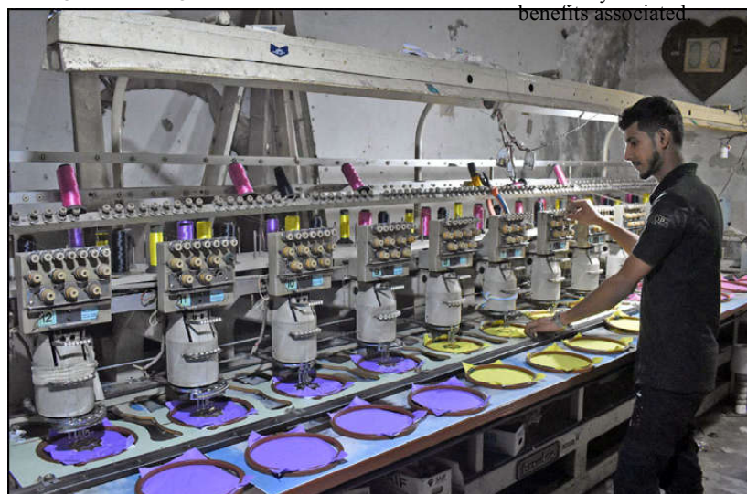
LAHORE: A Worker is busy in Embroidery on clothes with the help of machinery at his working area on Ravi Road in Provincial Capital.

Tax regulations means tax and other laws statutes, ordinances, rules, orders or other applications of the law applicable in a given country as well as any international treaty whereas tax compliance is the framework designed by the regulators to ensure transparent governance in the individual or business decision to comply with the tax laws in a given country, according to an NPO document shared here on Monday.