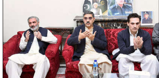
CHARSADDA: Caretaker Prime Minister Anwaar-ul-Haq Kakar offering Fatiha at the residence of late caretaker Chief Minister KP Azam Khan.