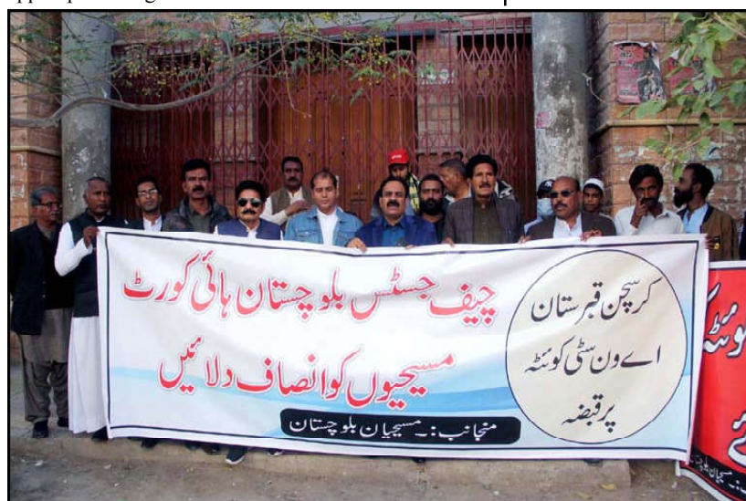
QUETTA: Members of Christian Community are holding protest demonstration against land grabbing of Christian Cemetery at Quetta press club.

He said that those abused the system would also be taken to task.