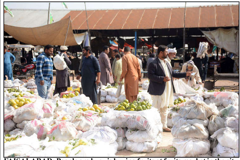
FAISALABAD: People are busy is buying fruits at fruits market in the city.