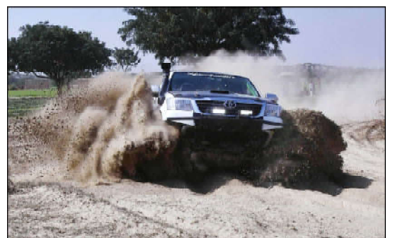
MULTAN: Racer showing his skills in the final round of the 8th Thial Desert Jeep Rally at District Muzaffargarh Organized by the Tourism Development Corporation of Punjab.