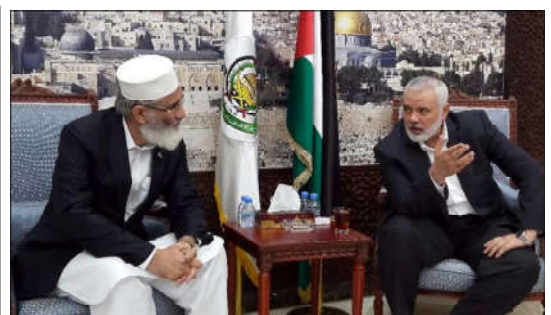
DOHA: Ameer Jamaat-e-Islami Sirajul Haq meeting with Chief of Hamas Ismail Haniyeh

ISLAMABAD (APP): In a precautionary measure to ensure the safety of commuters, the entry of all kinds of traffic from RYK Toll Plaza (559 SB) has been restricted due to fog in patches and decreased visibility in the area of Beat-27 of Motorway section MW (C-II) MULTAN, Sector-II, M-5. The diversion is being established at 579 rukan pur to 525 Azampur.