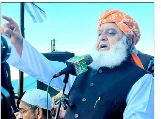
MURREE: Amir Jamiat Ulema Islam Maulana Fazlur Rehman addressing Tofan Al-Aqsa Conference