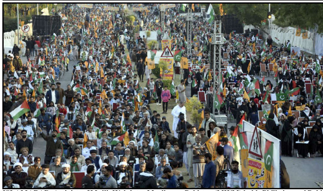
ISLAMABAD: Activists of Majlis Wahdat-e-Muslimeen Pakistan (MWM) holds Philistine and Pakistani national flags during Philistine protest march in Federal Capital.