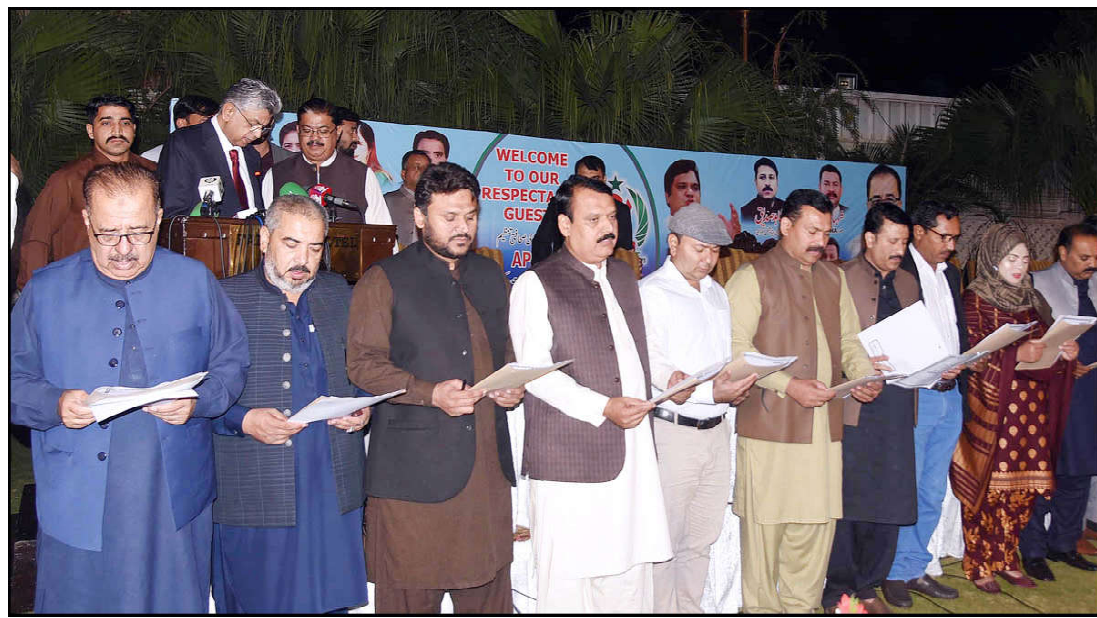
LAHORE: Caretaker Federal Minister for Information and Broadcasting Murtaza Solangi is taking the oath from the newly elected body of All Professional Newspapers Alliance (APNA).