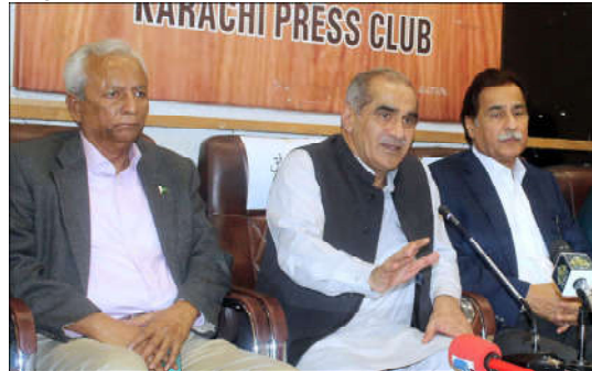
KARACHI: Former Federal Minister and PML-N leader Khawaja Saad Rafiq addressing a press conference at the Karachi Press Club.

justment, however, it has not made a decision on electoral alliance with any political party so far. He said that JUI-F safeguards the Islamic Constitution of Pakistan and the religio-political party could transfer the country into an Islamic welfare state. He criticised that the Constitution was approved in Zulfiqar Ali Bhutto's era but Islamic laws were not implemented. Haideri added that all former prime ministers including two-time PM Benazir Bhutto late and three-time PM Nawaz Sharif had not implemented Islamic laws.