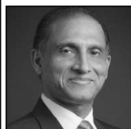
Aizaz Ahmad Chaudhry

Since the dawn of this century, terrorism has been the principal threat to the people of Pakistan. By 2015, Pakistani law-enforcement authorities had succeeded in crushing terrorist forces, through military operations in Swat, South Waziristan and North Waziristan. A National Action Plan was adopted in 2015 to flush out the remaining terrorist holdouts through intel-based operations. The strategy worked well till 2019, with few terrorist incidents.