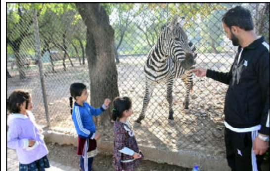
ISLAMABAD: A family enjoy with Zebra during Sunday Holiday alongside Faisal Avenue in Federal Capital.

sures to augment the size and visibility of GHWs on tobacco products. The prevailing health warning, currently set at 60%, frequently goes unnoticed by consumers, including vulnerable children, owing to its diminutive dimensions and discreet placement. It's worth noting that Pakistan's neighbouring countries such as India, Sri Lanka, Nepal, the Maldives, and Myanmar have adopted significantly larger GHWs. Imran has recommended increasing the GHW size to encompass a minimum of 85% of the primary display areas of cigarette packs and other tobacco products. This decisive action would guarantee that the warnings become conspicuous and easily discernible for all consumers, with particular consideration to children.