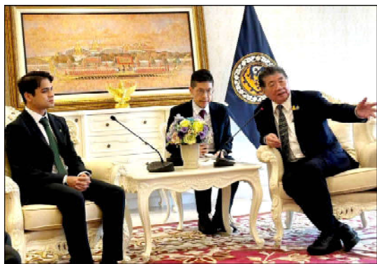
Caretaker Minister for Sports and Culture Balochistan Nawabzada Mir Jamal Khan Raisani meeting with Deputy Prime Minister and Commerce Minister of Thailand Phumtham Wechayachai

The blue whale found dead on the seashore between North Bandan and Churbanandan in Pasni area was also among the rare creatures.