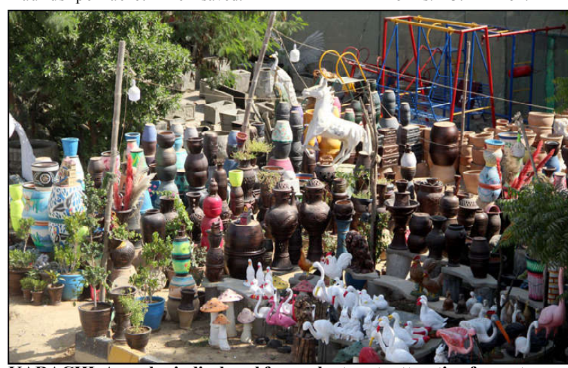
KARACHI: A vendor is displayed fancy plants pots attraction for customers at a nursery in Provincial Capital.