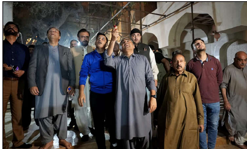
LAHORE: Punjab Caretaker Chief Minister Mohsin Naqvi reviews progress being made on the renovation and extension of the project during his visit Mazar Bibi Pak Daman.

Addressing the ceremony, the Governor said that service to suffering humanity was the greatest worship and Omar Foundation was providing selfless free treatment services for the completion of a healthy society and complete eradication of diabetes, which was not only commendable but also for the eradication of diabetes.