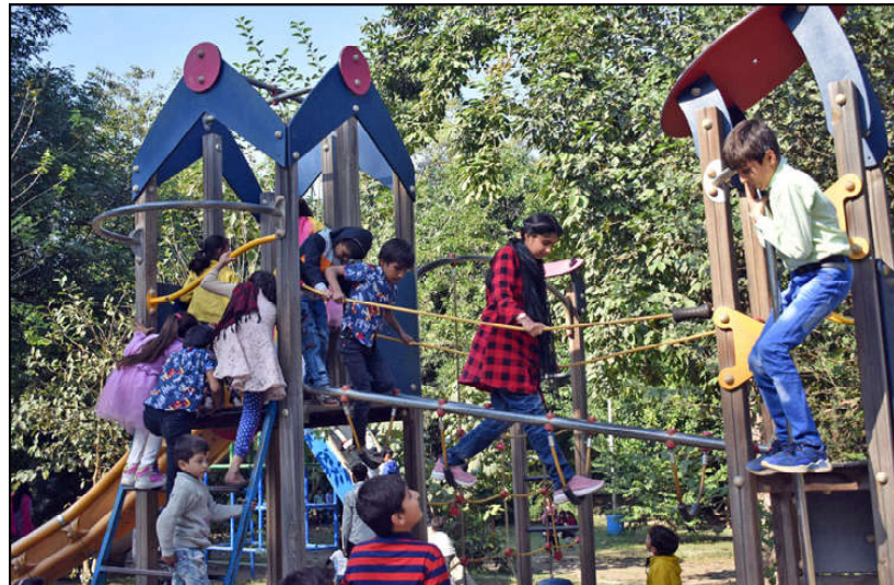
LAHORE: Children are enjoying Sunday Holiday at Bagh-e-Jinnah in Provincial Capital.

To a query, sources said the map allowed women to plan their route ahead and avoid troublesome spots.