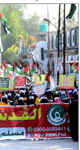
LAHORE: Activist of Muslim Women League hold a protest against Israel attack on Gaza at District Council Chowk road in the city