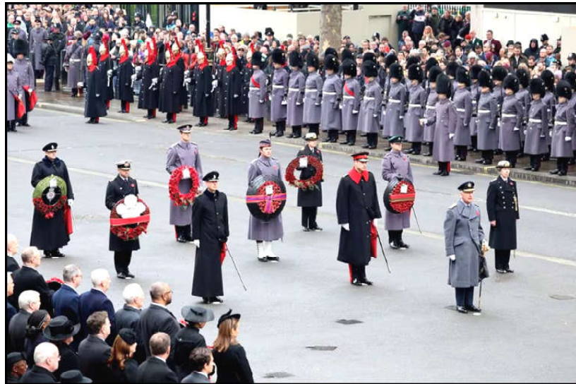
Britain's King Charles III, William, Prince of Wales, Prince Edward, Duke of Edinburgh, and Anne, Princess Royal, attend the National Service of Remembrance at The Cenotaph on Whitehall in London, Britain.

protesters threw bottles at officers, and police vehicles sped around the city to respond to reports of tensions in the streets. London's Met Police said later it had made 82 arrests of counter-protesters in a move designed to keep the peace, as far-right groups had tried to get close to the pro-Palestinian rally. "We will continue to take action to avoid the disorder that would likely take place if that happened," the force said in a statement on social media.