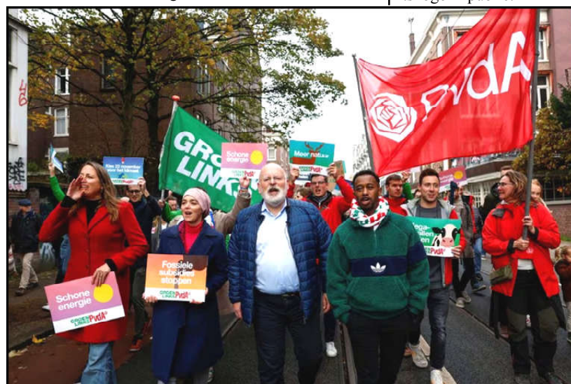
The leading candidate of the Dutch Labour Party, Frans Timmermans, attends The March for Climate and Justice to demand political change before the elections in Amsterdam, Netherlands.

can happen and plan for that," the mayor of Yonaguni, Kenichi Itokazu, told officials at the island's town hall at the start of the drill. Japan is prone to earthquake-triggered tsunami. Nearly 20,000 people were killed by one on the northeast coast of its main island of Honshu in 2011. But Koji Sugama, the Yonaguni official in charge of preparing the island's 1,700 residents for disasters, said the community also had to be prepared for the danger of conflict. "Today we conducted a disaster drill, but it also gives people something to think about that will come in useful in a Taiwan emergency," Sugama said. Yonaguni is only 110 km (68 miles) from Taiwan. In August last year, China fired missiles into nearby waters in response to a visit to Taiwan by the then US House speaker.