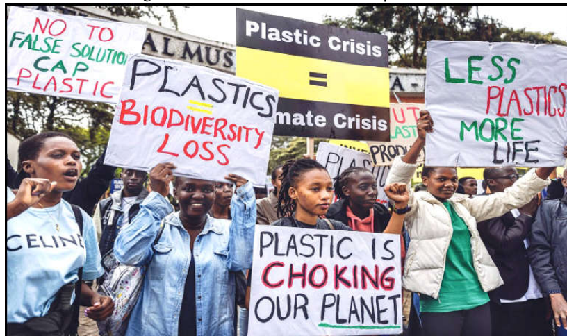
Climate activists chant slogans and hold banners as they march in Nairobi to demand drastic reduction in global plastic production.

three stints in charge. New gender parity rules on political representation in Mexico secured the nomination for the 60-year-old Brugada, even though the capital's former chief of police Omar Garcia Harfuch comfortably defeated her in polling commissioned by the party. Nine heads of regional government will be elected next June, including the mayor's job, and the parity rules meant that parties needed to nominate at least five women for the posts. As runner-up for the capital, Brugada will run for the job to meet the quota, MORENA party leaders said. Mexico City has for decades been a bastion of the left, but MORENA suffered a major setback in midterm elections in 2021, losing more than half the city's boroughs to the opposition. The city's top job has also served as a springboard for presidential ambitions.