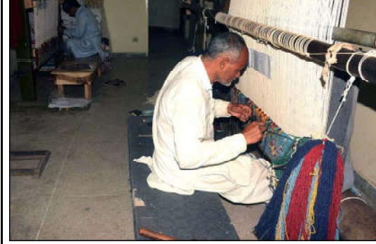
LAHORE: A man busy in preparation of handmade carpets with the help of traditional machine to earn his livelihood for support his family, at workplace in Lahore.

MULTAN (APP): The monthly revenue of the Water and Sanitation Agency (WASA) was gradually improved as it reached Rs 145 million after the tariff was revised. Director Revenue WASA Mansoor Ahmad while talking to APP here on Sunday that the revenue of the department increasing and they have a target to increase it above Rs 200 million per month. He informed that the department had included new consumers in the billing net and consumer strength reached 300,000 now. He informed that over 50 percent consumers were paying WASA bills regularly while steps were being taken to collect maximum revenue from consumers. Mr Mansoor said that the bill was being collected from domestic, commercial consumers, and private housing colonies in various categories. He said that the teams were conducting raids on daily basis against defaulters for recovery of dues and sewer connections being disconnected.