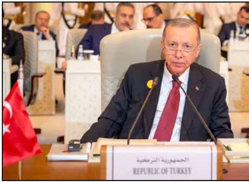
Turkey's President Tayyip Erdogan attends Organisation of Islamic Cooperation (OIC) summit in Riyadh, Saudi Arabia.

more than two decades in power. In response to the Constitutional Court ruling, the Court of Cassation said the Constitutional Court's ruling was unconstitutional. In a statement on Friday evening, the Court of Cassation, the country's top appeals court, accused the Constitutional Court of dragging the legal system into chaos with its rulings on individual applications. In protest at the position taken by the Court of Cassation, lawmakers of the main opposition CHP party have staged a sit-in at the parliament's general assembly since Thursday. "Our protest against the attempt to overhaul the constitutional order will continue until further notice," CHP leader Ozgur Ozel said in a post on X on Sunday.