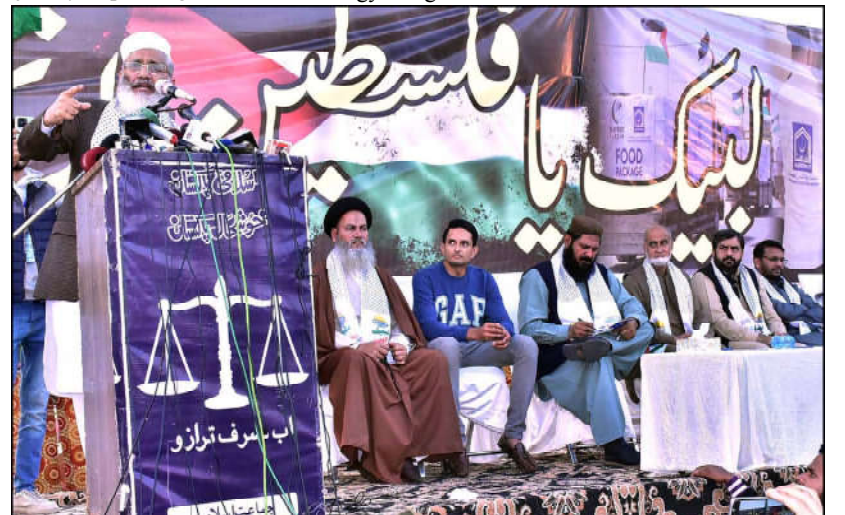
STALKOT: Ameer Jamaat-e-Islami Pakistan Siraj-ul-Haq addressing the Labaika ya Palestine Youth Convention at Murray College

Indian Ocean, where piracy, terrorism and other dangerous activities pose threats to the maritime transport of energy and goods.