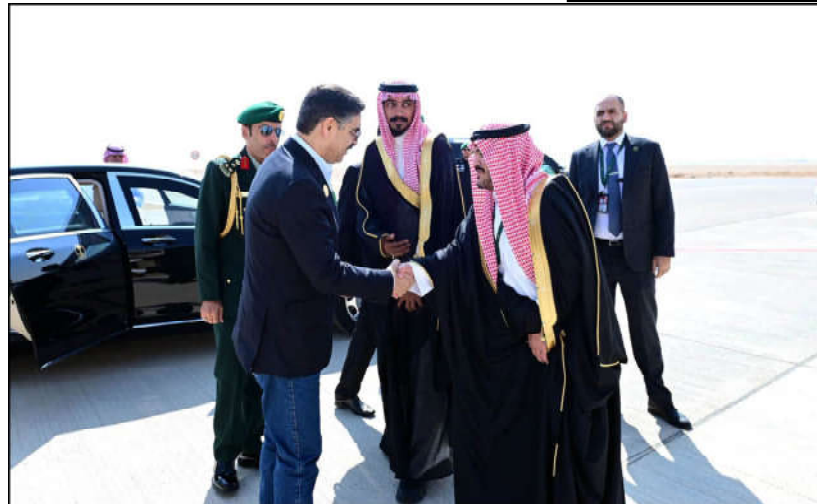
RIYADH: Caretaker Prime Minister, Anwaar-ul-Haq Kakar being seen off by high diplomatic officials of Pakistan and Saudi Arabia after completing his three day official visit of Kingdom of Saudi Arabia

He said that we are making political and social