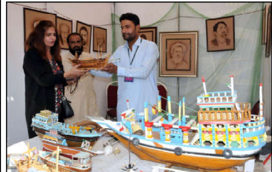
ISLAMABAD: Woman visiting stall during "Folk Festival Lok Mela" at Lok Virsa.

Nowshera, Khyber Pakhtunkhwa. These livelihood assets span diverse ventures like shoe shops, clothing stores, crockery items, welding machines, carpenter's tools, cosmetics shops, peco, and sewing machines. Representatives from the UNHCR district office in Peshawar and Commissionerate Afghan Refugees, KP also joined distribution events. Their appreciation for the PPAF beneficiary selection process adds to the success of our intervention.