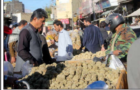
QUETTA: People busy in buying jaggery as the demand of jaggery increase in city on the arrival cold breezy winter season, at roadside stalls located on Bacha Khan Chowk in Quetta.

LAHORE (APP): Caretaker Minister for Information and Broadcasting and Parliamentary Affairs Murtaza Solangi on Sunday underlined the need for exploiting the untapped potential of renewable energy resources in the country to minimize carbon emission in the environment and reduce the import bill. Addressing the opening ceremony of LONGI Solar's Lahore office, he said renewable energy resources such as solar and wind were abundantly present in Pakistan and there was a strong need to reap its benefits. He said currently the country produced 58.8 per cent of its electricity through expensive and unaffordable means such as coal and fuel that not only impacted the environment adversely but also economy, trade and people. The minister said the previous government approved 10,000 megawatts solar energy projects and efforts were underway to materialize them. However, the next elected government and parliament should also continue the same policy for betterment of the country. He congratulated the LONGI Solar for achieving the milestone and expressed his gratitude for China that had been supporting Pakistan.