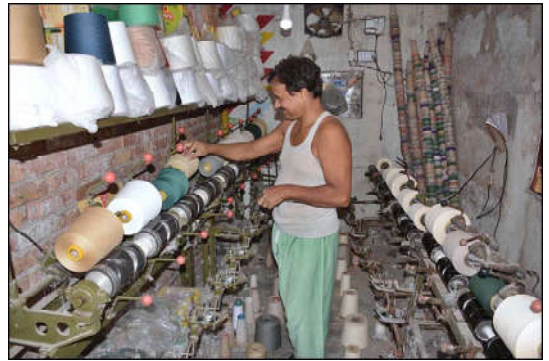
FAISALABAD: A power loom worker busy in routine work to earn livelihood at his workplace.