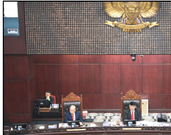
Honorary panel members of the Constitutional Court Jimly Asshiddiqie (C), Wahiduddin Adams (L), and Bintan Saragih (R) preside over a proceeding at the Constitutional Court in Jakarta.

Monitoring Desk DHAKA: Bangladesh raised the minimum monthly pay for the country's four million garment workers by 56.25 per cent on Tuesday, a decision immediately rejected by unions seeking a near-tripling of the figure.