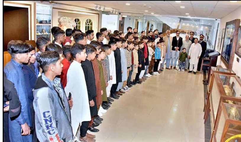
ISLAMABAD: A group of students and faculty members of Government boys school Bhunat Islam Nagar, Bagh Azad Kashmir visiting senate museum at Parliament House.