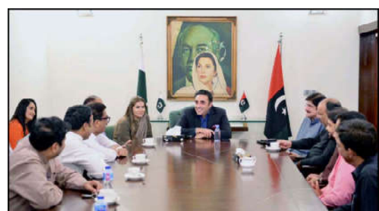
KARACHI: Peoples Party (PPP) Chairman, Bilawal Bhutto Zardari in meeting with Journalists of national newspapers, news channels and media houses, held at Bilawal House in Karachi.

"It has not supplied nor does it intend to supply any arms to Ukraine," she remarked. The spokesperson said that Pakistan had stressed the need for a negotiated solution to the conflict in Ukraine.