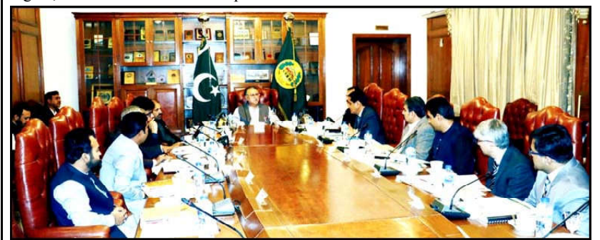
Governor Balochistan Malik Abdul Wali Khan Kakar chairing 3rd Senate meeting of Mir Chakar Khan Rind University Sibi

President Alvi said that as the office of the President of Pakistan represented the unity of the Republic as Head of State under Article 41 of the Constitution of Pakistan and, therefore, it was duty-bound along with the prime minister and all institutions to protect the rights of the citizens, as enshrined in the Constitution.