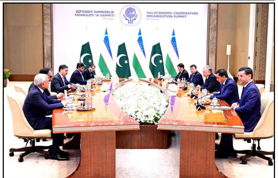
TASHKENT: Caretaker Prime Minister Anwaar-ul-Haq Kakar meets with the President of the Republic of Uzbekistan, Mr. Shavkat Mirziyoyev on the sidelines of 16th ECO Summit.