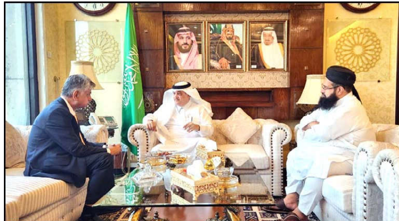
ISLAMABAD: Caretaker Federal Minister for Information and Broadcasting Murtaza Solangi in a meeting with Ambassador of Saudi Arabia to Pakistan Nawaf Saeed Al Malki