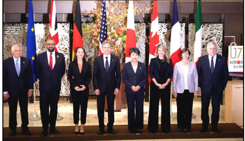
High Representative of the European Union for Foreign Affairs and Security Policy Josep Borrell, Britain's Foreign Secretary James Cleverly, Germany's Foreign Minister Annalena Baerbock, U.S. Secretary of State Antony Blinken, Japan's Foreign Minister Yoko Kamikawa, Canada's Foreign Minister Melanie Joly, France's Foreign Minister Catherine Colonna, and Italian Foreign Minister Antonio Tajani.

A bipartisan panel appointed by the US Congress said last month that Washington must prepare for possible simultaneous wars with Moscow and Beijing by expanding its conventional forces, strengthening alliances and enhancing its nuclear weapons modernisation programme.