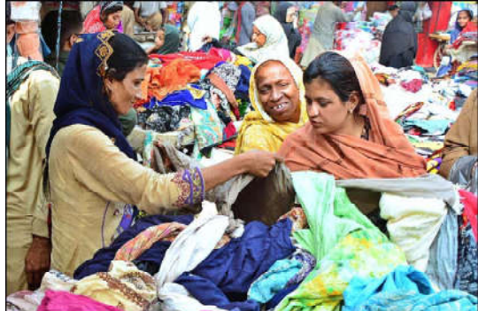
HYDERABAD: Women busy in selecting and purchasing old cloth pieces from vendor at cloth market road.

The subject of the conference was "Exploring Pakistan's Tourism Treasures: From Mountains to Metropolises." "Our joint ventures will help tapping the existing potential of tourism. Your equity participation will pay you off well," Ambassador Masood Khan said. He thanked the organizers of the session which he said would "induce people to visit Pakistan and get a first-hand experience of witnessing its pristine beauty."