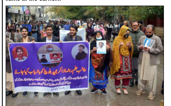
QUETTA: Members of Voice for Baloch Missing Persons are holding protest demonstration for recovery of their loved one, at Quetta press club.

He also directed the supervising engineers of CW& department to visit the projects and ensure smooth work on them.