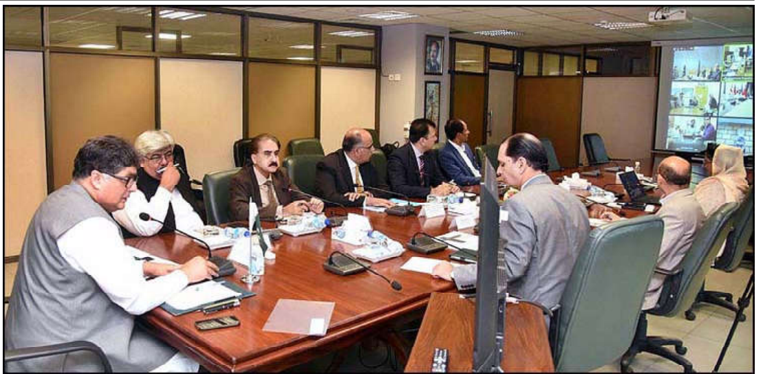
ISLAMABAD: Federal Minister for Privatisation, Fawad Hasan Fawad chairs a meeting of SIFC Working Group.

The secretary mentioned that trading in carbon markets was a tricky subject evolving every year, whereas the country had no such framework in place to deal with it.