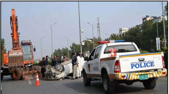
ISLAMABAD: A view of damaged car due to accident in the Federal Capital at Jinnah Avenue.

Islamabad Karachi Company Police arrested 64 individuals last month and the recovery of valuables is estimated to be worth Rs 11.3 million. According to police, these arrests included four members of two notorious criminal gangs known for their involvement in various heinous crimes and unlawful activities. Islamabad Police have amplified its crackdown on criminal elements to purge the city of crime. The recent actions by the Karachi Company police teams have resulted in the apprehension of 64 offenders, including 37 absconders, proclaimed offenders, and target offenders over the previous month. In the course of these operations, law enforcement officials successfully recovered four stolen vehicles, eight stolen motorcycles, 1.420 kilograms of heroin, 43 grams of opium, 194 bottles of liquor, and 125 litres of alcohol. Additionally, the teams confiscated four pistols, three daggers, and 37 rounds of ammunition from the possession of the arrested individuals. Emphasizing the gravity of the situation, ICCPO Dr Akbar Nasir Khan has instructed all senior officials to maintain a stringent approach towards combating drug peddling and the possession of illegal weapons. He has stressed the need for continuous monitoring of the performance of police personnel in this regard, underscoring that any negligence in official duties will not be tolerated.