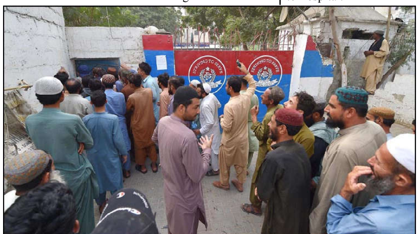
KARACHI: A large number of Afghan gatherings outside SSP Office Sobhrab Goth Par for NADRA Registration.