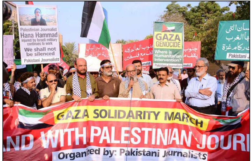
KARACHI: Journalists holding playcards during a rally in support of Palestinians, and express solidarity with Palestinian journalists and their families during Gaza March (Save Gaza Save Journalists) at the Karachi Press club to Governor House Sindh.