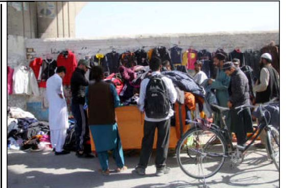
QUETTA: Warm clothes are being selling at a roadside stall as the demand of warm clothes increased in city on the arrival of cold waves of winter season, near Benazir Flyover in Quetta.

He said that bringing modern agricultural trends and research to the doorsteps of farmers is the need of the hour. He said that UAF has a unique position and role in providing manpower and solving the problems of the farming community.