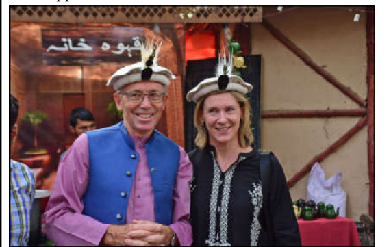
ISLAMABAD: Australian High Commissioner to Pakistan Neil Hawkins posing for a photograph wearing traditional "Chitrali Cap" in KPK Pavilion during annual 10 days Lok Mela 2023 at Lok Versa in Federal Capital.

ISLAMABAD (APP): Health officials on Wednesday said that six new coronavirus cases were reported during the last week across the country. As per data shared by the National Institute of Health (NIH), the case positivity ratio was 0.16 percent while no patient was in critical condition. No death was reported from the coronavirus while 3,674 Covid-19 tests were conducted. Meanwhile, the official of the Ministry for National Health Services, said that the government had strengthened the role.