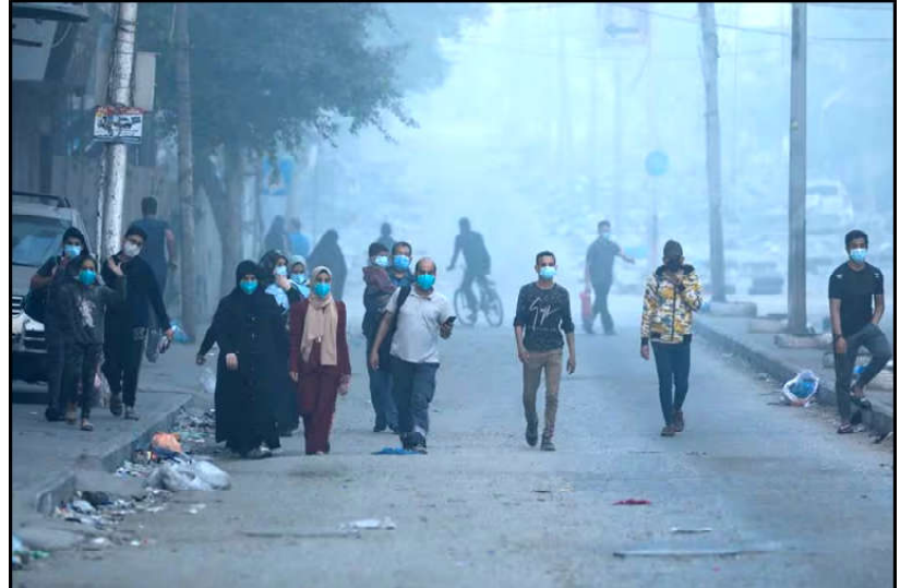
Palestinians flee their homes during Israel's ground offensive, on the edges of Beach refugee camp, in Gaza City.

Monitoring Desk GAZACITY: Iyad Shaqura, a doctor of pharmacy turned by the Gaza crisis into an emergency physician, had become used to the flow of dead and wounded streaming into the hospital in Khan Yunis.