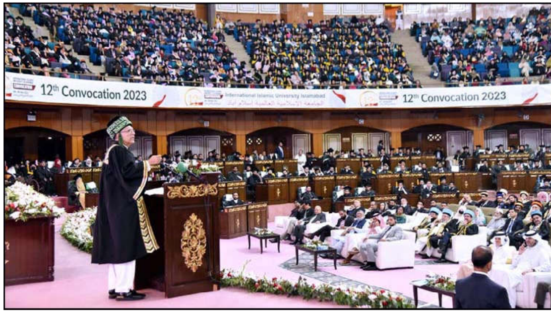
ISLAMABAD: President Dr Arif Alvi addressing the 12th Convocation ceremony of International Islamic University Islamabad.