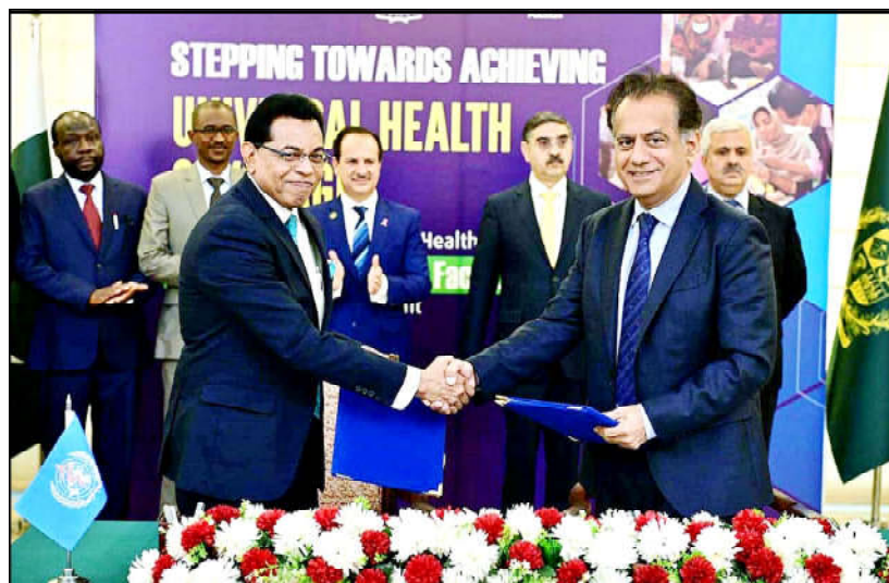
ISLAMABAD: Caretaker Prime Minister Anwaar-ul-Haq Kakar witnesses a ceremony of the signing of letters of understanding between WHO and the Government of Pakistan on Universal Healthcare