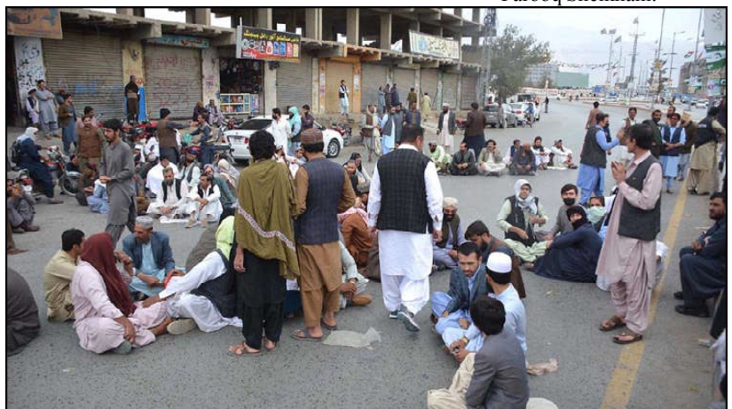
QUETTA: Anjuman e Tajran activites hold protest in front of custom office.