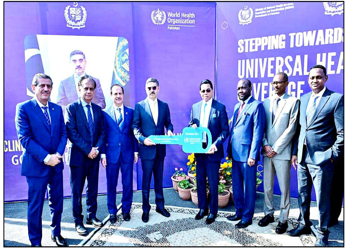
ISLAMABAD: Caretaker Prime Minister Anwaar-ul-Haq Kakar receives a key signifying the provision of multiple mobile health units to the Government of Pakistan by WHO.

852,022 tons in the fiscal year 2009-2010. The Gadani ship breaking yard is also known for its efficiency and speed in dismantling ships. It can break up to 125 ships of all sizes per year with a combined light displacement tonnage of 1 million tons. It takes only 30 to 45 days to break a ship with 5,000 LDT at Gadani compared to more than six months at Alang or Chittagong. The Gadani ship breaking yard is a vital source of income and employment for Balochistan and a significant contributor to the local and national economy. It is also a place where old ships are given a new life by being recycled into useful materials and items. The Gadani ship breaking yard is a testament to the resilience and resourcefulness of the people of Balochistan who have turned a barren beach into a bustling industrial hub.