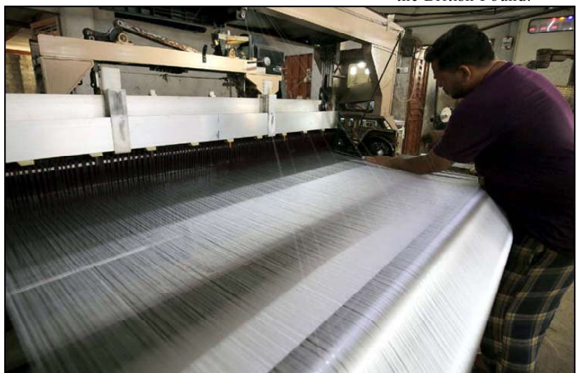
KARACHI: Labours busy making clothes with the help of thread to earn their livelihood their families, at local factory located on Nazimabad SITE area in Karachi.