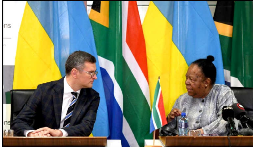
Ukrainian Foreign Minister Dmytro Kuleba looks on during his meeting with his South African counterpart Naledi Pandor, as they hold a joint press conference in Pretoria, South Africa.

"More than 20 civilians have been killed and others have been wounded," said the statement, which was sent to AFP. The committee keeps track of rights violations during the conflict and its civilian victims. On Saturday, a medical source said shells that hit houses in Khartoum had killed 15 civilians. Omdurman has repeatedly been the site of fierce battles between the two sides. Though most of the fighting was previously contained to the capital and the western region of Darfur, it has also spread to areas south of Khartoum according to witnesses.