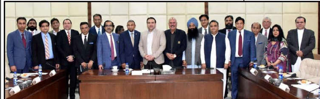
Senator Muhammad Abdul Qadir along with others Senators in a group photo with the delegation of American Pakistani Public Affairs Committee (APPAC) at parliament House, Islamabad.

Line/s etc. These committees will compile and submit their periodic reports, including details on number of awareness sessions conducted, number of people educated (female/male) and number and type of cases identified and reported. Around 80 members of community-based child protection groups/ committees participated in the workshop where they were briefed about the Child Protection Act 2018, different forms of violence against children, and the existing mechanisms for child protection in the capital city.