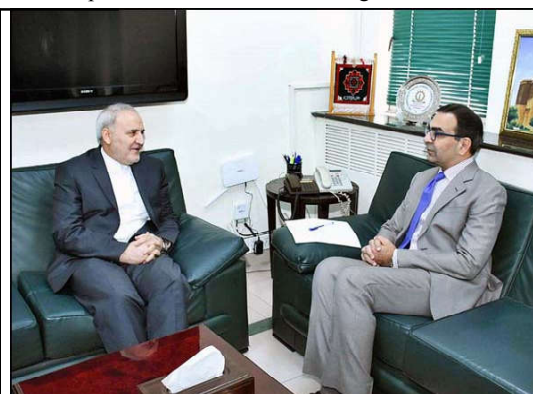
ISLAMABAD: Ambassador of the Islamic Republic of Iran to Pakistan H.E. Dr. Reza Amiri Moghaddam called on Caretaker Federal Minister for Power and Petroleum Muhammad Ali.

ISLAMABAD (APP): Pakistani Rupee on Monday witnessed an 89-paise devaluation against US Dollar in the interbank trading and closed at Rs 285.28 against the previous day's closing at Rs 284.31. However, according to the Forex Association of Pakistan (FAP), the buying and selling rates of the Dollar in the open market stood at Rs 285 and Rs 287.5 respectively. The price of the Euro increased by Rs 4.51 to close at Rs 306.59 against the last day's closing of Rs 302.08, according to the State Bank of Pakistan (SBP). The Japanese Yen increased by 01 paise and closed at Rs 1.90; whereas an increase of Rs 7.01 paise was witnessed in the exchange rate of the British Pound.