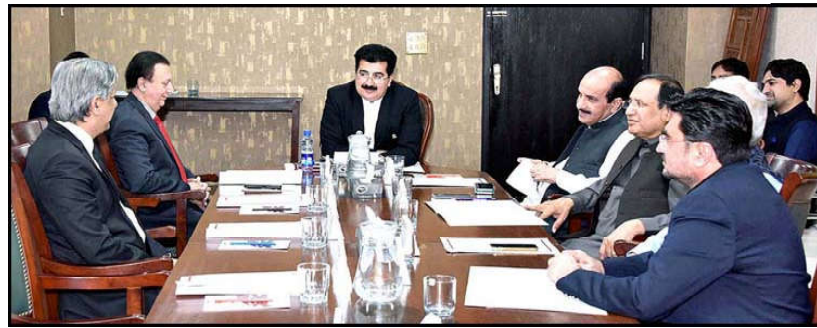
ISLAMABAD: Chairman Senate, Muhammad Sadiq Sanjrani presiding over a senate house business advisory committee meeting at Parliament House.