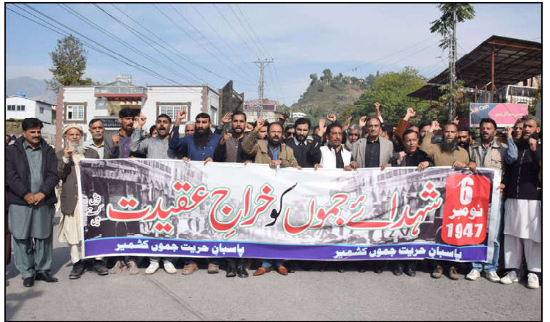
MUZAFFERABAD: Speaker Lagestaltive Assembly of AJK Chaudhry Latif Akbar participate in the rally of Pasban-e-Hurriyat to mark the "Youm-e-Suhada" in the Capital of AJK.

Such comments and threats of violence reflect the irresponsible cruel attitude and criminal mindset, she said, adding it is not only morally reprehensible but also counterproductive to achieving lasting peace in the region.