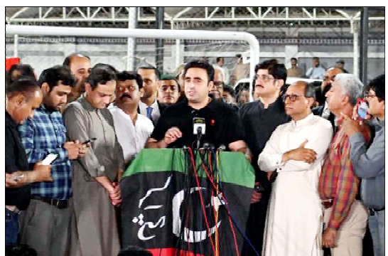
KARACHI: Chairman Pakistan Peoples Party (PPP) Bilawal Bhutto Zardari talking to media persons

Delivering his speech at the launching ceremony of the report on ten years of China Pakistan Economic Corridor by All Pakistan China Enterprises Association and Pakistan China Institute, he said that the Ministry of Information and its associated organizations like Pakistan Television, Pakistan Broadcasting Corporation and Associated Press of Pakistan were already engaged with their