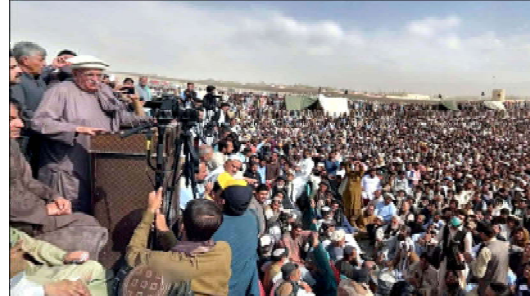
CHAMAN: Pashtunkhwa Milli Awami Party (PKMAP) Chairman Mehmood Khan Achakzai addresses a public gathering

Mehmood Khan Achakzai said that we are not terrorists and demanded for withdrawal of the decisions of oppression, do not force the people of Aman to start a strong protest and remove this fence. He said that the legitimate demands and rights of Pashtuns must be recognized to make this country Pakistan and Afghanistan peaceful.