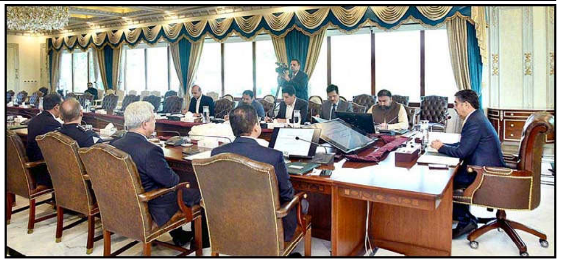
ISLAMABAD: Caretaker Prime Minister Anwaar-ul-Haq Kakar chairs a meeting regarding issues related to ICT.

city. The meeting was informed that 160 new buses would soon arrive in the city that would help making the public transport system in the city more effective. The prime minister directed that a central digital system should be made for registration of cars in all cities across the country including Islamabad. Fitness certificates should be issued for old vehicles based on the internationally accepted environmental pollution standards, he said.