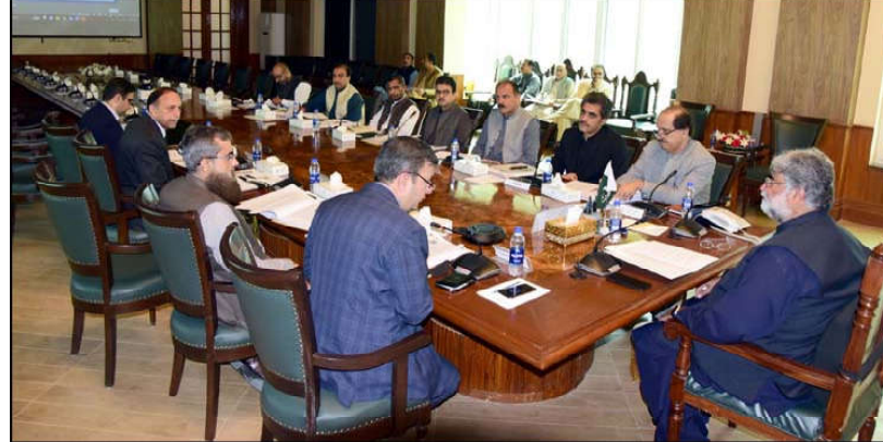
QUETTA: Caretaker Chief Minister Balochistan and Chairman Gwadar Development Authority Mir Ali Mardan Khan Domki presiding over meeting of 27th Governor Body of GDA.

new family planning policy the draft of which has been prepared. He also informed that tenders for purchase of the anti-pregnancy medicines. In this regard, the strength of procurement committee would be increased. Speaking on the occasion, caretaker Minister directed to ensure transparency in purchase of medicines for family planning. He also directed to send the new policy for family planning for approval after its early completion.