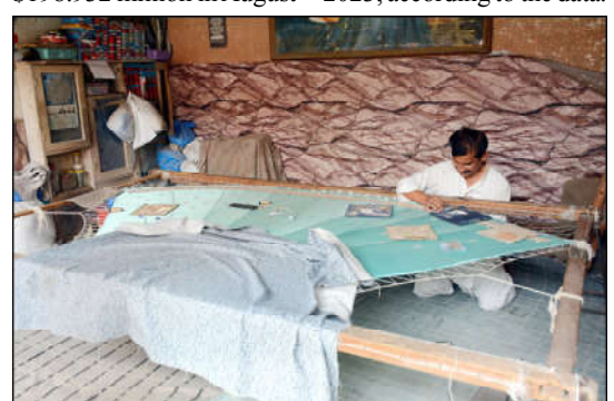
FAISALABAD: A skilled man is busy in embroidery at his shop in Allama Iqbal Colony in City.

2023, the SBP data revealed. Overall Pakistan's exports to other countries witnessed a decrease of 4.96 per cent in the first three months, from US $ 7.385 billion to US $ 7.018 billion, the SBP data revealed. On the other hand, the imports from China into the country during the months under review were recorded at US $2744.241 million against US $3233.046 million last year, showing a decline of 15.11 per cent in July-September (2023-24). On a year-on-year basis, the imports for China witnessed an increase of 2.92 per cent from US $855.975 million in September 2022, against the imports of US $880.972 million in September 2023. On a month-on-month basis, the imports from China into the country dipped by 2.14 per cent during September 2023, as compared to the imports of US $900.289 million during August 2023, according to the data.