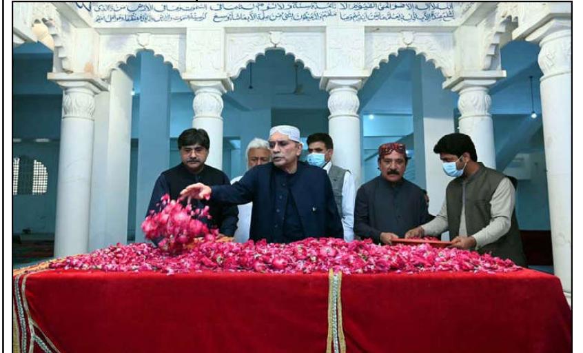
GARHI KHUDA BUX: Peoples Party (PPP) President, Asif Ali Zardari is laying floral wreaths and offers Fataha for the peace of departed soul of at grave of the PPP Founder, Zulfikar Ali Bhutto and Benazir Bhutto, at Bhutto Mausoleums in Garhi Khuda Bux.

Speaking at the inaugural ceremony, the chief secretary said that emergency services are being improved across Punjab and Rescue stations are being equipped with modern equipment. He said that Rescue stations have been provided with modern gadgets, ambulances and motorcycles. Officials briefed the chief secretary that the Rescue Station Lala Musa has been constructed with Rs 19.451 million, while Rescue Station Dinga with Rs 19.318 million. They said that establishment of Lala Musa and Dinga stations would help provide timely emergency services in the adjoining areas. Earlier, during the inspection of Gujranwala Motorway Link, the chief secretary directed the authorities to speed up work on the project.