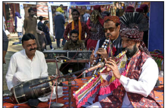
ISLAMABAD: Sindhi folk artist performing during annual Lok Mela 2023 at Lok Virsa in Federal.