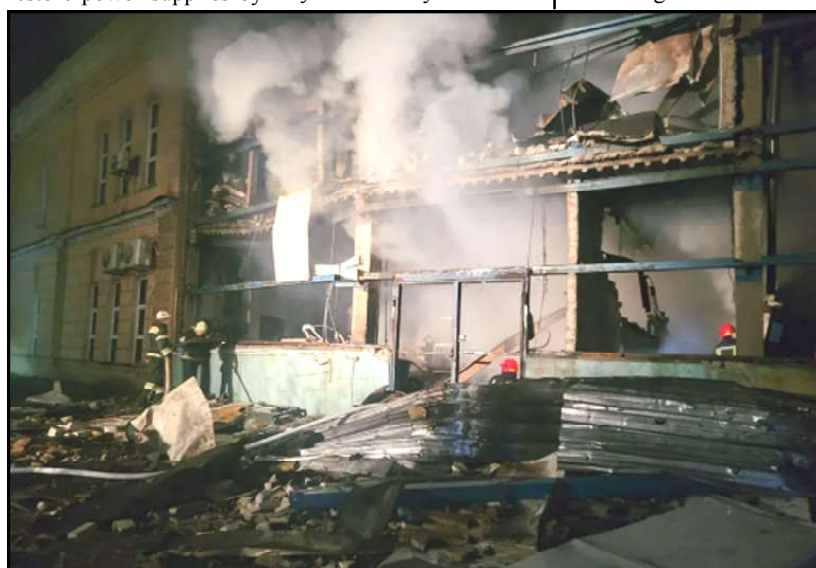
Ukrainian emergency workers examine the site of the Russian rocket attack in central Odesa, Ukraine.

a comprehensive ceasefire in Palestine. During the Cairo Peace Summit last month, President Cyril Ramaphosa called on countries to not supply weapons to either side of the conflict while its foreign ministry urged the United Nations to deploy forces to protect civilians in Gaza. Over 1,400 people were killed by Hamas in the deadly Oct. 7 attack on southern Israel, which South Africa has condemned, while also calling for the return of hostages. More than 10,000 Palestinians have been killed since the war began, health officials in Hamas-controlled Gaza have said. Pandor made the remarks in Pretoria during a joint press briefing with her Ukrainian counterpart Dmytro Kuleba. She said there had been progress in two of the 10 points tabled during the African peace initiative aimed at ending the conflict between Russia and Ukraine - return of the children to Ukraine from Russia and continued exchange of prisoners. The minister did not provide any further details on the progress.