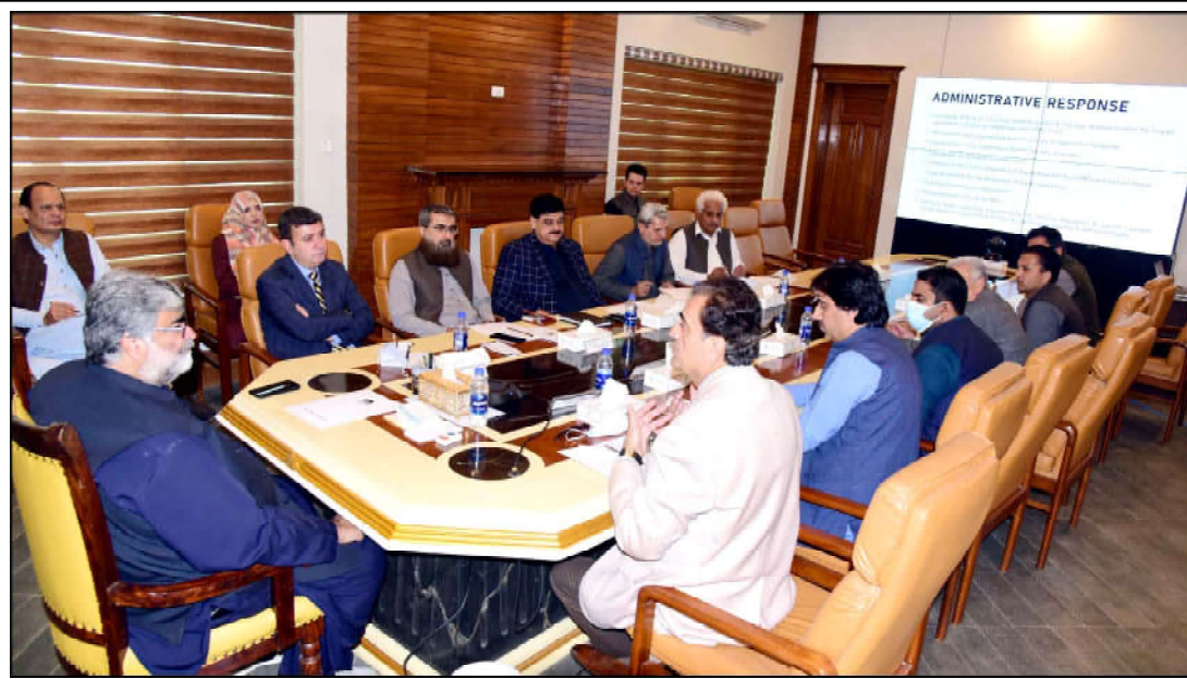
QUETTA: Caretaker Chief Minister Balochistan Mir Ali Mardan Khan Domki presiding over a high level meeting regarding Congo virus situation in Balochistan

The meeting reviewed the situation of Congo virus besides the measures being taken for its prevention and further spread in Quetta and other parts of the province.