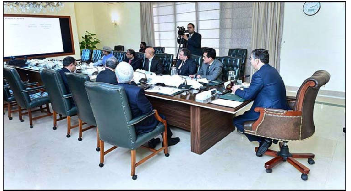
ISLAMABAD: Caretaker Prime Minister Anwaar-ul-Haq Kakar chairs a meeting to review Visa process and facilities given to Sikh Pilgrims.