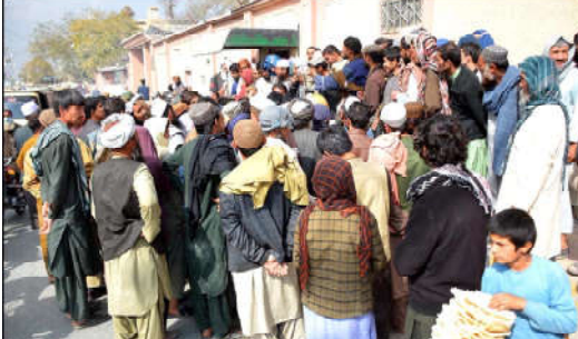
QUETTA: Afghan migrants standing outside afghan consulate.