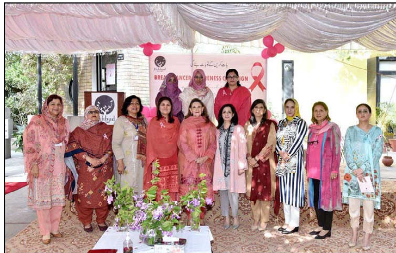
RAWALPINDI: First Lady Begum Samina Alvi in a group photo with medical professionals and survivors of breast cancer during an awareness seminar, at Behbud Association of Pakistan.