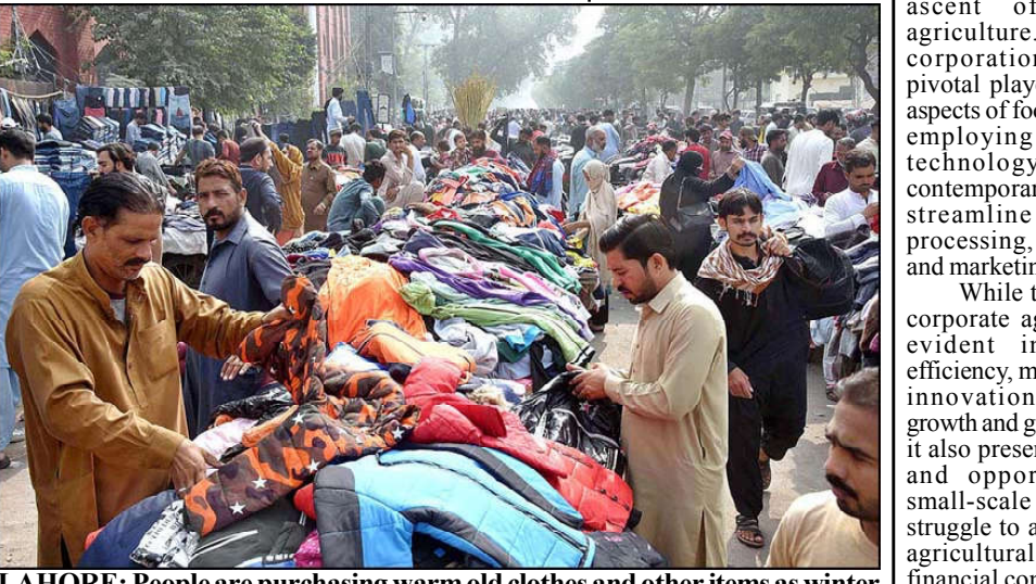
LAHORE: People are purchasing warm old clothes and other items as winter arrives at Empress Road.

He advocates for the is also paramount to equip small farmers with the implementation strategies to assist small latest advancements and knowledge to enhance farmers in navigating the productivity and earn more competitive landscape alongside corporate agriculture. Then there But, it has been commonly witnessed that would also be marketing issues as with bulk production of any commodities the players are swayed in the businessmen and brokers mighty tides of huge would be inclined more.