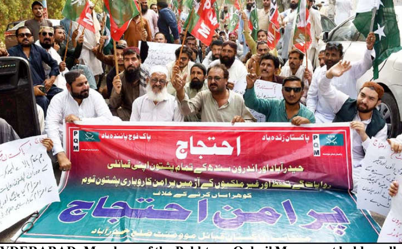
HYDERABAD: Members of the Pakhtoon Qabail Movement hold a rally against harassment from police in the shadow of Afghan Refugees, in Hyderabad.