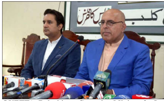
QUETTA: Balochistan Caretaker Minister for Information, Jan Achakzai addresses to media persons during press conference, at Quetta press club.