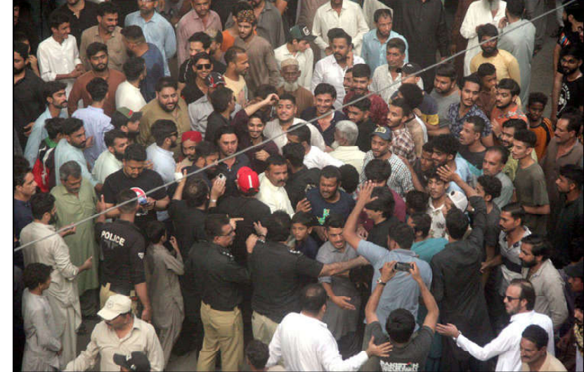
KARACHI: Workers of political parties chanting slogans outside a polling station after polls closed during local government by-election for Chairman and vice Chairman, in Provincial Capital.

LAHORE (APP): Two procedures and said that Election Commissioner of cases of kidney transplant Sindh Eijaz Anwar Chohan were visited different polling completed by using the latest procedures at Jinnah stations of the metroplis to review security Hospital.