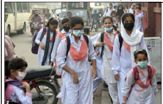
LAHORE: Students wearing facemasks arrive at a school in Provincial Capital, following Punjab's government announcement to use facemasks in schools due to severe smoggy conditions.

He commended the Saudi government's initiative to establish official funds for aiding the Palestinian population, reflecting the strong stance of Saudi Arabia in supporting their Palestinian brethren. He urged Pakistan to follow suit and establish special funds at the government level to assist the Palestinian people. Ashrafi who is also the Special Representative to the Prime Minister on Religious Harmony and Pakistani Diaspora in the Middle East and Islamic Countries.