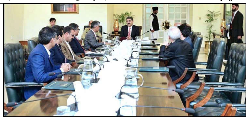
ISLAMABAD: A delegation of the Pakistan Broadcasters' Association called on caretaker Prime Minister Anwaar-ul-Haq Kakar.