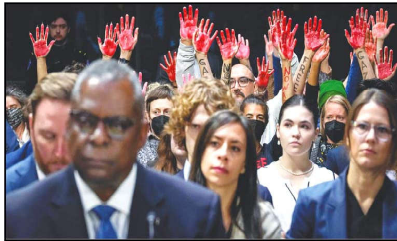
WASHINGTON: US Secretary of Defence Lloyd Austin testifies as protesters calling for a ceasefire in Gaza raise their hands, painted in red, during a Senate Appropriations Committee hearing with Secretary of State Antony Blinken and Austin.