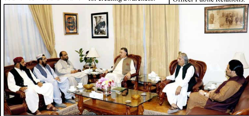
QUETTA: A delegation of Anjuman-e-Tajiran led by its President Abdul Raheem Kakar meeting with Balochistan Governor Malik Abdul Wali Khan Kakar.

Rs 15,789 billion, adding that the share of the federal government was at Rs 3,750 billion, the provincial governments Rs 7.56 billion, while Rs 4.47 billion was the farmer's share. The minister was informed that 4 million tons of sugarcane production capacity had been increased, which had a financial benefit of Rs 400 billion, whereas the production capacity of wheat had increased from 28 to 32 maunds per acre, adding that the wheat enhancement project was initiated with a cost of Rs 30,455.353 million.