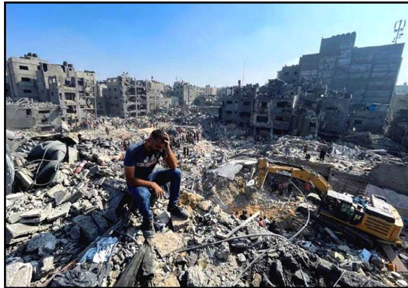
A man reacts as Palestinians search for casualties a day after Israeli strikes on houses in Jabalia refugee camp in the northern Gaza Strip.

Iran's supreme leader Ayatollah Ali Khamenei urged Muslim countries to halt trade with Israel, including oil exports, in response to its bombardment of Gaza.