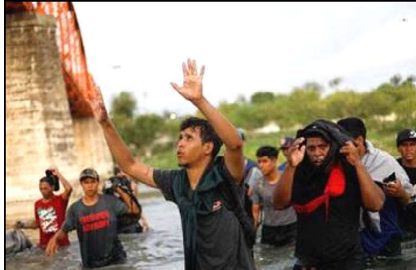
A Venezuelan migrant thanks God as he walks through the Rio Grande river in an attempt to seek asylum into the U.S., as seen from Piedras Negras, Mexico.

"It's a horrible feeling not knowing where they are," she added mournfully. "We haven't had any support from any authority either, from the government, nothing."