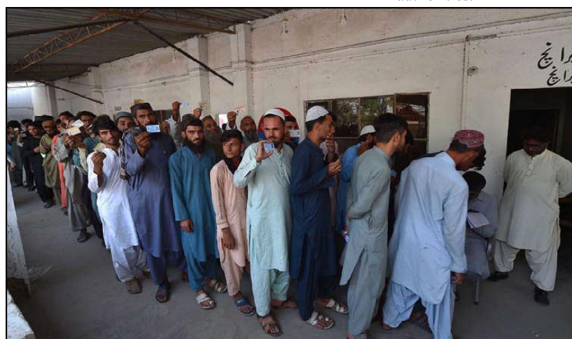
KARACHI: Police officers detain immigrants, who fail to provide legal documents, during a search operation against illegal immigrants at a neighborhood of Karachi.

The Punjab government has taken action to combat smog by making it mandatory to spray water near construction sites and development projects. Furthermore, farmers have been encouraged to refrain from burning crop residues and dispose of them in an environmentally friendly manner. The Punjab government has requested the prime minister to engage with the Indian government on the issue, highlighting its impact on both sides of the border.