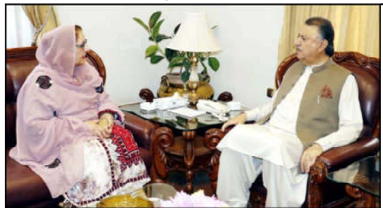
QUETTA: Former Federal Minister Zubaida Jalal meeting with Balochistan Governor Malik Abdul Wali Khan Kakar.

Pakistan and New Zealand would square off against each other on Saturday at the M. Chinnaswamy.