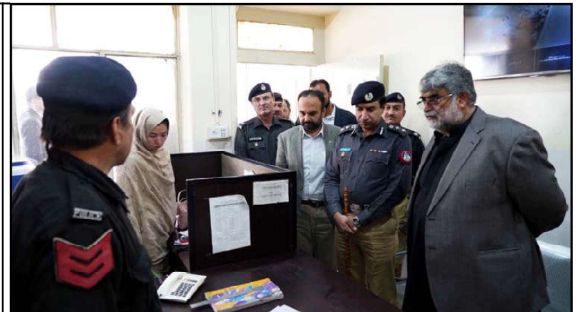
QUETTA: Caretaker Chief Minister Mir Ali Mardan Khan Domki inspecting the complaint centre during his visit to Qaidabad Police Station.