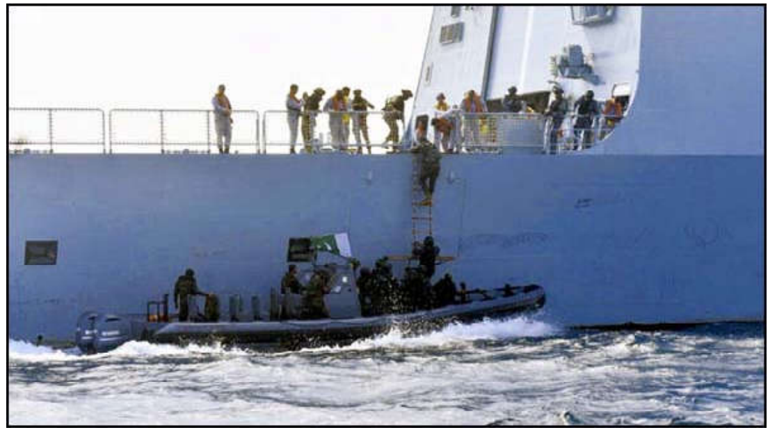
KARACHI: Pakistan Navy Special Service Group and Qatari Naval Special Forces demonstrating Counter Piracy Operation during Joint Naval Exercise MUHARIB AL-BAHR VI, held in Karachi.

The Israeli military announced the death of another soldier in Gaza fighting, bringing to 17 the number killed since ground operations were expanded on Friday.