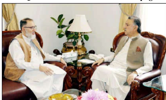
QUETTA: Caretaker Provincial Minister Prince Ahmed Ali meeting with Balochistan Governor Malik Abdul Wali Khan Kakar.