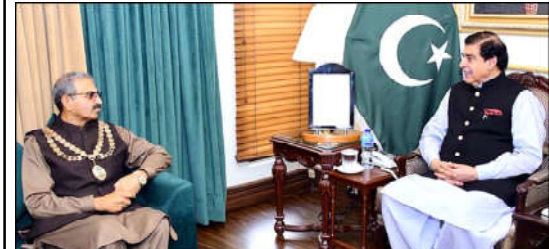
ISLAMABAD: Speaker National Assembly Raja Pervez Ashraf in a meeting with Mayor of the London Borough of Hounslow Councillor Afzal Kiyani.

Both suspects were arrested red-handedly by the authorities during the joint operation, FIA officials said.