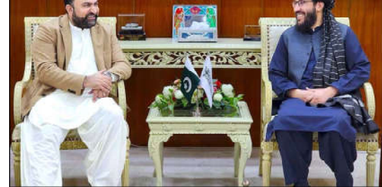
documented Afghans in the country more time to leave as pressure mounts at border posts swarmed by thousands of returnees fleeing.

Afghanistan's Taliban government on Wednesday urged Pakistan to give un-