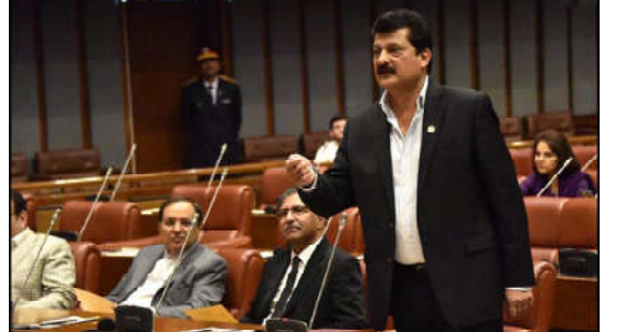
ISLAMABAD: Opposition Leader Senator Dr. Shehzad Waseem speaking during Senate session.

Dr Saqib made these remarks during his address at the 3-day International conference on "Advancing Islamic Finance" - Principles, Practices, and Regulatory Framework for Sustainable Growth. The conference was organized by Allama Iqbal Open University (AIQU), Centre for Excellence in Islamic Finance (CEIF) and Institute of Management Sciences (IMC) Peshawar. Dr Amjad Saqib noted that BISP was providing financial assistance to 9.3 million deserving families through the Benazir Kafaalat programme. Additionally, children from these needy families are receiving education under the Benazir Taleemi Wazaif initiative.