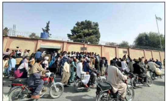
QUETTA: Afghan families gather at Afghan Consulate to register themselves for returning to their homeland, in Quetta.

He also directed them to maintain the environment of trust between police and public.