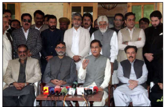
Lashkari Raisani to join the PML-N.

Sardar Ayaz Sadiq invited Nawabzada Lashkari Raisani for joining the