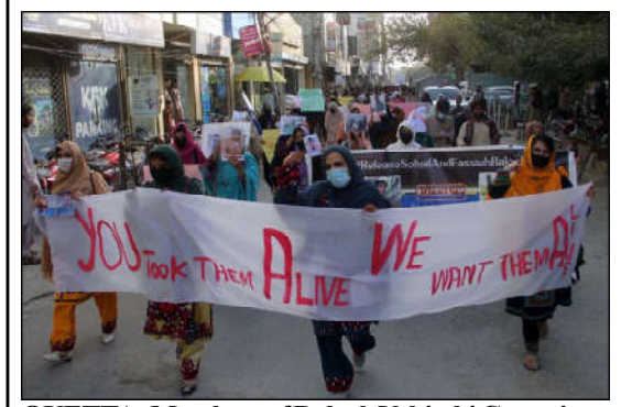
QUETTA: Members of Baloch Yakjethi Committee are holding protest rally for recovery of missing persons as soon as possible, at Quetta press club.

She said the government was also engaged with a number of countries, including the United States, with respect to Afghan individuals who were to be resettled in third countries.