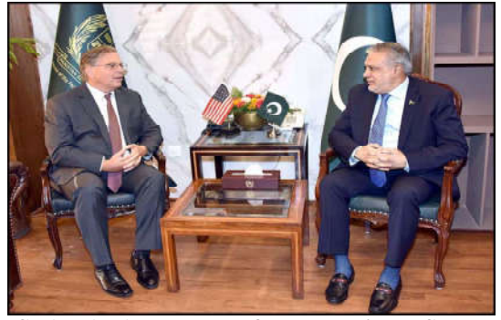
ISLAMABAD: Leader of the House in the Senate, Senator Mohammad Ishaq Dar exchanging views with Ambassador of United States, Mr. Donald Blome at Parliament House.

ISLAMABAD (APP): Chairman Senate and Founding President of the International Parliamentarians Congress (IPC), Muhammad Sadiq Sanjrani here on Thursday presided over a meeting to assess the progress and developments of IPC. During the meeting, attended by IPC and Senate officials, thorough and detailed deliberations took place. The deliberations culminated in a decision to proceed with the election of the President of IPC. The official election schedule is set to be announced in December 2023.