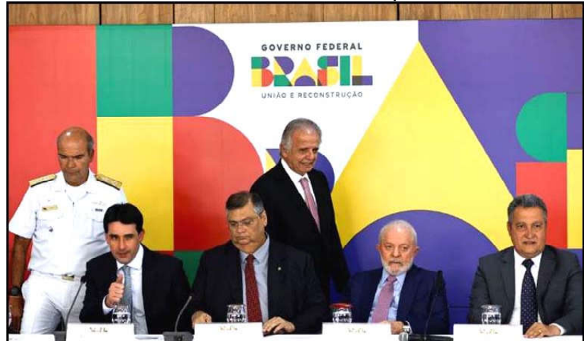
Brazil's president Luiz Inacio Lula da Silva looks on during a press conference at the Planalto Palace in Brasilia, Brazil.

"The United States calls on the warring parties to immediately cease further attacks in and around El Fasher to uphold their obligations under international humanitarian law concerning civilians," Blinken said in a statement released by the State Department.