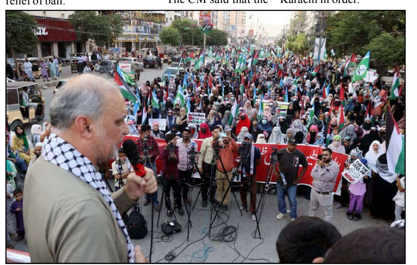
KARACHI: Leaders and members of Jamat-e-Islami (JI Women Wing) are holding protest demonstration against Israeli cruel and inhumane acts and express unity with the innocent people of Palestine, held at Nazimabad Five Star roundabout in Karachi.