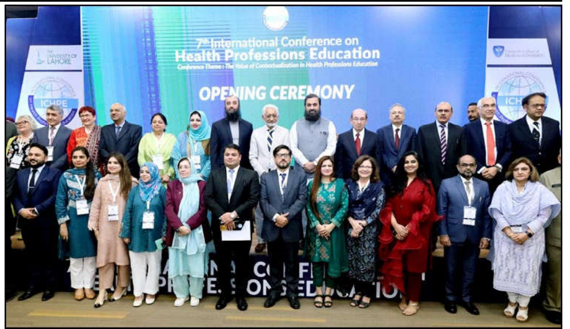
LAHORE: Governor Punjab Muhammad Balighur Rehman in a group photo with participants of 7th International Health Professions Education Conference at University of Lahore.