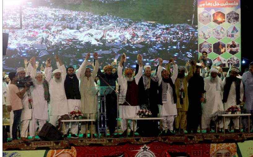
KARACHI: Jamiat Ulema-e-Islam (JUI-F) Chief, Maulana Fazal-ur-Rehman along with others leaders joints hand with each other to express solidarity on stage during the Al-Aqsa Palestine Conference against Israeli cruel and inhumane acts and express unity with the innocent people of Palestine, held at Shahrah-e-Quaideen road in Karachi