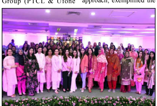
4G) in collaboration with Pink Ribbon Pakistan has led a month-long campaign Group's commitment to empowering individuals in their fight against breast