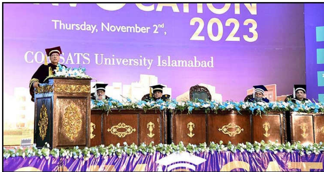
ISLAMABAD: President Dr Arif Alvi addressing the 26th Convocation ceremony of the COMSATS University.