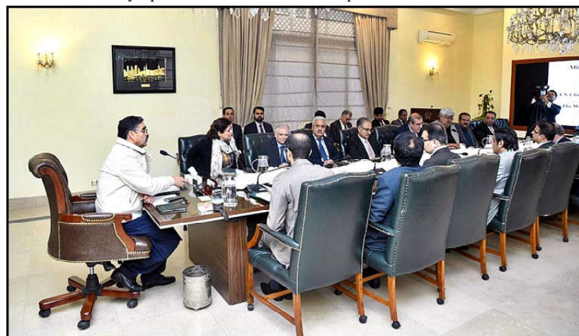
ISLAMABAD: The Caretaker Prime Minister Anwaar-ul-Haq Kakar chairs a meeting on preparations with regard to COP-28.