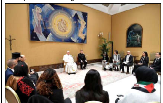
Pope Francis meets with Palestinians whose relatives are stranded in Gaza, amid conflict between Israel and the Palestinian Islamist group Hamas, at the Vatican.

Both sides should work together to promote "positive" and "friendly" mutual understanding, said Cai, also the five-ranked member of the CPC's seven-person Politburo Standing Committee, the highest tier of political power in China helmed by President Xi Jinping. The visit came on the heels of rare face-to-face talks between Xi and Japanese Prime Minister Fumio Kishida, also LDP's leader, on the sidelines of an Asia Pacific Economic Cooperation (APEC) summit.