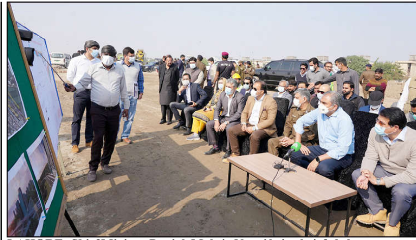
LAHORE: Chief Minister Punjab Mohsin Naqvi being briefed about progress on Walton Road and ADA drain remodeling & upgradation, Cavalry underpass and Centrepoint to Walton Road CBD Punjab Quaid District projects.

During the seminar, the students presented reports highlighting the significance of voting in a democratic society. District Election