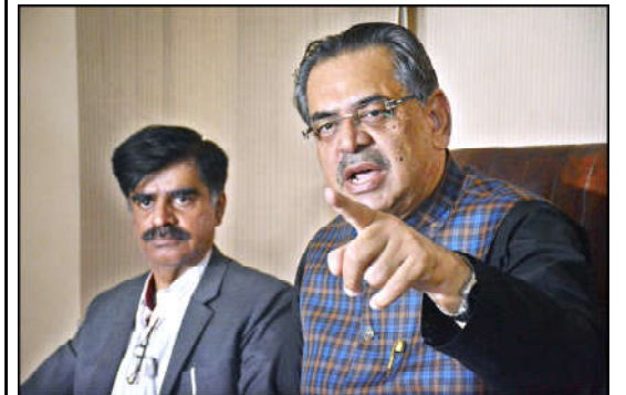
KARACHI: Federal Minister for Religious Affairs and Interfaith Harmony Aneeq Ahmed addressing a news conference at Haji Camp.

IHC while rejecting ministers committee report set up for recovery of missing persons remarked we will issue notice to caretaker PM.