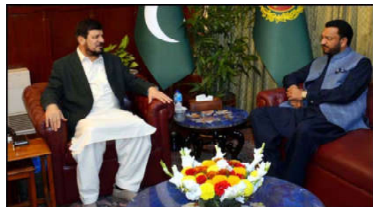
PESHAWAR: Caretaker Federal Minister for Human Rights Khaili George meeting with Khyber Pakhtunkhwa Governor Haji Ghulam Ali.

Hydropower plants can not only meet the needs of electricity in the province.