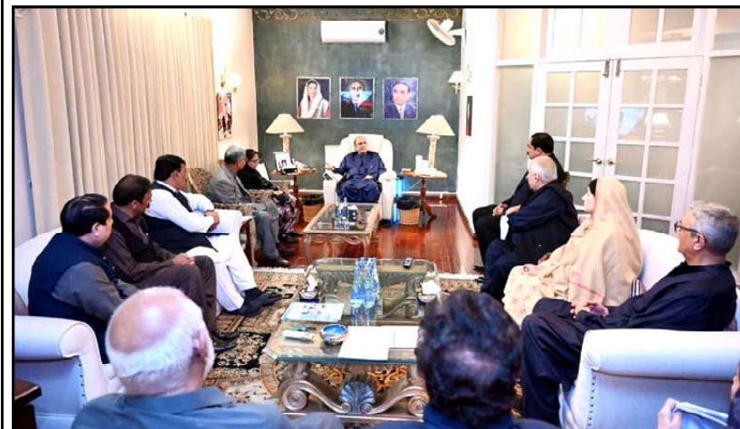
ISLAMABAD: Peoples Party (PPP) President, Asif Ali Zardari exchanging views with a PPP delegation from Punjab during meeting held in Islamabad.