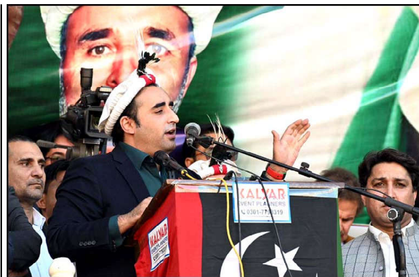
CHITRAL: Peoples Party (PPP) Chairman, Bilawal Bhutto Zardari addresses to his workers during Workers Convention held in Chitral.

He said the February 8 election would bring success to PPP.