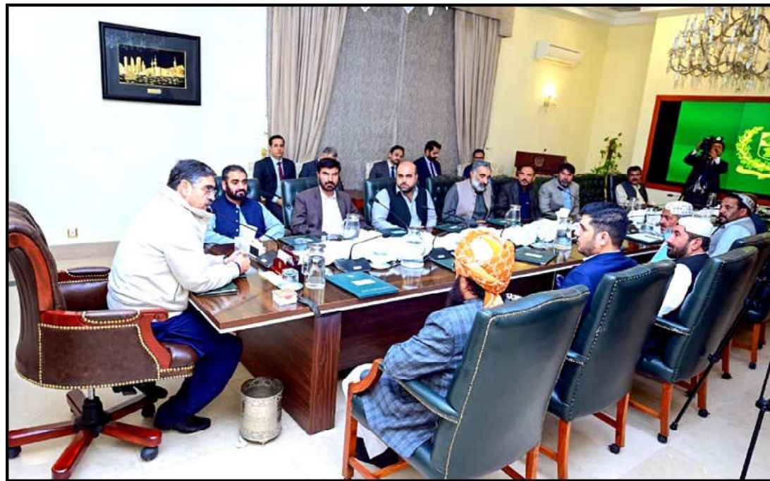
ISLAMABAD: A delegation of the Zameendar Action Committee of Balochistan called on Caretaker Prime Minister Anwaar-ul-Haq Kakar.