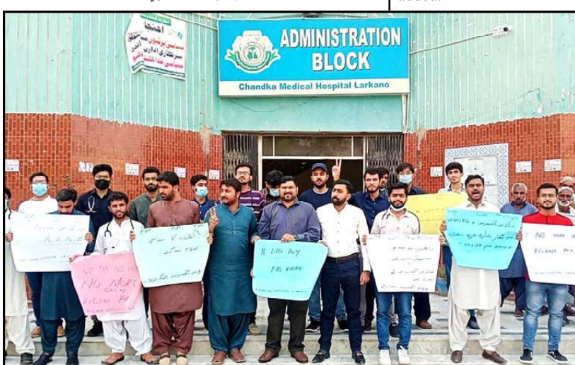
LARKANA: Members of Young Doctors Association (YDA) are holding protest demonstration for demanding immediate release of their five-month house job salaries, outside the Administration Block of Chandka Medical Hospital in Larkana.

The 100% drop-in SAF used on today's flight includes renewable aromatics and closely mimics the characteristics of conventional jet fuel. This is the first time that drop-in SAF has been used on an A380 aircraft, with the expectation of full compatibility across the aircraft's existing systems.