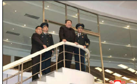
North Korean leader Kim Jong Un watches conditions of a satellite at a satellite control center in Pyongyang.

South Korea's military said North Korea's military reconnaissance satellite was believed to have entered orbit, but it would take time to assess whether it was operating normally.