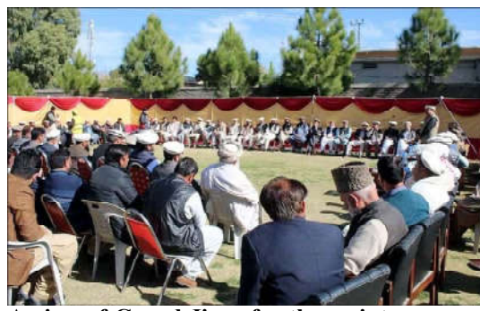
A view of Grand Jirga for the maintenance of regional law and order and negotiations between the parties in Sada, Lower Tehsil Headquarters of the tribal district of Kurram.

R e g a r d i n g the repatriation of the Afghan business community at refugees, the Governor said that it was the decision of the state must be accepted by everyone, adding that Pakistan and Afghanistan are two Islamic brotherhood countries and to ensure the maintenance Pakistan has hosted Afghan of law and order for refugees for more than