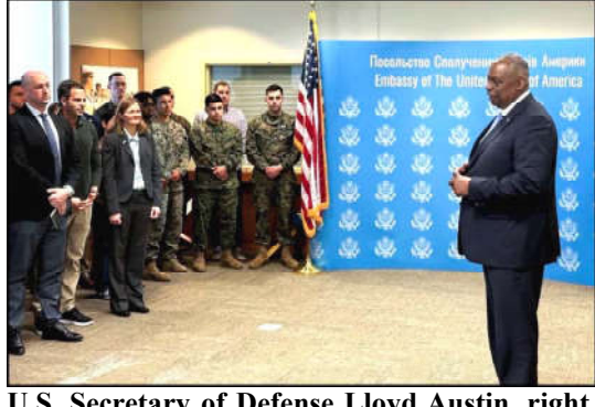
U.S. Secretary of Defense Lloyd Austin, right, speaks to employees of the U.S. embassy in Kyiv.

Monitoring Desk UNITED NATIONS: A joint UN team, led by the World Health Organisation (WHO), discovered evident signs of shelling and gunfire at Al Shifa Hospital in Gaza, designating it a "death zone". The hospital, with 24 health workers and 291 patients, including 32 critically ill infants, is no longer operational, resulting in recent patient deaths. Due to time limits associated with the security situation, the team spent only an hour inside the hospital, describing it as a "death zone", and the situation as "desperate". "Signs of shelling and gunfire were evident. The team saw a mass grave at the entrance of the hospital and was told that more than 80 people were buried there," said a WHO report released on Sunday. "Patient deaths have occurred over the previous two to three days due to the shutdown of medical services," it said. "Lack of infection control measures and antibiotics has resulted in severely infected wounds, particularly in trauma patients," it added. The report expressed deep concern, urging immediate efforts to restore functionality to Al Shifa and other hospitals.