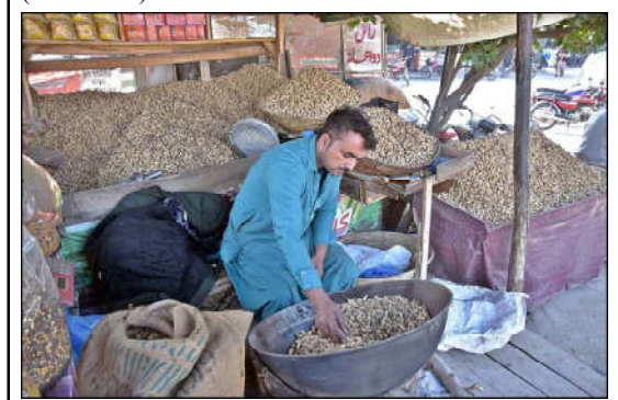
RAWALPINDI: A vendor displaying peanuts to attract the customers at Rawat.