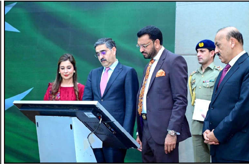
ISLAMABAD: The Caretaker Prime Minister Anwaar-ul-Haq Kakar launches ZARRA mobile app on the eve of Universal Children's Day

The government and non-government organizations and the society as a whole should contribute towards the noble cause of safeguarding the children rights and to make their future safe and prosperous, he added.