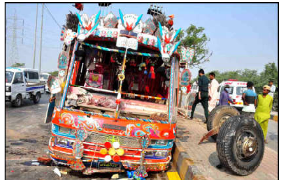
KARACHI: A view of the broken passenger bus after accident at Kolachi road due to over speeding in Provincial Capital.

Children's Day was not only a celebration of having an international treaty to endorse children's rights but a reminder for all of us that children were our future and we needed to do everything possible to ensure their well-being. He said that the Sindh Government was paying attention to ensuring quality education in the schools. He said that the provincial government also allocated a huge amount for education, particularly for girls' education and their health as well as adding that it was a matter of immense pleasure for him that SRSO and the Education Department had a keen interest in observing the Universal Children's Day.