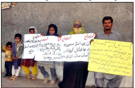
HYDERABAD: Residents of Dadu are holding protest demonstration against high handedness of police, at Hyderabad press club.

It is said in written order that Punjab government is taking steps regarding working from home on 2 days in the week. The word of gym closure is suspended in the notification. In the written order of the court, it is said that the meteorological department should take departmental action against officers who do not take action against smog.