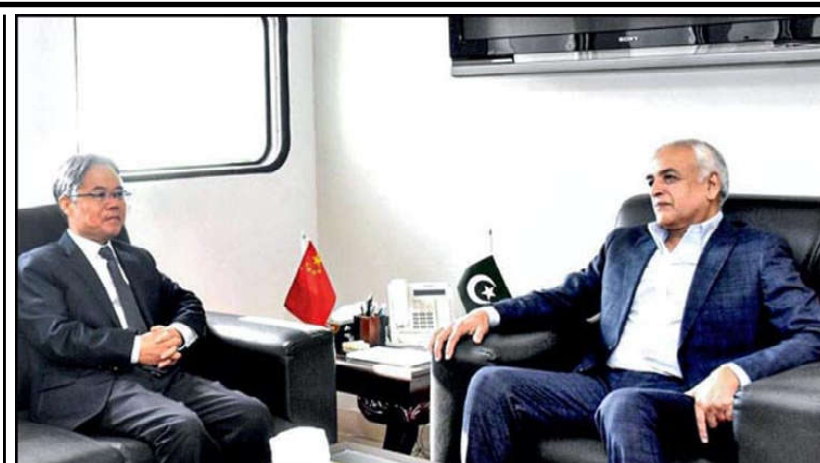
ISLAMABAD: Federal Minister for Communications, Railways & Maritime Affairs Mr. Shahid Ashraf Tarar hosting a meeting with Chinese Ambassador Mr. Jiang Zaidong at the Ministry.