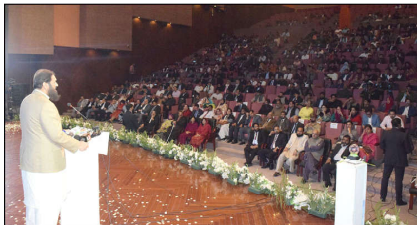
LAHORE: Governor Punjab Muhammad Balighur Rehman addressing the closing ceremony of All Punjab Universities Innovation Expo 2023 organized by the Punjab Higher Education Commission and provincial universities.

projects and ideas, adding that this platform will foster new opportunities for them. He said that the young population is the demographic dividend of the country, and we should capitalise on it. He further said that Pakistani youth are very talented. Governor Punjab said that in 2013-18, the funding of research grants of universities was increased. The laptop scheme yielded good results. This reduced the digital divide and created E-employment opportunities for the youth. He said that Pakistani youth have made a name for themselves in gaming apps in the world.