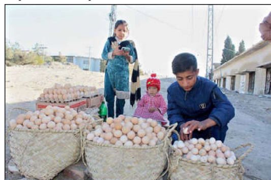
QUETTA: A school-going boy selling eggs to support his family at a roadside near Koyla Patkha.