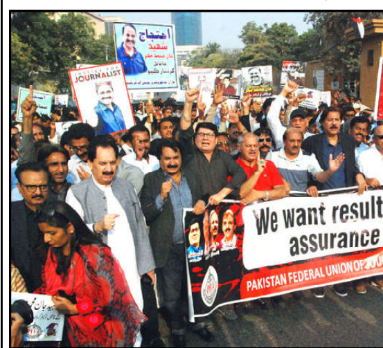
KARACHI: Activists of Pakistan Federal Union of Journalists holds protest rally in the favor of their demands from Governor House to CM House, in Provincial Capital.