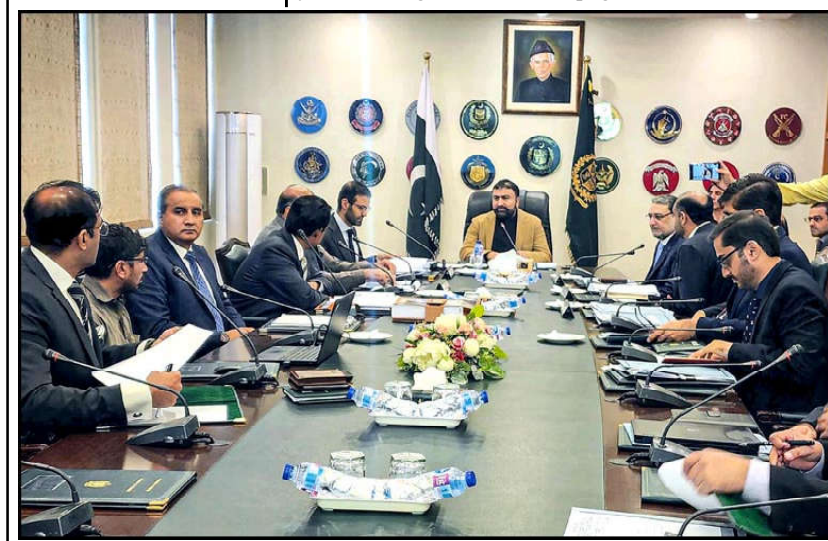
ISLAMABAD: Caretaker Federal Minister for Interior Sarfraz Ahmed Bugti chairing a meeting of ministerial committee on enforced disappearances.

The minister during the visit to the National Institute of Cardiovascular Disease (NICVD) also urged the doctors and allied health care staff to provide better medical services to the people by exhibiting more responsibility in pursuance of initiatives of the Sindh government, said a statement issued here.