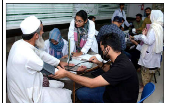
KARACHI: Patients are being examined by doctor during the free medical camp, at Nimat Begum Hamdard University Hospital located on Nazimabad area in Karachi.

He said that our priority is to provide relief to the citizens, so it is necessary to make an effective plan for the purpose. The company officials said in the briefing that they have formulated a strategy for cleaning, in which they have given priority to taking garbage from the house so that the garbage does not reach the waste areas. They said that the company would ensure the disposal of waste and that the operation would be started in all the zones after the resources were available.