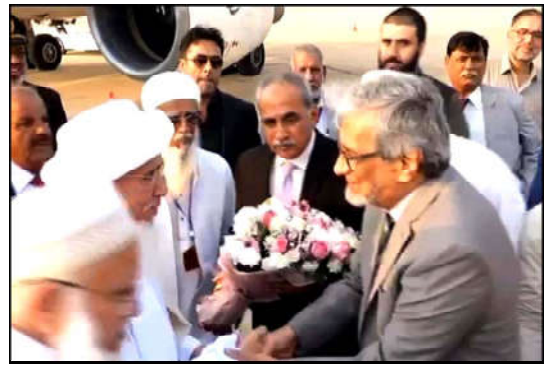
KARACHI: Caretaker Sindh Chief Minister, Justice (Retd) Maqbool Baqar received the Mufaddal Saifuddin, Spiritual Leader of the Dawoodi Bohra Community upon his arrival, in Karachi.

He said that Pakistan was one of the leading countries in climate change negotiations and the UAE was hopeful that Pakistan would play its part in ensuring the success of COP-28. The caretaker prime minister congratulated the UAE for hosting the important global climate change conference and assured of Pakistan's active participation in the event.