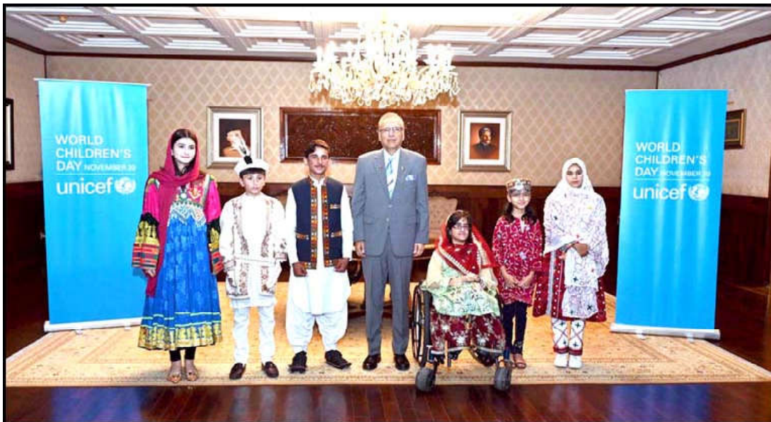
ISLAMABAD: President Dr. Arif Alvi in a group photo with a delegation of children representing four provinces, as well as, Gilgit-Baltistan and Azad Jammu and Kashmir nominated by the United Nations Children's Fund (UNICEF) at Aiwan-e-Sadr.