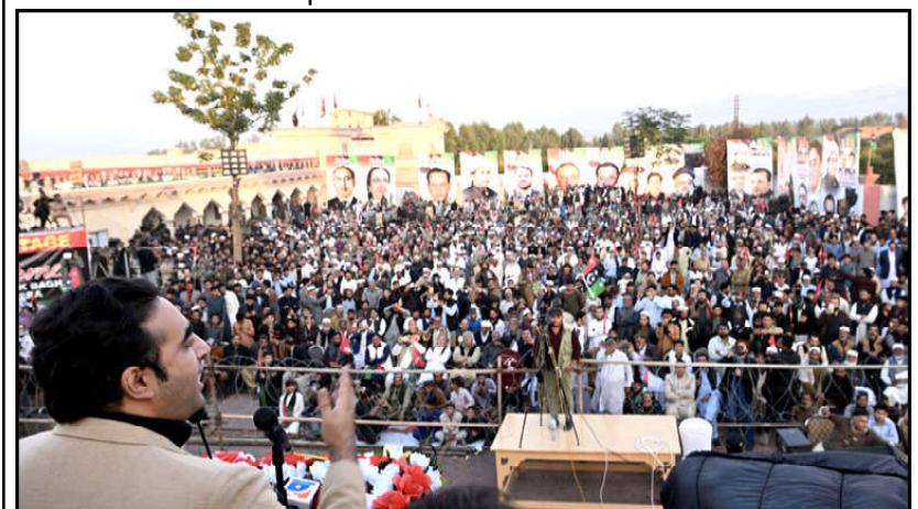
NAUSHERA: Chairman Pakistan People's Party Bilawal Bhutto Zardari addressing to workers convention in City.

Upon the invitation of the government and the community members, Dr. Syedna Mufaddal Saifuddin, head of the worldwide Dawoodi Bohra community arrived in Karachi on Monday 20 November from Sri Lanka.