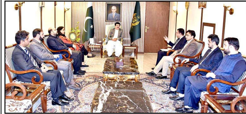
ISLAMABAD: Chairman Senate, Muhammad Sadiq Sanjrani in a meeting with the delegation of Pakistan Humanitarian Forum at Parliament House.

It further asked for promoting skills-based and innovative learning models to provide right to education to out-of-school children and youth with a special focus on girls' education to facilitate life-long learning. The resolution stressed to take steps in order to promote gender equality in education and eliminate disparities by ensuring girls' and women access to quality education, besides eliminating any barriers, impeding their access to education. It further called for launching comprehensive awareness campaigns to inform both urban and rural communities about the significance of education through outreach programmes, workshops, and community events in collaboration with the stakeholders and partners.