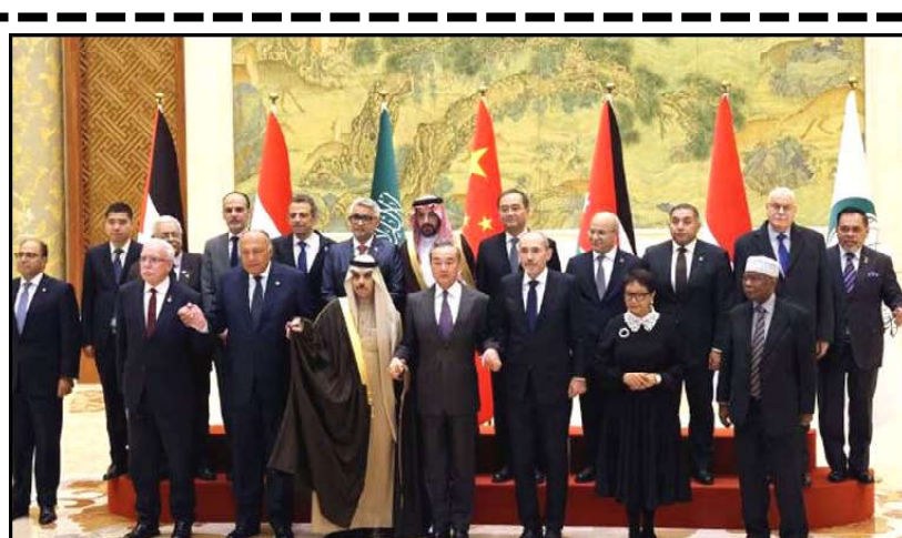
Chinese Foreign Minister Wang Yi attends a family photo session with Saudi Foreign Minister Prince Faisal bin Farhan Al Saud, Jordanian Deputy Prime Minister and Foreign Minister Ayman Safadi, Egyptian Foreign Minister Sameh Shoukry, Indonesian Foreign Minister Retno Marsudi, Palestinian Foreign Minister Riyad Al-Maliki and Organisation of Islamic Cooperation (OIC) Secretary-General Houssein.

not criticized the initial Hamas attack on Oct 7 — which killed about 1,200 people — while the United States and others have called it an act of terrorism. However, China does have growing economic ties with Israel. The Saudi foreign minister, Prince Faisal bin Farhan Al Saud, called for an immediate cease-fire and the entry of humanitarian aid and relief to the Gaza Strip. "There are still dangerous developments ahead of us and an urgent humanitarian crisis that requires an international mobilization to deal with and counter it," he said.