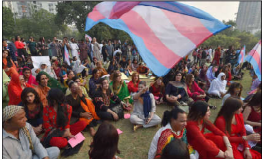
KARACHI: Member of the Trans community take part in Sindh Moorat March.