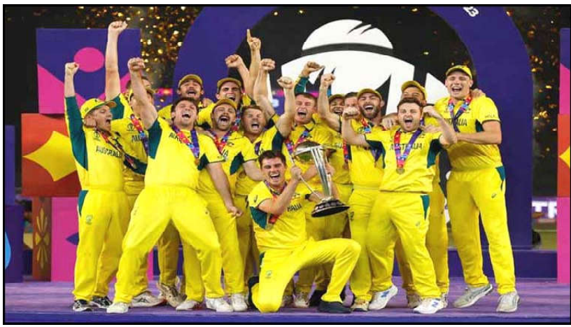
Australia celebrate their sixth men's ODI World Cup win, India vs Australia, Men's ODI World Cup final, Ahmedabad.

"I congratulate Australia for winning the Cricket World Cup 2023 (CWC23)," he said in a post on X, formerly twitter. He also praised phenomenal inning played by Travis Head who scored 137 runs off 120 balls. The prime minister also commended team India for their spirited performance.