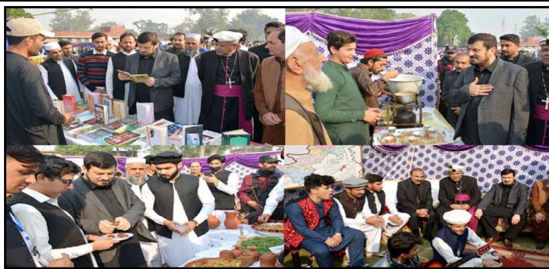
PESHAWAR: Khyber Pakhtunkhwa Governor Haji Ghulam Ali inspecting the various stalls during culture day at Edwards College Peshawar.

RAWALPINDI (APP): The Dadocha Dam will help overcome water shortage in Rawalpindi as after construction of the dam, it would supply 35 million gallons of water per day to Rawalpindi city, said Commissioner Rawalpindi Division, Liaquat Ali Chhatta. He said that water scarcity has become a global problem and different countries are considering different ways to meet the shortage. Pakistan is also one of the countries suffering from a water crisis, the Commissioner said. Due to the non-construction of dams, per capita availability of water here has decreased four times during the last 50 years, Liaquat Ali Chhatta said. Due to the shortage of dams, millions of cuases rainwater is wasted every year or causing floods, he added. The government of Punjab is giving priority to the problem of water scarcity and is paying special attention to the construction of small dams, he said and informed that the approved cost of the dam being built in Dadocha village near Rawat Industrial Estate was Rs 6492 million, which would now be estimated again.