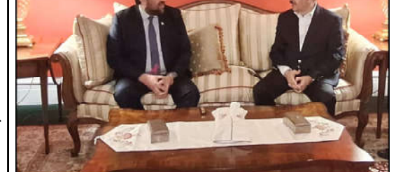
Sindh Governor Kamran Tessori meeting with Pakistani Ambassador Sardar Masood Khan at Pakistani Embassy in Washington.

Pentagon report also revealed the secret of the TTP's use of American weapons against Pakistan. After the American withdrawal on August 30, 2021, $7.12 billion worth of defense equipment remained in Afghanistan, provided 427,300 weapons of war, of which 300,000 remained at the time of withdrawal, after the American withdrawal, these weapons came under the control of the Islamic Emirate and later ended up in the hands of anti-Pakistani groups.