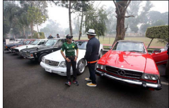
PESHAWAR: Visitors take keen interest in antique vehicles during Annual Vintage and Classic Car Show 2023 held at Services Club Pakistan in Peshawar.

agricultural support. The organization actively engages in sustainable natural resource management, providing humanitarian assistance during emergencies, and collaborating closely with the Pakistani government on policy development.