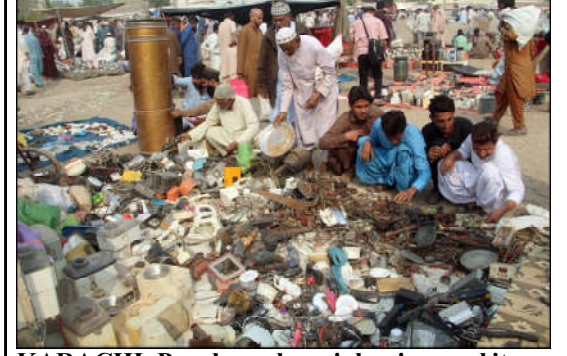
KARACHI: People are busy buying used items in a Sunday weekly bazaar at North Karachi area.