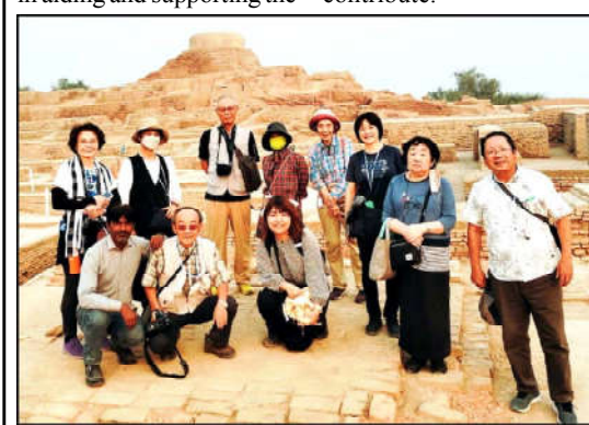
MOHENJO DARO: A tourist delegation from Japan are visiting and expressed keen interest in the historical ruins of the World Heritage Monuments of Mohenjo Daro.