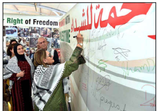
ISLAMABAD: First Lady Begum Samina Alvi visiting the Palestinian stall and expressing her condolences for the martyrs of Gaza, at Pakistan Foreign Office Women's Association's Annual Charity Bazaar.

NAWABSHAH (APP): Children from different child rights clubs have urged the district and provincial governments to invest funds and take extraordinary steps to protect the right to life, survival, health and education in the district. They revealed alarming statistics on education and child welfare in the district. During a seminar organized by Hari Welfare Association (HWA) on the occasion of the Universal Children's Day in Benazirabad here Sunday, the child leaders said that 32 percent of the children were out of school, with 53 percent being girls, primarily due to poverty, lack of