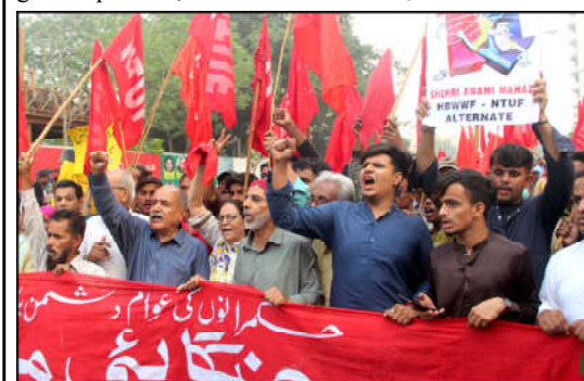
KARACHI: Activists of National Union Trade Federation shouting slogans during protest against inflation in Pakistan, outside press club, in Provincial Capital.

petitive event witnessed Happy Home School - O'Levels Campus securing the first position, closely followed by The Intellect School in second place and The Mama Parsi Girls Secondary School in third. In tandem with the linguistic spectacle, the Art Exhibition on the theme "Illuminating Sindh in 2050: A Vision from My Perspective" showcased an impressive array of creativity, boasting over 800 entries across different categories, spanning classes 1-5, 6-8, and 9-12. A distinguished jury from the Arts Council Karachi meticulously judged the submissions, selecting the top 10 entries from across the province of Sindh. The event was graced by the presence of the Consul General of UAE, who bestowed shields upon the deserving winners.