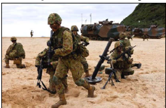
Japanese Ground Self-Defense Force's Amphibious Rapid Deployment Brigade (ARDB) soldiers take part in a marine landing drill as a part of the country's nationwide 05JX military exercises at Tokunoshima island, Kagoshima prefecture, southwestern Japan.