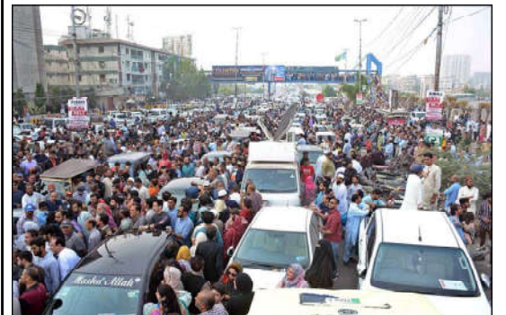
KARACHI: Parents of students waiting outside Expo Centre as the Medical and Dental College Admission Test (MDCAT) 2023-24 is being held.

He also directed the concerned high ups to set up a Centralized Monitoring Cell for the surveillance of those cameras and to put in place a mechanism for direct access of the Chief Minister, Chief Secretary and Inspector General of Police offices to those cameras via IP network. He underlined the need to initiate implementation of this project without any delay and directed the quarter concerned to immediately issue proper directives in written regarding installation of IPCs at all aforementioned offices. He was presiding over a meeting of the Board of Revenue held here at Chief Minister's House.