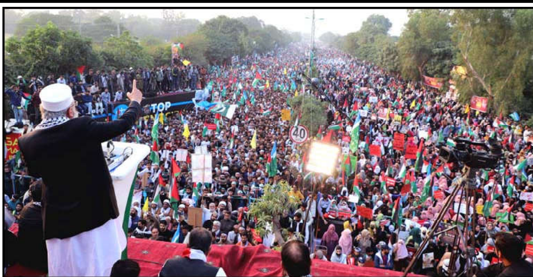
LAHORE: Jamaat-e-Islami Emir Sirajul Haq Addressing the Gaza March in front of Punjab University campus.

thought emphasized the importance of complete cooperation on matters concerning Pakistan. They explicitly declared any armed struggle by groups other than state institutions as forbidden, reassuring the state of their unwavering support, he added. He said Pakistan was actively engaging with friendly nations, including Saudi Arabia, to effectively manage the situation in Gaza adding that Pakistan had not only doubled its aid to Palestine but was also open to considering additional increases to provide further support. Ashrafi emphatically refuted the propaganda, clarifying that there was not placement of security glass between both the Army Chief and the scholars. He emphasized that such misleading information serves as an adversary to Pakistan, aiming to sow chaos within the nation.