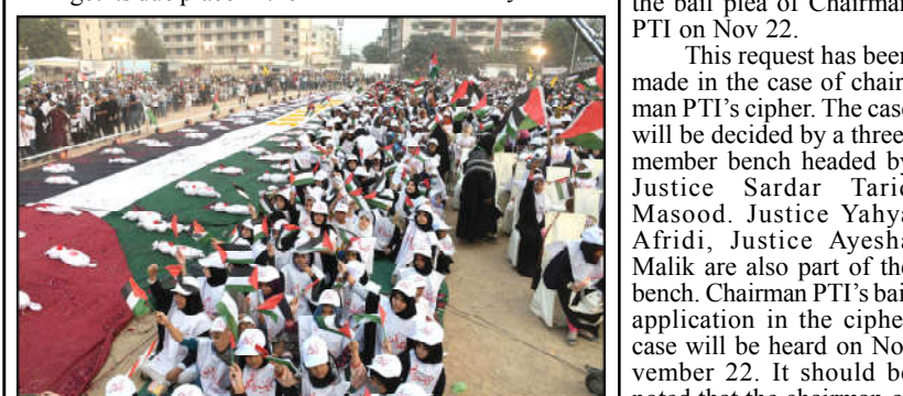
KARACHI: Shiite Muslims chant slogans during a demonstration against Israeli airstrikes on Gaza, and to show solidarity with Palestinian people, in Provincial Capital.