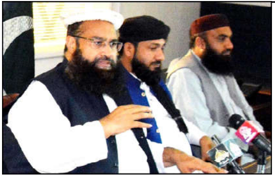
ISLAMABAD: Special representative to PM for Religious Harmony & Islamic Counters and Chairman Pakistan ulema Council Tahir Mehmood Ashrafi addressing a press conference.

The High Commissioner highlighted the ongoing collaboration between the UK and Pakistan under the Financial Accelerator program. "The UK is supporting eight different projects, eight innovative Pakistani enterprises in a climate-friendly way," she explained.