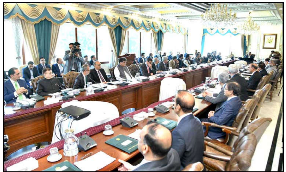
ISLAMABAD: Caretaker Prime Minister Anwar-ul-Haq Kakar chairs the 7th meeting of Apex Committee of SIFC.

The Chief of Army Staff reassured undaunted resolve of the Pakistan Army to backstop government initiatives in various domains for sustainable recovery of the economy.