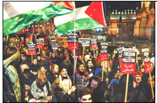
Protesters hold placards and flags during a rally in support of Palestinians, outside the Houses of Parliament in central London.

posted by the president. Cameron said the U.K. would continue to provide moral, economic and diplomatic support "but above all, the military support that you need not just this year and next year but however long it takes." The two-day visit came as Ukraine faces several challenges on and off the battlefield. Zelenskyy has struggled to capture the world's attention as focus has shifted to the Middle East and Israel's war against Hamas. Additional U.S. funding for Ukraine is jeopardized by political fights in Washington and the European Union says it can't provide all the munitions it promised.