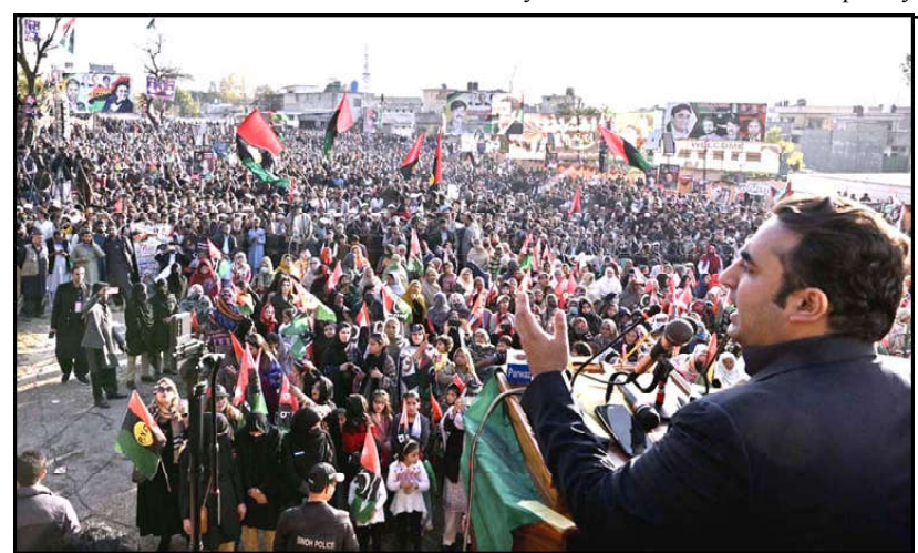
ABBOTTABAD: Chairman Pakistan People's Party Bilawal Bhutto Zardari addressing to workers convention.