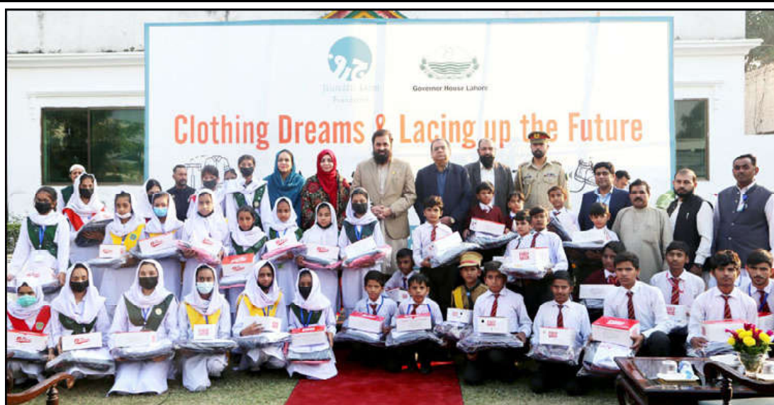
LAHORE: Punjab Governor, Muhammad Balighur Rehman in a group photo with students of Government Boys High School and Government Girls High School established here at Governor House during free uniforms and school bags distribution ceremony.

technology. Governor Ali urged the newly graduated doctors to treat patients with utmost respect and compassion. He highlighted the provincial government's ongoing efforts to bring development to the southern districts of Khyber Pakhtunkhwa. The governor commended the management and faculty members of Gomal Medical College for their dedication to improving academic standards and organizing curricular and extra-curricular activities.