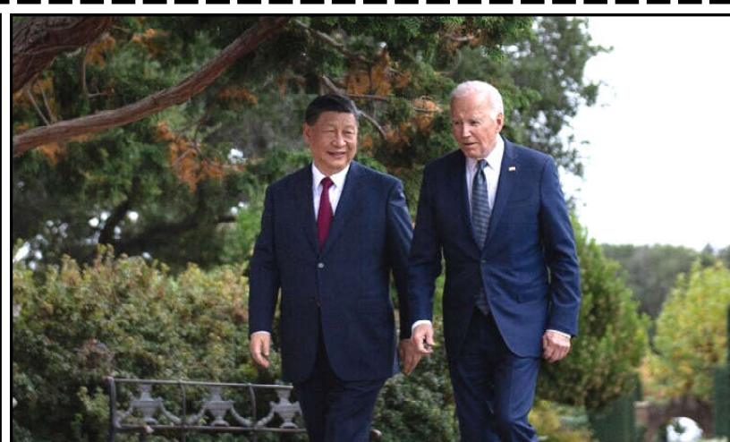
US President Joe Biden and Chinese President Xi Jinping walk together after a meeting during the Asia-Pacific Economic Cooperation (APEC) Leaders' week in Woodside, California.

United States shot down an alleged Chinese spy balloon in February this year. But Biden told a press conference at the Filoli estate that his talks with Xi, whom he has known since 2011, were "some of the most constructive and productive discussions we've had". The United States would compete "vigorously" but "responsibly" with an increasingly assertive China "so it doesn't veer into conflict or accidental conflict," Biden said. "He and I agreed that each one of us could pick up the phone, call directly and we'll be heard immediately."