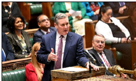
Keir Starmer, leader of Britain's Labour Party, speaks during the Prime Minister's Questions, at the House of Commons in London, Britain.

the Scottish National Party (SNP) motion sought release of Israeli prisoners, end of the Gaza siege and an immediate ceasefire. During the debate, the drama unfolded live as Labour MPs voting for the SNP's ceasefire motion simultaneously tweeted resignations from their frontbench posts. Labour MP and shadow minister for women and equities Yasmin Qureshi was the first to resign from her post as she supported a ceasefire vote.