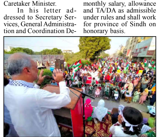
KARACHI: Leaders and members of Jamat-e-Islami (JI) are holding protest demonstration against Israeli cruel and inhumane acts and express unity with the innocent people of Palestine, held at Moach Goth area in Karachi.

In his letter addressed to Secretary Services, General Administration and Coordination De-