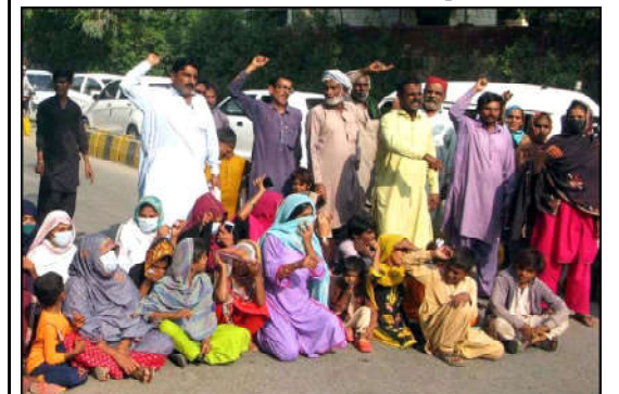
HYDERABAD: Residents of Jamshoro are holding protest demonstration against high handedness of police, at Hyderabad press club.

He added if people seek development, education, health then it is their right. Providing facilities to people is responsibility of government. He remarked we were not ready to join government in 2022. But it was essential to save Pakistan from going default. The speech for resigning by Shahbaz Sharif was ready. I had seen speech.