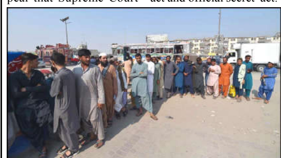
KARACHI: Afghan refugees wait to get registered for verification, in Karachi.

Sindh government has requested for restoration of nullified clauses of army act and official secret act.