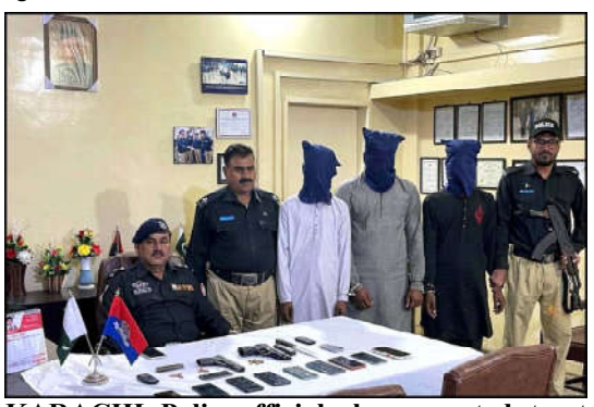
KARACHI: Police officials show arrested street criminals and recovered mobile phones and weapons to media persons during press conference, at Kemari Police Station Dockyard in Karachi.

Commissioner Mirpurkhas Faisal Ahmad Uqaili gave instructions to relevant health departments to make the immunization and polio campaigns as successful as possible to improve the health of defenceless children.