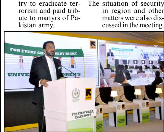
ISLAMABAD: Caretaker Federal Minister for Human Rights, Khalil George, addressing seminar on "Universal Children's Day 2023" and "Child Rights of Invisible Children in Pakistan".

The situation of security in region and other matters were also discussed in the meeting.