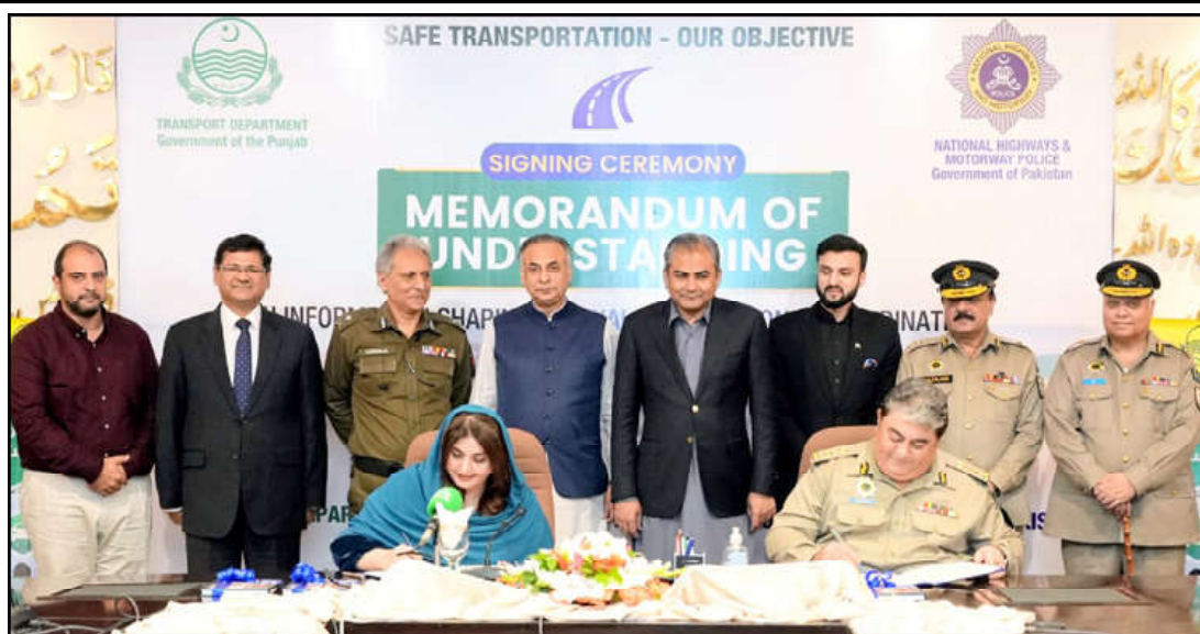
LAHORE: A view of MoU signing ceremony between Punjab government and the National Highways and Motorway Police an environmentally friendly measure to combat smog by restricting the entry of vehicles without fitness certificates and route permits on motorways and highways. Caretaker Chief Minister Punjab Mohsin Naqvi is also present on the occasion.