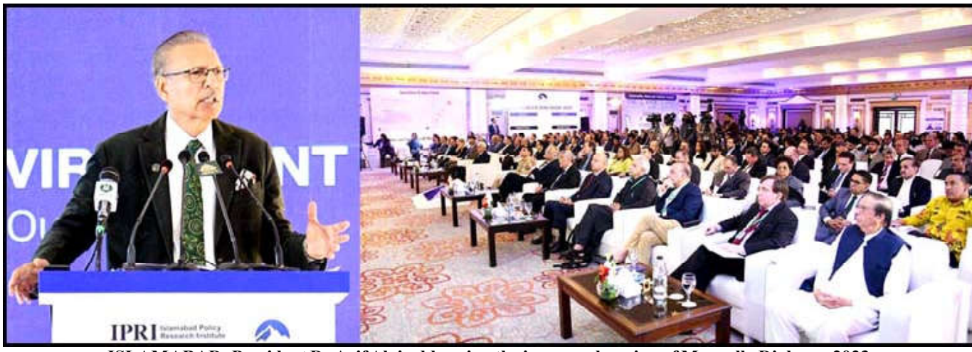
ISLAMABAD: President Dr Arif Alvi addressing the inaugural session of Margalla Dialogue 2023.