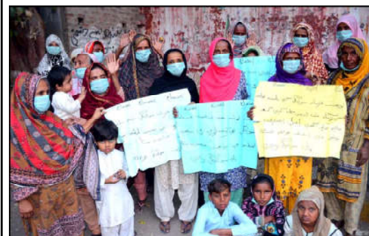
HYDERABAD: Members of Solangi Community are holding protest demonstration against high handedness of Baldia Police, at Hyderabad press club.