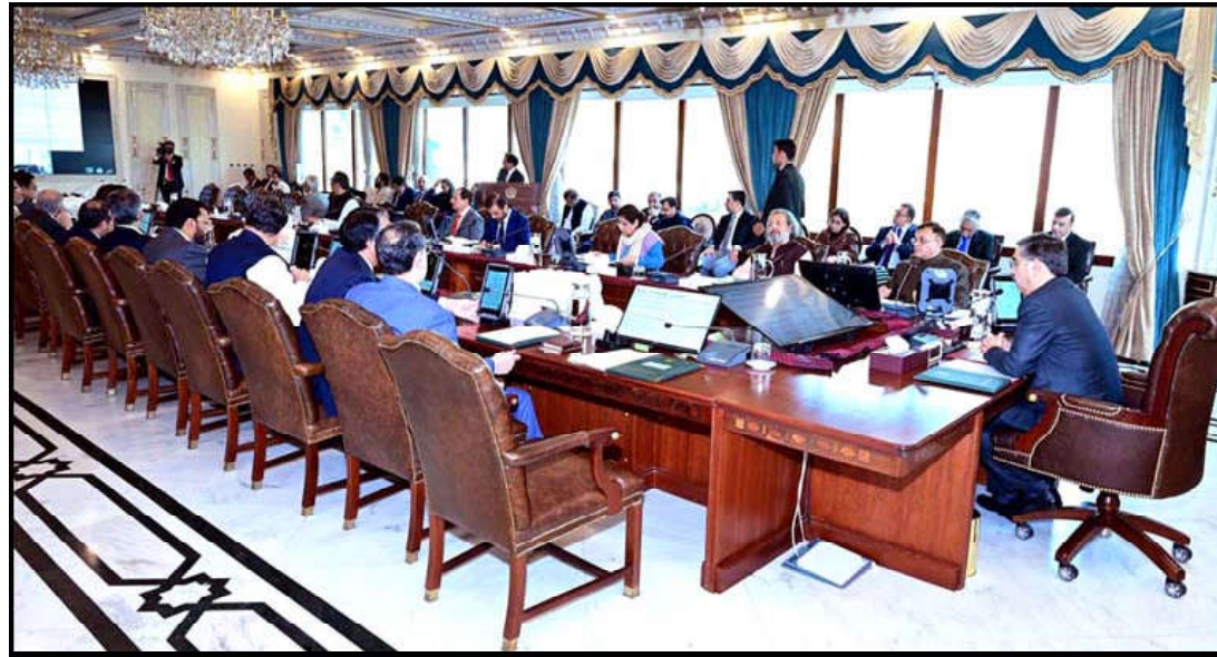
ISLAMABAD: The Caretaker Prime Minister Anwaar-ul-Haq Kakar chairs a meeting of the Caretaker Federal Cabinet.

He said those claiming to be the followers of Prophet Moses, were actually following the footsteps of Pharaoh by killing the children which was "utterly unacceptable."