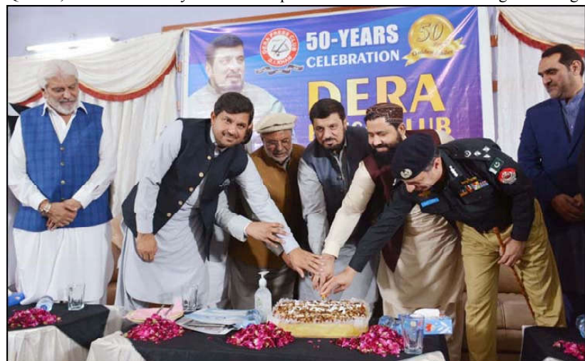
PESHAWAR: Khyber Pakhtunkhwa Governor Haji Ghulam Ali cutting the cake at Dera Press Club (DPC) to celebrate its 'Golden Jubilee'.