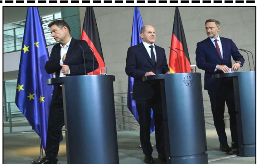
German Economy and Climate Minister Robert Habeck, Chancellor Olaf Scholz and Finance Minister Christian Lindner leave following their comments on the ruling of Germany's Constitutional court that the government's re-location of 60 billion euros ($65 billion USD) of unused debt from the pandemic era to climate fund was illegal, in Berlin, Germany.