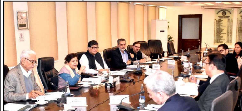
ISLAMABAD: Caretaker Federal Minister for Finance, Revenue and Economic Affairs, Dr. Shamshad Akhtar chaired the meeting of the Cabinet Committee on State Owned Enterprises, in Islamabad.

woman Prime Minister of Pakistan, he added. He underscored, "PPP believes in the power granted by the people and always respects the people's choice." Speaker National Assembly Raja Pervez Ashraf also said that Shaheed Mohtarama Benazir Bhutto made unmatched sacrifices for the continuity of the democratic process in Pakistan. He highlighted that the supremacy of the constitution and the rule of law are also essential for inculcating democratic norms in any society.