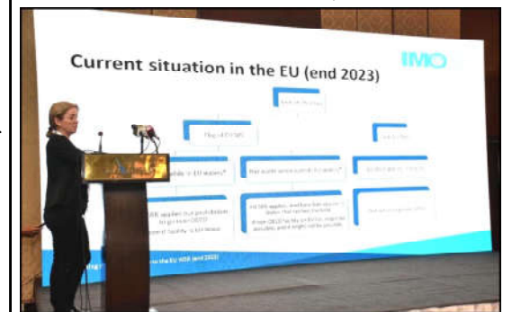
KARACHI: 3rd day of IMO Workshop under Integrated Technical Cooperation Program for Implementation of Hong Kong Convention at Avari Towers.

SUKKUR (APP): The Inter Global Human Development Society (IGHDS), Health Department, Education Department, and PPHI jointly commemorated World Toilet Day to be observed on November 19. The United Nations has designated November 19 as World Toilet Day, urging changes in both behavior and policy on issues ranging from enhancing water management to ending open-air defecation. The basic purpose of observing this day is to raise awareness for accessing proper sanitation and advocate for safe toilets, and forging effective partnerships for the purpose.