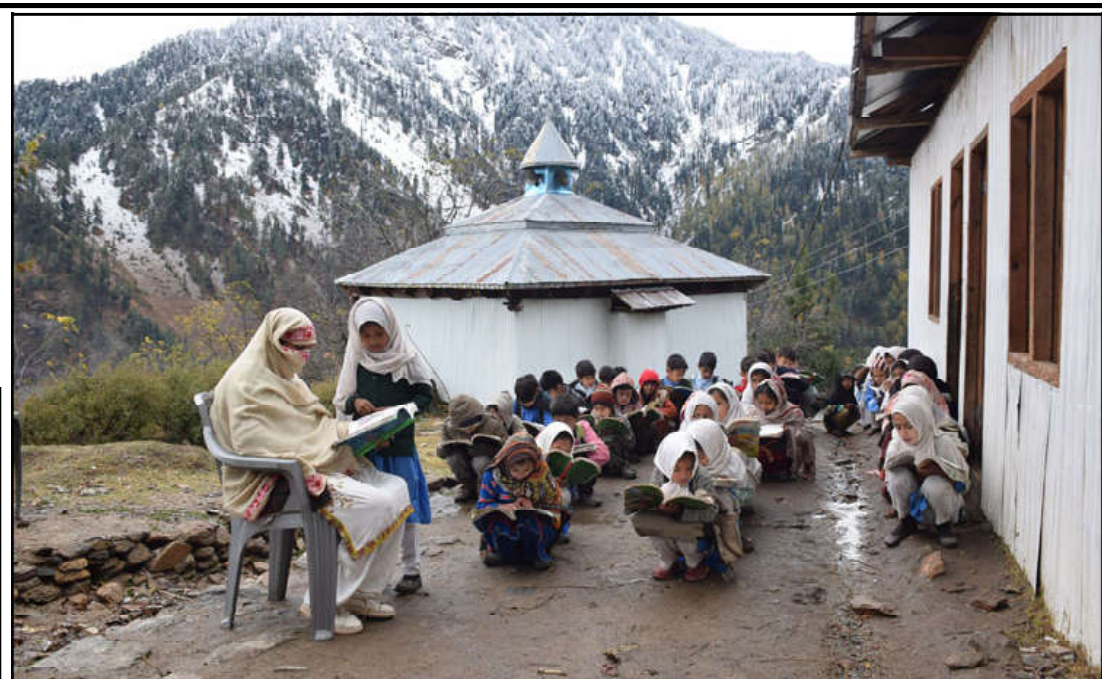
LEEPA VALLEY: Younger girls students are attending class at open air school during the extreme cold weather due to unavailability of school building of Government Girls Primary School Moji Chitya area of the Kashmir.