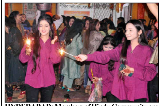
HYDERABAD: Members of Hindu Community are celebrating Diwali Festival held at local Temple in Hyderabad.