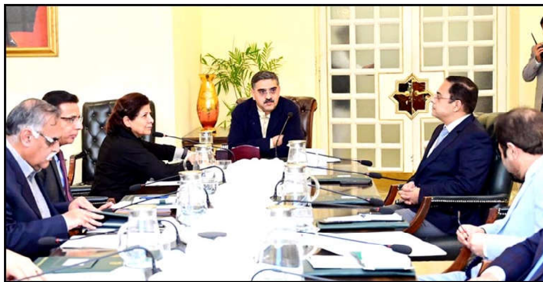
ISLAMABAD: The Caretaker Prime Minister Anwaar-ul-Haq Kakar chairs a meeting on the matters related to the Federal Board of Revenue.

The Secretary of Agriculture briefing the chief minister about the structure and strategy of his department said that it has 12 wings, including Extension, Research, Agriculture Management, Training and Research, Agriculture Marketing, Cane Commissionerate, Cotton Commissionerate, Bureau of Supply and price, Weight & Measures and Planning & Monitoring Cell.