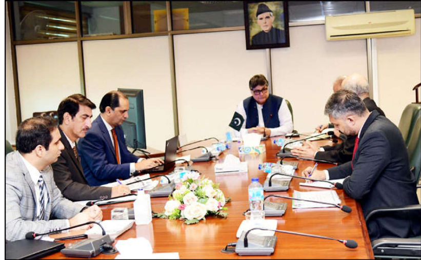
Caretaker Federal Minister for Privatisation Fawad Hassan Fawad chairs a meeting with management of HBFCL.