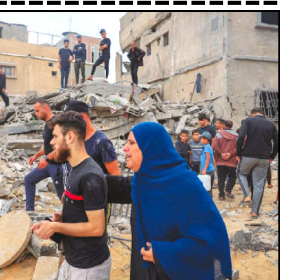
A Woman cries as she stands by the rubble of a destroyed building following Israeli bombardment in Khan Yunis in southern Gaza Strip.

Reuters last week reported that Qatar, where several political leaders of Hamas are based, has been leading mediation efforts between Hamas and Israeli officials over the hostages.