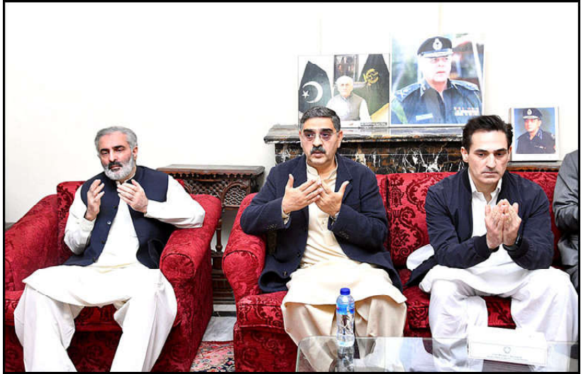
CHARSADDA: Caretaker Prime Minister Anwaar-ul-Haq Kakar offering Fatiha at the residence of late caretaker Chief Minister KP Azam Khan.

important issues were reviewed. The meeting also decided that the new Academic year for Schools will start from April 15 while in Colleges new year will commence from August 01, 2024. The Steering Committee also decided that vacations for summer and winter schedules will remain the same. According to the decision, the annual Examination for Matriculation will commence in the first week of May, and Intermediate exams will begin in the last week of May 2024. The result of SSC part II will be announced on July 31 and the HSC part II result will be announced in the second week of August 2024, the Steering Committee decided.