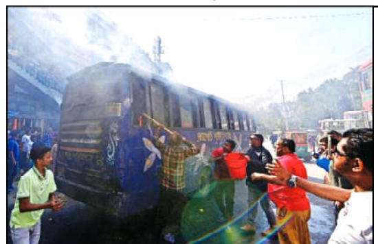
People try to douse a fire inside a bus allegedly torched by protesters during a nationwide transport blockade called by an opposition party, in Dhaka.

Tensions between the Koreas are at their highest point in years as the pace of both North Korea's weapons tests and South Korea's combined military exercises with the United States have intensified in a cycle of tit-for-tat.