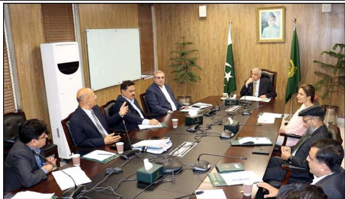
ISLAMABAD: The caretaker Minister for Planning Development & Special Initiatives, Muhammad Sami Saeed chaired a meeting on Public Investment Management Assessment (PIMA) and Climate-PIMA.