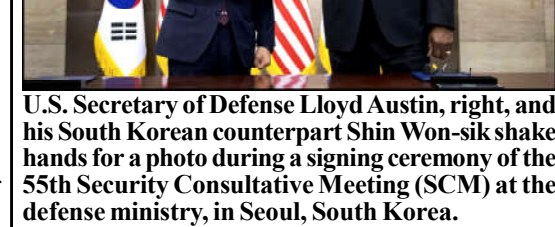
U.S. Secretary of Defense Lloyd Austin, right, and his South Korean counterpart Shin Won-sik shake hands for a photo during a signing ceremony of the 55th Security Consultative Meeting (SCM) at the defense ministry, in Seoul, South Korea.

Fears have intensified for patients and people taking refuge in Al-Shifa and other healthcare facilities in Gaza, and medical aid group Doctors Without Borders warned that without a ceasefire or evacuation the hospital "will become a morgue". Other buildings serving as shelters have also been hit, including a strike on a UN compound in Gaza City that the United Nations Development Programme said caused "a significant number of deaths and injuries."