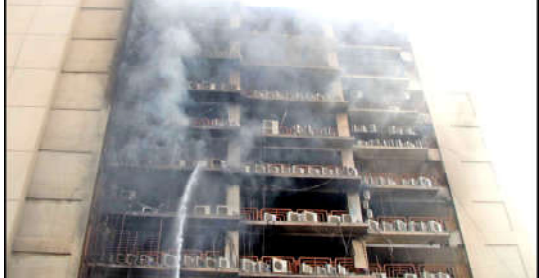
KARACHI: Fire Fighters are busy in fire extinguishing on high rise building t.I.I Chandigarh road in Provincial Capital.

KARACHI (APP): Sindh Rural Support Organization (SRSO) with the support of different partners and sponsors will organize the 14th Sartyoon Sang Crafts Exhibition in Karachi's Ocean Mall from November 1st to 3rd 2023. According to SRSO Spokesperson, Jamil Ahmed, the exhibition will bring a variety of traditional arts and crafts to Karachi. These colourful and captivating products will be the work of thousands of rural women artisans from different districts of Sindh.