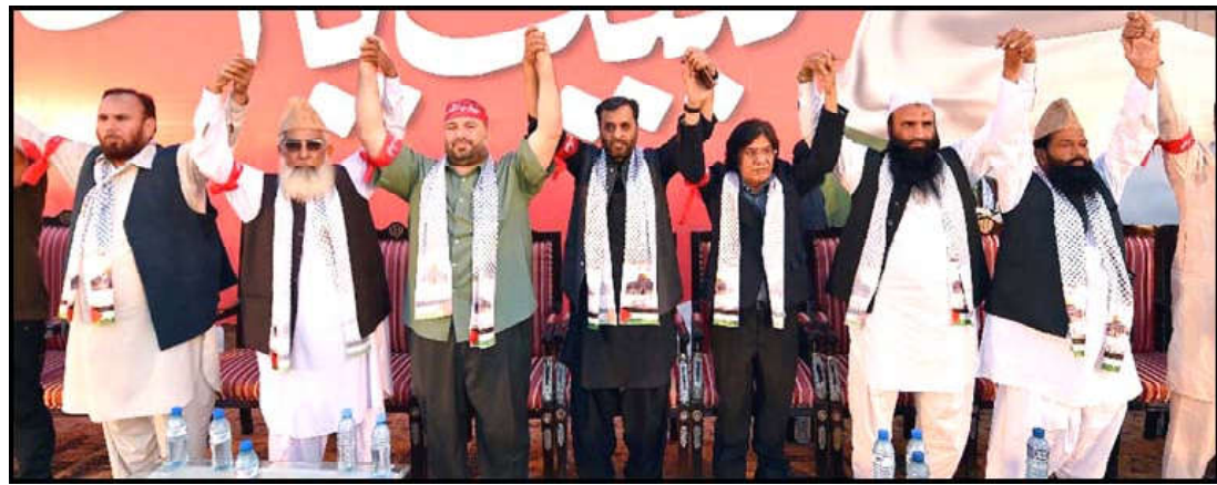
KARACHI: Leaders and members of Pakistan Markazi Muslim League (PMML) are holding protest demonstration against Israeli cruel and inhumane acts and express unity with the innocent people of Palestine, held at Shahrah-e-Quaideen road in Karachi.