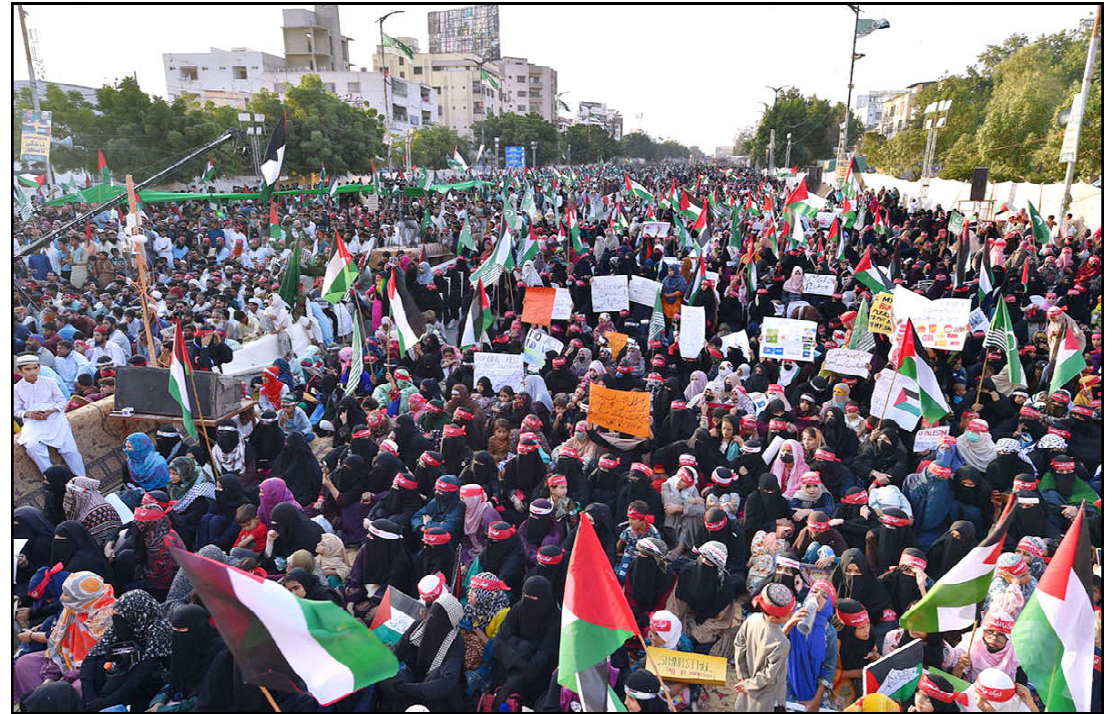
KARACHI: A large number of people participating in the solidarity conference for the people of Palestine organized by Pakistan Markazi Muslim League at Shahra e Quaid.

He also reiterated Pakistan's solidarity and support for the Palestinian people and their right to self-determination.