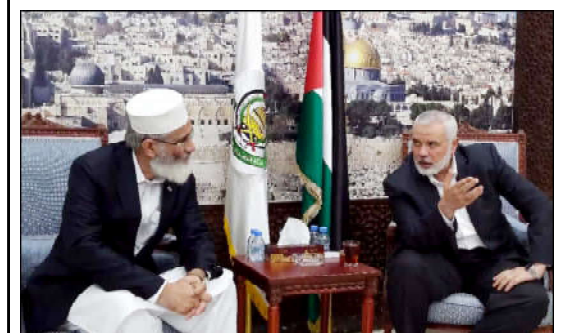
DOHA: Ameer Jamaat-e-Islami Sirajul Haq meeting with Chief of Hamas Ismail Hania.

Siraj-ul-Haq emphasized the joint role of the governments of Muslim countries, including Turkey, to save Gaza.