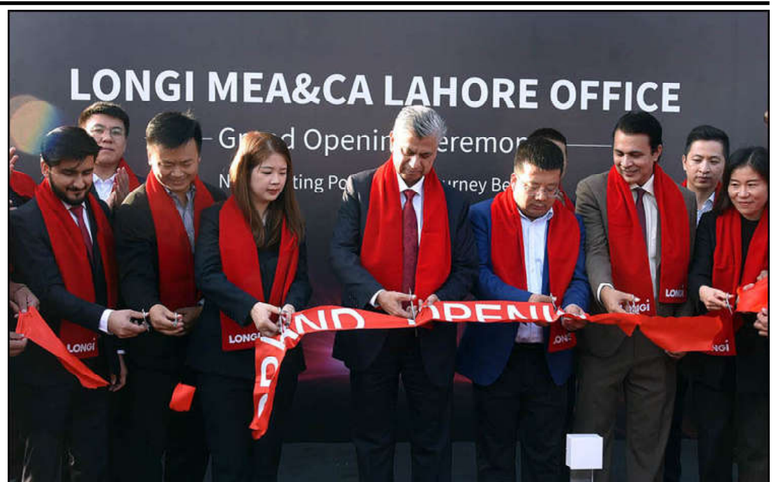
LAHORE: Caretaker Federal Minister for Information and Broadcasting Murtaza Solangi is cutting the ribbon to inaugurate Longi Solar's at Gulberg.

He said officers and staff have suffered at the hands of the little mafias and they were thrashed, injured, made hostage and fired upon.