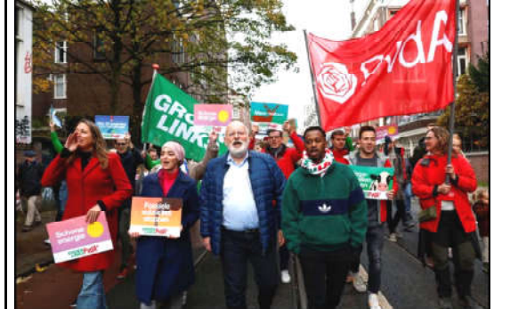
The leading candidate of the Dutch Labour Party, Frans Timmermans attends The March for Climate and Justice to demand political change before the elections in Amsterdam, Netherlands.