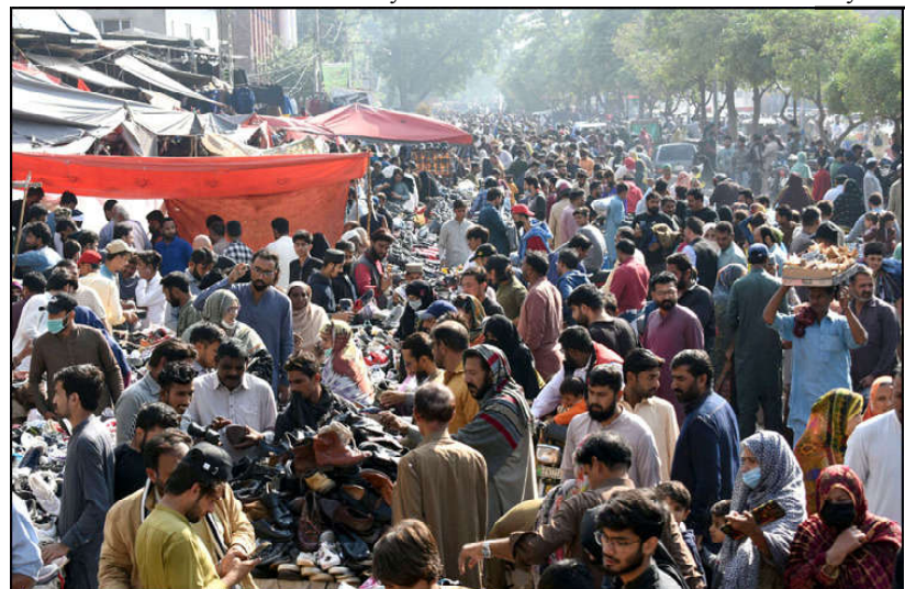
LAHORE: A large numbers of people is busy in buying shoes and warm clothes in a Landa Bazaar at Hajji Camp in Provincial Capital.