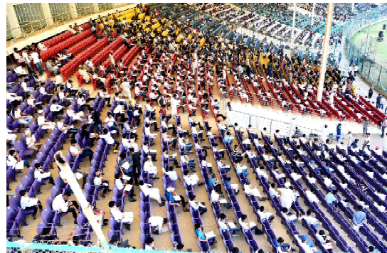
KARACHI: Students are solving paper of Entry Test for Information Technology (IT) Courses under the supervision of Saylani Welfare International Trust held at National Bank Stadium in Karachi