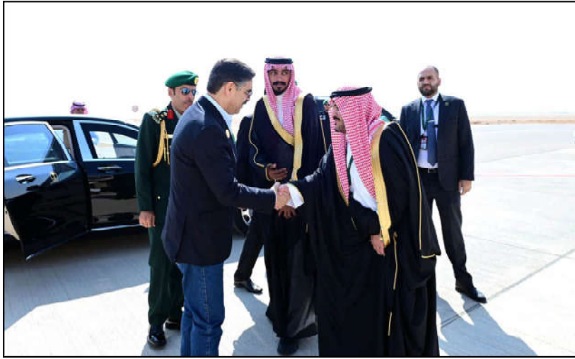
RIYADH: Caretaker Prime Minister, Anwaar-ul-Haq Kakar seeing off by high diplomatic officials of Pakistan and Saudi Arabia after completing his three day official visit of Kingdom of Saudi Arabia