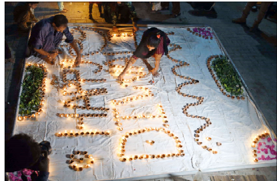
KARACHI: Pakistan Hindu devotees light the oil lamps during Diwali in Provincial Capital. Diwali the festival of lights, is celebrated with jubilation and enthusiasm as one of the biggest Hindu festivals.