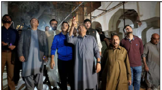
LAHORE: Punjab Caretaker Chief Minister Mohsin Naqvi reviews progress being made on the renovation and extension of the project during his visit Mazar Bibi Pak Daman.

LAHORE (APP): The Punjab Police and Safe Cities Authority (PSCA) jointly responded to 28,000 calls and messages from women in the province, during the on-going year. The PSCA official sources told APP on Sunday that the Women Safety App was developed for women to ensure their safety, an application that allows users to send an alert to the police or to a family member with just one tap. He said the Anti-Women Harassment and Violence cells had taken timely action through the App and arrested the accused in the last 10 months against whom strict legal action was taken. The App was launched to provide immediate help to women in which various links including Cyber Crime, Rescue, National Highway, Motorway and other helpline numbers had also been provided. The App also allows its users to review different public locations in terms of safety, an official said adding that green pins indicate the location was safe for women, orange means the area was partially secure.