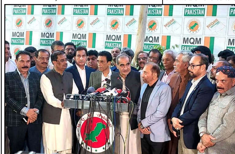
KARACHI: Muttahida Qaumi Movement (MQM-P) Senior Deputy Convener, Dr. Farooq Sattar along with leaders of Muslim League (PML-N) addressing to media persons during press conference after meeting held at t Bahadurabad Markaz in Karachi.

Former President Asif Ali Zardari as the President of the country started celebrating National Day of Minorities on August 11 every year. He started celebrating 11 th August every year as National Day of Minorities.