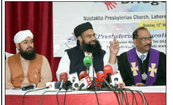
LAHORE: Chairman Pakistan Ulema Council Maulana Tahir Ashrafi addressing a press conference Naulakha Presbyterian Church in Provincial Capital.