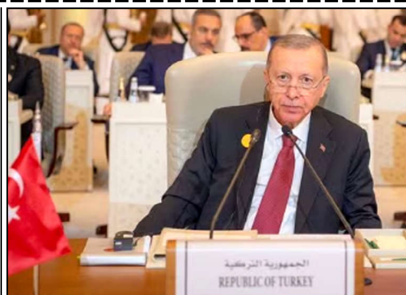
Turkey's President Tayyip Erdogan attends Organisation of Islamic Cooperation (OIC) summit in Riyadh, Saudi Arabia.