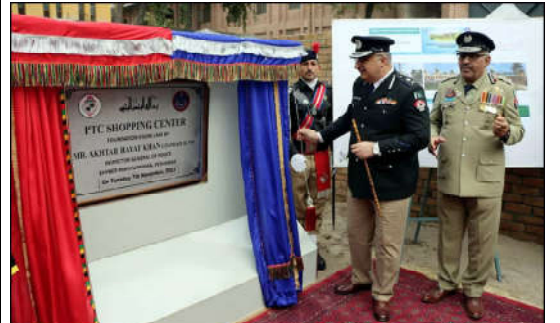
HANGU: Inspector General of Police Khyber Pakhtunkhwa Akhtar Hayat Khan laying the foundation stone of the shopping center built for women police at Gandapur Police Training College Hangu.

scheme for approval so that to not only ensure the long-term preservation of records available in the research cell, rather make the availability of these historical materials and literature possible for researchers through online facilitation. He expressed these views during a visit to the historical Tribal Research Cell, established under the Home and Tribal Affairs Department in Namak Mandi here. During the visit, the minister inspected various parts of the research cell and checked the historical records and official files of the pre-independence and post-independence periods related to the affairs of tribal areas.