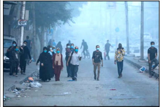
Palestinians flee their homes during Israel's ground offensive, on the edges of Beach refugee camp, in Gaza City.

camp, are the focus of Israel's campaign to crush Hamas, the militant group that has ruled Gaza for 16 years. The war, now in its second month, was triggered by the Oct. 7 Hamas attack on southern Israel. The number of Palestinians killed in the war passed 10,300, including more than 4,200 children, the Hamas-run Health Ministry in Gaza said Tuesday. In the occupied West Bank, more than 160 Palestinians have been killed in the violence and Israeli raids.