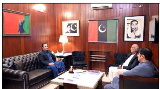
KARACHI: Peoples Party (PPP) Chairman, Bilawal Bhutto Zardari exchanges views with former Sindh Chief Minister Syed Murad Ali Shah and former Federal Minister Syed Khursheed Shah during meeting held at Bilawal House in Karachi.

districts of Hyderabad division through a video link at the office of the Commissioner of Hyderabad on Wednesday. According to a spokesperson for the division administration, the caretaker minister asked questions about the progress reports submitted by Deputy Commissioners following last month's meeting. He emphasized the need for Deputy Commissioners to promptly investigate cases of suspicious entries and authenticate revenue cases.