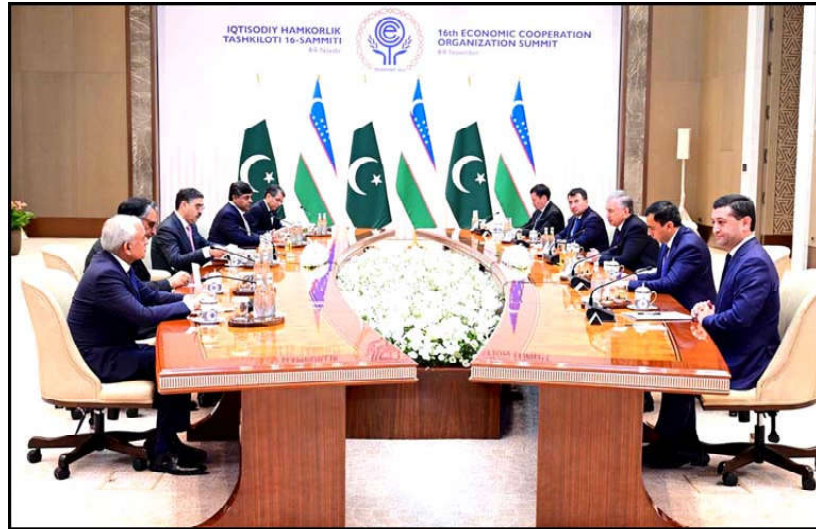
TASHKENT: Caretaker Prime Minister Anwaar-ul-Haq Kakar meets with the President of the Republic of Uzbekistan, Mr. Shavkat Mirziyoyev on the sidelines of 16th ECO Summit.

ISLAMABAD: The nation will observe Iqbal Day on Thursday (today) to honor the 146th birth anniversary of the renowned poet, Dr. Allama Mohammad Iqbal. The government has declared a public holiday nationwide to celebrate the day. Born in Sialkot on November 9, 1877, Dr. Iqbal is fondly remembered as the "Poet of the East."