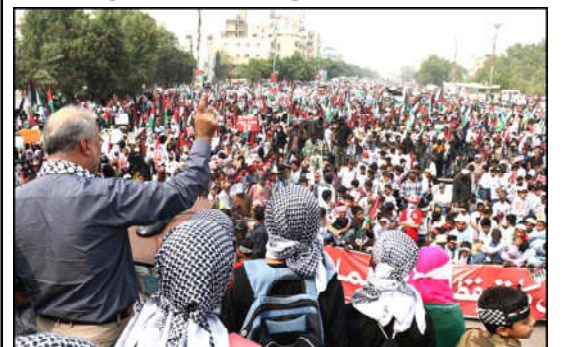
KARACHI: Leaders and members of Jamat-e-Islami (JI) are holding protest demonstration against Israeli cruel and inhumane acts and express unity with the innocent people of Palestine, held at Shahrah-e-Quaideen road in Karachi.

KARACHI (INP): The Citizens-Police Liaison Committee (CPLC) on Wednesday released a report on street crimes committed in October 2023 in Karachi, ARY News reported. According to statistics compiled by the CPLC, as many as 4,396 motorbikes were stolen in October, while 817 two-wheelers were snatched at gunpoint. The CPLC report further said, 182 vehicles were also snatched during the said period, while 25 vehicles were snatched at gunpoint. The CPLC said 54 snatched or stolen vehicles and 265 motorbikes were recovered. The cases of kidnapping for ransom and extortion witnessed a surge in Karachi in October as 13 cases were reported during the month. The 9,464 citizens were deprived of their cellphones during the first four months of 2023, out of which only 161 were recovered.