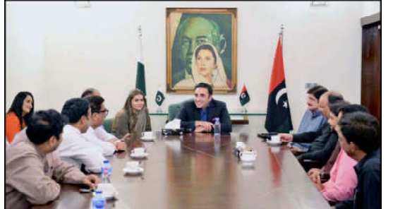
KARACHI: Peoples Party (PPP) Chairman, Bilawal Bhutto Zardari in meeting with Journalists of national newspapers, news channels and media houses, held at Bilawal House in Karachi.

During the meeting, both the dignitaries discussed full gamut of the relations, including cooperation at bilateral and multilateral levels, said a news release. Ambassador Jamal Beker felicitated the Sindh chief minister on assuming the role of chief executive of the province. Justice (retd) Maqbool Baqar appreciated the support extended by the Government of the FDR Ethiopia to Pakistan during the recent flash floods. He also lauded the remarkable economic progress made by the FDR Ethiopia in the recent times. The chief minister said Ethiopia and Pakistan had long-standing bilateral relations that were improving gradually. However, there was a need to explore the immense potential in multiple areas, including economy, health, education and others, he added. He hailed the start of the Ethiopian Airlines operations in Pakistan which would contribute to the already flourishing bilateral ties by strengthening trade, business and people-to-people ties.