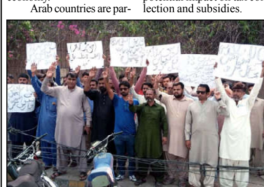
KARACHI: Members of Local Government Employees Union Committee are holding protest demonstration against non-payment of their dues salaries for the past three months, held outside Sindh Secretariat building in Karachi.