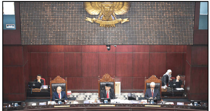
Honorary panel members of the Constitutional Court Jimly Asshiddiqie (C), Wahiduddin Adams (L), and Bintan Saragih (R) preside over a proceeding at the Constitutional Court in Jakarta.

Monitoring Desk MOSCOW: Russian Foreign Minister Sergei Lavrov accused the West on Wednesday of provoking crises on the global oil and gas market by rushing to switch to green energy and imposing pressure on other countries to do the same. "In fact, the reasons for the negative phenomena in the energy sector were the irresponsible actions of the collective West, when it decided to force... the green transition for itself and impose the same green transition.