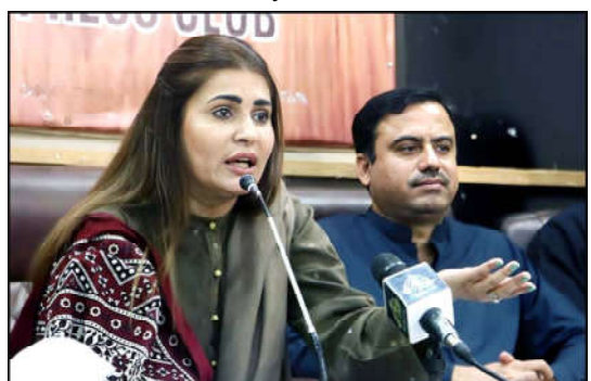
KARACHI: Peoples Party (PPP) Central Information Secretary, Shazia Marri addresses to media persons during press conference held at Karachi press club.