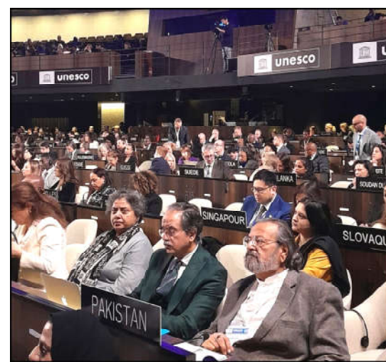
folk music that it would like to inscribe as intangible cultural heritage in addition to three items already inscribed. The Minister said that promotion of cultural

The Minister highlighted Pakistan's active participation in the revision process of the 1974 Recommendations where in collaboration with the Member States, proposals were framed aimed at advancing the debate on a more equitable and universal education system that is better adopted to meet the requirements of the modern world. He also briefed that Pakistan is working with multiple partners including UNESCO for the preservation of its cultural heritage. Pakistan he said, has a treasure trove ranging from folk related items such as Sohan Halwa to Ajrak a traditional garment worn in Sindh to