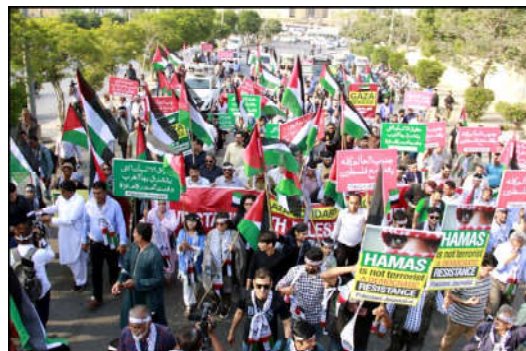
KARACHI: Journalists are holding protest rally Karachi Press Club to Governor House against Israeli cruel and inhumane acts and express unity with the innocent people of Palestine, held in Karachi.