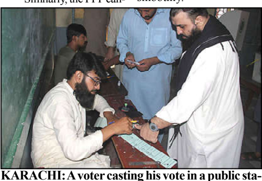
tion during the Local Government by-elections in

The polling for the Local Government by-elections in 16 districts of Sindh province concluded smoothly.