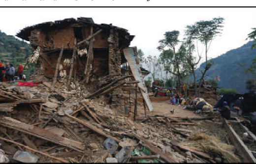
Debris of houses collapsed during an earthquake are pictured in Jajarkot, Nepal.

of war, more than 10,400 people have been killed, according to a conservative estimate from the Armed Conflict Location & Event Data