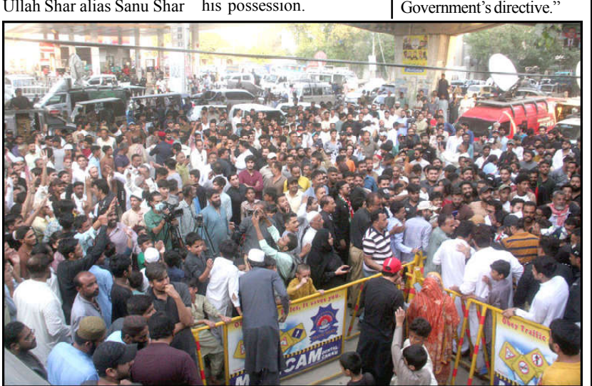
KARACHI: Workers of political parties stands outside a polling station after polls closed during local government by-election for Chairman and vice Chairman, in Provincial Capital.

He has been detained; a Kalashnikov and bullets have been recovered from his possession.