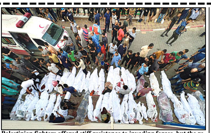
Palestinian fighters offered stiff resistance to invading forces, but the relentless Israeli bombing of the besieged enclave claimed at least 50 lives in