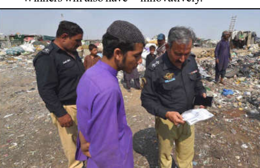
KARACHI: Police check for ID's after Pakistani Government's deadline to expel illegal immigrants

try Manager for Pakistan, Visa, commented: "We're proud to bring our successful 'She's Next' global program to Pakistan, in part-nership with HBL. Women entrepreneurs form a small percentage of the SME sector in Pakistan, facing unique challenges such as limited access to capital, lack of mentorship and dealing with gender stereotyping concerns where they are considered less capable of handling high-pressure situations. Currently, a robust digital infrastructure is critical for them to scale their businesses. She's Next, underscores this vital shift. recognizes the potential of women entrepreneurs, and supports them to thrive