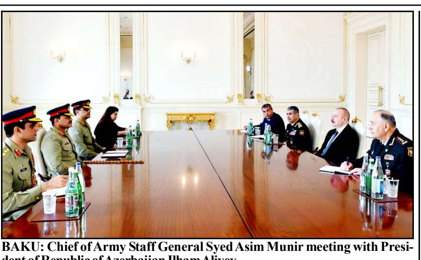
dent of Republic of Azerbaijan Ilham Aliyev.