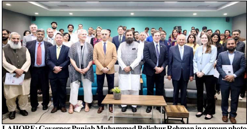
LAHORE: Governor Punjab Muhammad Balighur Rehman in a group photo with participants of a inaugural ceremony of "Tabeer" project at LUMS University National Incubation Center.