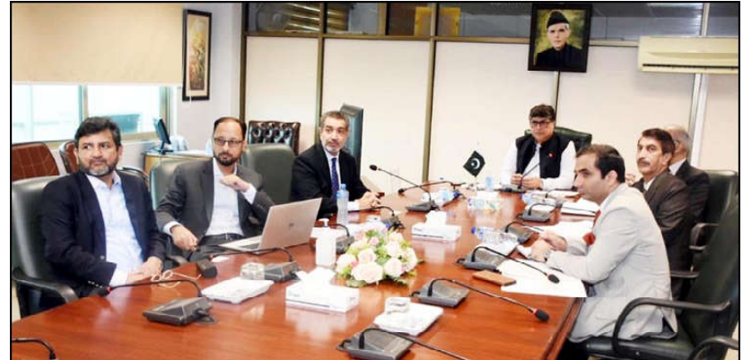
Caretaker Minister for Privatisation, Fawad Hasan Fawad holds a stakeholder meeting for privatisation of HBFCL in Islamabad.