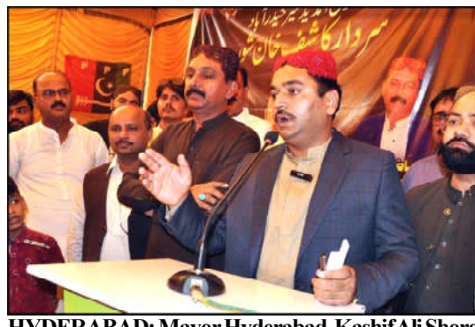
HYDERABAD: Mayor Hyderabad, Kashif Ali Shoro addresses during the Sanitary Equipment distribution ceremony held in Hyderabad.