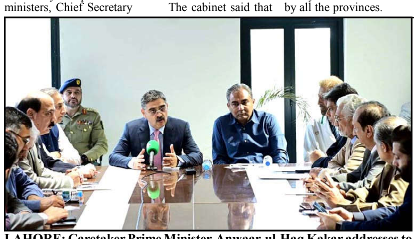
LAHORE: Caretaker Prime Minister, Anwaar-ul-Haq Kakar addresses to media persons during press conference, at Mayo Hospital in Lahore.