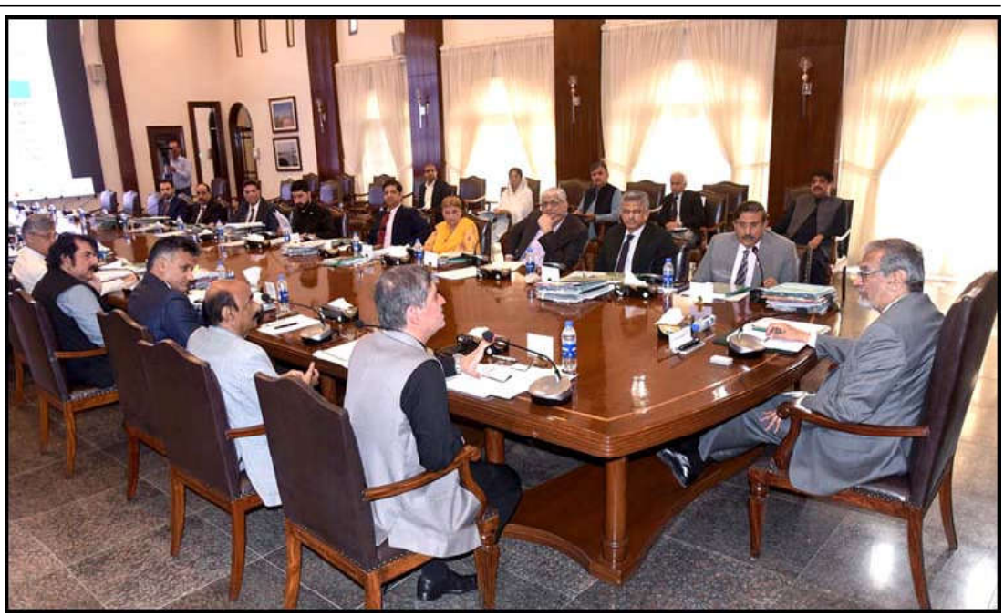
KARACHI: Caretaker Sindh Chief Minister Justice (R) Maqbool Baqar presides over a Cabinet meet-