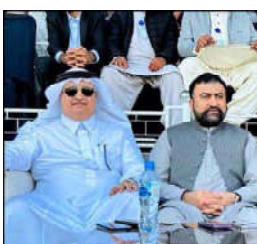
ISLAMABAD: Caretaker Federal Minister for Interior, Sarfraz Ahmed Bugti witnessing the Pakistan vs Tajikistan FIFA World Cup Qualifier match as Chief Guest.