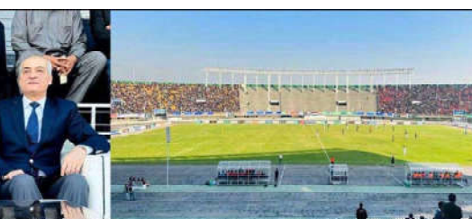
ISLAMABAD: Caretaker Federal Minister for Interior, Sarfraz Ahmed Bugti witnessing the Pakistan vs Tajikistan FIFA World Cup Qualifier match as Chief Guest.

Addressing a mammoth gathering of people here, the PPP leader said that his party strongly believed in the power of people, and after winning the 2024 General Election would serve the masses without any discrimination. Like Sindh province, he said Benazir Mazdoor (labor) Card would be provided to poor laborers of all provinces of Pakistan enabling them to get free treatment and education services for their families.