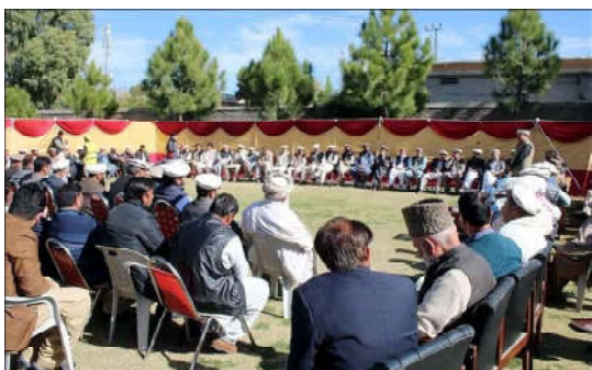
A view of Grand Jirga for the maintenance of regional law and order and negotiations between the parties in Sada, Lower Tehsil Headquarters of the tribal district of Kurram.

He said that after the PMLN government, the country plunged into multifaceted crises and the people had to face severe poverty and economic instability.