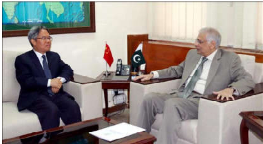
Caretaker Minister for Planning Development & Special Initiatives, Mohammad Sami Saeed meets with Chinese Ambassador to Pakistan Jiang Zaidong at Planning Ministry, Islamabad

The minister clarified that the Ministry of Foreign Affairs had no input in the initial statement issued by the President Secretariat.