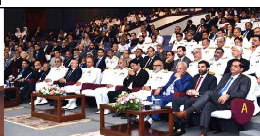
KARACHI: Chief of the Naval Staff, Admiral Naveed Ashraf addresses during the 5th Pakistan Navy (PN) Industrial Seminar and Exhibition 2023 held at Bahria Auditorium in Karachi.

While appreciating the response of private sector in a technologically challenging environment, Chief of the Naval Staff said that Pakistan Navy and local industries will together attain our aim of self-reliance.