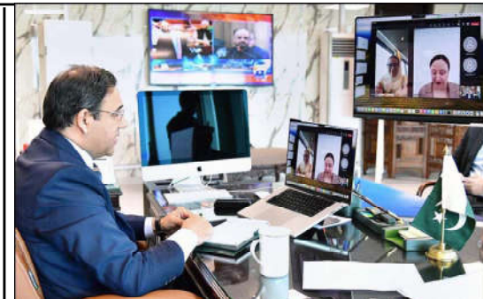
ISLAMABAD: Caretaker Federal Minister for IT and Telecommunication Dr. Umar Saif in a virtual meeting with Secretary General Digital Cooperation Organization (DCO) Ms. Deemah Al-Yahya.

ISLAMABAD (APP): Pakistani Rupee on Tuesday gained 18 paise against US Dollar in the interbank trading and closed at Rs 285.78 against the previous day's closing at Rs 285.96. However, according to the Forex Association of Pakistan (FAP), the buying and selling rates of the Dollar in the open market stood at Rs 285.2 and Rs 288 respectively.