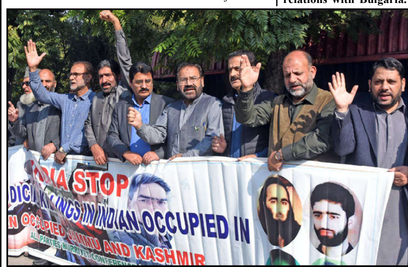
ISLAMABAD: Activists of All Parties Hurriyat Conference holds placards and shouting slogans during protest in the favor of their demands outside Foreign Office in Federal Capital.