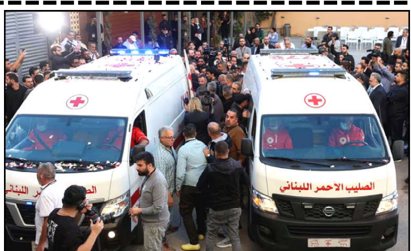
Ambulances carrying the bodies of the two journalists of Lebanon-based Al Mayadeen TV channel, who it says were killed by an Israeli strike, are parked outside the channel's building, in Beirut, Lebanon.

"There are only children and women in the house and no one else," exclaimed one resident.