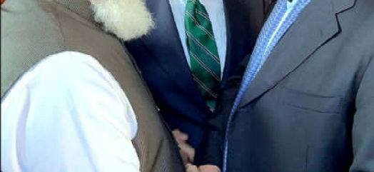
ISLAMABAD: Chief of Jamiat Ulema-e-Islam (F) Maulana Fazlur Rehman welcoming PML-N quaid Muhammad Nawaz Sharif and Shehbaz Sharif on their arrival at his residence

He said the government would provide all necessary resources and support to the Election Commission of Pakistan. The minister reiterated the commitment that elections would be ensured in a transparent and credible manner.