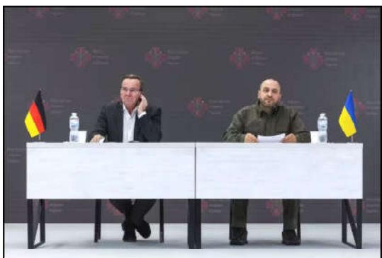
Ukraine's Defence Minister Rustem Umerov and German Defence Minister Boris Pistorius attend a joint news conference, amid Russia's attack on Ukraine, in Kyiv, Ukraine.

Ramaphosa will chair the "extraordinary meeting" because of South Africa's position as current chair of BRICS, his office said. It said the leaders are expected to deliver statements on the "humanitarian crisis" in Gaza and will likely adopt a joint statement. The meeting comes a day after China's top diplomat hosted the foreign ministers of Saudi Arabia, Egypt, Jordan, the Palestinian Authority and Indonesia in Beijing.