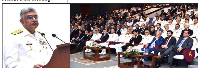
KARACHI: Chief of the Naval Staff, Admiral Naveed Ashraf addresses during the 5th Pakistan Navy (PN) Industrial Seminar and Exhibition 2023 held at Bahria Auditorium in Karachi.