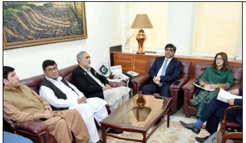
ISLAMABAD: Caretaker Federal Minister of Commerce and Industry, Dr. Gohar Ejaz meeting with representatives from Khyber Chamber of Commerce and Industry.