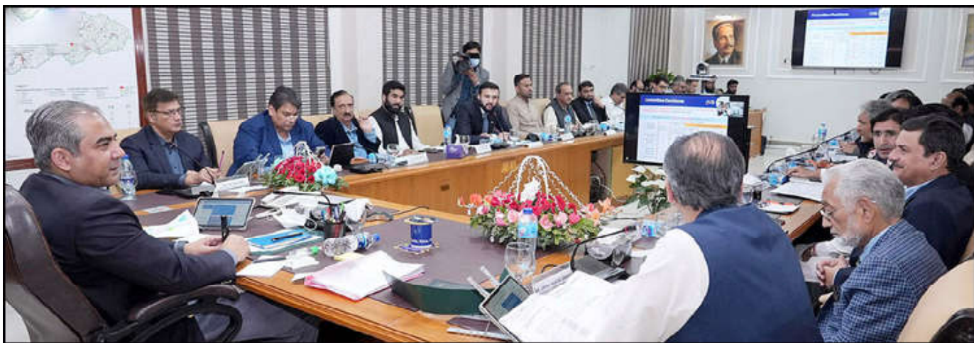
GUJRANWALA: Caretaker Chief Minister Punjab Mohsin Naqvi presides over the Punjab cabinet meeting first time held in Gujranwala.