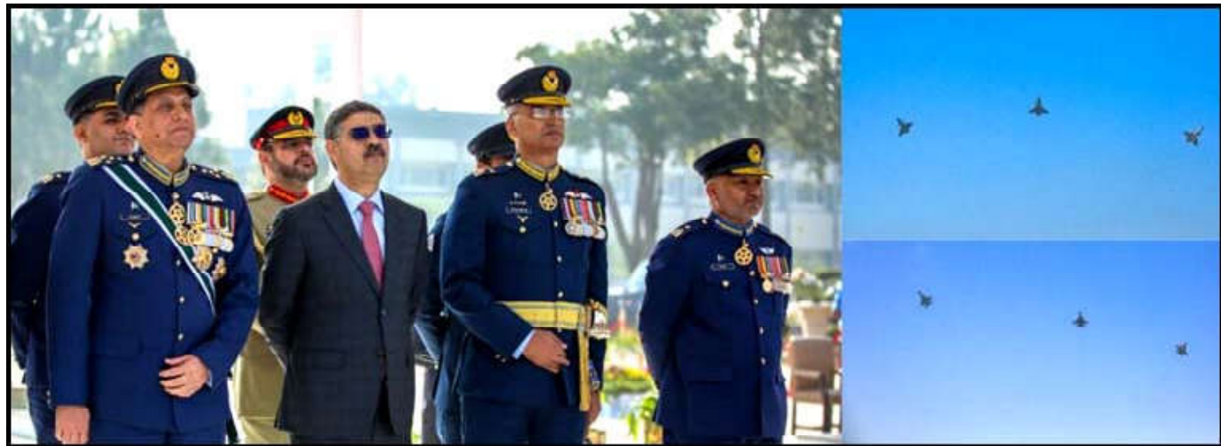
ISLAMABAD: Caretaker Prime Minister Anwarul Haq Kakar and Air Chief Marshal Zaheer Ahmed Sidhu, Chief of the Air Staff Pakistan Air Force witnessing the flypast at the graduation ceremony held at PAF Academy Asghar Khan.

Vol. XIII No. 325 Reg. mails-B / ID-445 Wednesday November 22, 2023, Jamadi-ul-Awal 07, 1445 A.H. Ph: 2158688, 2158997 Pages 4: Rs. 12