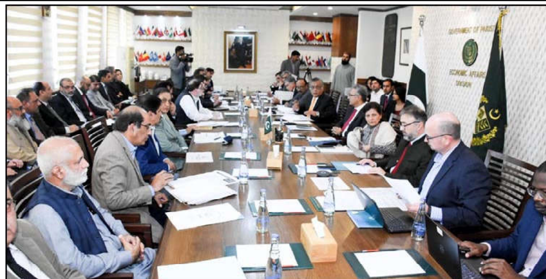
ISLAMABAD: Caretaker Federal Minister for Finance, Revenue & Economic Affairs, Dr. Shamshad Akhtar chaired the Portfolio Review Meeting of Foreign Funded (Federal) Projects at Ministry of Economic Affairs.

She also appealed to donors for expertise and technical assistance to ensure timely implementation for the benefit of Pakistan's socioeconomic development.