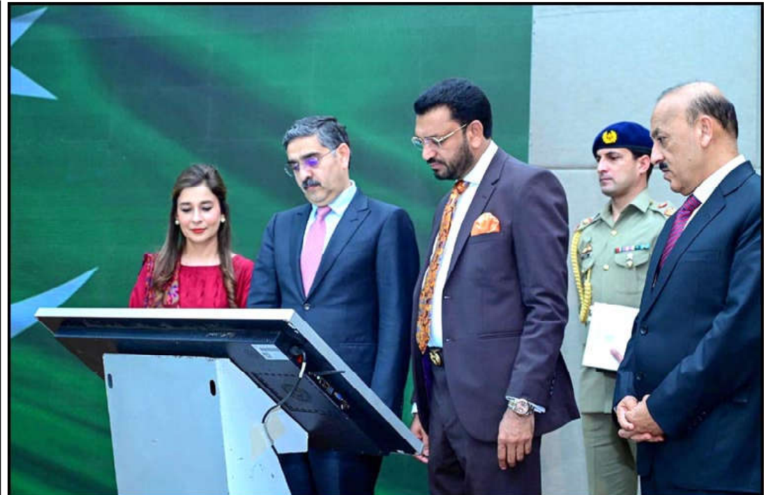
ISLAMABAD: The Caretaker Prime Minister Anwaar-ul-Haq Kakar launches ZARRA mobile app on the eve of Universal Children's Day

The government and non-government organizations and the society as a whole should contribute towards the noble cause of safeguarding the children rights and to make their future safe and prosperous, he added.