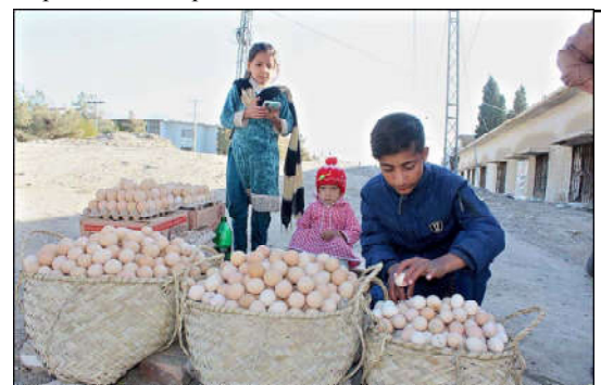
QUETTA: A school-going boy selling eggs to support his family at a roadside near Koyla Patkha.