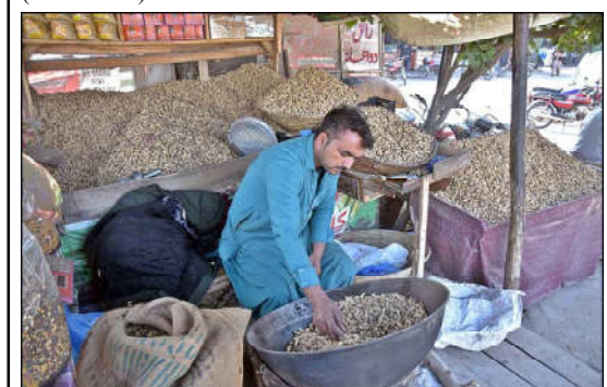
RAWALPINDI: A vendor displaying peanuts to attract the customers at Rawat.