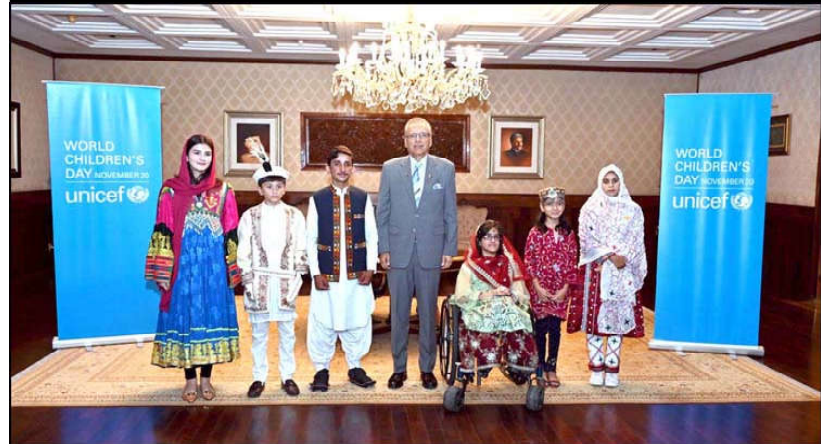
ISLAMABAD: President Dr. Arif Alvi in a group photo with a delegation of children representing four provinces, as well as, Gilgit-Baltistan and Azad Jammu and Kashmir nominated by the United Nations Children's Fund (UNICEF) at Aiwan-e-Sadr.