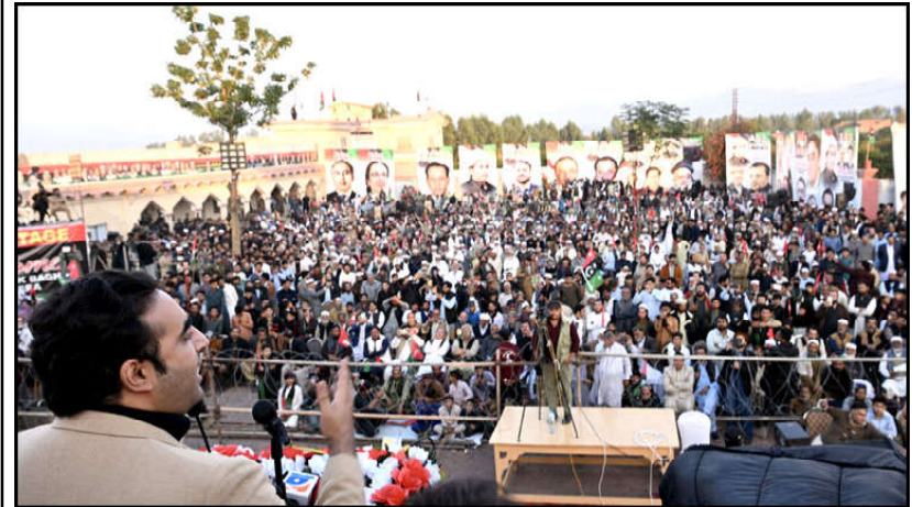
NAUSHERA: Chairman Pakistan People's Party Bilawal Bhutto Zardari addressing to workers convention in City.

Moved by Senator Sana Jamali, the resolution highlighted the fundamental right of every child to access quality education, emphasizing the need for gender-neutral, geographically inclusive, and socioeconomically equitable educational opportunities. The resolution asked the government to take effective steps to promote the literacy for children and youth in general and girls in particular across the country, and also strengthen the non-formal education (NFE) system on an urgent basis to deliver the programmes.