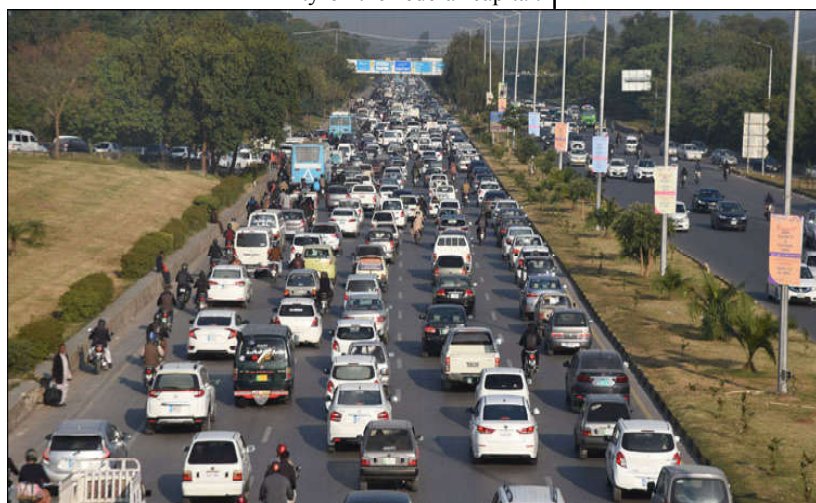
ISLAMABAD: A view of the massive traffic at Express Way as large number of the people are on their way towards offices on the first day of the week in Federal Capital.

The PTA has collaborated with Meta, TikTok, the United Nations Children's Fund (UNICEF), and other prominent organizations to pursue the cause of promoting a safer online environment for the youth.