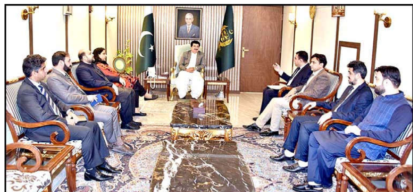
ISLAMABAD: Chairman Senate, Muhammad Sadiq Sanjrani in a meeting with the delegation of Pakistan Humanitarian Forum at Parliament House.