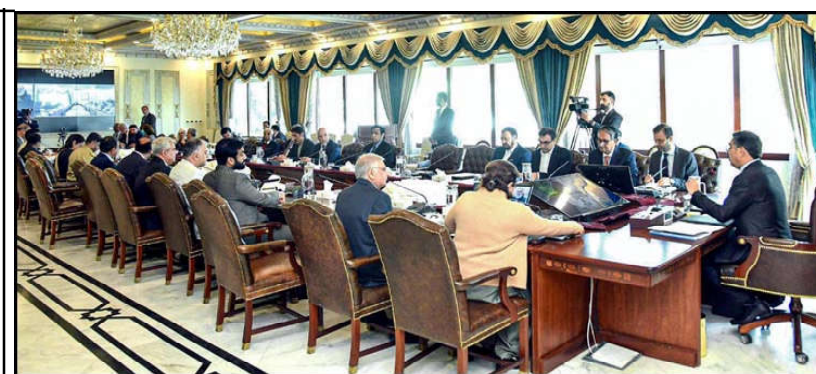
ISLAMABAD: Caretaker Prime Minister Anwaar-ul-Haq Kakar chairs the 2nd meeting of the Pakistan, Climate Change Council.

"Pakistan needs a government that has the mandate to make difficult long-term decisions to fix the economy of the country in the next five years after the elections", he added.