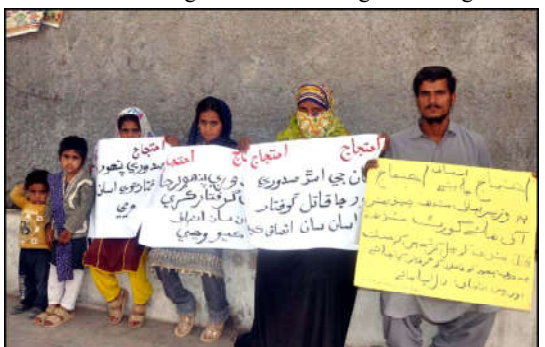
HYDERABAD: Residents of Dadu are holding protest demonstration against high handedness of police, at Hyderabad press club.

It is said in written order that Punjab government is taking steps regarding working from home on 2 days in the week. The word of gym closure is suspended in the notification. In the written order of the court, it is said that the meteorological department should take departmental action against officers who do not take action against smog.