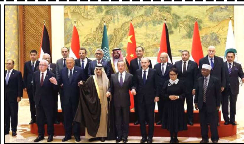
Chinese Foreign Minister Wang Yi attends a family photo session with Saudi Foreign Minister Prince Faisal bin Farhan Al Saud, Jordanian Deputy Prime Minister and Foreign Minister Ayman Safadi, Egyptian Foreign Minister Sameh Shoukry, Indonesian Foreign Minister Retno Marsudi, Palestinian Foreign Minister Riyad Al-Maliki and Organisation of Islamic Cooperation (OIC) Secretary-General Houssein.

"There are still dangerous developments ahead of us and an urgent humanitarian crisis that requires an international mobilization to deal with and counter it," he said.