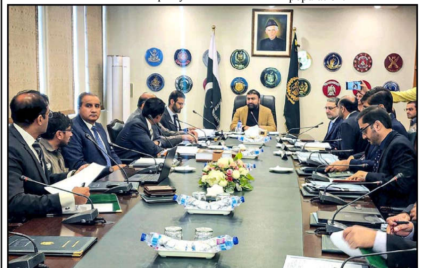
ISLAMABAD: Caretaker Federal Minister for Interior Sarfraz Ahmed Bugti chairing a meeting of ministerial committee on enforced disappearances.

The senators called for an urgent solution that effectively balances security concerns with the economic well-being of the affected population.