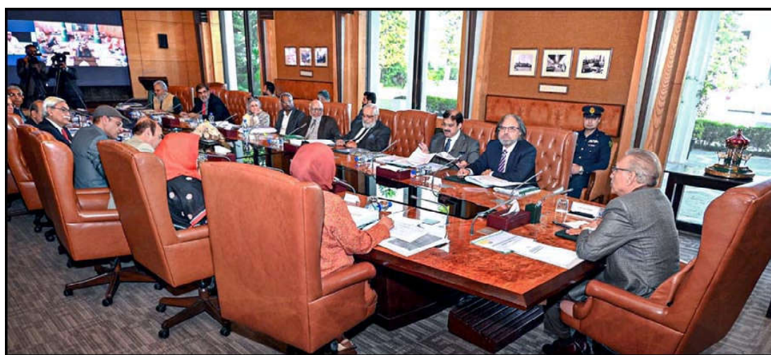
ISLAMABAD: President Dr. Arif Alvi chairing the 49th Special meeting of the senate of Federal Urdu University of Arts, Sciences and Technology (FUUAST), at Aiwan-e-Sadr.