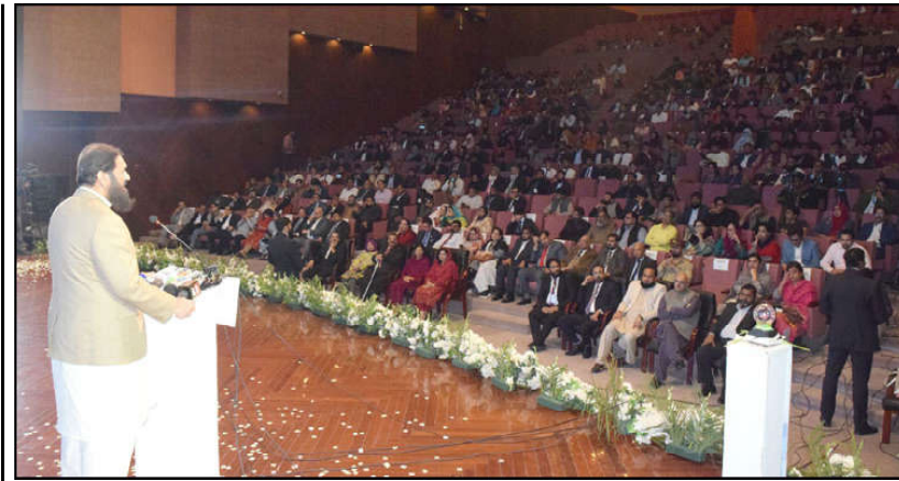
LAHORE: Governor Punjab Muhammad Balighur Rehman addressing the closing ceremony of All Punjab Universities Innovation Expo 2023 organized by the Punjab Higher Education Commission and provincial universities.

This reduced the digital divide and created E-employment opportunities for the youth. He said that Pakistani youth have made a name for themselves in gaming apps in the world.