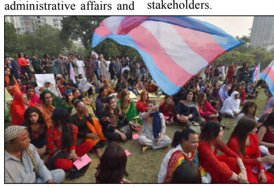
KARACHI: Member of the Trans community take part in Sindh Moorat March.

For this purpose, the minister. The CM CM asked to hold emphasized to improve the consultation with the stakeholders.