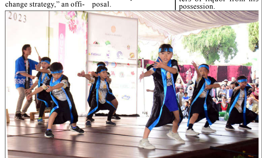
ISLAMABAD: Japanese children performing traditional dance during Pakistan foreign office Women's Association (PFOWA) annual Charity Bazaar 2023 at a local hotel in Federal Capital.