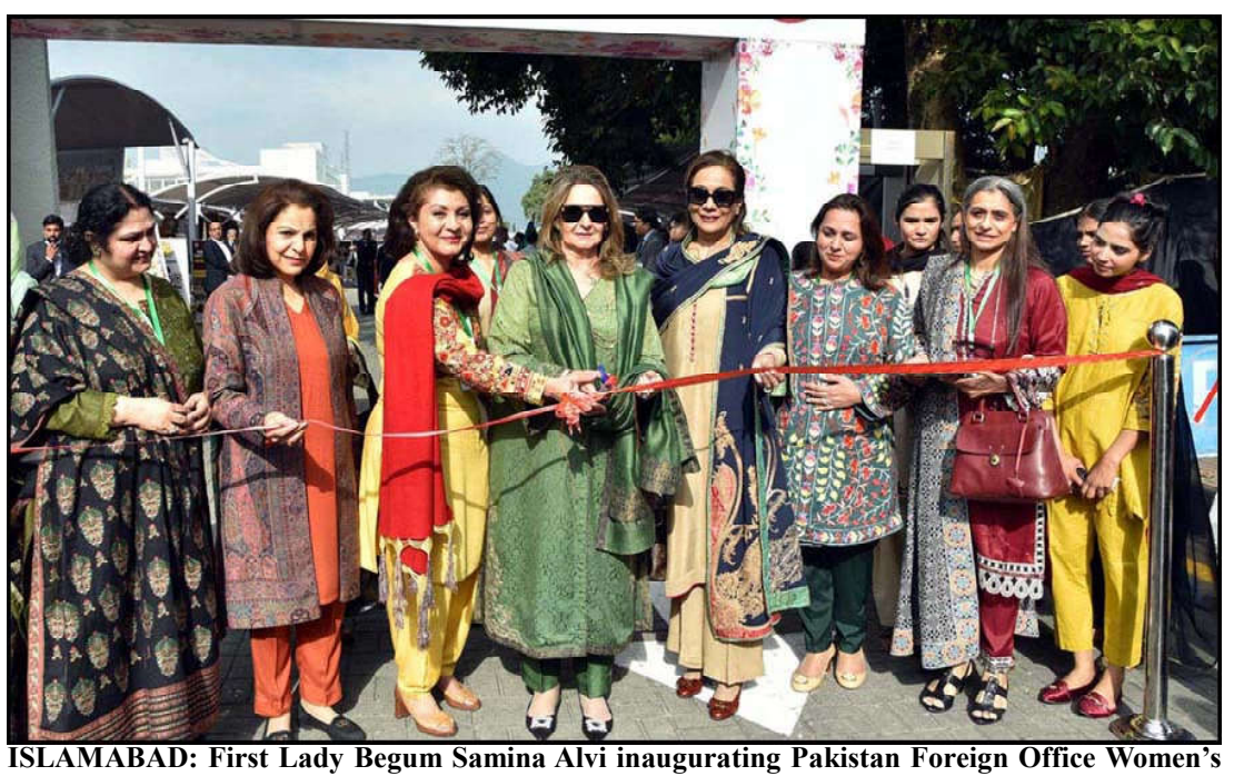
Association's Annual Charity Bazar, at the Ministry of Foreign Affairs.