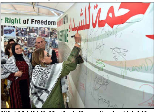
ISLAMABAD: First Lady Begum Samina Alvi visiting the Palestinian stall and expressing her condolences for the martyrs of Gaza, at Pakistan Foreign Office Women's Association's Annual Charity Bazar.

During the meetings, SAPM emphasized the crucial role of human redevelopment source aligned with the requirements of the Saudi market