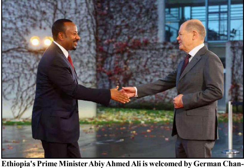
cellor Olaf Scholz before the "Compact with Africa" summit in Berlin,

the idea was promoted by the man who carried out a mass shooting at a synagogue in Pittsburgh