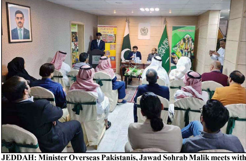
Pakistani Community, Saudi Employers and HRM Exec.

"A dead resolution was passed in the OIC summit, ineffective to provide any relief to the Palestinians and stop inpro-Palestinian slogans humane actions of the Isand demanded an end to raeli occupation forces.'