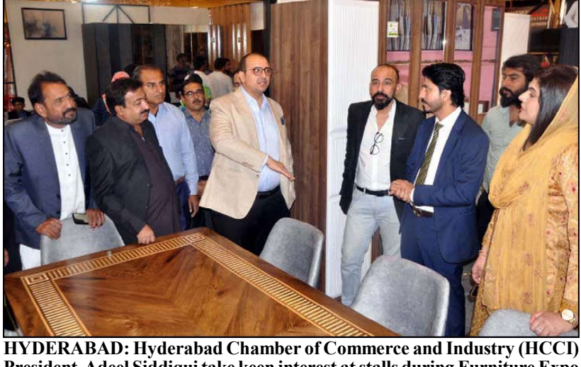
President, Adeel Siddiqui take keen interest at stalls during Furniture Expo

GlobalData. "The EV has a problem attached to it," he said. "It's a much more difficult and complex purchase because of the range of the vehicles and the charging infrastructure.