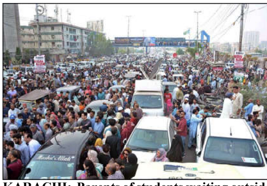
KARACHI: Parents of students waiting outside Expo Centre as the Medical and Dental College Admission Test (MDCAT) 2023-24 is being held.

He was presiding over a meeting of the Board of Revenue held here at Chief Minister's House.