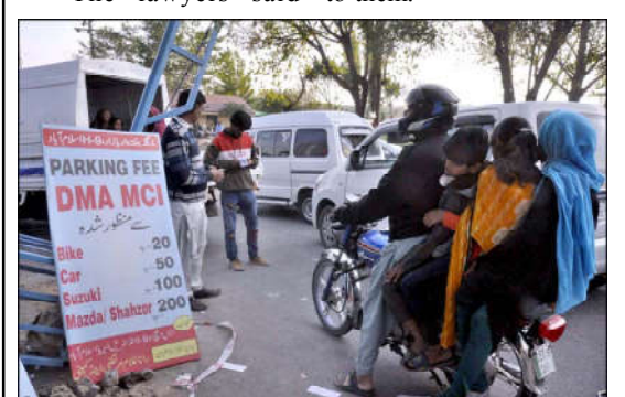
ISLAMABAD: A staffer of Municipal Corporation Islamabad (MCI) receipts weekly Bazaar Parking Fees from the commuters newly launched by District Municipal Administration in the Federal Capital.