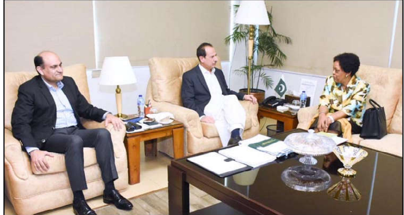
ISLAMABAD: Ambassador of Kenya in Pakistan, called on Federal Health Minister, Dr. Nadeem Jan.

Besides practicing their curative medicine, Dr Alvi urged the doctors and medical practitioners to make a service to society by encouraging preventive care and convincing the general public to adopt the routine of walk and specific exercises. The president also spoke about mental stress in society and said an overall 24 percent population suffers from it and around 60-80 percent of students of higher studies deal with it.