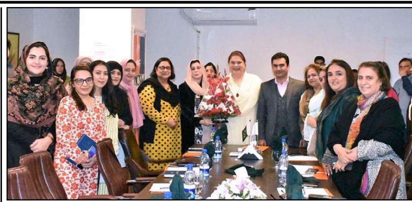
ISLAMABAD: Chairperson NCSW Ms. Nilofar Bakhtiar chairing planning meeting on National Women Trade Fair.

payments, and branch-less banking services provider. As of October 2023, the firm has a market share of 54% said a news release. FGV combines Fatima Group's on-the-ground knowledge of Pakistan's entrepreneurial ecosystem and Asia-focused VC firm, Gobi Partners' 21 years of success in building sustainable and community-uplifting companies across Asia.