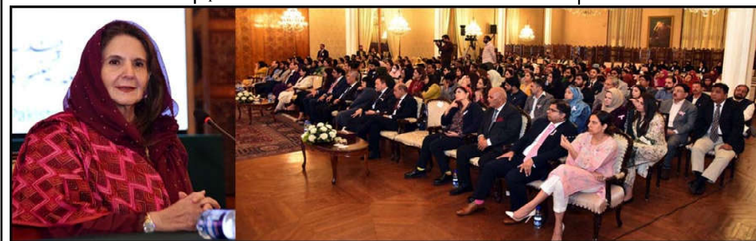
ISLAMABAD: First Lady Begum Samina Alvi addressing a Breast Cancer Awareness Session, at Aiwan-e-Sadr.