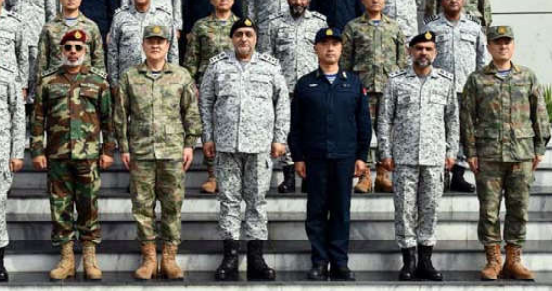
KARACHI: Group photo of Pakistan and Chinese Navy Senior Officials after closing ceremony of Bilateral Exercise Sea Guardian 2023 in Karachi.