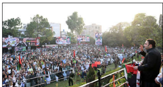
MARDAN: Chairman Pakistan People's Party Bilawal Bhutto Zardari addressing to workers convention, in City.

Regular conduct of bilateral naval exercise is a manifestation of mutual resolve to further enhance bilateral cooperation between the two navies.