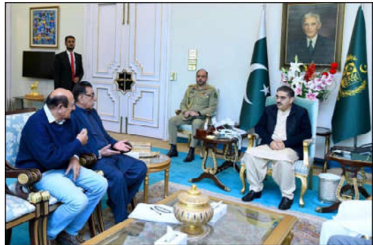
ISLAMABAD: A delegation of Gwadar Shipping Clearing Agents calls on Caretaker Prime Minister Anwaar-ul-Haq Kakar.