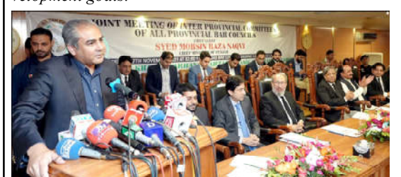
LAHORE: Caretaker Chief Minister Punjab Mohsin Naqvi, addressing the joint meeting of the Interprovincial Bar Council at Punjab Bar Council.

The agreement marks a pivotal collaboration between Pakistan and Saudi Arabia, paving the way for the export of a substantial Pakistani manpower to contribute to Saudi Arabia's ambitious infrastructure and development goals.