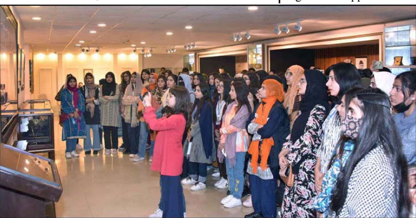
ISLAMABAD: A group of students from Government College Women University Faisalabad (GCWUF) visiting Senate Museum at Parliament House

He said that appropriate measures should be taken to tackle the issues of over speeding and violation of traffic rules. Minor children should be banned from driving, seat belts should be strictly en-