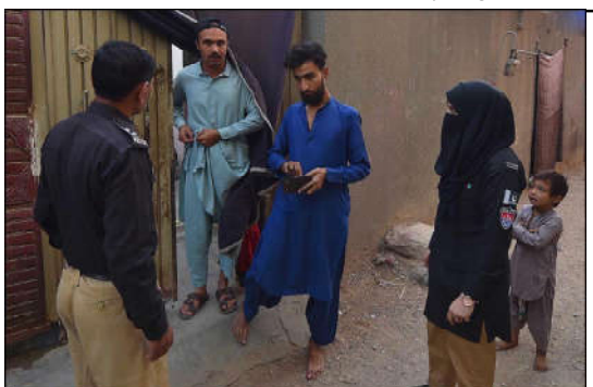
KARACHI: Police personnel knock at the door of Afghan refugees during a search operation to identify alleged illegal immigrants, on the outskirts of Karachi.