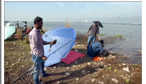
ISLAMABAD: Youngsters are busy in fishing along the Rawal Dam, during sunny weather in Federal Capital.