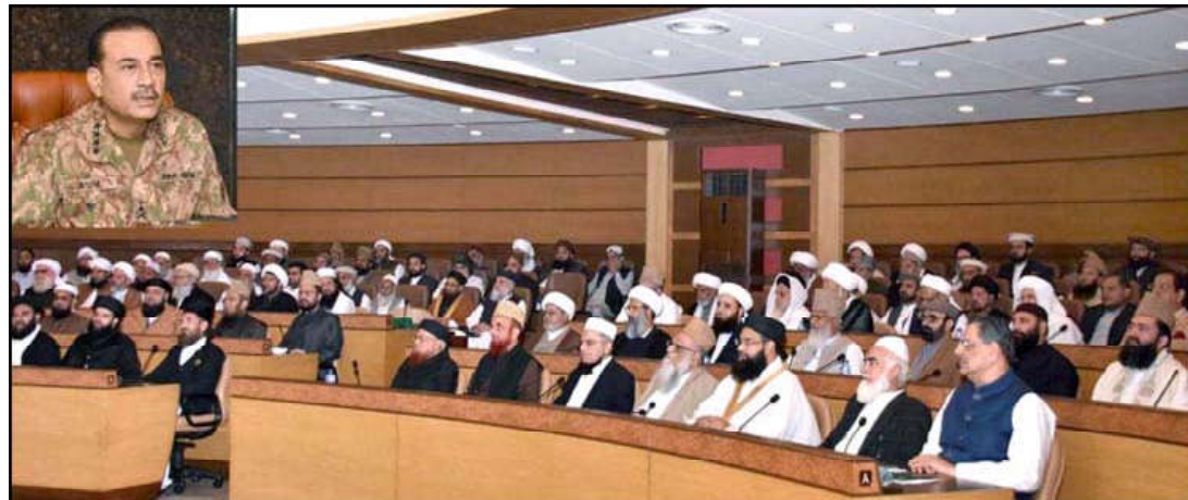
RAWALPINDI: Chief of Army Staff (COAS), General Syed Asim Munir, NI (M), addressing the leading Islamic Scholars (Ulema o Mashaikh) of all schools of thought, interacted at GHQ.

He said that the people of Khyber Pakhtunkhwa had faced worst during last nine years while merger of FATA had not given anything tangible to tribal people.