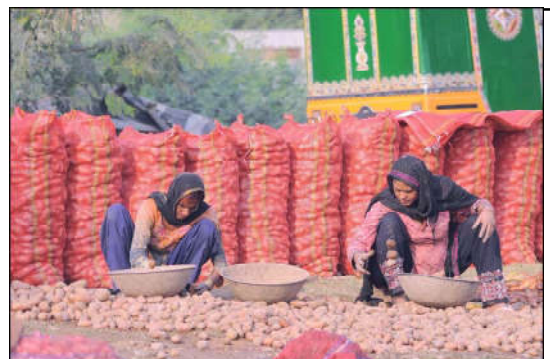
MULTAN: Women workers sorting potatoes at Vegetable Market.

Aside from strengthening power transmission, ADB's project will also enhance the project and financial management of NTDC, as well as its capacity to incorporate climate resilience in planning and operations. "To promote gender equality and women's involvement in the energy sector, ADB will develop guidelines for mentorships, conduct awareness campaigns, establish childcare centers, and provide technical training to female staff in the NTDC."