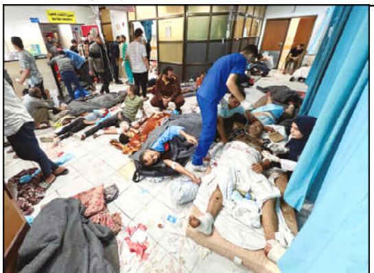
Palestinians wounded in Israeli strikes lie on the floor at the Indonesian hospital after Al Shifa hospital went out of service.

A video narrated by another Israeli army spokesman showed rifles, ammunition and ammo magazines inside an area he identified as Al-Shifa's MRI scanner building.