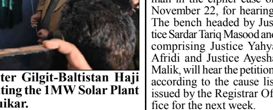
HUNZA: Chief Minister Gilgit-Baltistan Haji Gulbar Khan inaugurating the 1MW Solar Plant & 600KwP BESS at Duikar.

He said that former President Asif Ali Zardari has restored the 1973 Constitution in its original form and granted identity to the people of Khyber Pakhtunkhwa through a constitutional amendment. He said the PPP Government had restored peace in Swat and resettled all TDPs in a record short time.