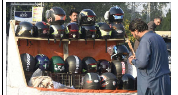
RAWALPINDI: A vendor is displayed motorcycle helmets on his pushcart along a Murree road in the city.

The Governor SBP, speaking on the occasion, highlighted that SBP Vision 2028 represents SBP's commitment to foster price and financial stability and to contribute to the sustainable economic development of the country.