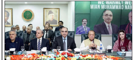
LAHORE: Pakistan Muslim League-N (PML-N) supreme Nawaz Sharif, Former Prime Minister Muhammad Shahbaz Sharif, former finance minister Ishaq Dar, Chief Organizer PML-N Maryam Nawaz, during their visit to Lahore Chamber of Commerce and Industry.

LAHORE (INP): Pakistan's currency, economic and the system has devastated, and prices increased by five-fold, former prime minister Nawaz Sharif said on Thursday. Pakistan Muslim League-Nawaz's supreme leader was addressing officials of the Lahore Chamber of Commerce and Industry (LCCI) today. "It is our responsibility and duty to emancipate the people from price hike and poverty," Nawaz Sharif, who returned from self-exile in London on October 21, addressing to businessmen said. "People want education, health facilities and development," he said. "It is their right, and it is re- sponsibility of the state to provide these facilities," PML-N leader said. Nawaz claimed that Pakistan became 24th largest global economy between 2013 to 2017. "We kept the US dollar static at Rs 104 rate for four years. The dollar would have dropped to Rs40 to 50 if our policies and development process were not interrupted," he claimed. "Today we are desperate for one billion dollars, it is self-inflicted harm we committed to us," he said. "These miserable conditions are consequence of our own decisions," he lamented. "The policy rate has soared to 22 percent, which was 6.25 during our tenure," he said.