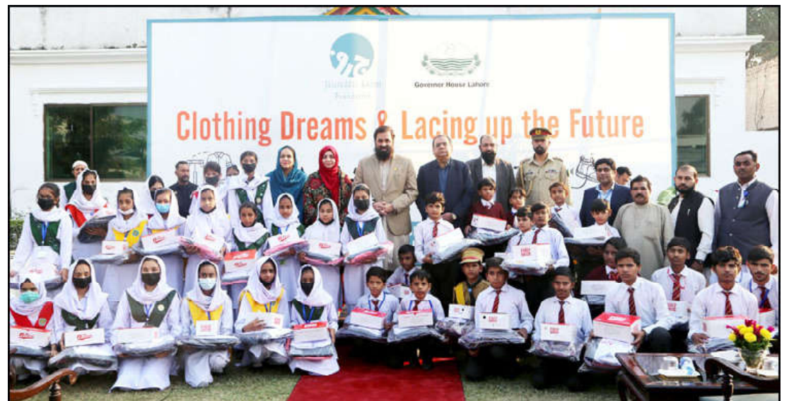
LAHORE: Punjab Governor, Muhammad Balighur Rehman in a group photo with students of Government Boys High School and Government Girls High School established here at Governor House during free uniforms and school bags distribution ceremony.