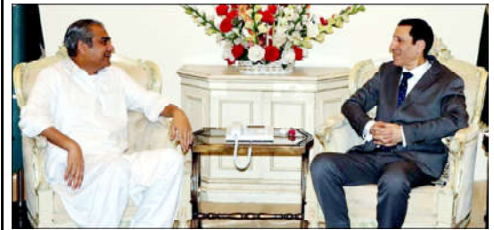
ISLAMABAD: Caretaker Chief Minister Khyber Pakhtunkhwa Justice (ret'd) Syed Arshad Hussain and Caretaker Chief Minister Punjab Mohsin Naqvi during a meeting.