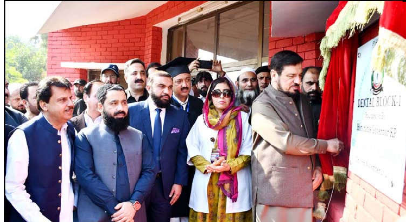
DERA ISMAIL KHAN: Khyber Pakhtunkhwa Governor Haji Ghulam Ali inaugurates Dental Block at Gomal Medical College DI Khan.