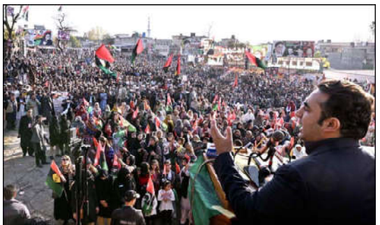
ABBOTTABAD: Chairman Pakistan People's Party Bilawal Bhutto Zardari addressing to workers convention.

ISLAMABAD (Online): Sindh government has filed appeal in Supreme Court (SC) against the decision of stopping trial of civilians in military courts. Sindh government has requested the court to nullify decision of stopping the trial of civilians in military courts. It has been said in appeal that Supreme Court (SC) decision be suspended till the decision of appeal. It was further said in the appeal those accused in attacking military installations should be tried in military courts. SC has not made correct review of law and facts. Sindh government has requested for restoration of nullified clauses of army act and official secret act. The accused persons themselves gave application that they should be tried in military courts. The petition is likely to be fixed for hearing next week.