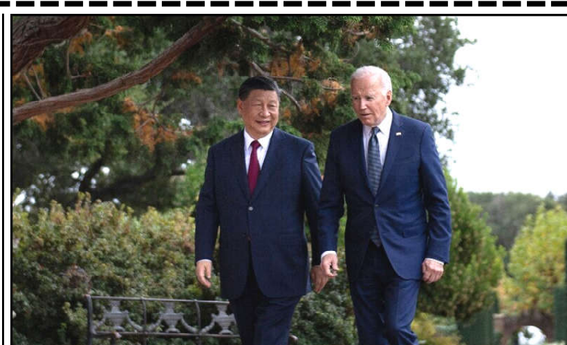
US President Joe Biden and Chinese President Xi Jinping walk together after a meeting during the Asia-Pacific Economic Cooperation (APEC) Leaders' week in Woodside, California.

United States shot down an alleged Chinese spy balloon in February this year. But Biden told a press conference at the Filoli estate that his talks with Xi, whom he has known since 2011, were "some of the most constructive and productive discussions we've had". The United States would compete "vigorously" but "responsibly" with an increasingly assertive China "so it doesn't veer into conflict or accidental conflict," Biden said. "He and I agreed that each one of us could pick up the phone, call directly and we'll be heard immediately."