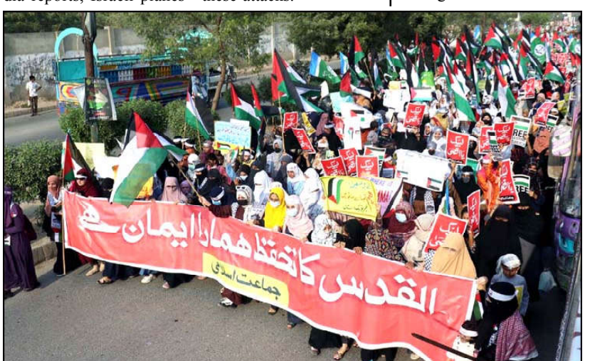
KARACHI: Leaders and members of Jamat-e-Islami (JI) are holding protest demonstration against Israeli cruel and inhumane acts and express unity with the innocent people of Palestine, held at Moach Goth area in Karachi.

ISLAMABAD (INP): Caretaker Information Minister Murtaza Solangi has said that resolving the issues faced by journalists of Gilgit-Baltistan (GB) and promoting journalism was top priority. He expressed these views while talking to a media delegation from Gilgit-Baltistan which called on him in Islamabad. Murtaza Solangi appreciated the active role being played by the journalists of GB in highlighting the positive identity of the region.