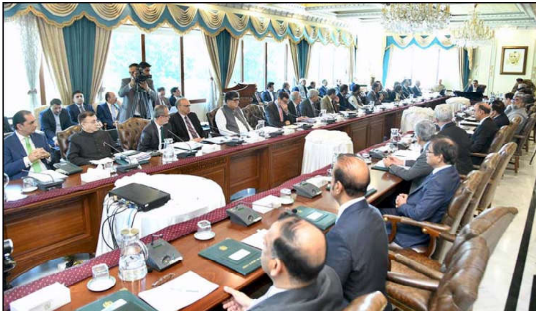
ISLAMABAD: Caretaker Prime Minister Anwaar-ul-Haq Kakar chairs the 7th meeting of Apex Committee of SIFC.

Mohtarma Benazir Bhutto. He called for a collective effort in the upcoming elections to implement the PPP's manifesto and ideology. Addressing pressing issues like inflation and unemployment, Bilawal advocated for a new mindset and leadership focused on serving the people rather than engaging in divisive politics. He underscored the PPP's commitment to empowering farmers, workers, and the common people, proposing initiatives like the 'Kissan Card' and 'Benazir Mazdoor Card.' He emphasized the PPP's historical role in combating poverty and called for a departure from past politics to pave the way for a prosperous, modern Pakistan. Bilawal insisted on the people's right to choose their representatives. He criticized the politics of the past and stressed the need for a new political system that serves the people.