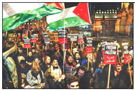
Protesters hold placards and flags during a rally in support of Palestinians, outside the Houses of Parliament in central London.

posted by the president. Cameron said the U.K. would continue to provide moral, economic and diplomatic support "but above all, the military support that you need not just this year and next year but however long it takes." The two-day visit came as Ukraine faces several challenges on and off the battlefield. Zelenskyy has struggled to capture the world's attention as focus has shifted to the Middle East and Israel's war against Hamas. Additional U.S. funding for Ukraine is jeopardized by political fights in Washington and the European Union says it can't provide all the munitions it promised.