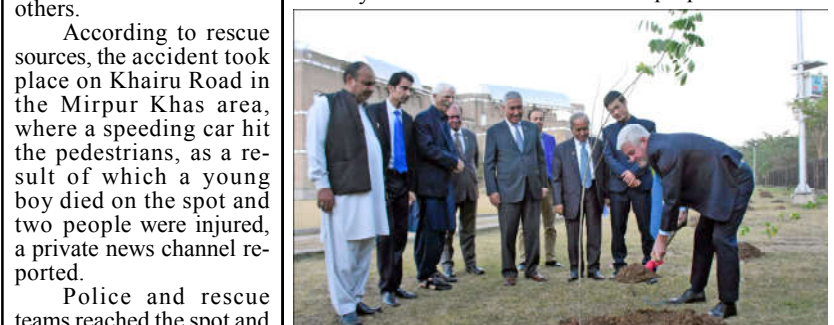
ISLAMABAD: Ambassador of Portugal to Pakistan Frederico Silva planting a plant sapling at Pakistan National Council of Arts during an event regarding the "Climate Change Challenges" in Federal Capital.

ISLAMABAD (APP): Universal Children's Day is an annual day of action for children, by children, marking the adoption of the convention on the rights of child. Children's rights are human rights. But in too many places today, children's rights are under threat. The International Rescue Committee (IRC), in collaboration with National Commission on the Rights of Child (NCRC), here on Thursday hosted a multi-stakeholder national consultation on how Climate Change is impacting children of Pakistan in commemoration of Universal Children's Day 2023, under the global theme of "For every child, Every Right". Aysha Raza Farooq, Chairperson NCRC in her opening remarks, noted that the impact of climate change on children was a matter that demands our collective attention and today's consultation provided a platform for us to engage in a meaningful dialogue, share insights, and develop strategies that would resonate beyond this room. The Guest of Honor Khalil George, Caretaker Minister for Human Rights in his keynote speech, opined that Universal Children's Day holds particular significance for Pakistan as it provides an opportunity to reflect on the progress made in ensuring the rights and well-being of every child. Our commitment to the rights of unregistered children must go beyond rhetoric. It requires concrete actions, innovative policies, and collaborative efforts from all stakeholders involved, she expressed.