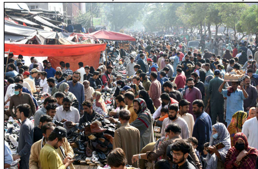
LAHORE: A large numbers of people is busy in buying shoes and warm clothes in a Landa Bazaar at Hajji Camp in Provincial Capital.