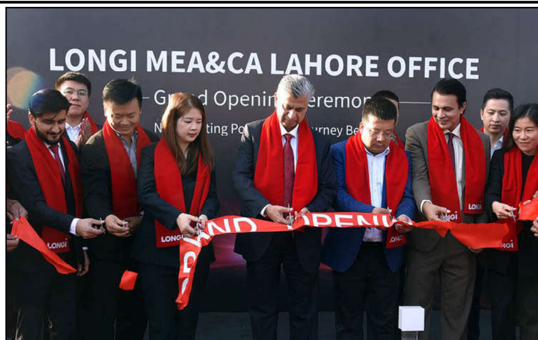
LAHORE: Caretaker Federal Minister for Information and Broadcasting Murtaza Solangi is cutting the ribbon to inaugurate Longi Solar's at Gulberg.

He said officers and staff have suffered at the hands of the little mafias and they were thrashed, injured, made hostage and fired upon.