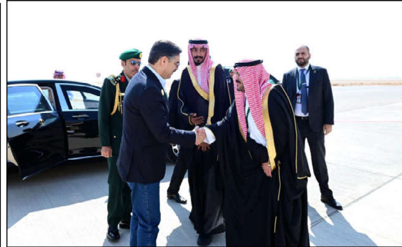
RIYADH: Caretaker Prime Minister, Anwaar-ul-Haq Kakar being seen off by high diplomatic officials of Pakistan and Saudi Arabia after completing his three day official visit of Kingdom of Saudi Arabia

and weapons by Israel occupation forces. Caretaker Prime Minister Kakar, in his remarks, reaffirmed that a permanent solution to the conflict was in the establishment of a secure, viable, contiguous and sovereign state of Palestine on the basis of pre-June 1967 borders with Al-Quds Al-Sharif as its Capital. He stressed that the Israeli occupation forces were acting in clear violation of the international humanitarian and human rights laws, and their indiscriminate and disproportionate use of force amounted to war crimes and crimes against humanity. He also reiterated Pakistan's solidarity and support for the Palestinian people and their right to self-determination.