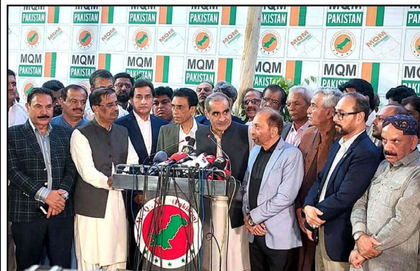
KARACHI: Muttahida Qaumi Movement (MQM-P) Senior Deputy Convener, Dr. Farooq Sattar along with leaders of Muslim League (PML-N) addressing to media persons during press conference after meeting held at t Bahadurabad Markaz in Karachi.