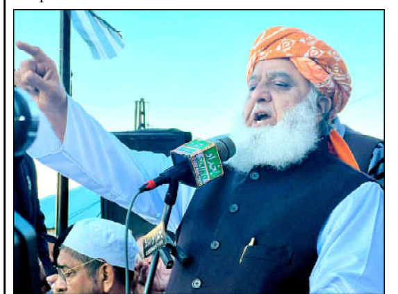
MURREE: Amir Jamiat Ulema Islam Maulana Fazlur Rehman addressing Tofan Al-Aqsa Conference

against Israeli oppression had taken place in the United States, United Kingdom, France and other countries. The JUL-F leader highlighted that Israeli forces had committed atrocities against innocent Palestinians, including children and women which, according to him, was a cowardly act. Fazl further said that it was the duty of the entire Muslim Ummah to stand with the Palestinians and wage a war against Western forces. The JUL-F chief mentioned that his party believed in ideological politics, adding that instead of adhering to the narratives of the past, everyone must move towards a new direction.