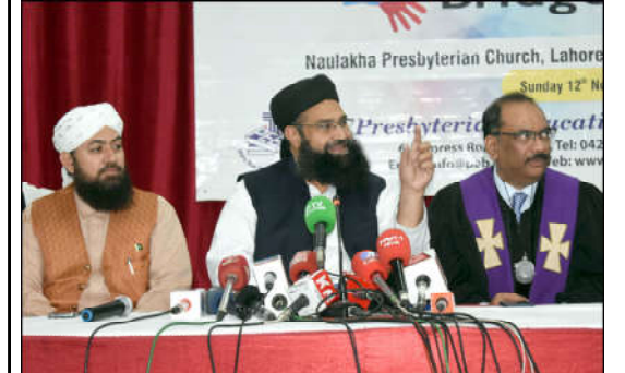
LAHORE: Chairman Pakistan Ulema Council Maulana Tahir Ashrafi addressing a press conference Naulakha Presbyterian Church in Provincial Capital.