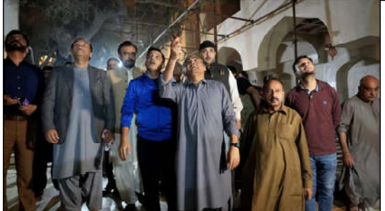
LAHORE: Punjab Caretaker Chief Minister Mohsin Naqvi reviews progress being made on the renovation and extension of the project during his visit Mazar Bibi Pak Daman.

LAHORE (APP): The Punjab Police and Safe Cities Authority (PSCA) jointly responded to 28,000 calls and messages from women in the province, during the on-going year. The PSCA official sources told APP on Sunday that the Women Safety App was developed for women to ensure their safety, an application that allows users to send an alert to the police or to a family member with just one tap. He said the Anti-Women Harassment and Violence cells had taken timely action through the App and arrested the accused in the last 10 months against whom strict legal action was taken. The App was launched to provide immediate help to women in which various links including Cyber Crime, Rescue, National Highway, Motorway and other helpline numbers had also been provided. The App also allows its users to review different public locations in terms of safety, an official said adding that green pins indicate the location was safe for women, orange means the area was partially secure.