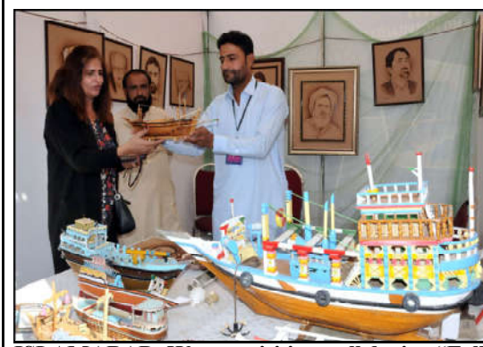
ISLAMABAD: Woman visiting stall during "Folk Festival Lok Mela" at Lok Virsa.

"The rigging plan before the general elections makes it clear that we are entering dark days," he said. The PTI spokesperson has also condemned the negative propaganda campaign carried out against the party, and said that PTI is the only political party that fully believes in the observance of the constitution and the law.