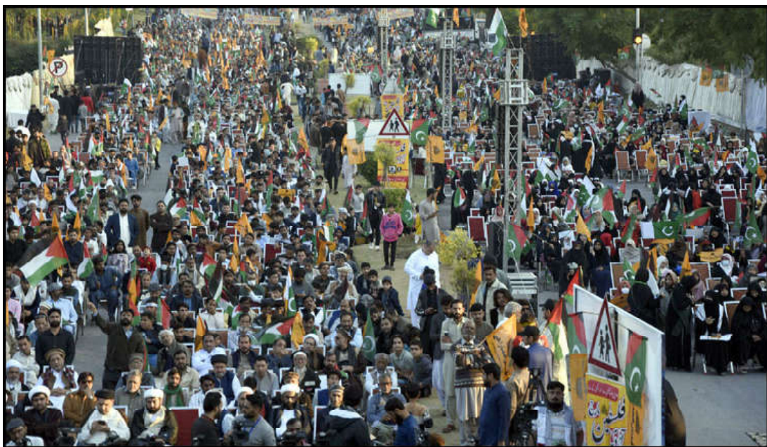
ISLAMABAD: Activists of Majlis Wahdat-e-Muslimeen Pakistan (MWM) holds Philistine and Pakistani national flags during Philistine protest march in Federal Capital.