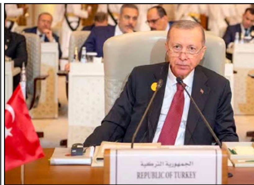
Turkey's President Tayyip Erdogan attends Organisation of Islamic Cooperation (OIC) summit in Riyadh, Saudi Arabia.