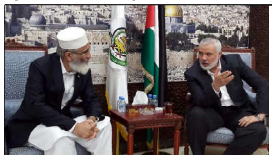
DOHA: Amir Jamaat-e-Islami Sirajul Haq meeting with Chief of Hamas Ismail Haniyeh

found to be partially satisfactory, while projects worth $453 million have been identified as problematic. The worst irregularities have been found in the WAPDA department, which has been ruled by retired generals for decades. Apart from this, projects related to National Transmission and Dispatch Company, FBR, Ministry of Planning, Ministry of Finance and State Bank are also facing problems, due to which benefits from these projects have been delayed.