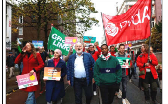
The leading candidate of the Dutch Labour Party, Frans Timmermans attends The March for Climate and Justice to demand political change before the elections in Amsterdam, Netherlands.