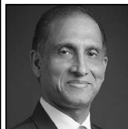
Aizaz Ahmad Chaudhry

Since the dawn of this century, terrorism has been the principal threat to the people of Pakistan. By 2015, Pakistani law-enforcement authorities had succeeded in crushing terrorist forces, through military operations in Swat, South Waziristan and North Waziristan. A National Action Plan was adopted in 2015 to flush out the remaining terrorist holdouts through intelligence operations. The strategy worked well till 2019, with few terrorist incidents.