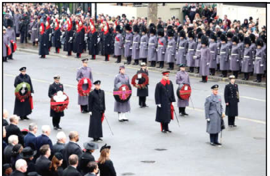
Britain's King Charles III, William, Prince of Wales, Prince Edward, Duke of Edinburgh, and Anne, Princess Royal, attend the National Service of Remembrance at The Cenotaph in Whitehall in London, Britain.

Monitoring Desk WASHINGTON: When President Joe Biden gave his State of the Union address in March 2022, five days after Russian forces invaded Ukraine, the Republicans and Democrats who filled the chamber showed nearly unanimous support for Kyiv's defense. Twenty months later, that tone has changed. While most members of Congress still voice support for Ukrainians, a rift among the Republicans who control the House of Representatives has emerged and cast doubt on the prospects of passing even a fraction of the $61 billion of additional aid Biden requested for Ukraine in October. Cracks had started to emerge in the House GOP by the time Ukrainian President Volodymyr Zelensky made a surprise trip to the Capitol to address a joint session of Congress in December 2022. Rep. Russ Fulcher, a Republican who represents the western half of Idaho, said at the time he was "not comfortable with burdening the American taxpayer" with more aid without proof that the money was being well spent.