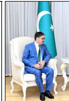
TASHKENT: The Caretaker Prime Minister Anwaar-ul-Haq Kakar meets the President of the Republic of Azerbaijan Mr. Ilham Aliyev on the sidelines of 16th Summit of ECO.

ISLAMABAD (APP): Caretaker Prime Minister Anwaar-ul-Haq Kakar on Thursday arrived here after completing his two-day official visit to Uzbekistan.