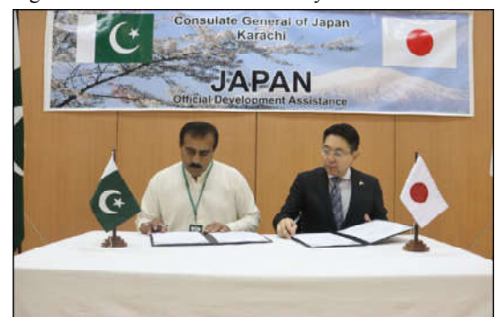
Sindh. In addition to the expansion of the school, the GGP grant awarded to the PRADO will furnish the necessary equipment for the school.

PRADO has been working in the field of education since 2010, mainly in the rural areas of