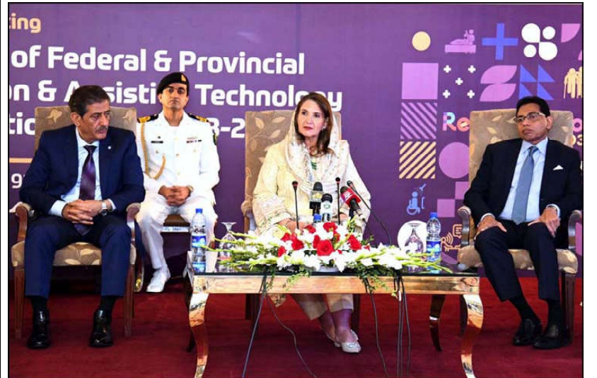
ISLAMABAD: First Lady Begum Samina Alvi addressing the concluding session of a consultative meeting on the Formulation of Federal and Provincial Rehabilitation and Assistive Technology Strategic Action Plan.

with assistive technology, rehabilitation services and access to mobility. She emphasized raising awareness in the society to mainstream the differently-abled persons and end their deprivation by providing them equal rights and services. Samina Alvi termed disability a global public health issue, which, she said, required a positive approach by the society to accommodate such people through skilled education and job opportunities. She called for a national campaign to make aware the differently-abled persons and their parents about the special job quota at the federal and provincial levels.