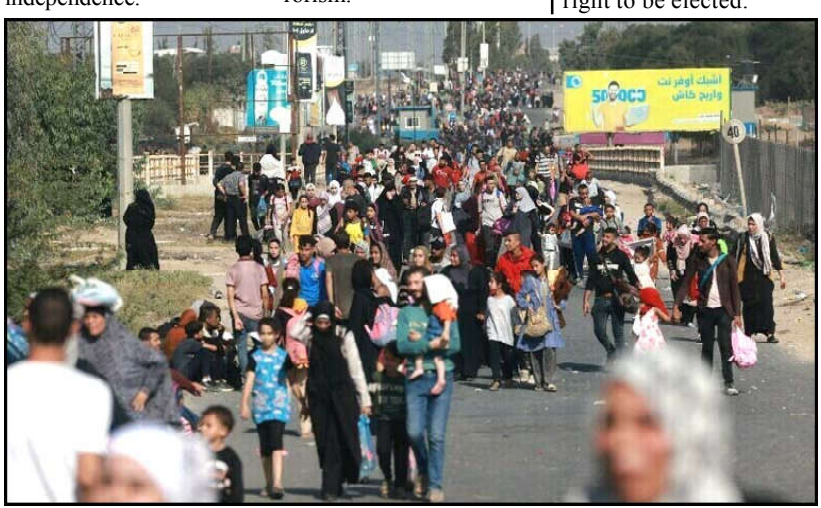
Palestinians walk down a road as they flee Gaza City and other parts of northern Gaza towards the southern areas.