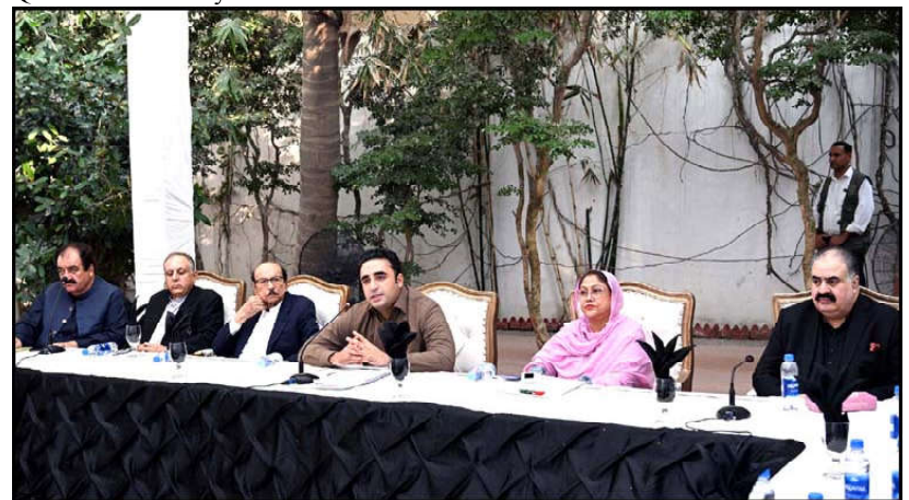
KARACHI: Peoples Party (PPP) Chairman, Bilawal Bhutto Zardari presides over the meeting of leadership of PPP Balochistan to discuss the public relations campaign in the context of the upcoming general elections, held at Bilawal House in Karachi.

She said the Israeli occupation meant enslaving the Palestinian people, with brutalities, illegal detentions, imprisonment and extrajudicial executions.