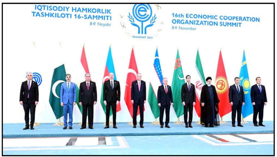
TASHKENT: Caretaker Prime Minister Anwaar-ul-Haq Kakar in a group photo with the heads of states of ECO member countries.

san political objectives". Its verification regime will remain credible only if it is applied on a non-discriminatory basis as stipulated in the Statute of the International Atomic Energy Agency. "Pakistan places the highest priority on nuclear safety and security as a national responsibility," Ambassador Akram added. In light of recent developments, he proposed convening a special session of the General Assembly to establish a new consensus on disarmament and non-proliferation that better addresses the current and emerging realities and offers equal security to all States.