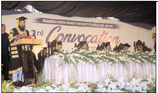
MULTAN: Governor of Punjab Muhammad Balighur Rehman addressing during the 3rd Convocation of the Muhammad Nawaz Sharif University of Agriculture.