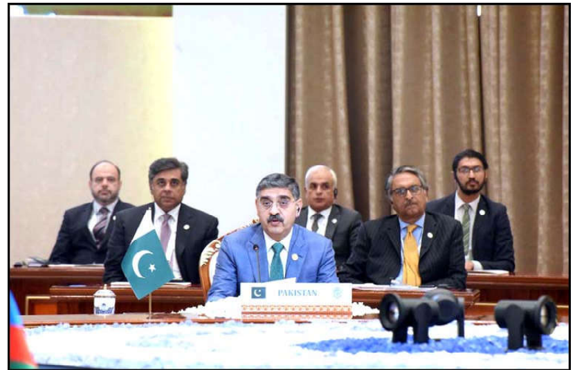
TASHKENT: The Caretaker Prime Minister Anwaar-ul-Haq Kakar addresses the 16th ECO Summit.

WASHINGTON (APP): Pakistan's Ambassador to the United States, Masood Khan, led tributes to Allama Iqbal at a special meeting marking his birth anniversary, saying the national poet-philosopher was "our ideological compass and lodestar".