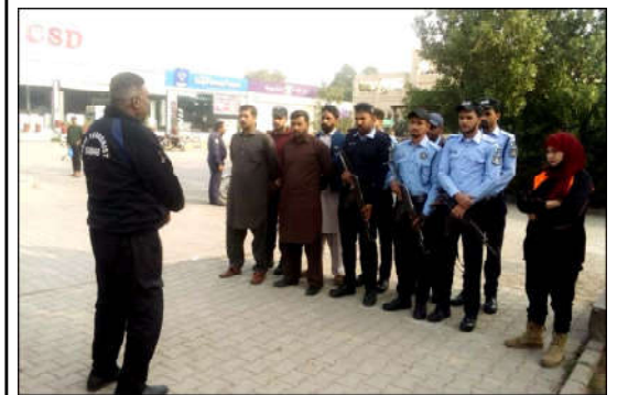
campaign for the registration of employees and tenants is in full swing, a public relations officer said. He said that, during this campaign various teams of Islamabad Capital Police are going to the streets and door-to-door to ensure the registration of tenants and domestic workers as well as to inquire about the prob-

lems faced by the citizens. In this regard, the Counter Terrorism Department (CTD) Islamabad has registered a data of 168 house servants of 362 houses from Bara Kahu Police Station jurisdiction.