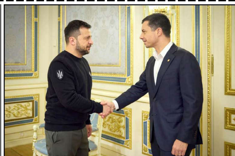
Ukrainian President Volodymyr Zelenskyy, left, shakes hands with US Secretary of Transportation Pete Buttigieg in Kyiv, Ukraine.

tries and said they would determine new areas of "strategic" cooperation. Oil-rich Kazakhstan and other Central Asian nations have maintained a delicate balancing act, preserving strong economic ties with Moscow but refusing to recognize its annexation of Ukrainian regions. The Russian leader has made few foreign trips since he sent troops into Ukraine in February 2022. The International Criminal Court's move to indict Putin in March for alleged war crimes connected to the deportation of children from Ukraine has affected his travel as any country