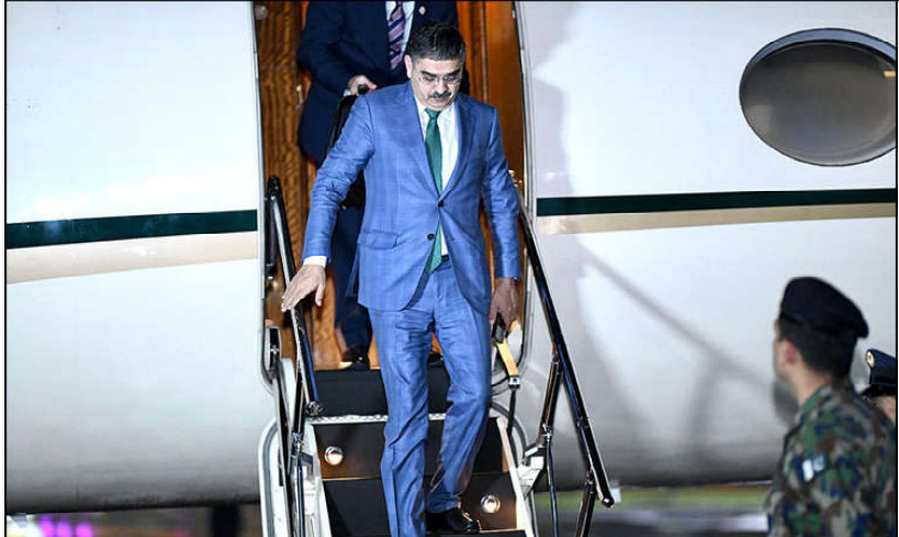
ISLAMABAD: Caretaker Prime Minister Anwaar-ul-Haq Kakar arrives after completing his two day official visit of Uzbekistan.