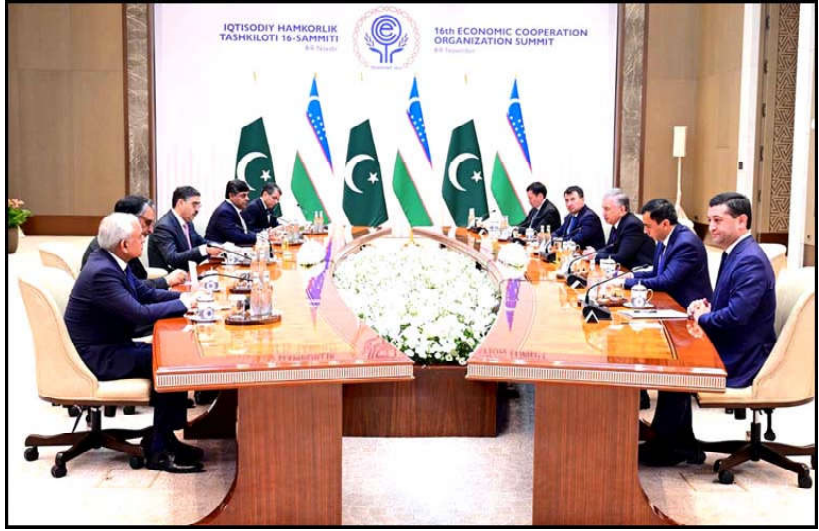
TASHKENT: Caretaker Prime Minister Anwaar-ul-Haq Kakar meets with the President of the Republic of Uzbekistan, Mr. Shavkat Mirziyoyev on the sidelines of 16th ECO Summit.

Vol. XIII No. 314 Reg. mails-B / ID-445 Thursday November 09, 2023, Rabi-us-Sani 24, 1445 A.H. Ph: 2158688, 2158997 Pages 4: Rs. 12