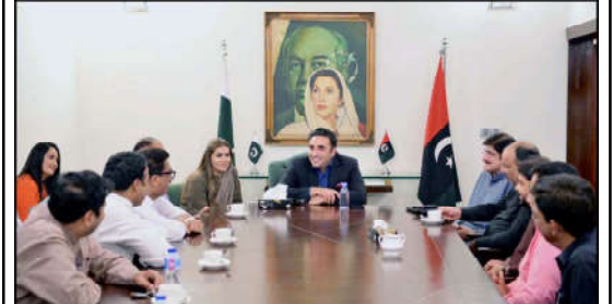
KARACHI: Peoples Party (PPP) Chairman, Bilawal Bhutto Zardari in meeting with Journalists of national newspapers, news channels and media houses, held at Bilawal House in Karachi.

Allama Mohammad Iqbal. The government has declared a public holiday nationwide to celebrate the day. Born in Sialkot on November 9, 1877, Dr. Iqbal is fondly remembered as the “Poet of the East.”