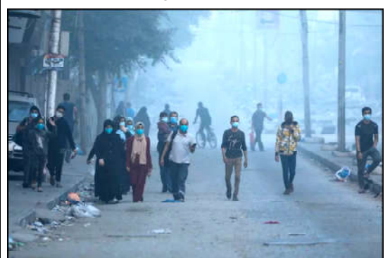
Palestinians flee their homes during Israel's ground offensive, on the edges of Beach refugee camp, in Gaza City.

camp, are the focus of Israel's campaign to crush Hamas, the militant group that has ruled Gaza for 16 years. The war, now in its second month, was triggered by the Oct. 7 Hamas attack on southern Israel. The number of Palestinians killed in the war passed 10,300, including more than 4,200 children, the Hamas-run Health Ministry in Gaza said Tuesday. In the occupied West Bank, more than 160 Palestinians have been killed in the violence and Israeli raids.