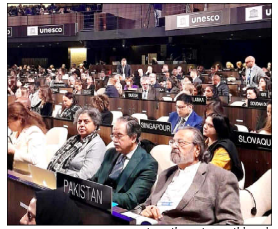
such as Sohan Halwa to inscribe as intangible cultural heritage in addition to three items already inscribed.

Speaking at the Session the Minister said that Pakistan is working diligently to ensure that every child, regardless of socio economic background, has access to quality education.