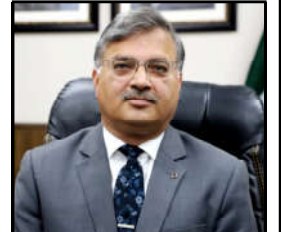
Chancellor of Allama Iqbal Open University. The president made the said appointment under section 11 of the Allama Iqbal Open University Act 1974, a President House press release said.