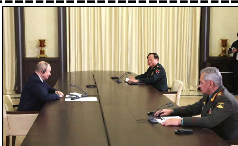
Russian President Vladimir Putin meets Defence Minister Sergei Shoigu and vice chairman of China's Central Military Commission General Zhang Youxia at the Novo-Ogaryovo state residence outside Moscow, Russia.

Biden argues that this century will be defined by an existential contest between democracies and autocracies. Putin, who heads the world's biggest nuclear power, said military cooperation between Moscow and Beijing was increasing and focused on high-tech areas that would ensure strategic security. "Of course, our cooperation, our contacts in the military and military-technical sphere are also becoming increasingly important, as for military-technical cooperation, here, of course, our work in high-tech spheres comes first," Putin said.