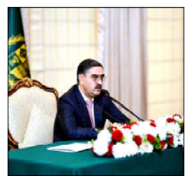
The monitoring team of the United Nations in its report released this July clearly highlighted that TTP centres based in Afghanistan were conducting terrorist operations against Pakistan.

He mentioned that 15 Afghan nationals were found involved in suicide bombings in Pakistan, while 64 Afghans got killed during their fight against the Pakistani law enforcement agencies. He said Afghan authorities were cognizant of these facts as Pakistan had been sharing these details with them since February this year through the fortnightly memorandums of protest.