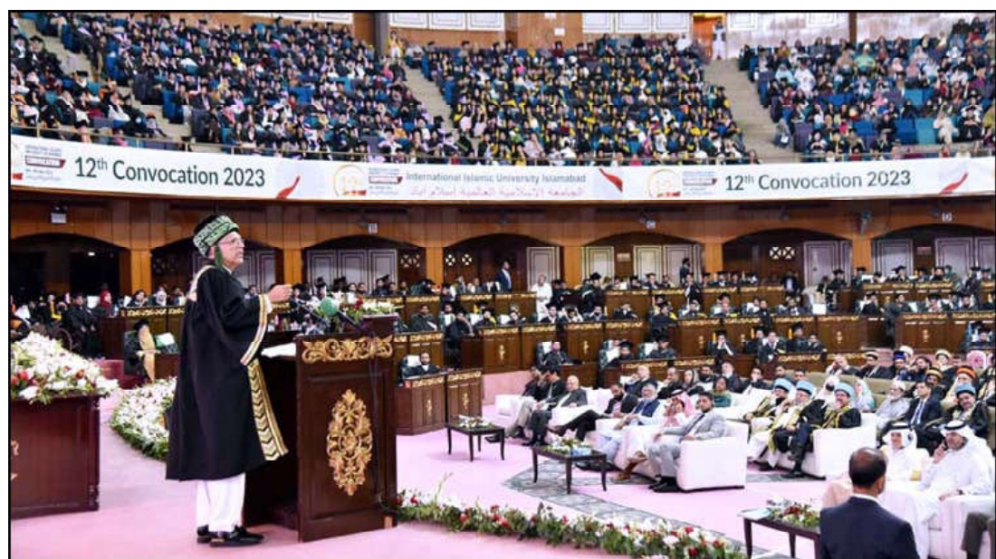
ISLAMABAD: President Dr Arif Alvi addressing the 12th Convocation ceremony of International Islamic University Islamabad.