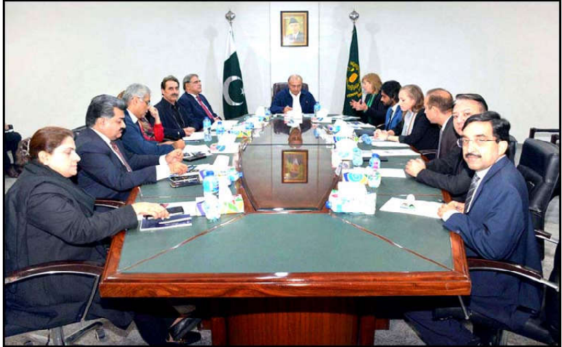
ISLAMABAD: US delegates meet Mr. Justice Syed Mansoor Shah at the Federal Judicial Academy.

He expressed good wishes for Saudi King Salman bin Abdulaziz and Crown Prince Muhammad bin Salman.