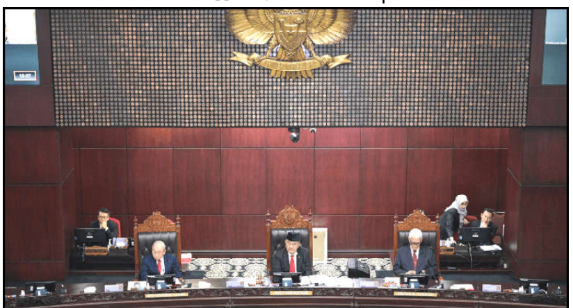
Honorary panel members of the Constitutional Court Jimly Asshiddiqie (C), Wahiduddin Adams (L), and Bintan Saragih (R) preside over a proceeding at the Constitutional Court in Jakarta.

Monitoring Desk MOSCOW: Russian Foreign Minister Sergei Lavrov accused the West on Wednesday of provoking crises on the global oil and gas market by rushing to switch to green energy and imposing pressure on other countries to do the same. "In fact, the reasons for the negative phenomena in the energy sector were the irresponsible actions of the collective West, when it decided to force... the green transition for itself and impose the same green transition.