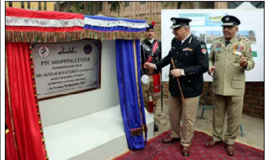
HANGU: Inspector General of Police Khyber Pakhtunkhwa Akhtar Hayat Khan laying the foundation stone of the shopping center built for women police at Gandapur Police Training College Hangu.

scheme for approval so that to not only ensure the long-term preservation of records available in the research cell, rather make the availability of these historical materials and literature possible for researchers through online facilitation. He expressed these views during a visit to the historical Tribal Research Cell, established under the Home and Tribal Affairs Department in Namak Mandi here. During the visit, the minister inspected various parts of the research cell and checked the historical records and official files of the pre-independence and post-independence periods related to the affairs of tribal areas.