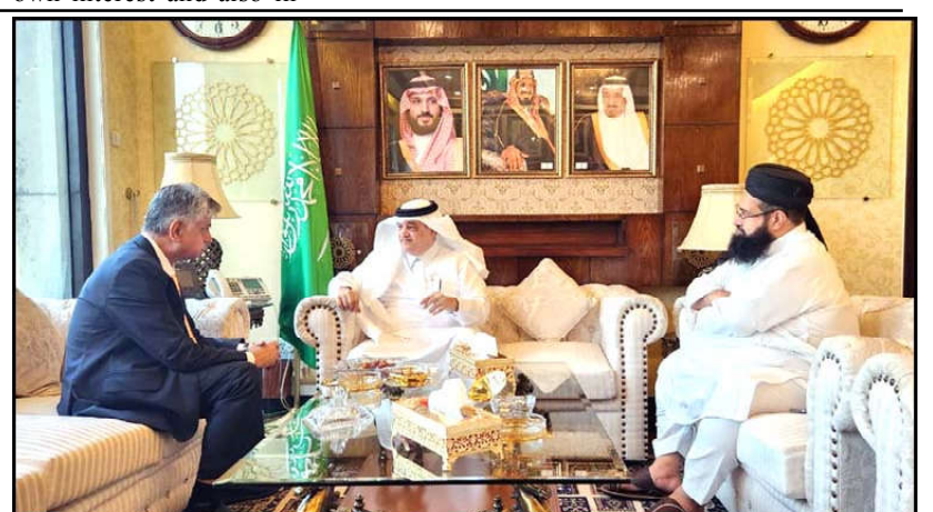
ISLAMABAD: Caretaker Federal Minister for Information and Broadcasting Murtaza Solangi in a meeting with Ambassador of Saudi Arabia to Pakistan Nawaf Saeed Al Malki

Prime Minister Kakar and President Mirziyoyev discussed on the ongoing humanitarian situation in Gaza and other regional and global developments.