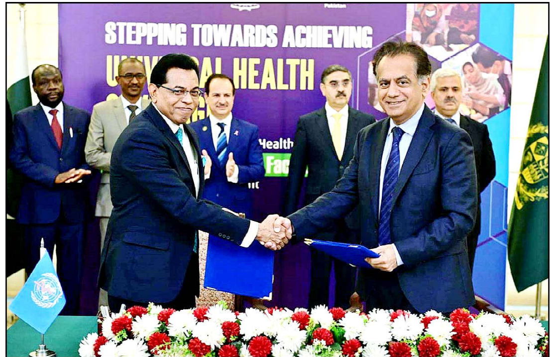
ISLAMABAD: Caretaker Prime Minister Anwaar-ul-Haq Kakar witnesses a ceremony of the signing of letters of understanding between WHO and the Government of Pakistan on Universal Healthcare

nutrition stabilisation centers in Punjab; and 150 health facilities, 46 labour rooms and six EPI training centers in Sindh. The WHO support for upgradation of the health facilities throughout the country will contribute to meeting the objective of Universal Health Coverage besides creating a better image of the government in the public for provision of decent health care services to them. This support will also contribute to the SDG 3 for good health and also SDG8 which is decent work environment and economic growth.