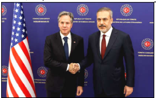
U.S. Secretary of State Antony Blinken meets with Turkish Foreign Minister Hakan Fidan, amid the ongoing conflict between Israel and the Palestinian Islamist group Hamas, at the Ministry of Foreign Affairs in Ankara, Turkey.

"We will pursue our partnership with military equipment, notably for the transport of troops protected by armour, which is key to maintain patrols," he said, adding that several dozen armoured vehicles would be given to the Lebanese army soon.