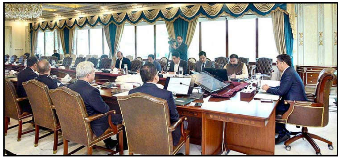
ISLAMABAD: Caretaker Prime Minister Anwaar-ul-Haq Kakar chairs a meeting regarding issues related to ICT.

city. The meeting was informed that 160 new buses would soon arrive in the city that would help making the public transport system in the city more effective. The prime minister directed that a central digital system should be made for registration of cars in all cities across the country including Islamabad. Fitness certificates should be issued for old vehicles based on the internationally accepted environmental pollution standards, he said.