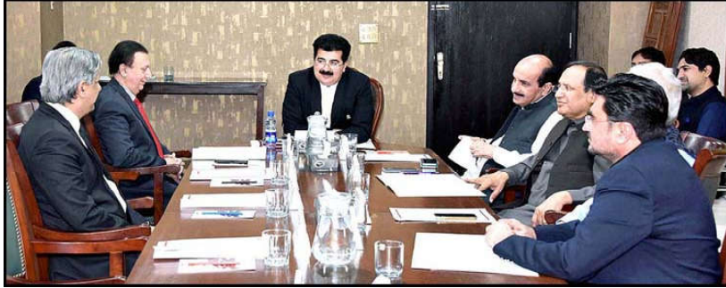
ISLAMABAD: Chairman Senate, Muhammad Sadiq Sanjrani presiding over a senate house business advisory committee meeting at Parliament House.