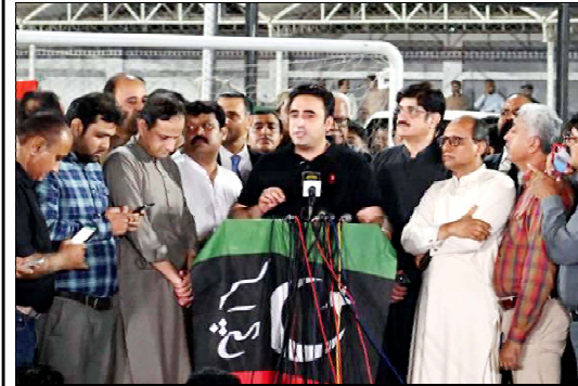
KARACHI: Chairman Pakistan Peoples Party (PPP) Bilawal Bhutto Zardari talking to media persons