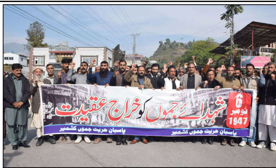
MUZAFFERABAD: Speaker Lagestaltive Assembly of AJK Chaudhry Latif Akbar participate in the rally of Pasban-e-Hurriyat to mark the "Youm-e-Suhada" in the Capital of AJK.

are struggling to survive amidst a catastrophic humanitarian crisis and the level of civilian casualties has been manifold and unprecedented. She strongly condemned the dangerous and insane remarks made by the Israeli Minister Amichai Eliyahu about dropping of a nuclear bomb on Gaza. Such comments and threats of violence reflect the irresponsible cruel attitude and criminal mindset, she said, adding it is not only morally reprehensible but also counterproductive to achieving lasting peace in the region.