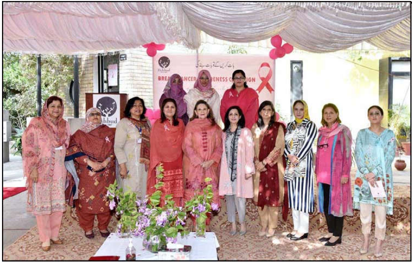
RAWALPINDI: First Lady Begum Samina Alvi in a group photo with medical professionals and survivors of breast cancer during an awareness seminar, at Behbud Association of Pakistan.