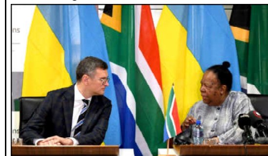
Ukrainian Foreign Minister Dmytro Kuleba looks on during his meeting with his South African counterpart Naledi Pandor, as they hold a joint press conference in Pretoria, South Africa.

Omdurman has repeatedly been the site of fierce battles between the two sides. Though most of the fighting was previously contained to the capital and the western region of Darfur, it has also spread to areas south of Khartoum according to witnesses.