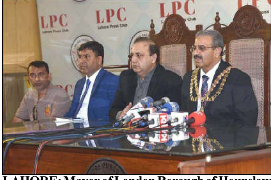
LAHORE: Mayor of London Borough of Hounslow Afzal Kayani is addressing press conference at the Press Club.

Hundreds of thoucluded in Raiwind on Sun- sands of people from day with special prayers across Pakistan and other led by Maulana countries attended the Muhammad Ibrahim for annual congregation in the prosperity and soli- Raiwind, about 36 kilomedarity of the country and ters from Lahore