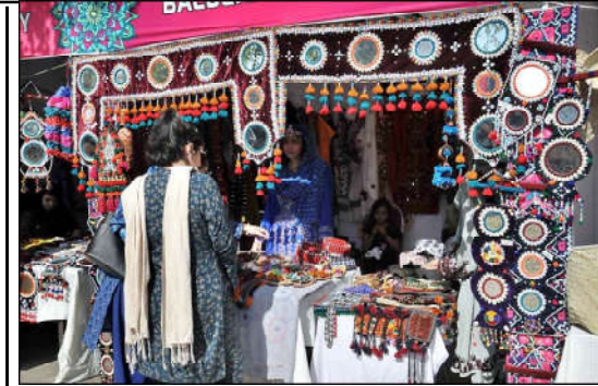
ISLAMABAD: People purchasing traditional items from stalls setup during Ten-Days 'Folk Festival Lok Mela' at Lok Virsa.

opportunities. economy, maintaining a He said this stable monetary policy confidence in the economic framework is essential for environment stimulates promoting sustainable entrepreneurship and development and creating innovation, leading to a favorable environment increased productivity and for both domestic and overall economic international investors, he prosperity.