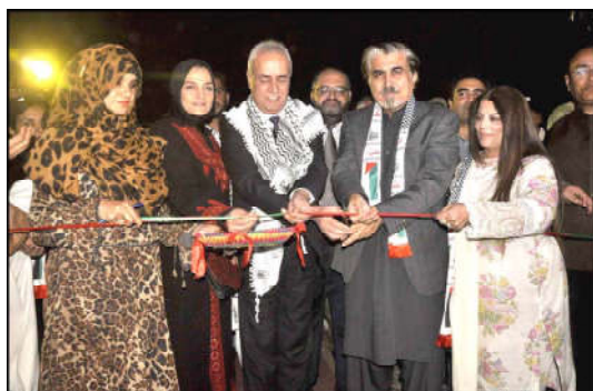
ISLAMABAD: Caretaker Federal Minister for National Heritage and Culture, Jamal Shah along with Palestinian Ambassador in Pakistan, Ahmed Jawad Rabei inaugurating the opening ceremony of 'Annual Ten-Day Folk Festival Lok Mela at Lok Virs'.

ISLAMABAD (APP): Minister for National Heritage and Culture Jamal Shah Friday disclosed to launch of a dedicated heritage channel to promote the regional literature of Pakistan soon which will create awareness among the young generation about their regional languages and rich lingual identities.