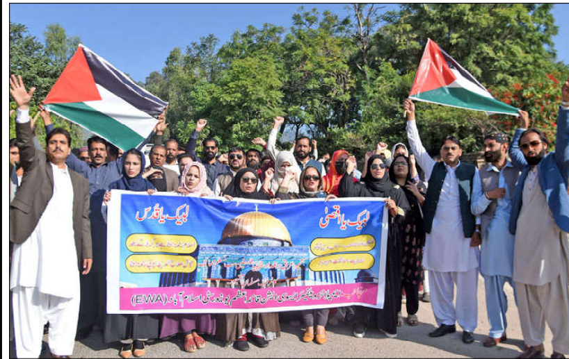
ISLAMABAD: Activists of Quaid-e-Azam Employees Welfare Association are shouting slogans during protest outside University top show solidarity with the oppressed Muslims of Palestine.