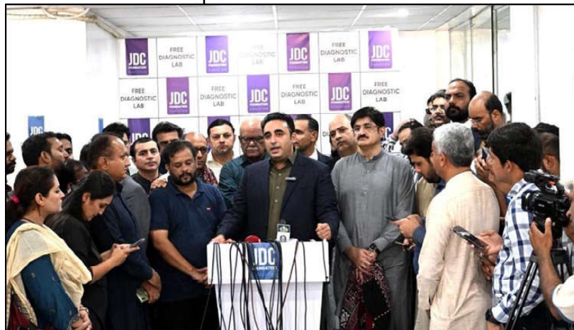
KARACHI: Peoples Party (PPP) Chairman, Bilawal Bhutto Zardari talking to media persons after inaugurating ceremony of Free Diagnostic Lab set up by JDC Foundation Pakistan.

Replying to a question about the folk mela started in Islamabad, he said the skills of the country. He said that this unique event has become a symbol of the federation's recognition and patronage of our rich cultural diversity and the active participation of the people. He further said that traditional Mela is a part of government priorities as it aims to encourage initiatives related to public welfare, promotion, and development of Pakistan's culture, and to provide meaningful and wholesome entertainment opportunities to the citizens.