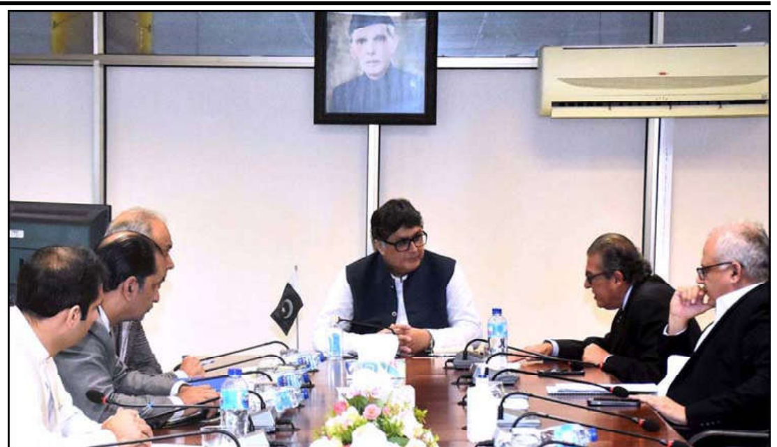
ISLAMABAD: Federal Minister for Privatisation, Fawad Hasan Fawad chairing a meeting with FA on FWBL.

The SBP governor, speaking at the occasion, termed the MoU a significant strategic achievement.