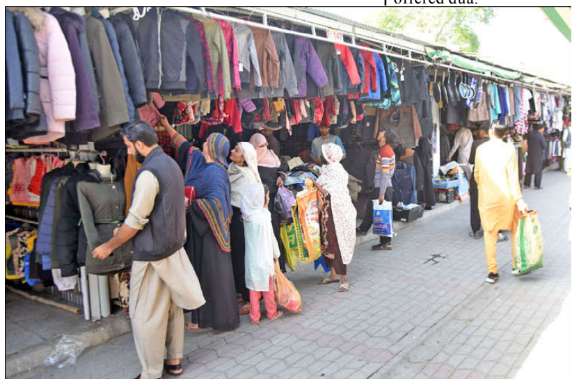
ISLAMABAD: People are visiting clothes Section at Weekly Friday Market of Sector H-9 in Federal Capital.

ISLAMABAD (APP): China will strive to establish a preliminary innovation system for humanoid robots by 2025, amid the country's push to develop the future industry, according to a recent guideline. The country will boast several small and medium-sized enterprises that specialize in the humanoid robot market and have cutting-edge technologies, and two to three humanoid robot companies with global influence by 2025, according to the guideline issued by China's Ministry of Industry and Information Technology. By 2027, China will see a secure and reliable industrial and supply chain system and related products will be deeply integrated into the real economy, the guideline stated. Specifically, the country will work on consolidating the production of basic components and promoting software innovation in terms of product development, while creating scenarios for manufacturing and other related sectors.