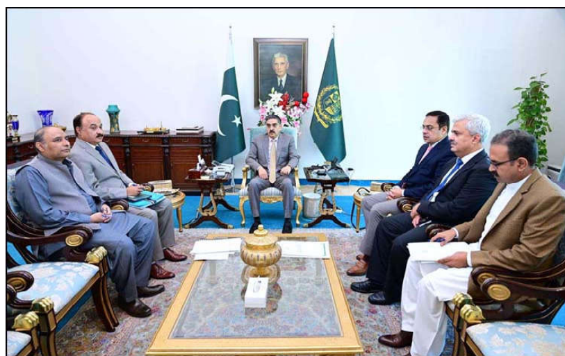
ISLAMABAD: Caretaker Prime Minister Anwaar-ul-Haq Kakar chairs a meeting regarding progress of filling up of vacant seats for marginalized areas in civil bureaucracy through special examinations as well as rotation policy.

The Chief Minister said that the incidents of terrorism are conspiracy of spoiling peace in the province. Mir Ali Mardan Domki also said that we would not let destroy peace that was restored after great sacrifices.