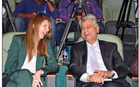
ISLAMABAD: British High Commissioner to Pakistan Jane Marriott and Caretaker Information Minister Murtaza Solangi during 9th Islamabad Literature Festival at Fatima Jinnah (F-9) Park in Federal Capital.