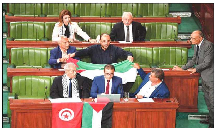
Members of Tunisia's parliament hold the Palestinian flag as they observe a minute of silence for civilian deaths in the Gaza Strip.

The speech came a day after the most significant escalation in clashes between Hezbollah and Israeli forces on the border since the war started and on the same day as a visit to Israel by the top US diplomat. US Secretary of State Antony Blinken met with Israeli Prime Minister Benjamin Netanyahu to urge protections for civilians in the fighting with Hamas, as Israeli troops tightened their encirclement of Gaza City.