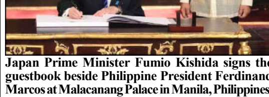
Japan Prime Minister Fumio Kishida signs the guestbook beside Philippine President Ferdinand Marcos at Malacanang Palace in Manila, Philippines.

Both the Philippines and Japan, two of the United States' closest Asian allies, have taken a strong line against what they see as aggressive behaviour by China.