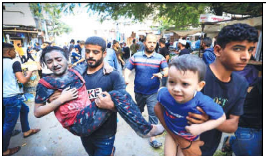
A man carries away an injured girl following an Israeli strike on the Bureij refugee camp, in Gaza Strip.

The eight biggest Western donors to Ukraine led by the United States have made military commitments to Ukraine totalling at least 84 billion euros ($90 billion), according to the Kiel Institute for the World Economy, which tracks donors. U.S. military support includes 160 155mm howitzers, 109 Bradley fighting vehicles, more than 111 million rounds of small arms ammunition and 38 high mobility artillery rocket systems.