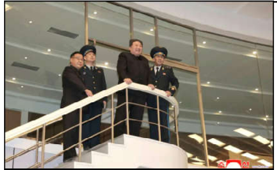
North Korean leader Kim Jong Un watches conditions of a satellite at a satellite control center in Pyongyang.

The Russian leader addressed the 2021 and 2020 summits from Moscow. He last attended a G20 gathering in person in Osaka, Japan, in 2019.