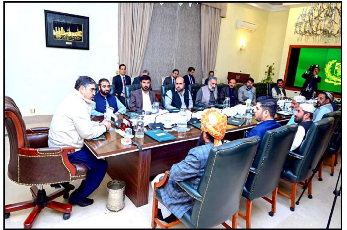
ISLAMABAD: A delegation of the Zameendar Action Committee of Balochistan called on Caretaker Prime Minister Anwaar-ul-Haq Kakar.

The Federal Government would ensure protection of the rights of the people of all provinces, including the KP, he added.