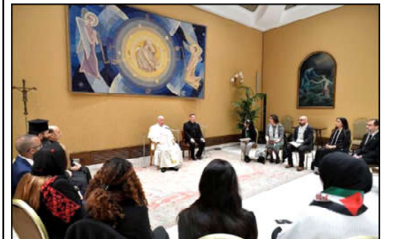
Pope Francis meets with Palestinians whose relatives are stranded in Gaza, amid conflict between Israel and the Palestinian Islamist group Hamas, at the Vatican.

Both sides should work together to promote "positive" and "friendly" mutual understanding, said Cai, also the five-ranked member of the CPC's seven-person Politburo Standing Committee, the highest tier of political power in China helmed by President Xi Jinping. The visit came on the heels of rare face-to-face talks between Xi and Japanese Prime Minister Fumio Kishida, also LDP's leader, on the sidelines of an Asia Pacific Economic Cooperation (APEC) summit.