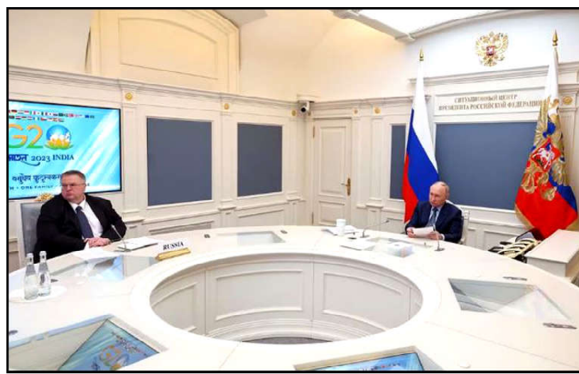
Russian President Vladimir Putin and Deputy Prime Minister Alexei Overchuk attend the G20 virtual summit via a video link in Moscow, Russia.