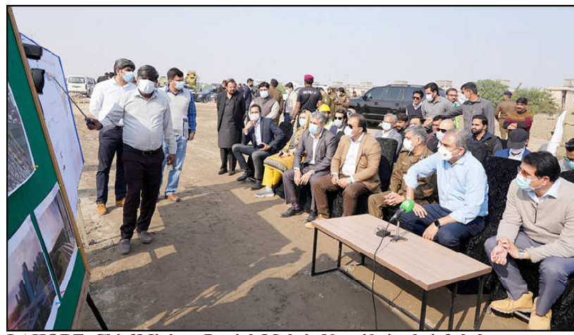
LAHORE: Chief Minister Punjab Mohsin Naqvi being briefed about progress on Walton Road and ADA drain remodeling & upgradation, Cavalry underpass and Centrepoint to Walton Road CBD Punjab Quaid District projects.

Zeeshan Khan provided insights into the functioning and role of the Election Commission of Pakistan, shedding light on the preparations involved in the election process, including voting and result tabulation.