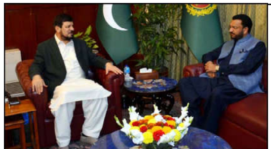
PESHAWAR: Caretaker Federal Minister for Human Rights Khalil George meeting with Khyber Pakhtunkhwa Governor Haji Ghulam Ali.

Hydropower plants can not only meet the needs of electricity in the province.