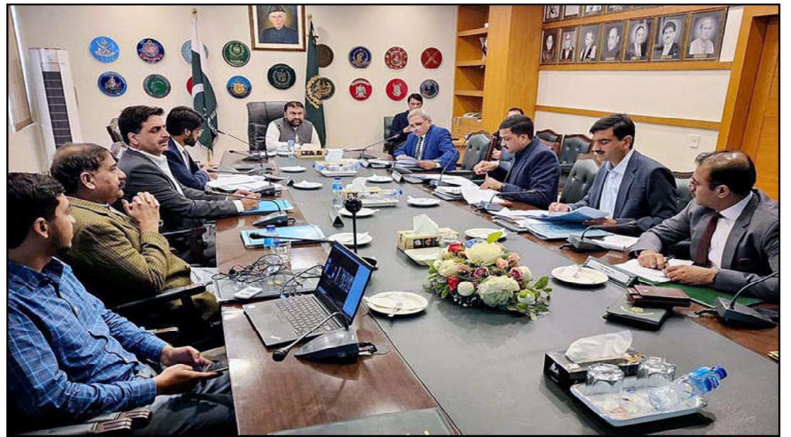
ISLAMABAD: Caretaker Federal Minister for Interior Sarfraz Ahmad Bugti chairing a meeting of the Cabinet Sub-Committee on ECL.