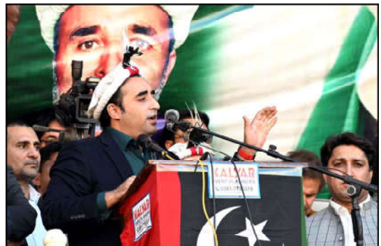
CHITRAL: Peoples Party (PPP) Chairman, Bilawal Bhutto Zardari addresses to his workers during Workers Convention held in Chitral.

He said the people of KP would reject all those political parties who failed to deliver despite remaining in power for nearly 10 years in KP.