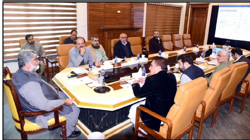
QUETTA: Caretaker Chief Minister Balochistan Mir Ali Mardan Khan Domki presiding over a meeting to review progress of Pirkoh Water Supply Scheme