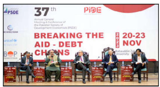
PIDE's approach suggests improving the system first

Dr Mahmood Khalid said the current focus on taxing more ignored the burden it imposed, adding "Our complex tax system and regulatory landscape contribute to a high regulatory burden. Pakistan ranks low in ease of paying taxes, discouraging firms from growth and formalization.