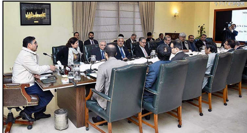
ISLAMABAD: The Caretaker Prime Minister Anwaar-ul-Haq Kakar chairs a meeting on preparations with regard to COP-28.