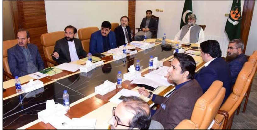
QUETTA: Caretaker Chief Minister Balochistan Mir Ali Mardan Khan Domki being briefed during meeting regarding Quetta Metropolitan Corporation