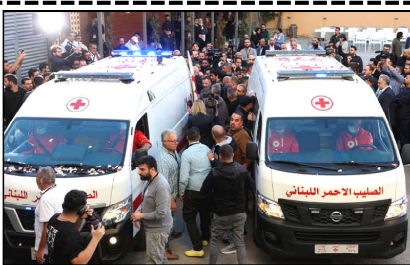
Ambulances carrying the bodies of the two journalists of Lebanon-based Al Mayadeen TV channel, who it says were killed by an Israeli strike, are parked outside the channel's building, in Beirut, Lebanon.

"There are only children and women in the house and no one else," exclaimed one resident.