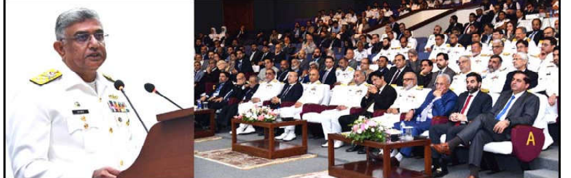
KARACHI: Chief of the Naval Staff, Admiral Naveed Ashraf addresses during the 5th Pakistan Navy (PN) Industrial Seminar and Exhibition 2023 held at Bahria Auditorium in Karachi.

He emphasised, "This necessitates close cooperation of the defence sector with local industry and educational institutions. This industrial seminar will provide significant opportunity for local industries to showcase their potential to support Pakistan Navy which is a technologically intensive armed force of Pakistan," he said. Appreciating the response of private sector in a technologically challenging environment, Chief of the Naval Staff said that Pakistan Navy and local industries will together attain our aim of self-reliance. Speakers from different organizations also highlighted the importance of indigenization and self-reliance.