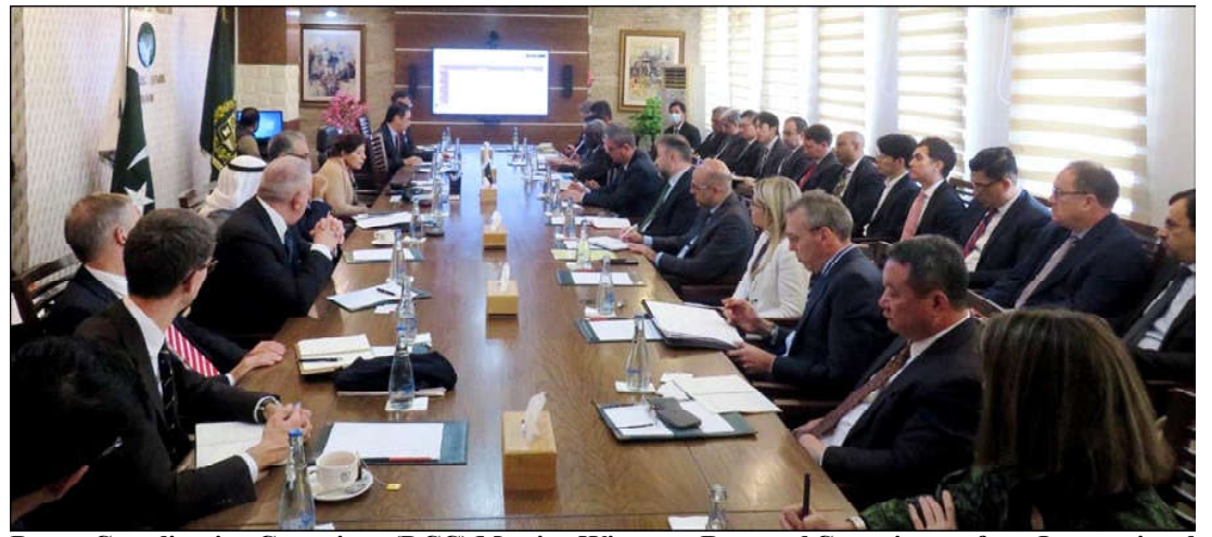
Donor Coordination Committee (DCC) Meeting Witnesses Renewed Commitment from International Development Partners to Foster Pakistan's Economic Growth. The meeting was chaired by the Caretaker Federal Minister for Finance, Revenue & Economic Affairs, Dr. Shamshad Akhtar at Ministry of Economic Affairs, Islamabad

Representatives from the World Bank, EU, ADB, USAID, UNDP, Germany, Japan, WFP, IsDB, IFAD, and others expressed congratulations on the successful IMF review. The development partners pledged continued support to the Government of Pakistan and acknowledged the importance of transparency, alignment with government priorities, and the need for timely disbursement of committed support.