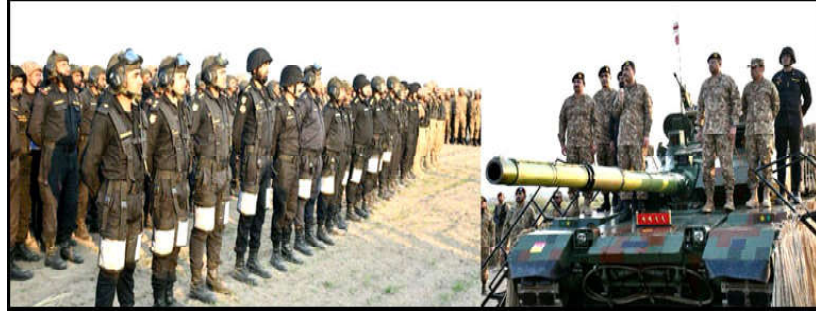
RAWALPINDI: Chief of Army Staff (COAS), General Syed Asim Munir interacting with the troops participating in Corps Level Collective Training exercise of Strike Corp aimed at validating offensive operational concepts

transparent election process in the country. The caretaker government was committed to conduct free and fair elections, Solangi added. He said the government would provide all necessary resources and support to the Election Commission of Pakistan. The minister reiterated the commitment that elections would be ensured in a transparent and credible manner.