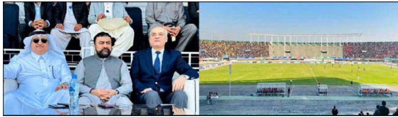
ISLAMABAD: Caretaker Federal Minister for Interior, Sarfraz Ahmed Bugti witnessing the Pakistan vs Tajikistan FIFA World Cup Qualifier match as Chief Guest.

The meeting was informed that the regional welfare committees have been formed with cooperation of civil society in some areas of the city.