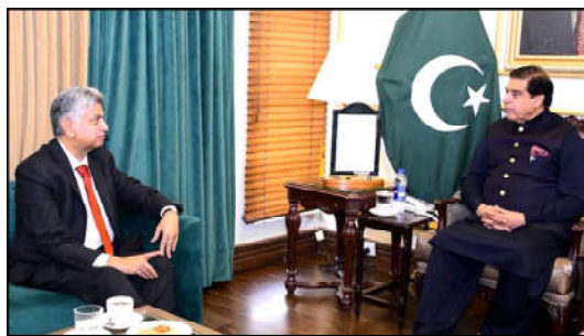
ISLAMABAD: Caretaker Federal Minister for Information and Broadcasting Murtaza Solangi called on Speaker National Assembly Raja Pervez Ashraf.

ISLAMABAD (APP): Caretaker Minister for Foreign Affairs Jalil Abbas Jilani on Tuesday informed the Senate that the Federal Investigation Agency (FIA) has busted two-three gangs of beggars who were trying to travel to Saudi Arabia under the garb of Ummrah. Replying to various supplementary questions during Question Hour, the minister said that around 2.5 million Pakistanis were working in Saudi Arabia. Round the clock helpline has been established in the Pakistani Embassy in Riyadh and Consulate General in Jeddah to address their complaints, he added. He said hundred of thousands telephone calls received which were not only noted but also making all out efforts to address it. He said some 500,000 visas were issued to Pakistani last year for employment. The Saudi authorities have also given the assurances to provide jobs to those facing employment related problems at alternative companies, he added.