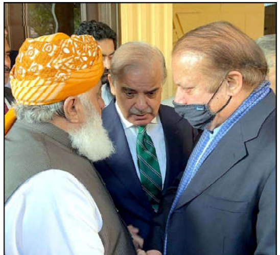
ISLAMABAD: Chief of Jamiat Ulema-e-Islam (F) Maulana Fazlur Rehman welcoming PML-N quaid Muhammad Nawaz Sharif and Shehbaz Sharif on their arrival at his residence

tariat. He acknowledged being unaware of the context in which the statement was made but reiterated Pakistan's stance in favor of a two-state resolution for the Palestinian issue. He emphasized the need for Israel's withdrawal to its pre-1967 borders and the resolution of the matter in accordance with UN Resolution 242 and OIC resolutions. Highlighting that a clarification was issued after this statement, the minister mentioned that it was sent to the OIC Secretariat and UN institutions. He further noted that the clarification was also disseminated through both domestic and international media.