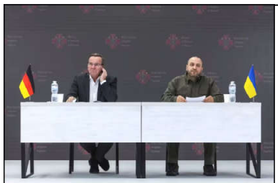
Ukraine's Defence Minister Rustem Umerov and German Defence Minister Boris Pistorius attend a joint news conference, amid Russia's attack on Ukraine, in Kyiv, Ukraine.

Ramaphosa will chair the "extraordinary meeting" because of South Africa's position as current chair of BRICS, his office said. It said the leaders are expected to deliver statements on the "humanitarian crisis" in Gaza and will likely adopt a joint statement. The meeting comes a day after China's top diplomat hosted the foreign ministers of Saudi Arabia, Egypt, Jordan, the Palestinian Authority and Indonesia in Beijing.