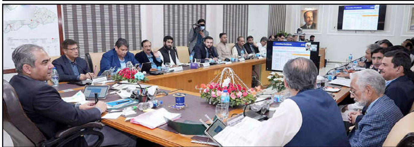
GUJRANWALA: Caretaker Chief Minister Punjab Mohsin Naqvi presides over the Punjab cabinet meeting first time held in Gujranwala.