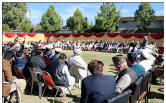
A view of Grand Jirga for the maintenance of regional law and order and negotiations between the parties in Sada, Lower Tehsil Headquarters of the tribal district of Kurram.

Regarding repatriation of the Afghan refugees, the Governor said that it was the decision of the state must be accepted by everyone, adding that Pakistan and Afghanistan are two Islamic brotherhood countries and Pakistan has hosted Afghan refugees for more than forty years.