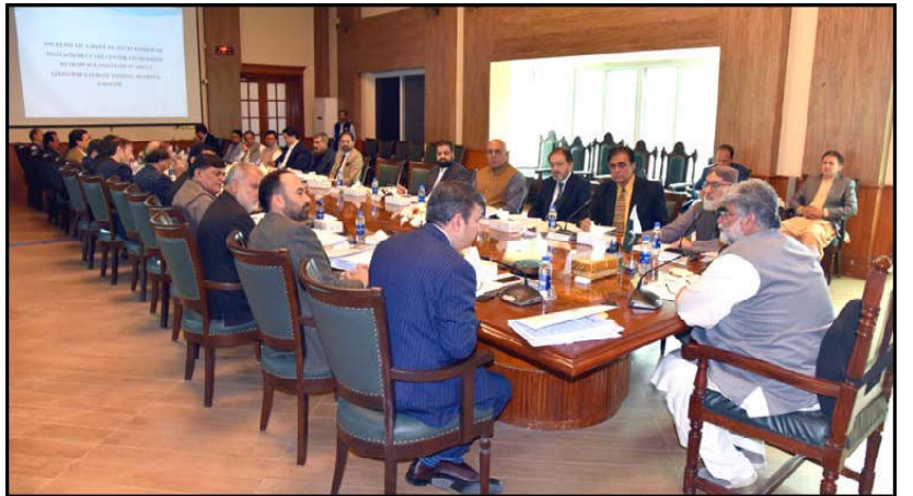
QUETTA: Caretaker Chief Minister Balochistan Mir Ali Mardan Khan Domki presiding over meeting of Provincial Cabinet

he said. He expressed satisfaction that the PAF modernized itself though smart induction of cutting-edge niche technology and achieved great progress in cyber space and non-contact warfare through indigenous means. PM Kakar termed the armed forces of Pakistan as professionally competent and well-trained to cope with all internal and external challenges. "The nation holds our armed forces in high esteem for the sacrifices they rendered for national defence and for their contribution towards nation-building," he said. He mentioned that the country's brave armed forces always showed great courage during testing times to keep the national flag high.