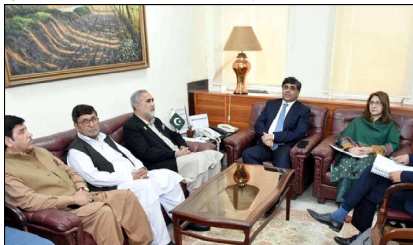
ISLAMABAD: Caretaker Federal Minister of Commerce and Industry, Dr. Gohar Ejaz meeting with representatives from Khyber Chamber of Commerce and Industry.