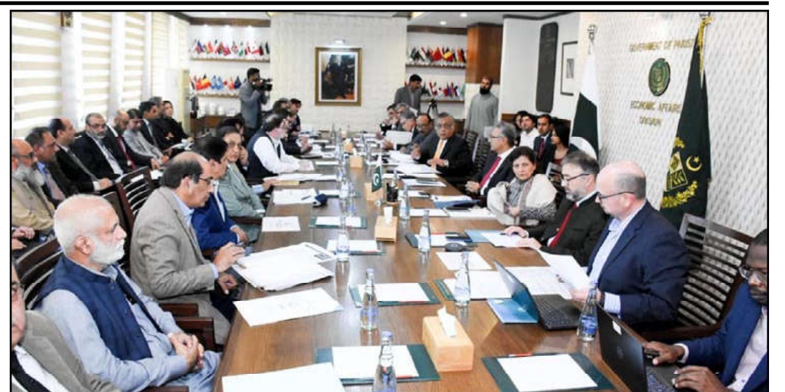
ISLAMABAD: Caretaker Federal Minister for Finance, Revenue & Economic Affairs, Dr. Shamshad Akhtar chaired the Portfolio Review Meeting of Foreign Funded (Federal) Projects at Ministry of Economic Affairs.

She also appealed to donors for expertise and technical assistance to ensure timely implementation for the benefit of Pakistan's socio-economic development.