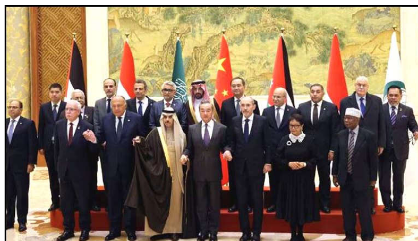
Chinese Foreign Minister Wang Yi attends a family photo session with Saudi Foreign Minister Prince Faisal bin Farhan Al Saud, Jordanian Deputy Prime Minister and Foreign Minister Ayman Safadi, Egyptian Foreign Minister Sameh Shoukry, Indonesian Foreign Minister Retno Marsudi, Palestinian Foreign Minister Riyad Al-Maliki and Organisation of Islamic Cooperation (OIC) Secretary-General Houssein.

not criticized the initial Hamas attack on Oct 7 — which killed about 1,200 people — while the United States and others have called it an act of terrorism. However, China does have growing economic ties with Israel. The Saudi foreign minister, Prince Faisal bin Farhan Al Saud, called for an immediate cease-fire and the entry of humanitarian aid and relief to the Gaza Strip. "There are still dangerous developments ahead of us and an urgent humanitarian crisis that requires an international mobilization to deal with and counter it," he said.