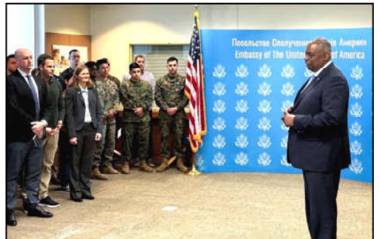
U.S. Secretary of Defense Lloyd Austin, right, speaks to employees of the U.S. embassy in Kyiv.

and gunfire were evident. The team saw a mass grave at the entrance of the hospital and was told that more than 80 people were buried there," said a WHO report released on Sunday. "Patient deaths have occurred over the previous two to three days due to the shutdown of medical services," it said. "Lack of infection control measures and antibiotics has resulted in severely infected wounds, particularly in trauma patients," it added. The report expressed deep concern, urging immediate efforts to restore functionality to Al Shifa and other hospitals.