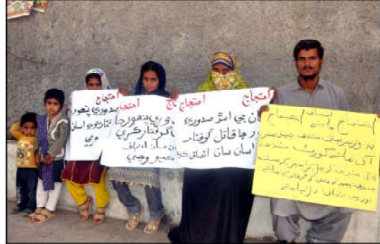
HYDERABAD: Residents of Dadu are holding protest demonstration against high handedness of police, at Hyderabad press club.

It is said in written order that Punjab government is taking steps regarding working from home on 2 days in the week. The word of gym closure is suspended in the notification. In the written order of the court, it is said that the meteorological department should take departmental action against officers who do not take action against smog.