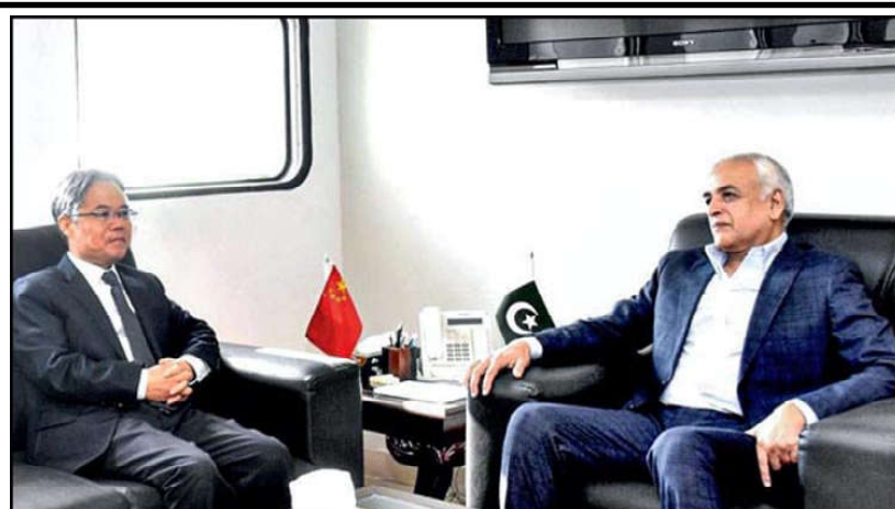
ISLAMABAD: Federal Minister for Communications, Railways & Maritime Affairs Mr. Shahid Ashraf Tarar hosting a meeting with Chinese Ambassador Mr. Jiang Zaidong at the Ministry.

Chief Minister Punjab was the Chairman of the boards of governors. He stated that by taking some measures, Pakistan's arts and culture could be turned into a billion dollar industry.