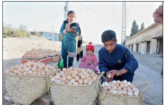
QUETTA: A school-going boy selling eggs to support his family at a roadside near Koyla Patkha.

"We are fully committed to working with the Pakistani side, and our joint efforts aim to accelerate the realization of the ML-I project," he added. The meeting concluded with both parties reaffirming their dedication to the successful implementation of the ML-I project, a symbol of the enduring friendship and strategic partnership between Pakistan and China.