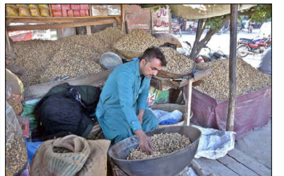
RAWALPINDI: A vendor displaying peanuts to attract the customers at Rawat.