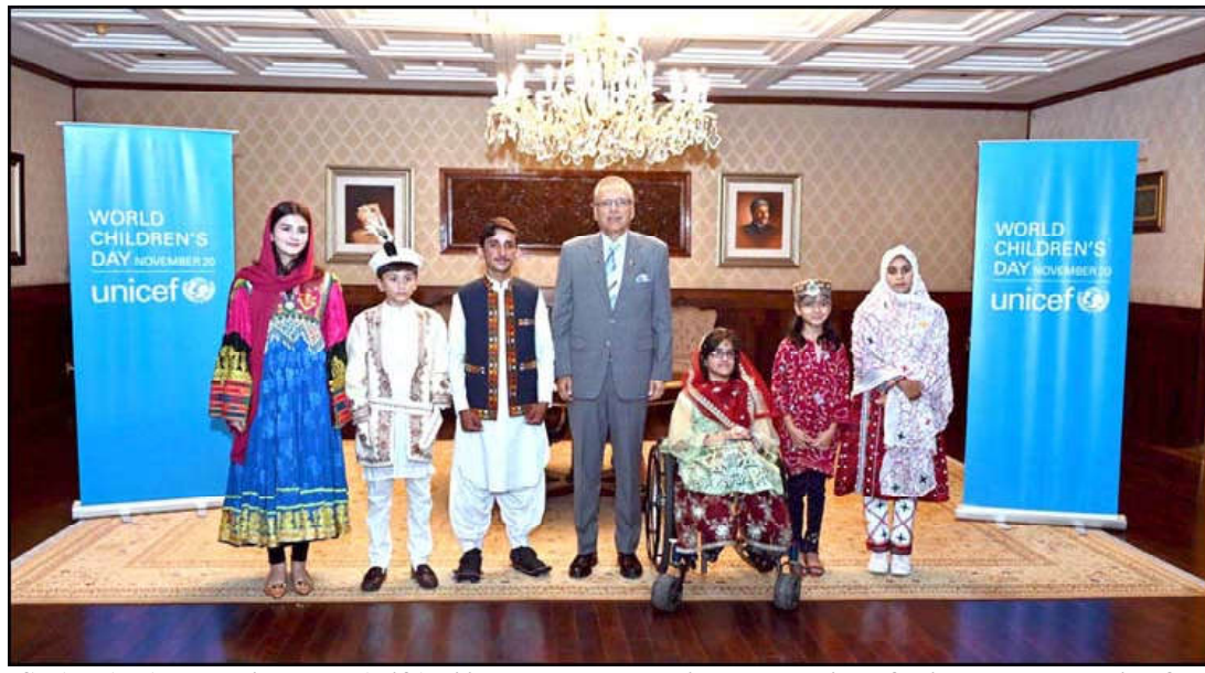
ISLAMABAD: President Dr. Arif Alvi in a group photo with a delegation of children representing four provinces, as well as, Gilgit-Baltistan and Azad Jammu and Kashmir nominated by the United Nations Children's Fund (UNICEF) at Aiwan-e-Sadr.

tire world. He said the recent visit of Prime Minister Anwar-ul-Haq Kakar to China will further strengthen cooperation in various fields including security. He expressed the confidence that next target was to implement the agreements made during the Prime Minister's visit. He also commended the Chinese President Xi Jinping's global security initiative. Sarfraz Bugti said that all possible measures have been taken to ensure the security of Chinese citizens in Pakistan. He said terrorism was a challenge, we have defeated it in the past, and will eradicate it completely in future as well.