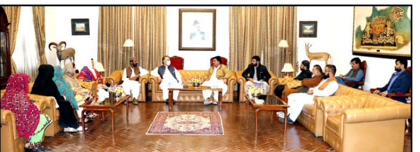
QUETTA: A delegation led by chief of Balochistan Youth Alliance Bahadur Khan Lango meeting with Governor Balochistan Malik Abdul Wali Khan Kakar

Similarly, the Balochistan police has been provided vehicles, modern equipment and goods to the police force, he mentioned adding that we appreciate the US cooperation for prevention of the terrorism and crimes and putting the investigation process on modern lines.