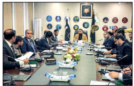
ISLAMABAD: Caretaker Federal Minister for Interior Sarfraz Ahmed Bugti chairing a meeting of ministerial committee on enforced disappearances.

He also said that during the tenure of the Pakistan Tehreek-e-Insaf government, the SBP had been granted more autonomy.