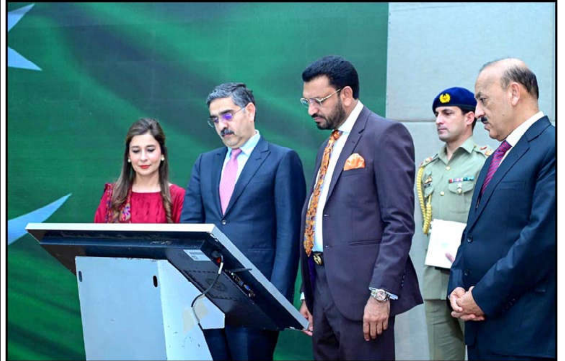
ISLAMABAD: The Caretaker Prime Minister Anwaar-ul-Haq Kakar launches ZARRA mobile app on the eve of Universal Children's Day

The government and non-government organizations and the society as a whole should contribute towards the noble cause of safeguarding the children rights and to make their future safe and prosperous, he added.