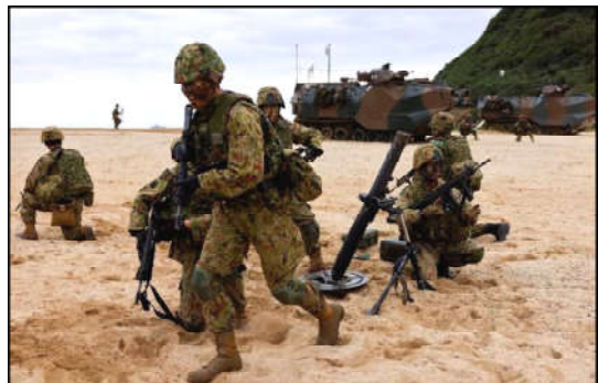
Japanese Ground Self-Defense Force's Amphibious Rapid Deployment Brigade (ARDB) soldiers take part in a marine landing drill as a part of the country's nationwide 05JX military exercises at Tokunoshima island, Kagoshima prefecture, southwestern Japan.