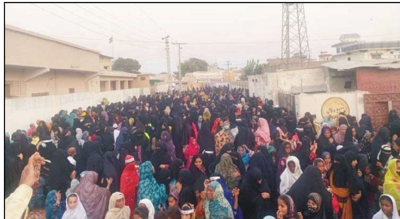
GWADAR: Women are participating in protest organized by Haq Do Threek.

"We can create an economic market for a huge benefit for three billion people living in South Asia, China, Central Asia, and the Middle East through regional connectivity," he added. He said that therefore, programs like CPEC and BRI could help people eliminate poverty and unemployment and realize the dream of shared prosperity as well as people-to-people contact.