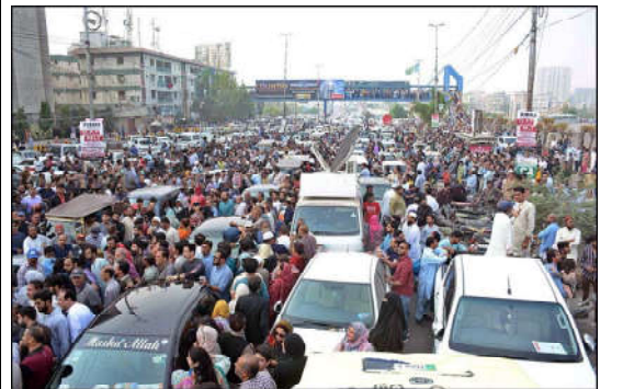
KARACHI: Parents of students waiting outside Expo Centre as the Medical and Dental College Admission Test (MDCAT) 2023-24 is being held.