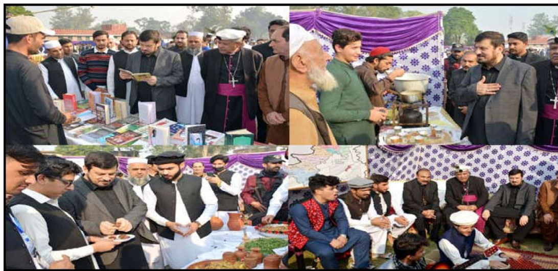
PESHAWAR: Khyber Pakhtunkhwa Governor Haji Ghulam Ali inspecting the various stalls during culture day at Edwards College Peshawar.

RAWALPINDI (APP): The Dadocha Dam would help overcome water shortage in Rawalpindi as after construction of the dam, it would supply 35 million gallons of water per day to Rawalpindi city, said Commissioner Rawalpindi Division, Liaquat Ali Chhatta. He said that water scarcity has become a global problem and different countries are considering different ways to meet the shortage. Pakistan is also one of the countries suffering from a water crisis, the Commissioner said. Due to the non-construction of dams, per capita availability of water here has decreased four times during the last 50 years, Liaquat Ali Chhatta said. Due to the shortage of dams, millions of cusecs rainwater is wasted every year or causing floods, he added. The government of Punjab is giving priority to the problem of water scarcity and is paying special attention to the construction of small dams, he said and informed that the approved cost of the dam being built in Dadocha village near Rawat Industrial Estate was Rs 6492 million, which would now be estimated again.