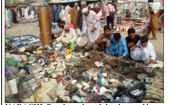
KARACHI: People are busy buying used items in a Sunday weekly bazaar at North Karachi area.