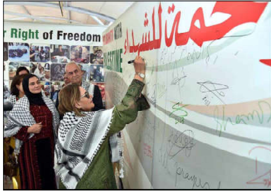
ISLAMABAD: First Lady Begum Samina Alvi visiting the Palestinian stall and expressing her condolences for the martyrs of Gaza, at Pakistan Foreign Office Women's Association's Annual Charity Bazar.

Chaudhry Shujaat said reconciliation should be promoted in the country, and all parties should play their role to nurture the tradition. He said that society was in dire need of tolerance and for the purpose, political leadership should play its role.