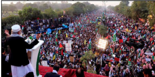
LAHORE: Ameer Jamaat-e-Islami Siraj-ul-Haq addressing the Gaza March in front of Punjab University.