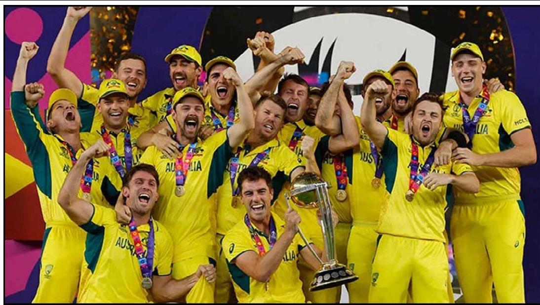
Australia's Pat Cummins celebrates with the trophy and teammates after winning the ICC Cricket World Cup.