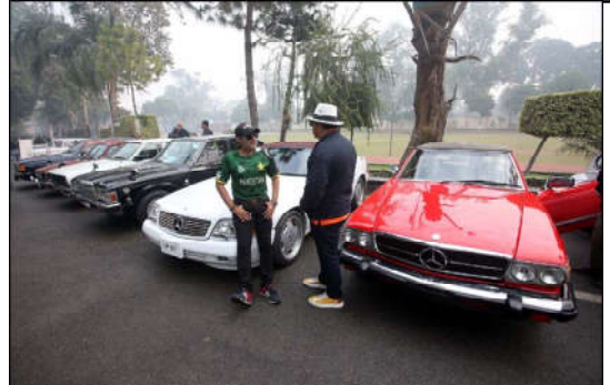
PESHAWAR: Visitors take keen interest in antique vehicles during Annual Vintage and Classic Car Show 2023 held at Services Club Pakistan in Peshawar.