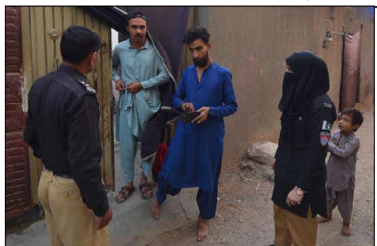
KARACHI: Police personnel knock at the door of Afghan refugees during a search operation to identify alleged illegal immigrants, on the outskirts of Karachi.