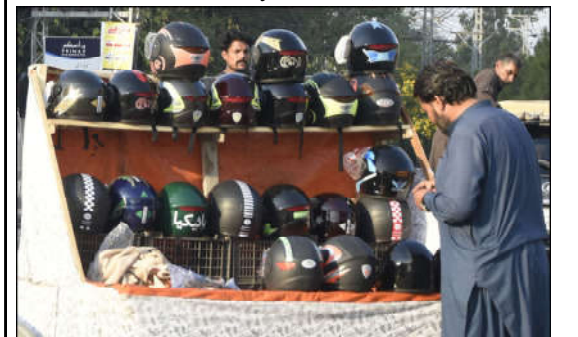
RAWALPINDI: A vendor is displayed motorcycle helmets on his pushcart along a Murree road in the city.

The BOI has also established an online database featuring 120+ projects, enabling international investors to target investment areas and projects. To foster international relations, Honorary Investment Counselors (HICs) have been appointed in different countries, aiming to encourage foreign investors to invest in Pakistan, he said.