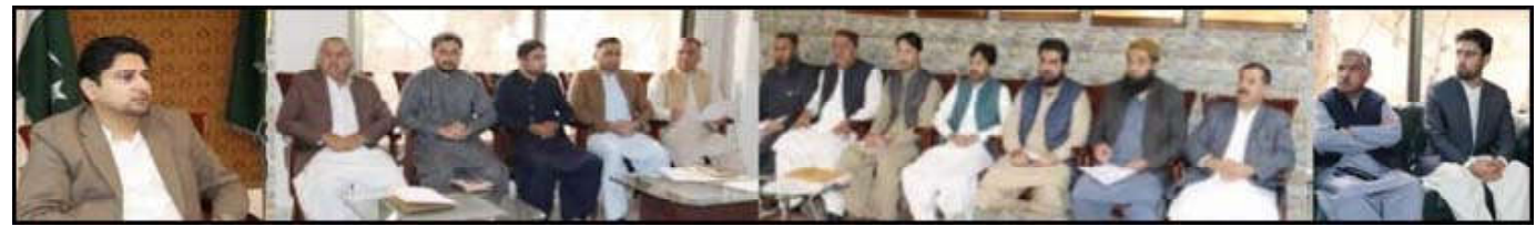
QUETTA: Deputy Commissioner Quetta Saad Bin Asad presides over meeting regarding improvement of traffic system in city.