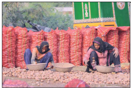
MULTAN: Women workers sorting potatoes at Vegetable Market.

"The project will expand the high-voltage transmission network to close 500 kilovolt (kV) and 220 kV transmission lines loops and reduce transmission losses in