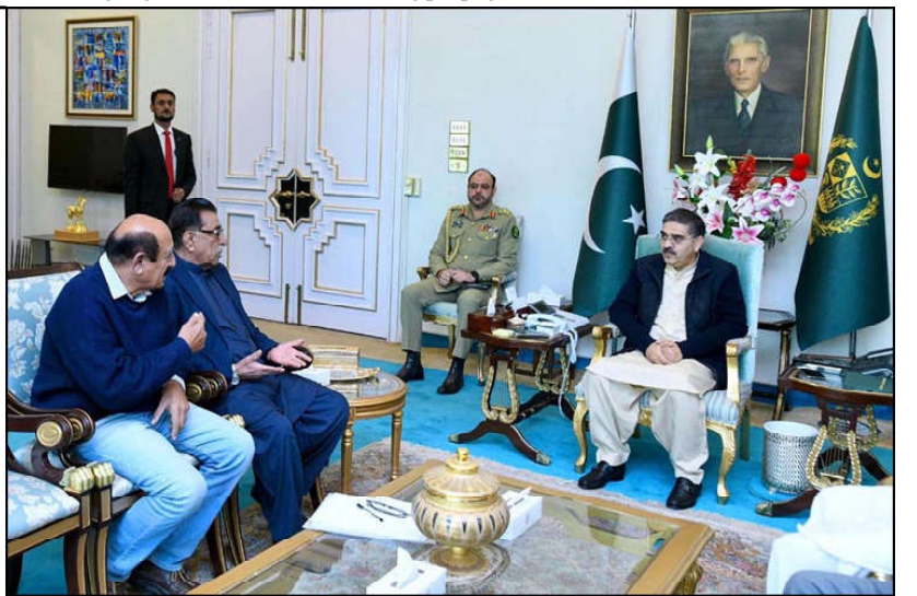
ISLAMABAD: A delegation of Gwadar Shipping Clearing Agents calls on Caretaker Prime Minister Anwaar-ul-Haq Kakar.

Justice Mazhar thinks that the digitization of the justice sector is only the beginning of the transformative change they envision for the legal system.