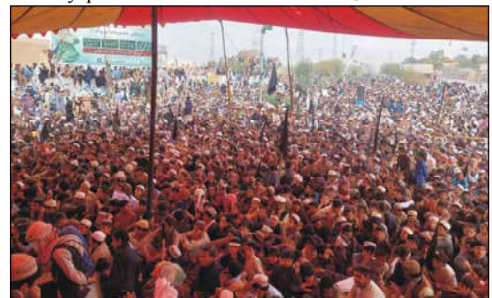
CHAMAN: Large numbers of children protesting in front of DC Complex against Passport Regime at Pak-Afghan border.