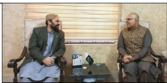
QUETTA: Caretaker Provincial Minister for Information Jan Achakzai in a meeting with Caretaker Provincial Home Minister Captain (ret) Muhammad Zuabir Khan Jamali.

"This order of the Election Commission has no constitutional status," the order read. The ECP had also failed to appreciate that the nomination forms of the petitioner dated 26.11.2007 were accepted by the Returning Officer without objection of any nature.