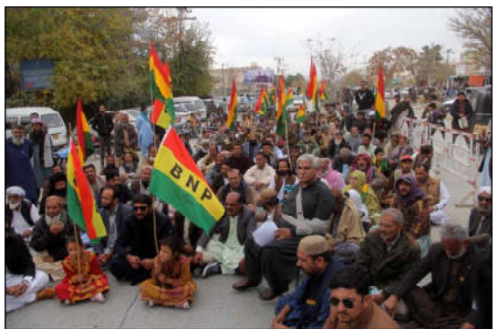
QUETTA: Activists of Balochistan National Party (BNP) are holding protest demonstration against low sui gas pressure, outside Sui Gas Office.

The coffin clad people and children also participated in the protest rally. The protesters chanted slogans against the one document regime policy. They also demanded of the government to withdraw the condition of passport for local tribesmen for the border crossing immediately. Otherwise their protest would remain continued, they asserted. It may be mentioned here that the participants of dharna have also given call of Pak-Afghan road in Chaman from November 20, against the issue.