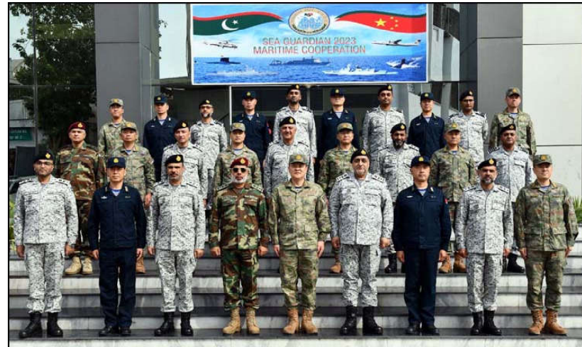
KARACHI: Group photo of Pakistan and Chinese Navy Senior Officials after closing ceremony of Bilateral Exercise Sea Guardian 2023 in Karachi.

to challenge the entrenched influence of waderas and dynastic politics, Sirajul Haq underscored the pivotal role of women's votes in dismantling the corrupt system. He urged the public to cast their votes in favor of JI in the upcoming elections. He outlined the JI's commitment to addressing gender disparities, vowing that, if in power, the party would ensure women receive a fair share of property and would eliminate outdated customs.