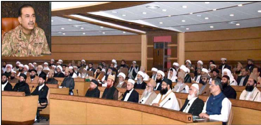
RAWALPINDI: Chief of Army Staff (COAS), General Syed Asim Munir, NI (M), addressing the leading Islamic Scholars (Ulema o Mashaikh) of all schools of thought, interacted at GHQ.

Ph: 2841470/2841473 Vol: XVIII No. 314, Jamadi-ul-Awwal 03, 1445 AH Saturday November 18, 2023, Pages 08, Price Rs.15