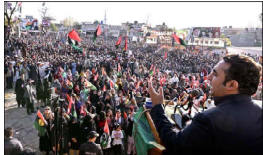
ABBOTTABAD: Chairman Pakistan People's Party Bilawal Bhutto Zardari addressing to workers convention.

Bilawal insisted on the people's right to choose their representatives. He criticized the politics of the past and stressed the need for a new political system that serves the people.