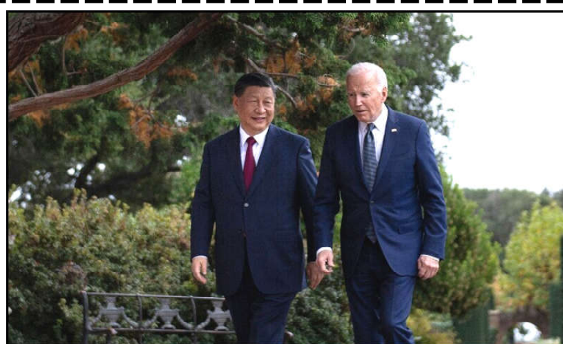
US President Joe Biden and Chinese President Xi Jinping walk together after a meeting during the Asia-Pacific Economic Cooperation (APEC) Leaders' week in Woodside, California.

United States shot down an alleged Chinese spy balloon in February this year. But Biden told a press conference at the Filoli estate that his talks with Xi, whom he has known since 2011, were "some of the most constructive and productive discussions we've had". The United States would compete "vigorously" but "responsibly" with an increasingly assertive China "so it doesn't veer into conflict or accidental conflict," Biden said. "He and I agreed that each one of us could pick up the phone, call directly and we'll be heard immediately."