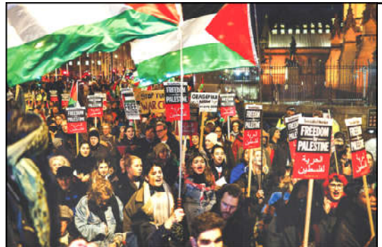
Protesters hold placards and flags during a rally in support of Palestinians, outside the Houses of Parliament in central London.

posted by the president. Cameron said the U.K. would continue to provide moral, economic and diplomatic support "but above all, the military support that you need not just this year and next year but however long it takes." The two-day visit came as Ukraine faces several challenges on and off the battlefield. Zelenskyy has struggled to capture the world's attention as focus has shifted to the Middle East and Israel's war against Hamas. Additional U.S. funding for Ukraine is jeopardized by political fights in Washington and the European Union says it can't provide all the munitions it promised.