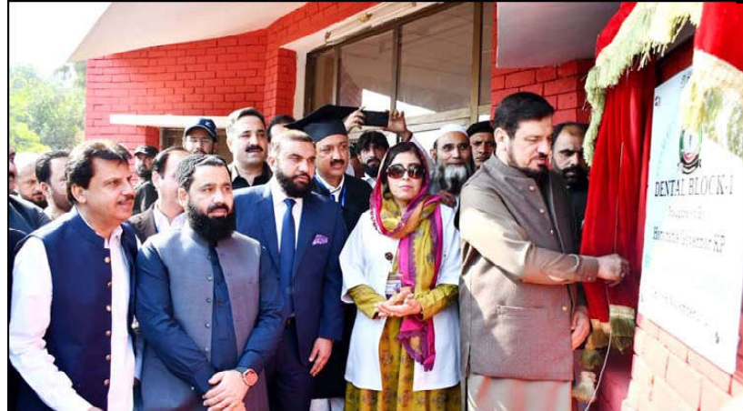
DERA ISMAIL KHAN: Khyber Pakhtunkhwa Governor Haji Ghulam Ali inaugurates Dental Block at Gomal Medical College DI Khan.