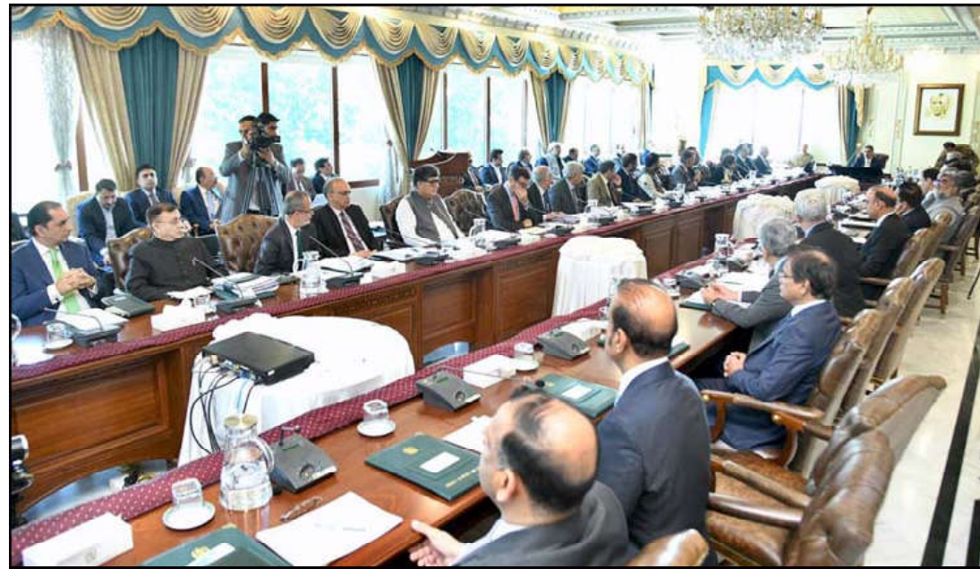
ISLAMABAD: Caretaker Prime Minister Anwaar-ul-Haq Kakar chairs the 7th meeting of Apex Committee of SIFC.

Similarly, some 150 passports have been issued from the Passport office op-