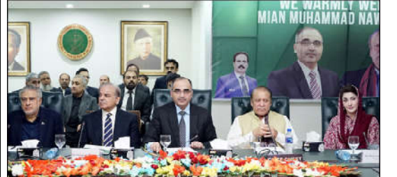
LAHORE: Pakistan Muslim League-N (PML-N) supreme Nawaz Sharif, Former Prime Minister Muhammad Shahbaz Sharif, former finance minister Ishaq Dar, Chief Organizer PML-N Maryam Nawaz, during their visit to Lahore Chamber of Commerce and Industry.

"The policy rate has soared to 22 percent, which was 6.25 during our tenure," he said.