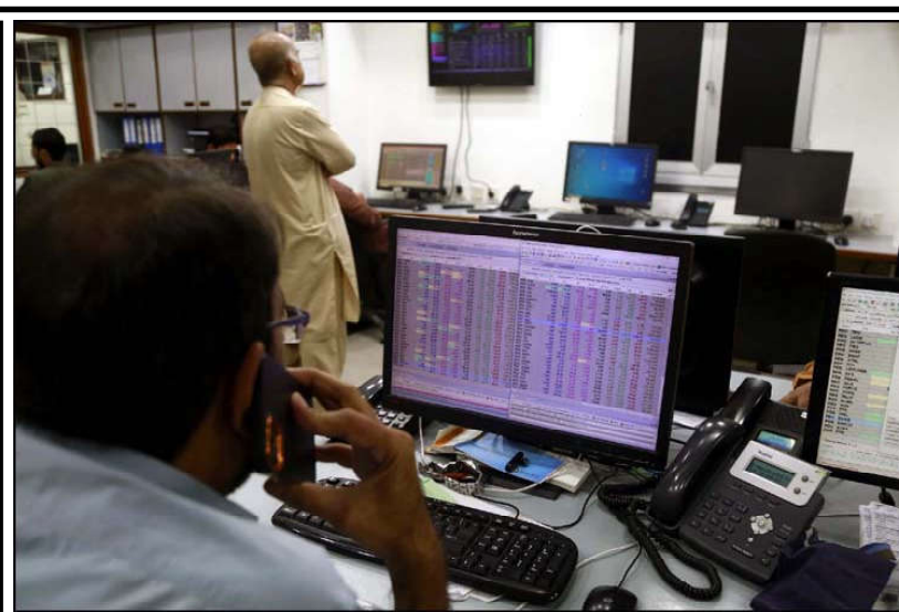
KARACHI: Brokers are busy in trading at Pakistan Stock Exchange (PSX) in Karachi. The Pakistan Stock Exchange's (PSX) benchmark index and rupee recorded gains on Thursday.

The exchange rates of the Emirates Dirham and the Saudi Riyal came down by 21 and 20 paise to close at Rs 78.24 and Rs 76.62 respectively.