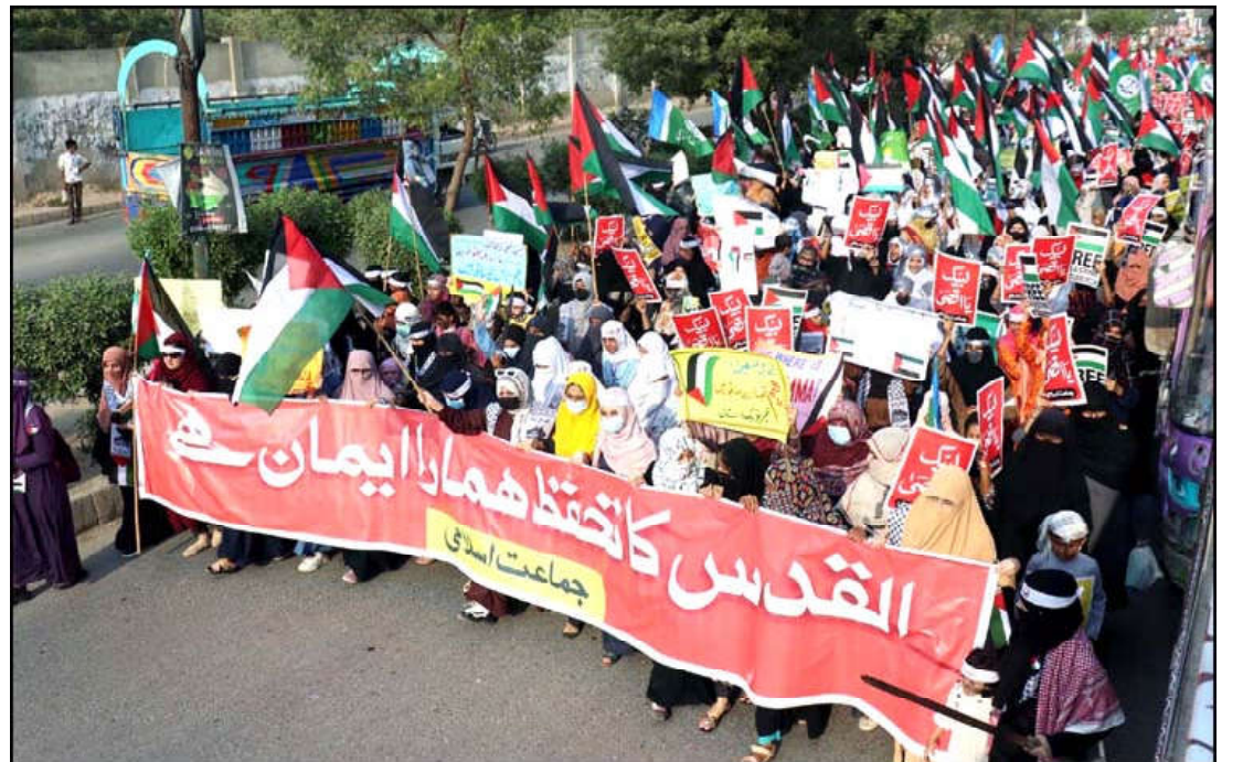
KARACHI: Leaders and members of Jamat-e-Islami (JI) are holding protest demonstration against Israeli cruel and inhumane acts and express unity with the innocent people of Palestine, held at Moach Goth area in Karachi.

government's commitment in that regard. The president said that through his letter, he invoked the government's attention towards the apprehensions of Pakistan Tehreek-i-Insaf (PTI). To a query, he said the Constitution did not allow the President to take a 'practical' action to ensure the transparency of an election. "The President has no other way but to bring such issues to the notice of the government," he said. He said though the office of the President did not have an administrative authority, however the points raised by it held a significant value. "There can be many expectations [from me to act in a particular way], but I will not take any unconstitutional step," he said. The president said he was not the spokesperson of any party, but of all Pakistanis, adding "However, I will continue to identify and point out whenever see any issue." To a question, the president said he never showed negligence with respect to the date of general elections. Alvi appreciated the Supreme Court of Pakistan on demonstrating unanimity over the election date.