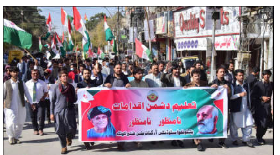
QUETTA: Members of Pashtunkhwa Students Organization (PSO) are holding protest demonstration for acceptance of their demands.

ISLAMABAD (Online): Sindh government has filed appeal in Supreme Court (SC) against the decision of stopping trial of civilians in military courts. Sindh government has requested the court to nullify decision of stopping the trial of civilians in military courts. It has been said in appeal that Supreme Court (SC) decision be suspended till the decision of appeal. it was further said in the appeal those accused in attacking military installations should be tried in military courts. SC has not made correct review of law and facts. Sindh government has requested for restoration of nullified clauses of army act and official secret act. The accused persons themselves gave application that they should be tried in military courts. The petition is likely to be fixed for hearing next week.