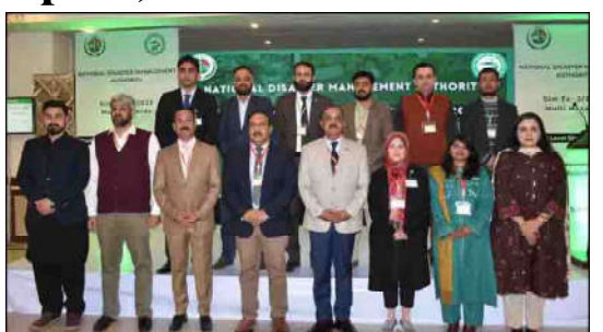
QUETTA (APP): Syndicates at NDMA's Provincial Level Simulation Exercise (SimEx), here on Thursday showcased their pre-disaster preparedness plans, shared recommendations and coordination strategies with various government and humanitarian stakeholders.