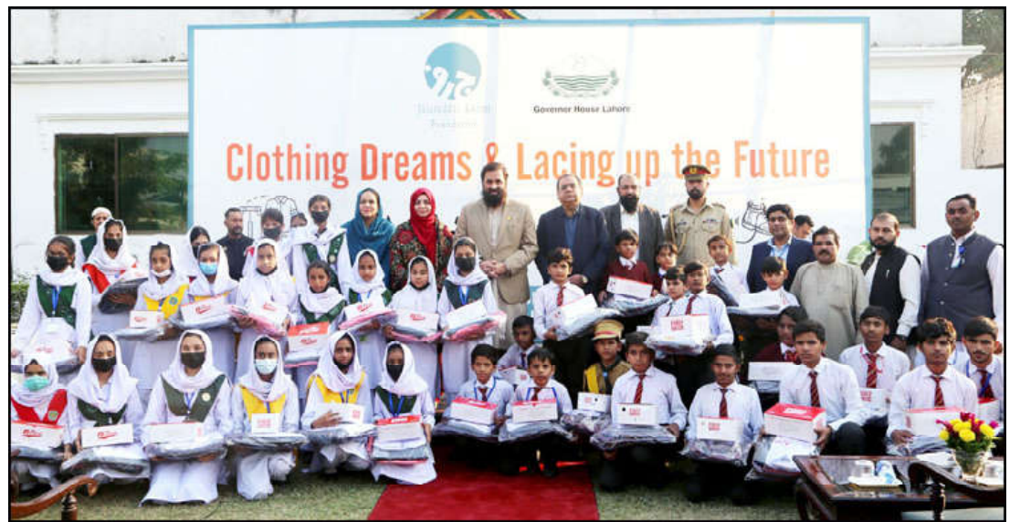
LAHORE: Punjab Governor, Muhammad Balighur Rehman in a group photo with students of Government Boys High School and Government Girls High School established here at Governor House during free uniforms and school bags distribution ceremony.

technology. Governor Ali urged the newly graduated doctors to treat patients with utmost respect and compassion. He highlighted the provincial government's ongoing efforts to bring development to the southern districts of Khyber Pakhtunkhwa. The governor commended the management and faculty members of Gomal Medical College for their dedication to improving academic standards and organizing curricular and extra-curricular activities.