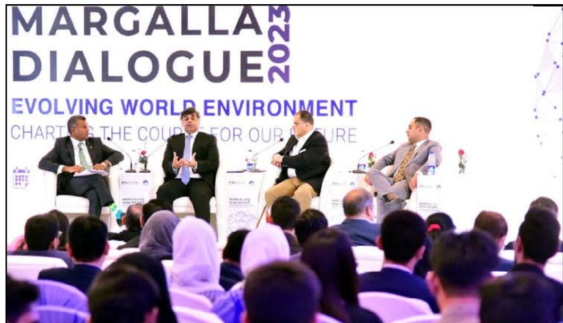
Caretaker Federal Minister for Commerce and Industry, Dr. Gohar Ejaz addressing the audience at the Margalla Dialogue 2023 in Islamabad.