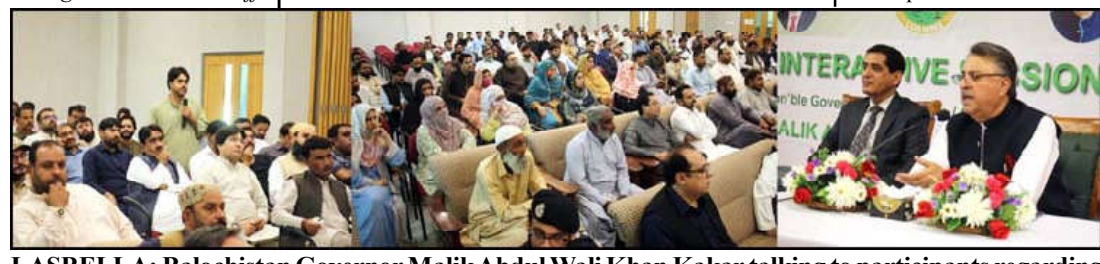
LASBELLA: Balochistan Governor Malik Abdul Wali Khan Kakar talking to participants regarding problems faced by teachers and students at Lasbella University.

RAWALPINDI (APP): The security forces on Wednesday killed seven terrorists in an intelligence-based operation in Kiri Machan Khel area of Tank District. According to the Inter Services Public Relations (ISPR), the security forces carried out the operation on the reported presence of terrorists in the general area Kiri Machan Khel on the night of November 14 and 15. An intense exchange of fire took place during the operation, due to which seven terrorists were sent to hell, it added. The terrorists' hideouts were also busted during the operation. The forces also recovered weapons and ammunition from the killed terrorists, who remained actively involved in numerous terrorist activities, including recent target killings of policemen in Tank and surrounding areas.