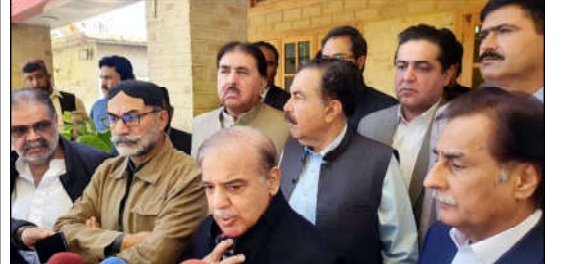
QUETTA: Muslim League (PML-N) President and former Prime Minister, Shahbaz Sharif along with Haji Lashkari Raisani and others addresses to media persons during press conference after meeting, held in Quetta.

Minister Information asserts Pakistan can't allow economic terrorism in name of Afghan transit trade; its wrong use must be stopped; says over 105,000 immigrants repatriated from Balochistan via Chaman border Independent Report QUETTA: The caretaker Provincial Minister for Information, Jan Achakzai has stated Pakistan's economy is being harmed under the garb of smuggling and Afghan transit trade. The Minister Information asserted that Pakistan can't allow economic terrorism in the name of Afghan transit trade as its use should be stopped forthwith. He said that it has been witnessed that the process of harming country's economy is continued under the garb of Afghan transit trade after the Taliban's government in Afghanistan. The Minister Information was addressing a hurriedly called press conference at Quetta Press Club on Wednesday. Jan Achakzai said that Pakistan wants promotion of trade in the region, and in this regard, wholehearted efforts are continued as well. He said that Afghanistan is our neighbour brotherly country, and we also have trade and commerce relations with it.