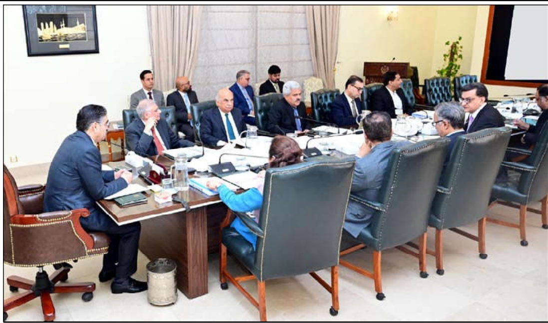
Caretaker Prime Minister Anwaar-ul-Haq Kakar chairs a meeting to discuss ML-1 Project in Islamabad.