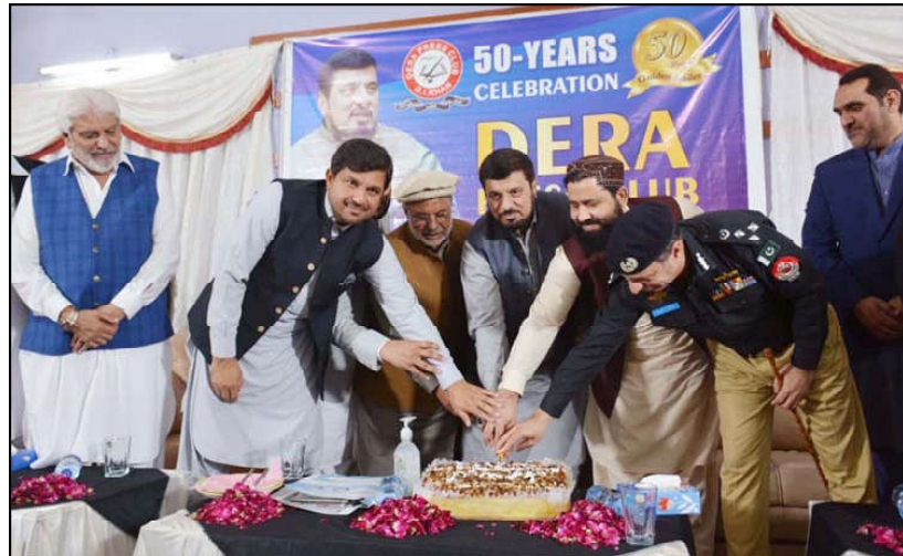
PESHAWAR: Khyber Pakhtunkhwa Governor Haji Ghulam Ali cutting the cake at Dera Press Club (DPC) to celebrate its 'Golden Jubilee'.