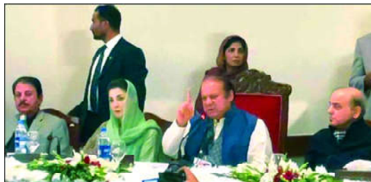
QUETTA: Pakistan Muslim League-Nawaz (PML-N) supermo Nawaz Sharif addressing Workers convention.

ISLAMABAD (INP): Caretaker Prime Minister Anwaar-ul-Haq Kakar has emphatically stated that Pakistan is fully capable to respond to the challenge posed by non-state actors. Speaking at Margalla Dialogue titled "Evolving World Environment Charting the Course for Our Future" in Islamabad Wednesday, he said we do not have to rely on the outside security apparatus to take on the challenge. He said Pakistan is confident and self-reliant to take on the challenge. The Prime Minister said the external aggression has gone to minimum due to our defense capabilities. "So how many Palestinian children have to be killed to appease and address the Israeli anger? One, five, ten, 500, 1000, 4,700? Can they give us a number so that we can satisfy those parents to wait as some 10,000 children needed to be killed to address the Israeli anger," he remarked. He said those claiming to be the followers of Prophet Moses, were actually following the footsteps of Pharaoh by killing the children.