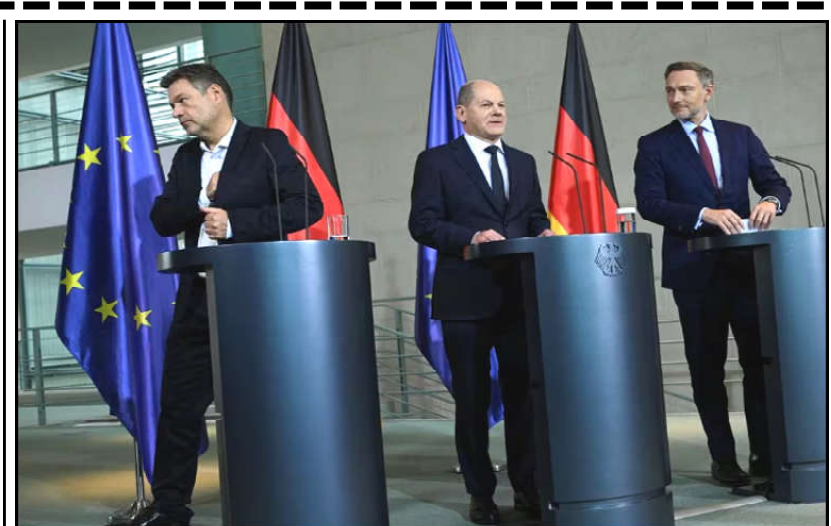
German Economy and Climate Minister Robert Habeck, Chancellor Olaf Scholz and Finance Minister Christian Lindner leave following their comments on the ruling of Germany's Constitutional court that the government's re-location of 60 billion euros ($65 billion USD) of unused debt from the pandemic era to climate fund was illegal, in Berlin, Germany.