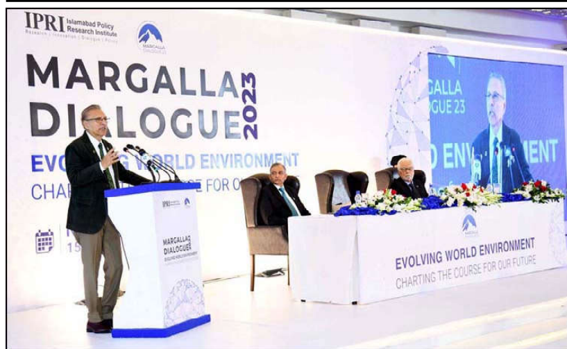
ISLAMABAD: President Dr Arif Alvi addressing the inaugural session of Margalla Dialogue.