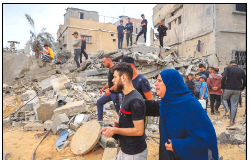
A Woman cries as she stands by the rubble of a destroyed building following Israeli bombardment in Khan Yunis in southern Gaza Strip.

"The goal here is to do what is necessary at the negotiating table to ensure that we get the safe return of all of the hostages, including the Americans," Sullivan told CNN, noting that nine Americans were missing, along with one person with permanent resident status in the United States.