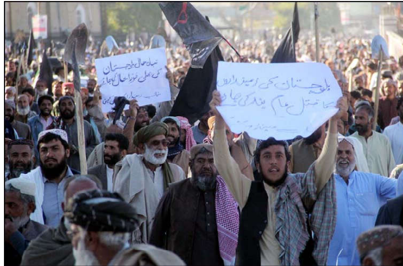
QUETTA: Members of Zamindar Action Committee are holding protest demonstration against prolong electricity load shedding and non-availability of water, held in Quetta.

MoUs with them in this regard. In addition to this, the Chief Minister also directed to start planning for launching the Ph.D and M.Phil programmes on the protection of forests, wildlife and environment in the universities. The Chief Minister also called for protection of the migratory birds who migrate from Siberia due to the harsh weather conditions there. Earlier, it was informed that the bid of trophy hunting for hunting of Suleman Markhor was done at Rs. 2 crore 45 lakh in the province. It was also informed that the hunting license fees for 10 days is Rs. 10 million in the province.