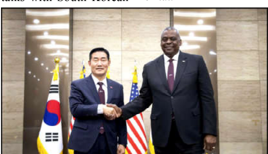
U.S. Secretary of Defense Lloyd Austin, right, and his South Korean counterpart Shin Won-sik shake hands for a photo during a signing ceremony of the 55th Security Consultative Meeting (SCM) at the defense ministry, in Seoul, South Korea.

Tensions between the Koreans are at their highest point in years as the pace of both North Korea's weapons tests and South Korea's combined military exercises with the United States have intensified in a cycle of tit-for-tat.