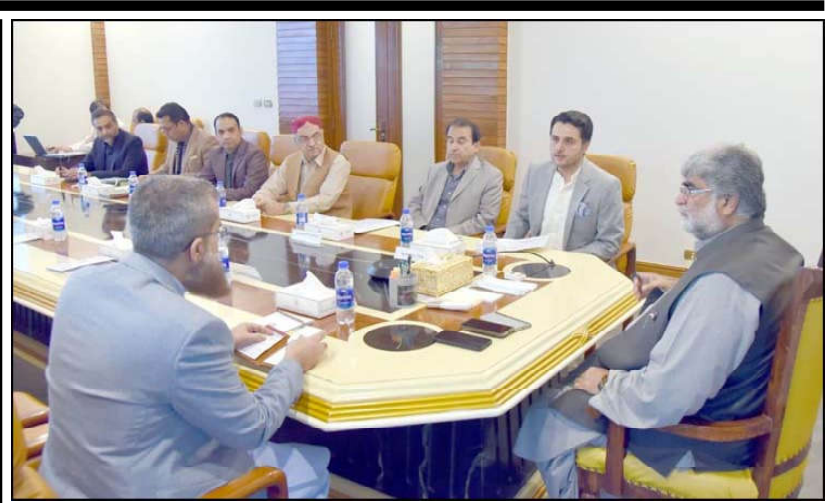
QUETTA: Caretaker Chief Minister Balochistan Mir Ali Mardan Khan Domki presiding over a high level meeting regarding environmental change and protection of forests and wildlife.