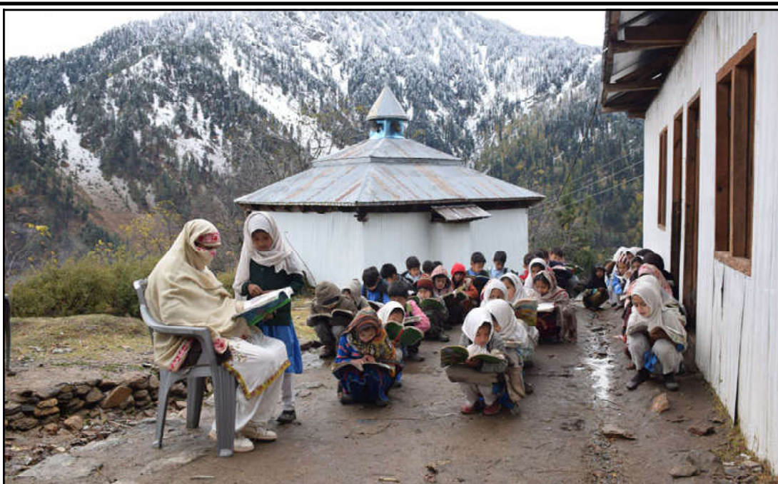
LEEPA VALLEY: Younger girls students are attending class at open air school during the extreme cold weather due to unavailability of school building of Government Girls Primary School Moji Chitya area of the Kashmir.