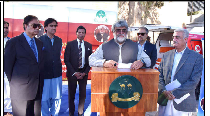
QUETTA: Caretaker Chief Minister Balochistan Mir Ali Mardan Khan Domki addressing a ceremony on eve of handing over of ambulances to Health Department from WHO

ISLAMABAD (APP): Caretaker Prime Minister Anwaar-ul-Haq Kakar on Monday directed the authorities concerned to formulate and present a comprehensive strategy, based on input from all the stakeholders, with a view to improve the performance of the Federal Board of Revenue (FBR). The prime minister, chairing a meeting to mull over the measures for improving the FBR's performance, said the utilisation of the modern technology was inevitable to improve the taxation system. The meeting was briefed on the measures to widen the tax net and digitisation of the taxation system. The participants also deliberated over different proposals aimed at restructuring the FBR. The prime minister said that the revenue collection was just like a backbone for the national economy. He told the meeting that various effective measures had been taken recently to curb smuggling, though it required more hard work to achieve the desired results. Caretaker Finance Minister Dr Shamsah Akhtar, Advisor to PM Ahad Cheema, FBR chairman, federal finance secretary and relevant senior officers attended the meeting.