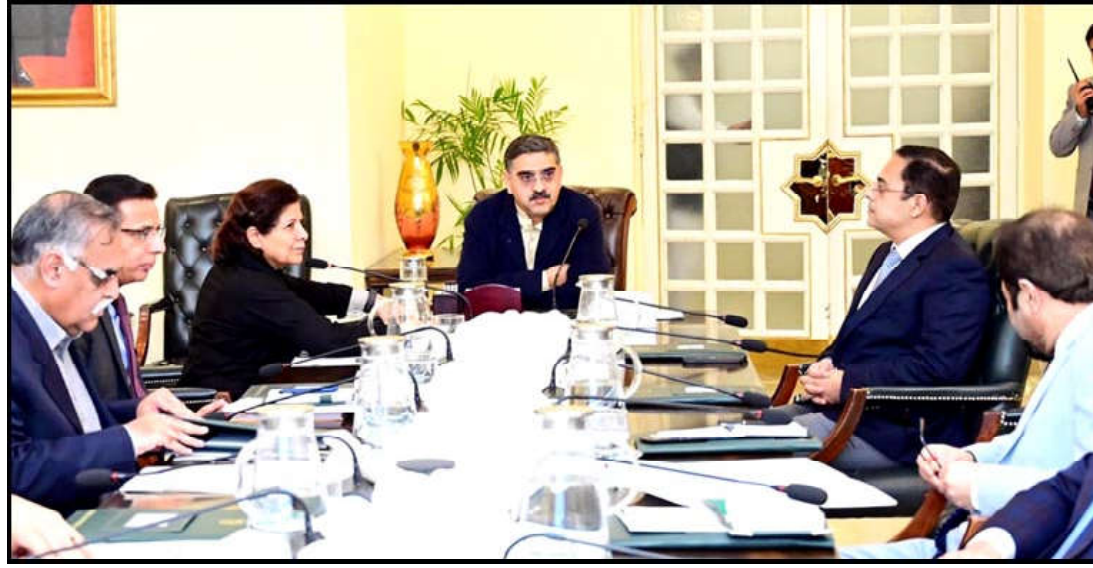
ISLAMABAD: The Caretaker Prime Minister Anwaar-ul-Haq Kakar chairs a meeting on the matters related to the Federal Board of Revenue.

Ph: 2841470/2841473 Vol: XVIII No. 310, Rabi-us-Sani 29, 1445 AH Tuesday November 14, 2023, Pages 08, Price Rs.15