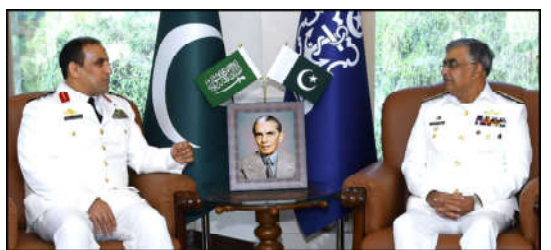
Chief of the Naval Staff Admiral Naveed Ashraf exchanging views with Rear Admiral Sajer Bin Rafeed Al-Enazi Eastern Fleet Commander Royal Saudi Naval Forces at Naval Headquarters Islamabad.

sideing in Pakistan without any travel documents, the minister added. Bugti said no country allowed any foreigner to live, do business, or buy properties without legal documents. "Whether does any country, including Afghanistan, permit Pakistani people to cross their borders without legal documents?" he questioned. He said that even in Afghanistan, Pakistani businessmen are required to produce guarantors before establishing businesses. He said foreigners with valid visas and legal documents would be welcomed in Pakistan and even allowed to do business.