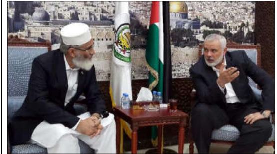
DOHA: Ameer Jamaat-e-Islami Sirajul Haq meeting with Chief of Hamas Ismail Hania