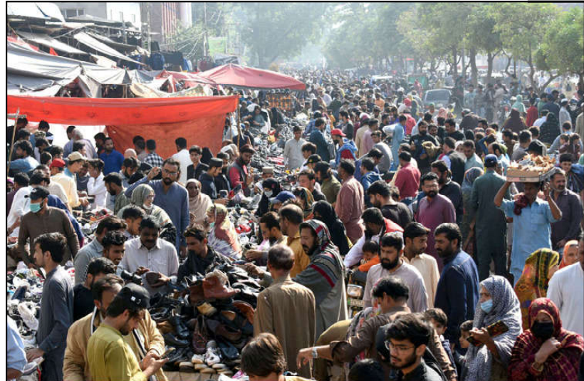
LAHORE: A large numbers of people is busy in buying shoes and warm clothes in a Landa Bazaar at Hajji Camp in Provincial Capital.