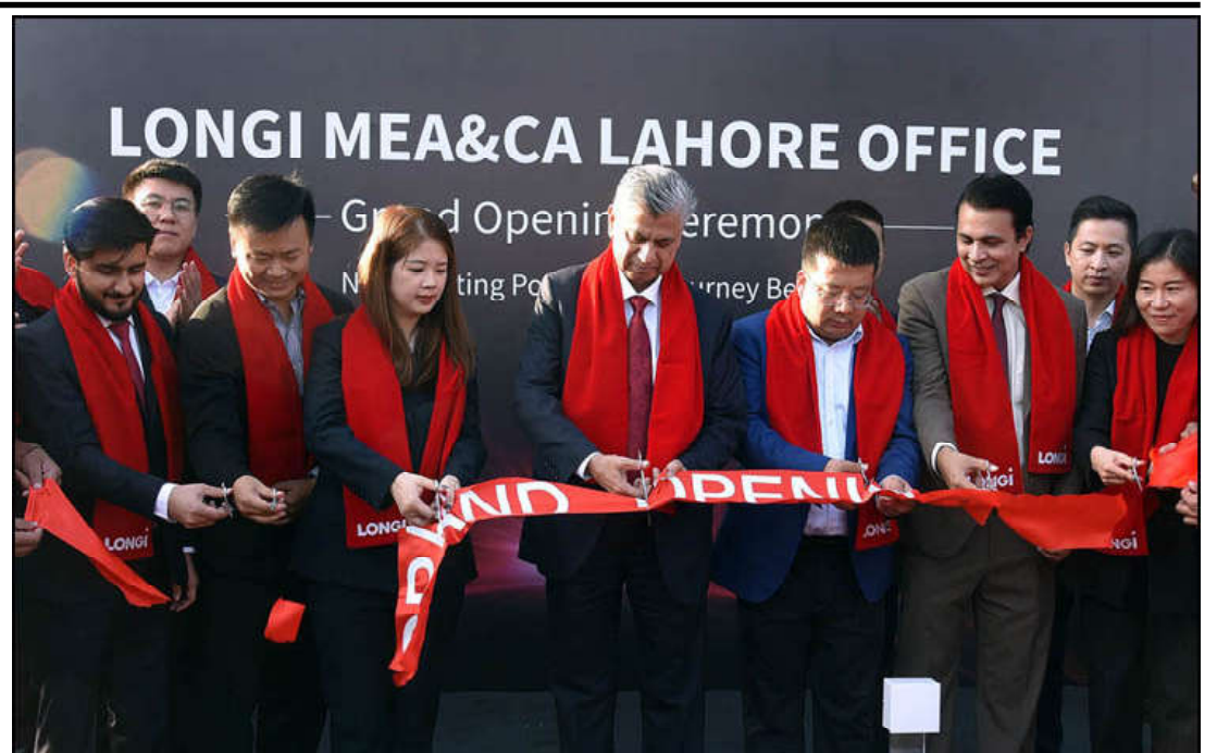
LAHORE: Caretaker Federal Minister for Information and Broadcasting Murtaza Solangi is cutting the ribbon to inaugurate Longi Solar's at Gulberg.

He said officers and staff have suffered at the hands of the little mafias and they were thrashed, injured, made hostage and fired upon.