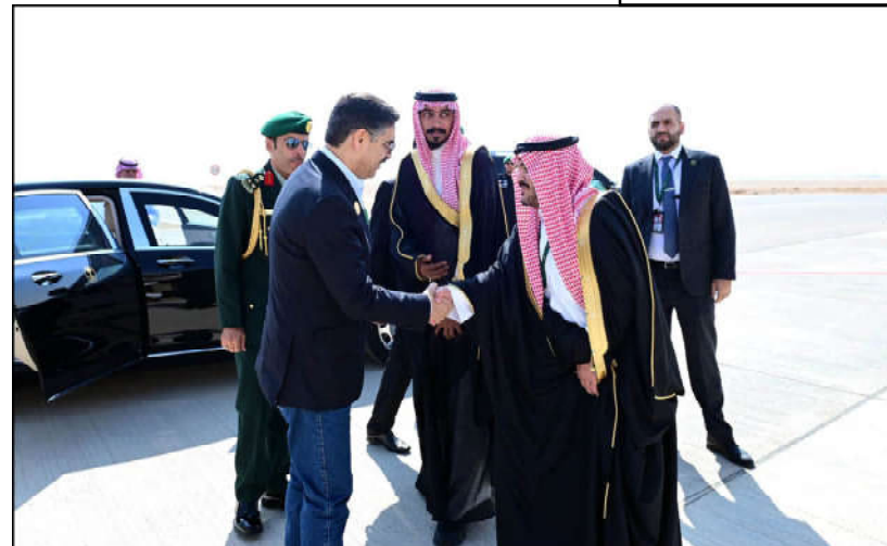
RIYADH: Caretaker Prime Minister, Anwaar-ul-Haq Kakar being seen off by high diplomatic officials of Pakistan and Saudi Arabia after completing his three day official visit of Kingdom of Saudi Arabia

The necessary medicines along with the logistic support have also been provided in the affected areas to combat the situation.