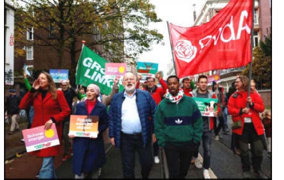
The leading candidate of the Dutch Labour Party, Frans Timmermans attends The March for Climate and Justice to demand political change before the elections in Amsterdam, Netherlands.

Monitoring Desk LONDON: British lawmakers and members of the upper house of parliament have called on the government to proscribe Iran's Revolutionary Guard Corps as a terrorist organisation, saying it would be a step towards restoring stability to the Middle East. Proscribing the IRGC as a terrorist group would mean it would become a criminal offence in Britain to belong to the group.