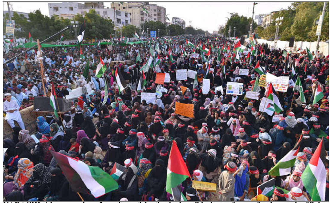
KARACHI: A large number of people participating in the solidarity conference for the people of Palestine organized by Pakistan Markazi Muslim League at Shahra e Quaid.

Khan's commendable handling of the Corona epidemic. Imran Khan also ensured the investment agriculture, construction and industry. Spokesperson said that Imran Khan limited the inflation rate to 12.7% while protecting the nation from the effects of the highest global inflation due to the commodity super cycle. PTI achieved 6% growth rate in the third and fourth year of the government, PTI is the only government after 2007 which has grown at a speed of 6% for 2 consecutive years.