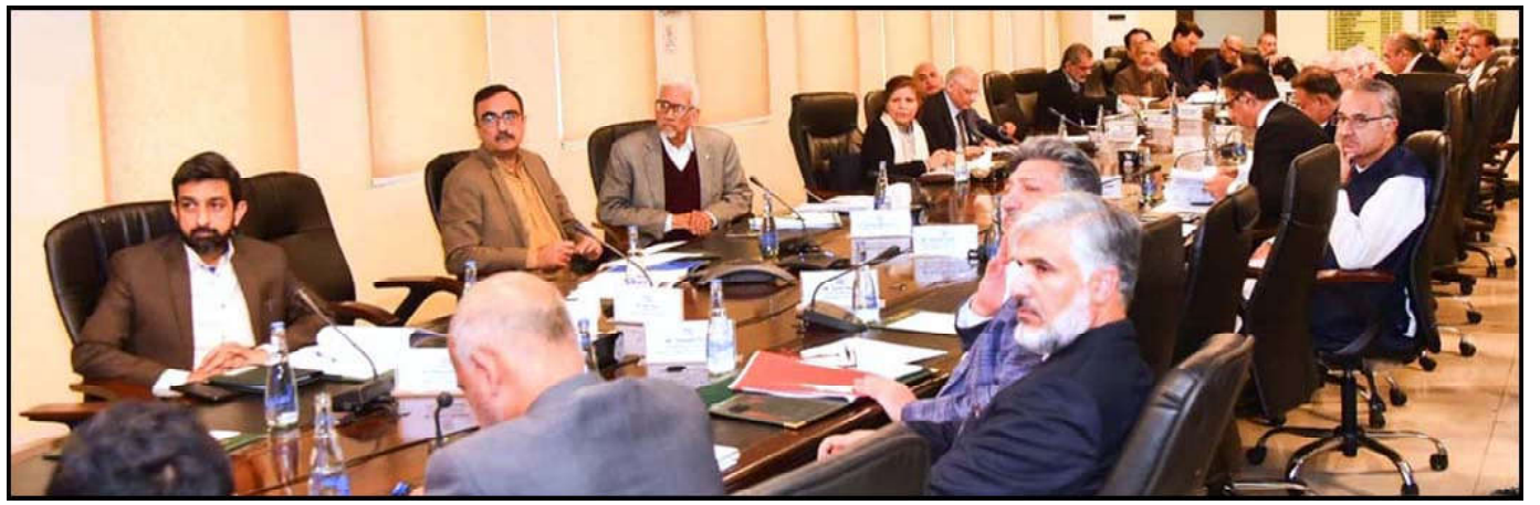
ISLAMABAD: Caretaker Federal Minister for Finance, Revenue, and Economic Affairs, Dr. Shamshad Akhtar presides over a meeting of the Economic Coordination Committee (ECC) of the Cabinet.

In a joint condolence statement issued here on Friday, the office bearers of DPR Officers Welfare Association prayed that may Allah Almighty rest the departed soul into its eternal peace and give enough strength and patience to the bereaved family members to bear the tragic loss.