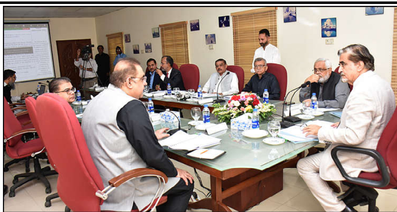
KARACHI: Federal Minister for National Heritage and Culture Syed Jamal Shah chairing meeting at Quaid-e-Azam Mazar Management Board (QMMB).

KARACHI (APP): A training session emphasizing the significance and efficacy of inspection registers in police stations regarding crime prevention was conducted at the Central Police Office (CPO) in Karachi. During the session, master trainers from Punjab directly provided guidance to SSPs in Investigations, District SSPs of Karachi, as well as training branch trainers, said a news release on Friday.