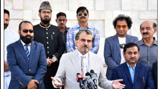
KARACHI: Federal Minister for National Heritage and Culture Syed Jamal Shah addressing to the media persons at Mazar-e-Quaid

The EC issued call up notices in connection with indictment proceedings related to Imran Khan.