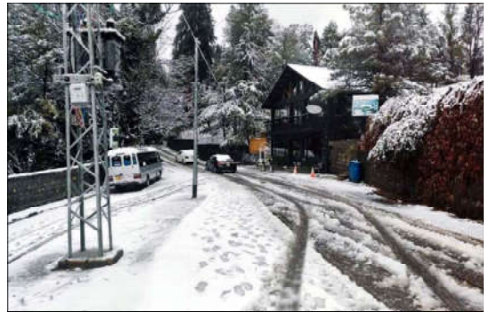
ABBOTTABAD: An eye-catching view of a snow covered area during the heavy snowfall of winter season, which more decreases the temperature below in minus degree Celsius, at Nathiagal.