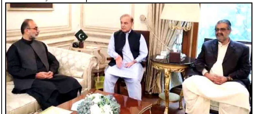
LAHORE: Nawabzada Haji Mir Laskhari Khan Raisani meeting with PML-N president and former Prime Minister Muhammad Shahbaz Sharif

They strongly condemned the remarks made by a minister of the Israeli occupation government, which included a threat to detonate a nuclear bomb in the Gaza Strip.