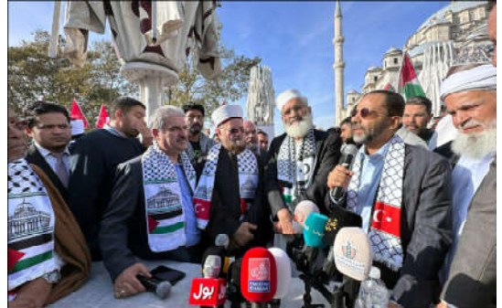
ISTANBUL: Amir Jamaat-e-Islami Sirajul Haq participating in Palestine Solidarity March

"Pakistan will continue to play its role to advance international consensus and galvanize efforts for an urgent end to Israeli aggression against the Palestinian people and urgent provision of relief assistance to the people of Gaza," she said.