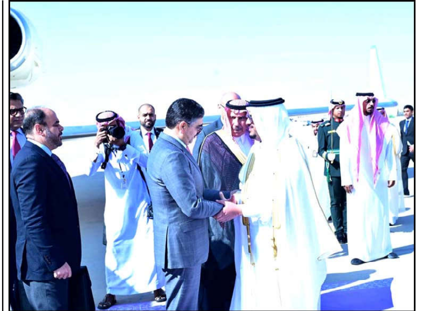
RIYADH: Deputy Governor Riyadh, Prince Mohammed bin Abdulrahman bin Abdulaziz receiving Caretaker Prime Minister Anwar-ul-Haq Kakar upon his arrival.

He said that finding an answer to when and how relations can be normalized is certainly a challenge for every section of society including leadership, intellectuals, businessmen and civil society of both countries. He is an optimistic person. And whenever there are difficult situations, there is always hope. And I am also hopeful for the solution of the problem.