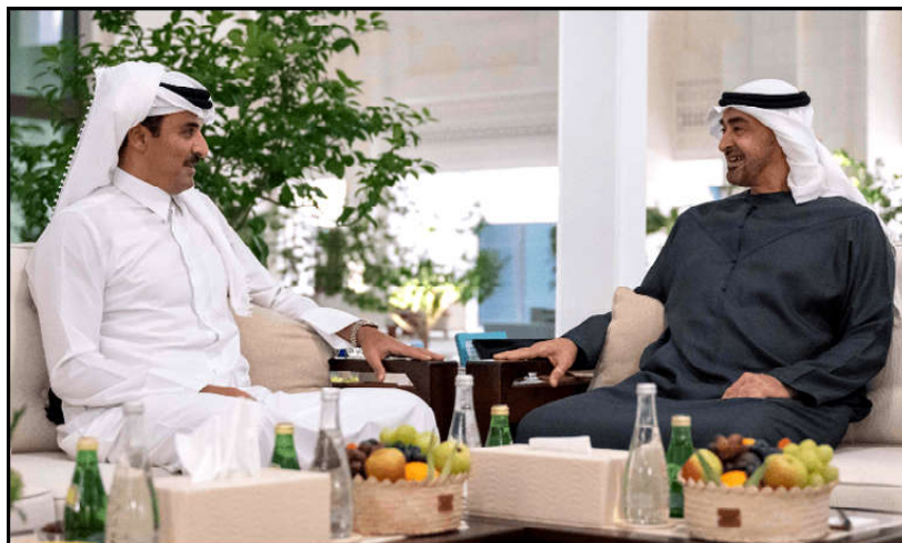
UAE President Sheikh Mohamed bin Zayed al-Nahyan meeting with Qatar's Emir Sheikh Tamim bin Hamad al-Thani at al-Shati Palace.

Hamas denies. "While the world sees neighbourhoods with schools, hospitals, scout groups, children's playgrounds and mosques, Hamas sees an opportunity to exploit," the Israeli military said. The month-old Israeli military campaign to wipe out Hamas, following the militants' Oct 7 raid on southern Israel, has left Gaza's hospitals struggling to cope, as medical supplies, clean water and fuel to power generators have been running out. Israel has faced growing calls for restraint as the Palestinian death toll increases, but says Hamas will just take advantage of any significant pause in its military campaign.