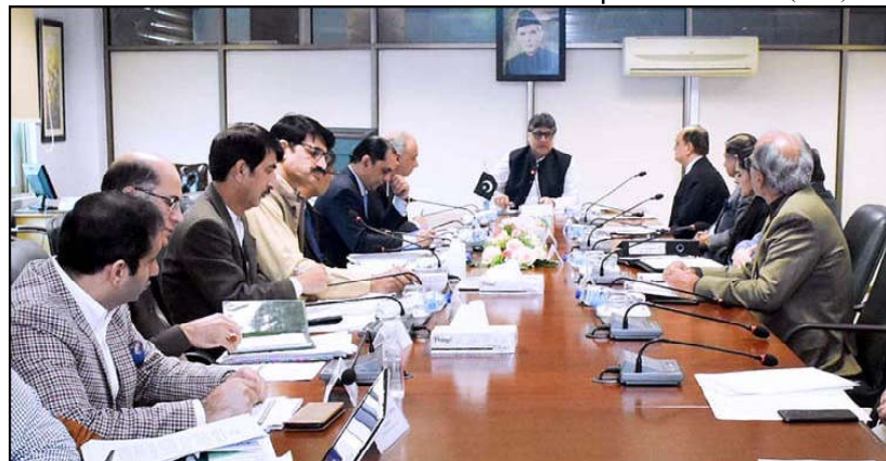
ISLAMABAD: Caretaker Minister for Privatisation, Fawad Hasan Fawad chairing meeting of Privatisation Commission Board.

Chief Guest Senator Zeeshan Khanzada expressed his gratitude on celebrations of 40 th anniversary of Pak-Korea diplomatic relations and underscored the strong potential for future collaboration to intensify cooperation in all fields including political, economic, cultural and people-to-people contacts.