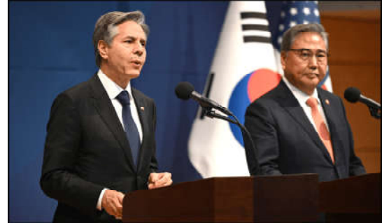
US Secretary of State Antony Blinken and South Korean Foreign Minister Park Jin hold a joint press conference at the Foreign Ministry in Seoul, South Korea.

"These groups have a choice to make: If they want to continue to attack our troops in Iraq and Syria, then they're gonna have to face the consequences for that," Kirby added. U.S. and coalition troops have been attacked at least 40 times in Iraq and Syria by Iran-backed forces since the start of October, as tensions soar over Israel's bombardment of Gaza in retaliation for Hamas militants' Oct 7 attack. Forty-five U.S. troops have suffered traumatic brain injuries or minor wounds. The United States has occasionally carried out retaliatory strikes against Iranian-backed forces in the region after they attack American forces, including one on Oct. 26. Iran has denied involvement. Tehran's ambassador to the United Nations, Amir Saied Iravani, said on Thursday separatist groups were responding to the Israeli assault that has killed more than 10,800 Palestinians in Gaza.