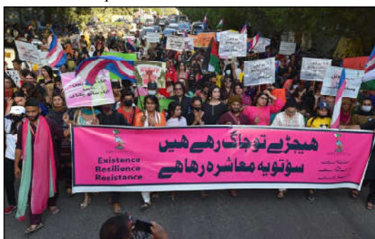
KARACHI: Activists of Transgender hold rally in favor of their demands.

government to enhance the quality of education. He applauded this support, emphasizing that both the public and private sectors share the responsibility of providing a valuable education to the younger generation. Minister Arshad Hussain Shah mentioned the establishment of various institutions by the provincial government to bring private educational institutions under a unified code of conduct. This initiative aligns with the agenda of a new uniform education system, focusing on the students' and parents' interests. He acknowledged the hard work and dedication of teachers and students, stating that education goes beyond textbooks and exams.