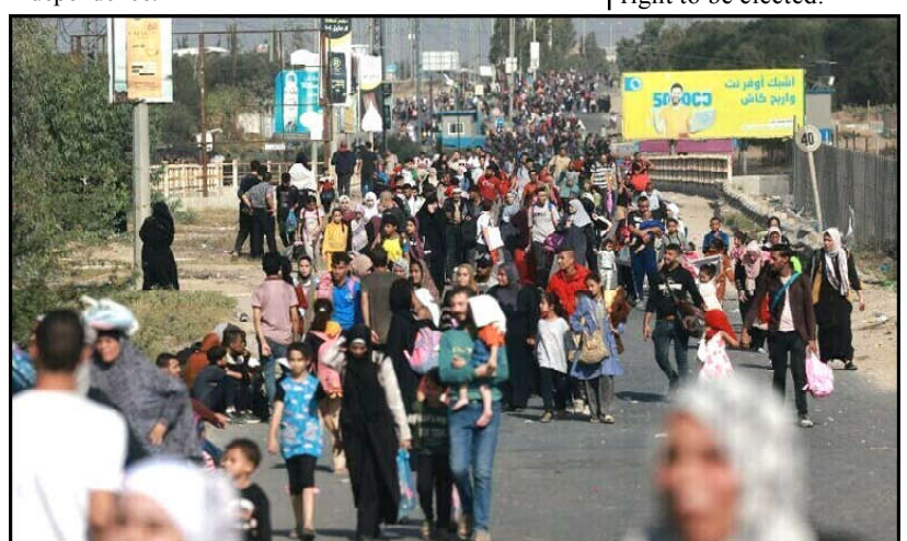
Palestinians walk down a road as they flee Gaza City and other parts of northern Gaza towards the southern areas.

The talks in Tokyo among Japanese Foreign Minister Yoko Kamikawa and Defense Minister Minoru Kihara and British Foreign Secretary James Cleverly and Defense Secretary Grant Shapps are the first since the RAA took effect in mid-October. They met on the sidelines of a gathering of foreign ministers from the Group of Seven industrialized nations on Tuesday and Wednesday that is expected to focus on the Israel-Hamas war, the Russia-Ukraine war and tension in the Indo-Pacific region.