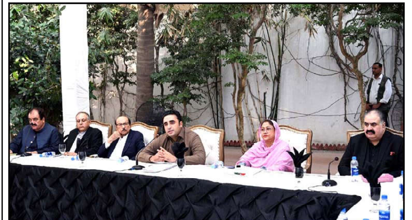
KARACHI: Peoples Party (PPP) Chairman, Bilawal Bhutto Zardari presides over the meeting of leadership of PPP Balochistan to discuss the public relations campaign in the context of the upcoming general elections, held at Bilawal House in Karachi.

The Governor said that the poetry of Allama Iqbal not only awakened the Muslims of sub-continent from fast slumber, but also influenced Muslims living in other countries of the world.