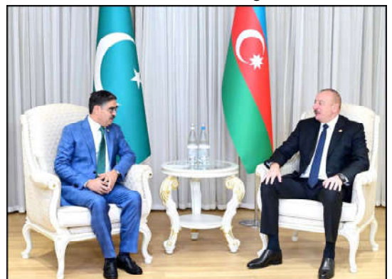
TASHKENT: The Caretaker Prime Minister Anwaar-ul-Haq Kakar meets the President of the Republic of Azerbaijan Mr. Ilham Aliyev on the sidelines of 16th Summit of ECO.

Prime Minister Kakar reaffirmed Pakistan's unwavering support for the sovereignty and territorial integrity of Azerbaijan, especially with respect to Karabagh.