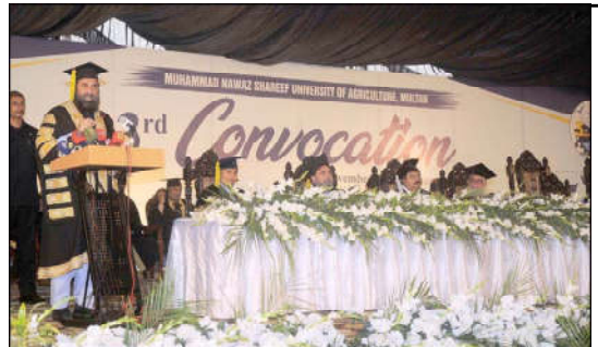
MULAN: Governor of Punjab Muhammad Balighur Rehman addressing during the 3rd Convocation of the Muhammad Nawaz Sharif University of Agriculture.

Additional Chief Secretary P&D, administrative secretaries of concerned departments, representatives of Partner Organizations, Project Team Members and government officials attended the ceremony. Briefing the participants about newly introduced e-governance system, it was informed that initially, "Digital Workspace" is being executed in four different administrative departments including Finance, Higher Education, Science & Information Technology and Sports whereas after two months period, it would be extended to rest of the departments in a phased manner.