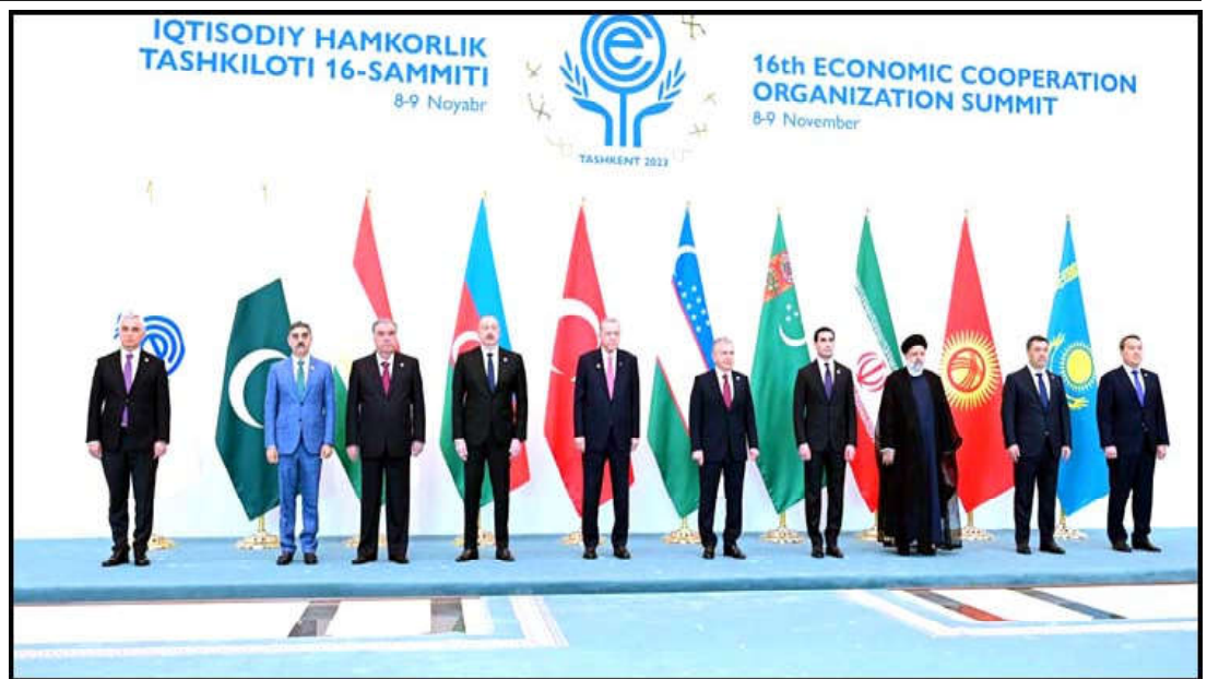
TASHKENT: Caretaker Prime Minister Anwaar-ul-Haq Kakar in a group photo with the heads of states of ECO member countries.

san political objectives". Its verification regime will remain credible only if it is applied on a non-discriminatory basis as stipulated in the Statute of the International Atomic Energy Agency. "Pakistan places the highest priority on nuclear safety and security as a national responsibility," Ambassador Akram added. In light of recent developments, he proposed convening a special session of the General Assembly to establish a new consensus on disarmament and non-proliferation that better addresses the current and emerging realities and offers equal security to all States.