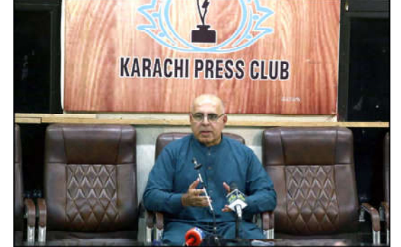
giving harsh statements. "Pakistan knows how to crush all kinds of terrorism."