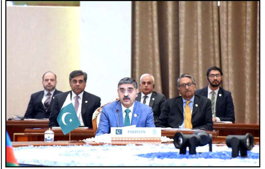
TASHKENT: The Caretaker Prime Minister Anwaar-ul-Haq Kakar addresses the 16th ECO Summit.

Haq Kakar on Thursday, reiterating Pakistan's commitment to the ECO Vision 2025, called for collective efforts and accelerated reforms to achieve the Organisation's objectives and region's trade potential for bringing "colossal" economic and peace dividends. "Let us make ECO an organisation, not just of words, but actions, not just commitments but implementation. It is crucial for us to work collectively and diligently to realise the goals and objectives of the Organisation... Our region, if well connected, can bring colossal economic and peace dividends for our people," the prime minister said addressing the 16th Summit of the Economic Cooperation Organisation (ECO).