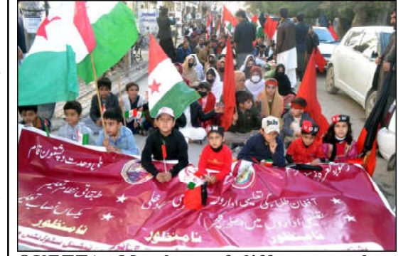
QUETTA: Members of different student organizations are holding protest demonstration against forced deportation of Afghan Refugees, at Quetta press club.

relationship between the two was like that between "brothers". "When such friends are with us, then the work we need to do to make the country progress, we can do that," he said. Concluding his speech, Tareen said, "Together, we will truly make a 'Naya Pakistan', God willing!" During his speech today, Tareen said, "Forget the past and look forward [...] this country has everything. If there is anything lacking, it is that we [political parties] are always fighting with one another." "Such parties can't do politics. They have gotten into the habit of fighting with each other [...]. Be competitive all you want but don't fight. Don't ruin the country," he added. Tareen said that the IPP would try to set new traditions, fulfil its objectives and work for the benefit of the people.