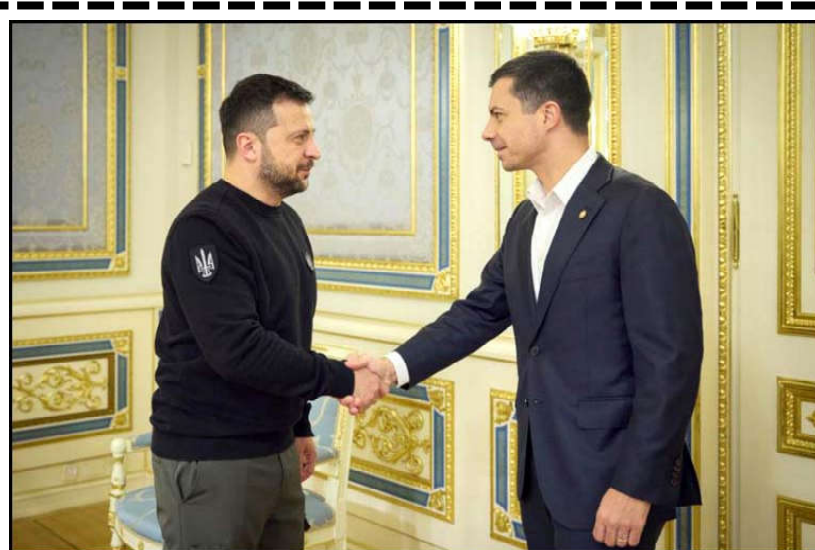
Ukrainian President Volodymyr Zelenskyy, left, shakes hands with US Secretary of Transportation Pete Buttigieg in Kyiv, Ukraine.

that is party to the court is obliged to arrest him on its soil. Kazakhstan isn't part of the agreement that created the tribunal. Putin's trip to Kazakhstan comes days after French President Emmanuel Macron visited Astana and hailed Tokayev for withstanding geopolitical "pressures," in a hint at Moscow's efforts to keep the neighbor in its orbit. Relations with Kazakhstan and other former Soviet republics in Central Asia have become increasingly important for Russia as it has sought new import routes to bypass Western sanctions over its actions in Ukraine.