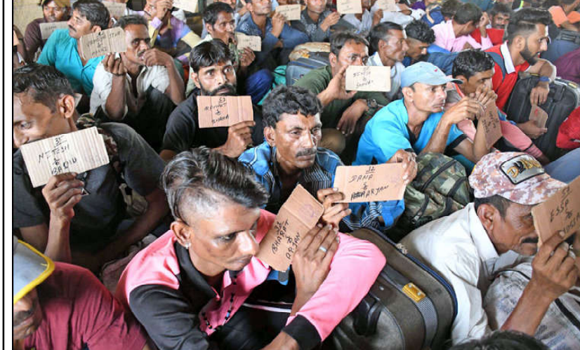
KARACHI: Released Indian fishermen arrive at a railway station to leave for their homeland, as Pakistani officials said they will release the first batch of 80 Indian prisoners detained for fishing illegally in the country's territorial waters in the Arabian sea.