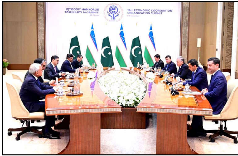
TASHKENT: Caretaker Prime Minister Anwaar-ul-Haq Kakar meets with the President of the Republic of Uzbekistan, Mr. Shavkat Mirziyoyev on the sidelines of 16th ECO Summit.

Ph: 2841470/2841473 Vol: XVIII No. 306, Rabi-us-Sani 24, 1445 AH Thursday November 09, 2023, Pages 08, Price Rs.15