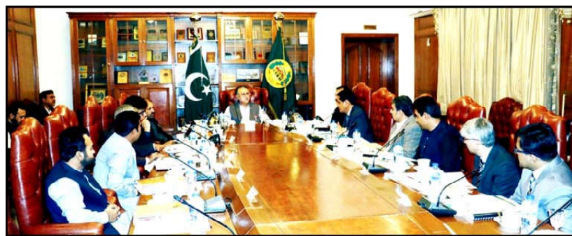
Governor Balochistan Malik Abdul Wali Khan Kakar chairing 3rd Senate meeting of Mir Chakar Khan Rind University Sibi

He expressed good wishes for Saudi King Salman bin Abdulaziz and Crown Prince Muhammad bin Salman.