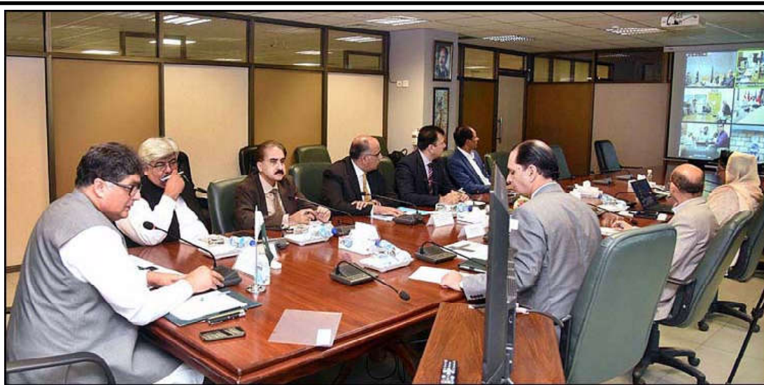
ISLAMABAD: Federal Minister for Privatisation, Fawad Hasan Fawad chairs a meeting of SIFC Working Group.

The secretary mentioned that trading in carbon markets was a tricky subject evolving every year, whereas the country had no such framework in place to deal with it.