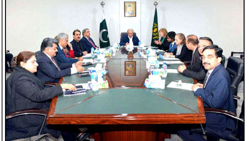
ISLAMABAD: US delegates meet Mr. Justice Syed Mansoor Shah at the Federal Judicial Academy.