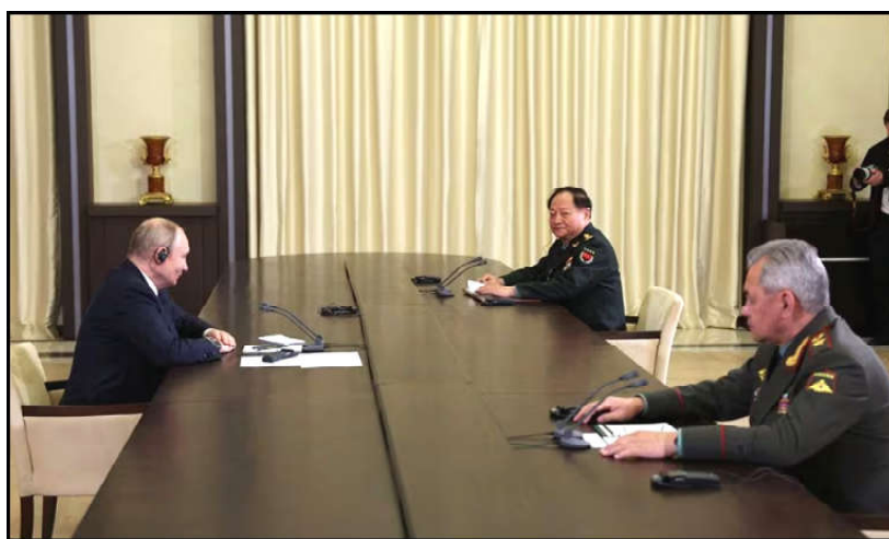
Russian President Vladimir Putin meets Defence Minister Sergei Shoigu and vice chairman of China's Central Military Commission General Zhang Youxia at the Novo-Ogaryovo state residence outside Moscow, Russia.

Biden argues that this century will be defined by an existential contest between democracies and autocracies. Putin, who heads the world's biggest nuclear power, said military cooperation between Moscow and Beijing was increasing and focused on high-tech areas that would ensure strategic security. "Of course, our cooperation, our contacts in the military and military-technical sphere are also becoming increasingly important, as for military-technical cooperation, here, of course, our work in high-tech spheres comes first," Putin said.