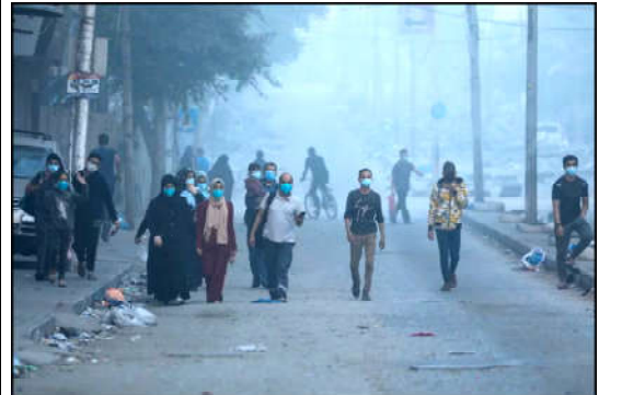
Palestinians flee their homes during Israel's ground offensive, on the edges of Beach refugee camp, in Gaza City.

camp, are the focus of Israel's campaign to crush Hamas, the militant group that has ruled Gaza for 16 years. The war, now in its second month, was triggered by the Oct. 7 Hamas attack on southern Israel. The number of Palestinians killed in the war passed 10,300, including more than 4,200 children, the Hamas-run Health Ministry in Gaza said Tuesday. In the occupied West Bank, more than 160 Palestinians have been killed in the violence and Israeli raids.