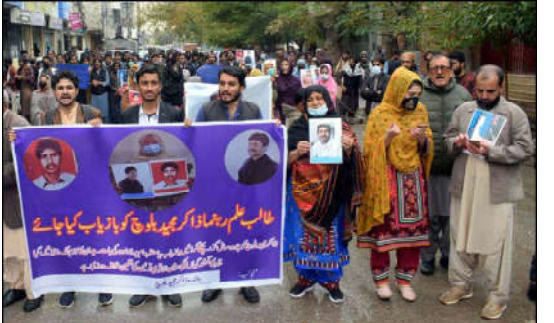
QUETTA: Members of Voice for Baloch Missing Persons are holding protest demonstration for recovery of their loved one, at Quetta press club.

He said that it is also the government's priority to resume work on the roads projects where it was closed due to any reason. Moreover, the buildings, which are completed, would be handed over to the concerned departments, he added. He on the occasion directed to establish a complaint cell in all districts where general public may lodge complaints. He also directed the superintending engineers of CW& department to visit the projects and ensure smooth work on them.