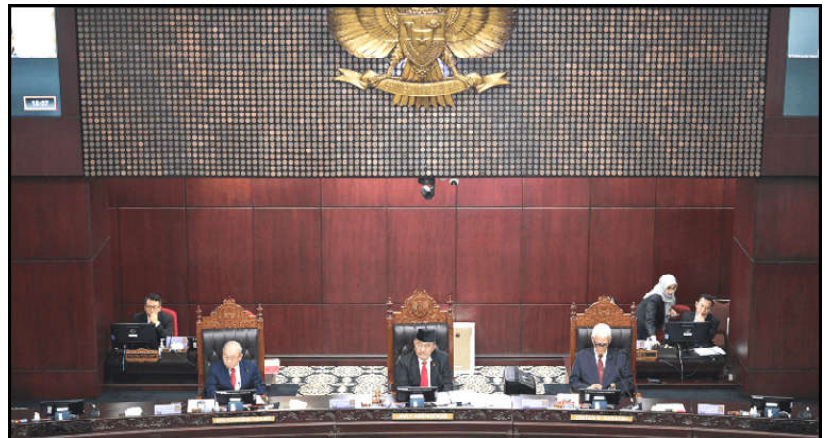
Honorary panel members of the Constitutional Court Jimly Asshiddiqie (C), Wahiduddin Adams (L), and Bintan Saragih (R) preside over a proceeding at the Constitutional Court in Jakarta.

MOSCOW: Russian Foreign Minister Sergei Lavrov accused the West on Wednesday of provoking crises on the global oil and gas market by rushing to switch to green energy and imposing pressure on other countries to do the same. "In fact, the reasons for the negative phenomena in the energy sector were the irresponsible actions of the collective West, when it decided to force... the green transition for itself and impose the same green transition.