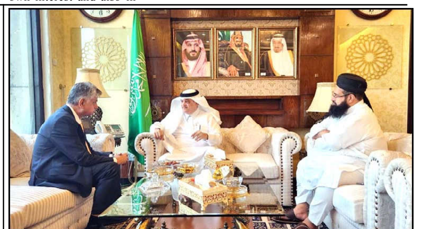
ISLAMABAD: Caretaker Federal Minister for Information and Broadcasting Murtaza Solangi in a meeting with Ambassador of Saudi Arabia to Pakistan Nawaf Saeed Al Malki

Prime Minister Kakar and President Mirziyoyev discussed on the ongoing humanitarian situation in Gaza and other regional and global developments.