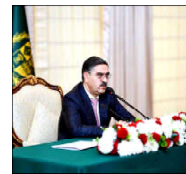
The monitoring team of the United Nations in its report released this July clearly highlighted that TTP centres based in Afghanistan were conducting terrorist operations against Pakistan.

He mentioned that 15 Afghan nationals were found involved in suicide bombings in Pakistan, while 64 Afghans got killed during their fight against the Pakistani law enforcement agencies. He said Afghan authorities were cognizant of these facts as Pakistan had been sharing these details with them since February this year through the fortnightly memorandums of protest.