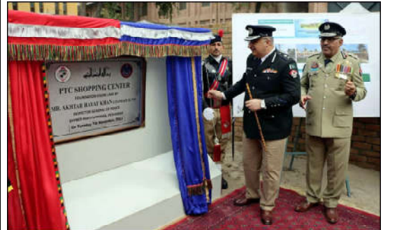
HANGU: Inspector General of Police Khyber Pakhtunkhwa Akhtar Hayat Khan laying the foundation stone of the shopping center built for women police at Gandapur Police Training College Hangu.

scheme for approval so that to not only ensure the long-term preservation of records available in the research cell, rather make the availability of these historical materials and literature possible for researchers through online facilitation. He expressed these views during a visit to the historical Tribal Research Cell, established under the Home and Tribal Affairs Department in Namak Mandi here. During the visit, the minister inspected various parts of the research cell and checked the historical records and official files of the pre-independence and post-independence periods related to the affairs of tribal areas.