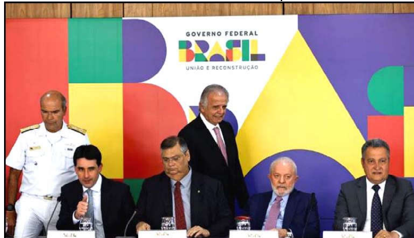
Brazil's president Luiz Inacio Lula da Silva looks on during a press conference at the Planalto Palace in Brasilia, Brazil.

Monitoring Desk WASHINGTON: The United States is troubled by reports of an imminent attack on El Fasher, North Darfur, and is calling on the warring parties in Sudan to immediately cease further attacks, US Secretary of State Antony Blinken said on Thursday. "The United States calls on the warring parties to immediately cease further attacks.