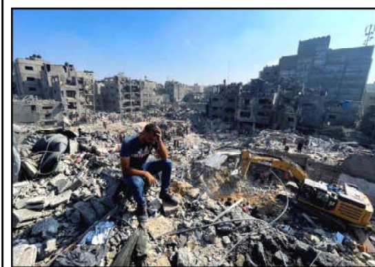
A man reacts as Palestinians search for casualties a day after Israeli strikes on houses in Jabalia refugee camp in the northern Gaza Strip.

the region's countries," Fidan said. The Iranian foreign minister "shared with us that there are strong indications that other armed elements in the region may intervene in the conflict if conditions do not change", Fidan said. "A ceasefire and peace have become more essential," Amir-Abdollahian said a peace conference involving "Muslim and Arab" countries should be held "as soon as possible". Iran's supreme leader Ayatollah Ali Khamenei urged Muslim countries to halt trade with Israel, including oil exports, in response to its bombardment of Gaza.