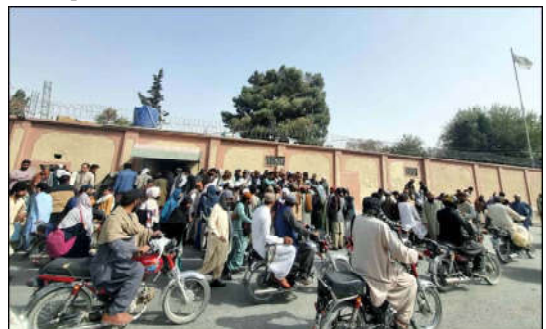
QUETTA: Afghan families gather at Afghan Consulate to register themselves for returning to their homeland, in Quetta.

He also directed them to maintain the environment of trust between police and public.