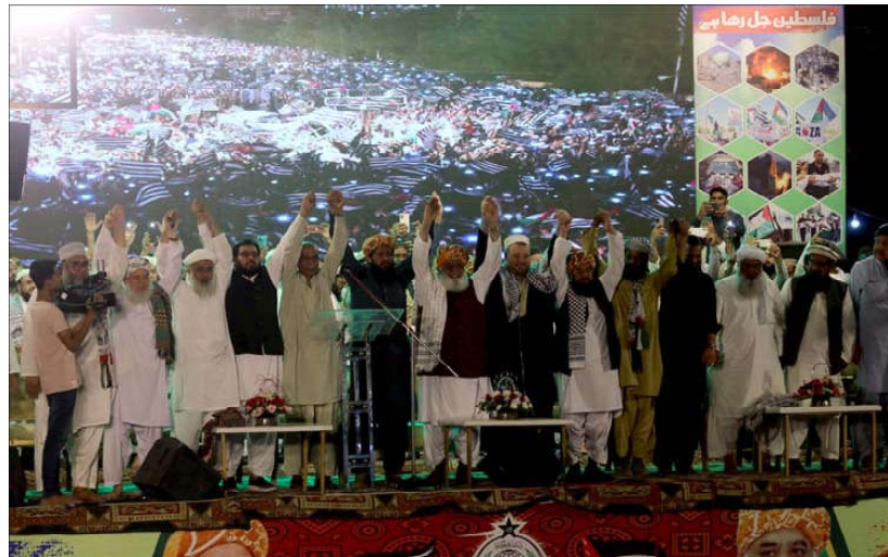
KARACHI: Jamiat Ulema-e-Islam (JUI-F) Chief, Maulana Fazal-ur-Rehman along with others leaders joints hand with each other to express solidarity on stage during the Al-Aqsa Palestine Conference against Israeli cruel and inhumane acts and express unity with the innocent people of Palestine, held at Shahrah-e-Quaideen road in Karachi