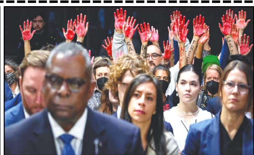
WASHINGTON: US Secretary of Defence Lloyd Austin testifies as protesters calling for a ceasefire in Gaza raise their hands, painted in red, during a Senate Appropriations Committee hearing with Secretary of State Antony Blinken and Austin.

The protesters also said they attended the hearing to denounce the Biden administration's support for "genocide" against Palestinians in Gaza. Secretary Blinken did not respond to the protesters, but when he was asked later about the possibility of a ceasefire, he said that would only help Hamas regroup. A pause, however, for humanitarian reasons can be considered, he added. Also on Tuesday, a prominent Jewish intellectual and New York Times columnist Thomas Friedman wrote in his column, "Israel, it's time to consider a ceasefire".