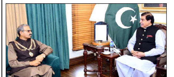
ISLAMABAD: Speaker National Assembly Raja Pervaiz Ashraf in a meeting with Mayor of the London Borough of Hounslow Councilor Afzal Kiyani.

should focus on IT instead of wasting time on useless activities. The Prime Minister said that idleness fosters anxiety and chaos in society. The PM said that he had issued special instructions to the minister for IT to use all available resources to attract the educated youth towards IT and skill development. He said that there was a dire need to focus on agriculture and livestock. He said that his government would use all its resources on public welfare projects. He said that the government was going to launch a great welfare project worth 5 billion rupees for widows, orphans, disabled and divorced women.