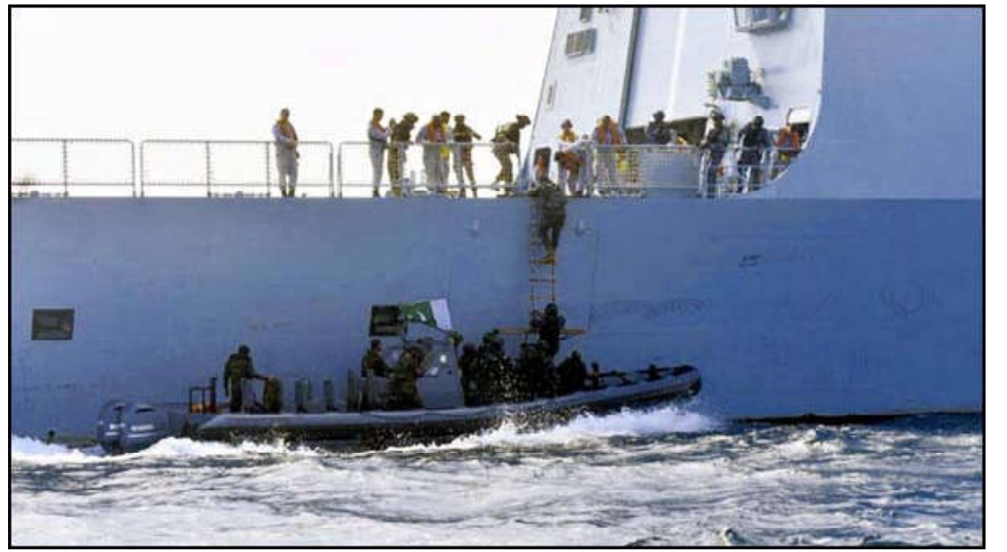
KARACHI: Pakistan Navy Special Service Group and Qatari Naval Special Forces demonstrating Counter Piracy Operation during Joint Naval Exercise MUHARIB AL-BAHR VI, held in Karachi.

The Israeli military announced the death of another soldier in Gaza fighting, bringing to 17 the number killed since ground operations were expanded on Friday.