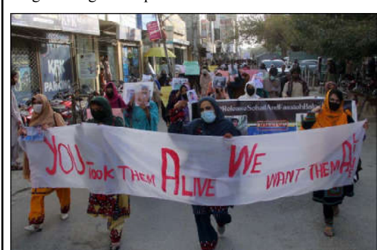
QUETTA: Members of Baloch Yakjethi Committee are holding protest rally for recovery of missing persons as soon as possible, at Quetta press club.