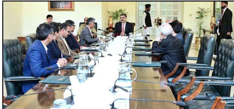
ISLAMABAD: A delegation of the Pakistan Broadcasters' Association called on caretaker Prime Minister Anwaar-ul-Haq Kakar.

PM Kakar said that through effective and coordinated communication between the government and the media, the public could stay informed about government policies and initiatives.